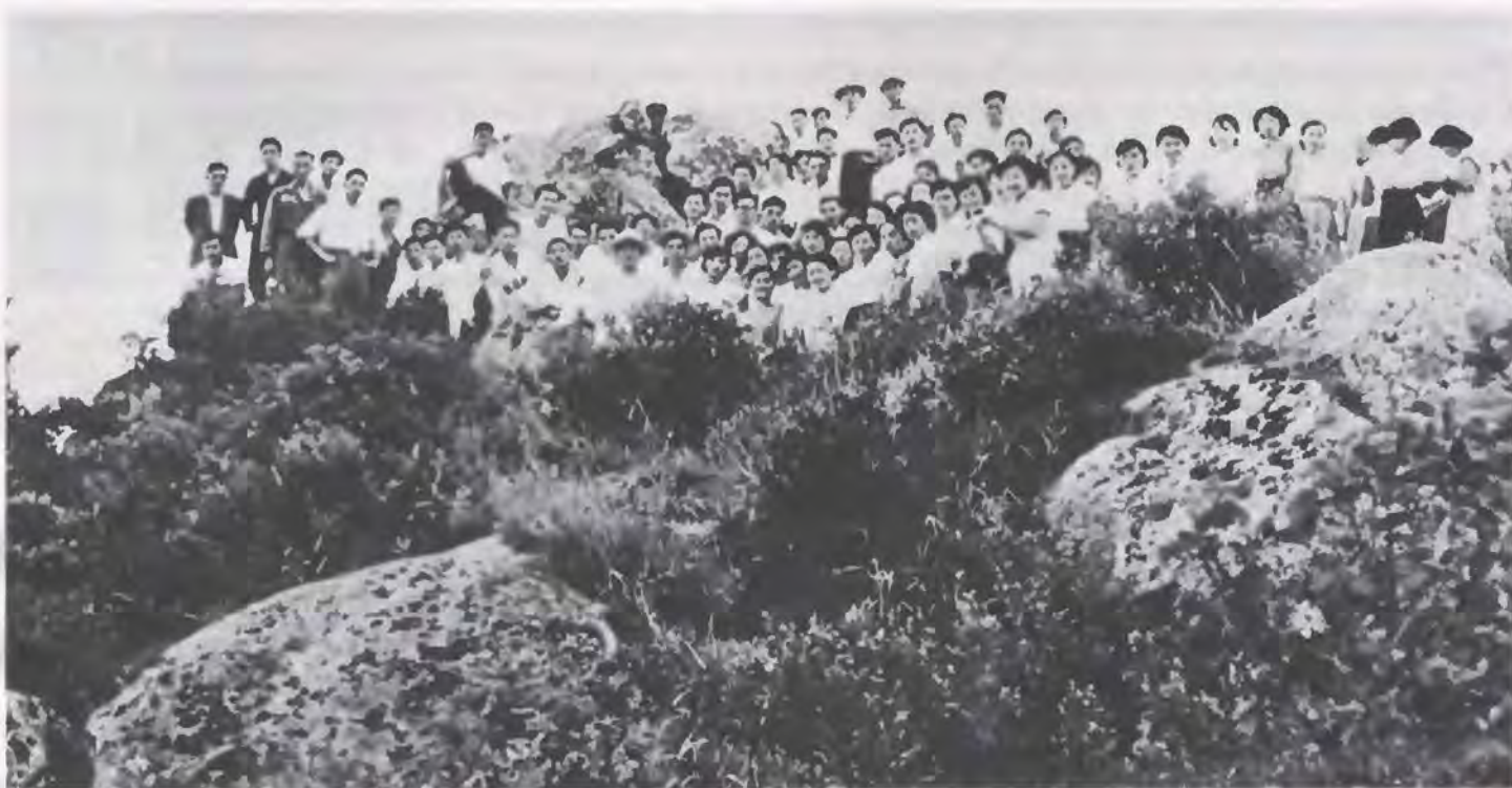
Members from Seoul Church gather with Father at Holy Ground, 1961.

education for children. In Pyongyang, the spiritualists would strike evil, in order to make people change. This was a kind of servant-level. But in Seoul, Father would give people truth, and expect them to recognize it and on their own practice it; therefore, he controlled the spiritual phenomena.