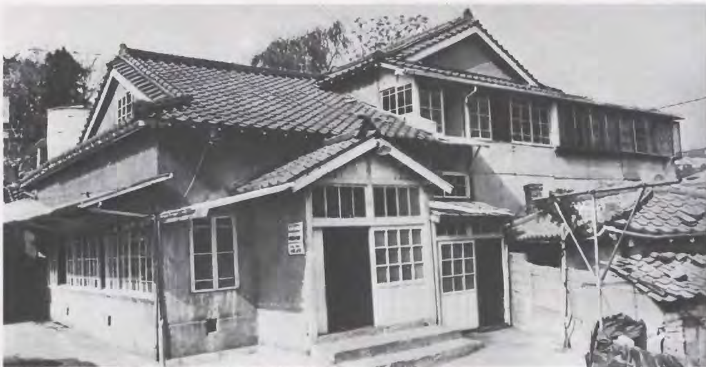
Old Chungpa Dong church, formerly a Japanese temple, with its clay tile roof.