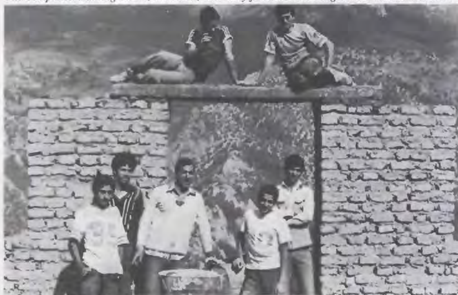
The first wall of the training center is completed.

olutionary guards would come some day, but I couldn't have guessed that they would come in the middle of that same night.