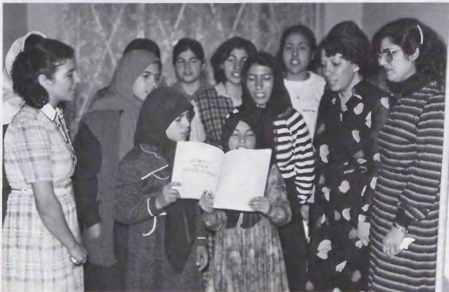
The sisters singing a Holy Song together, some of them wearing the traditional head coverings of Muslem women.