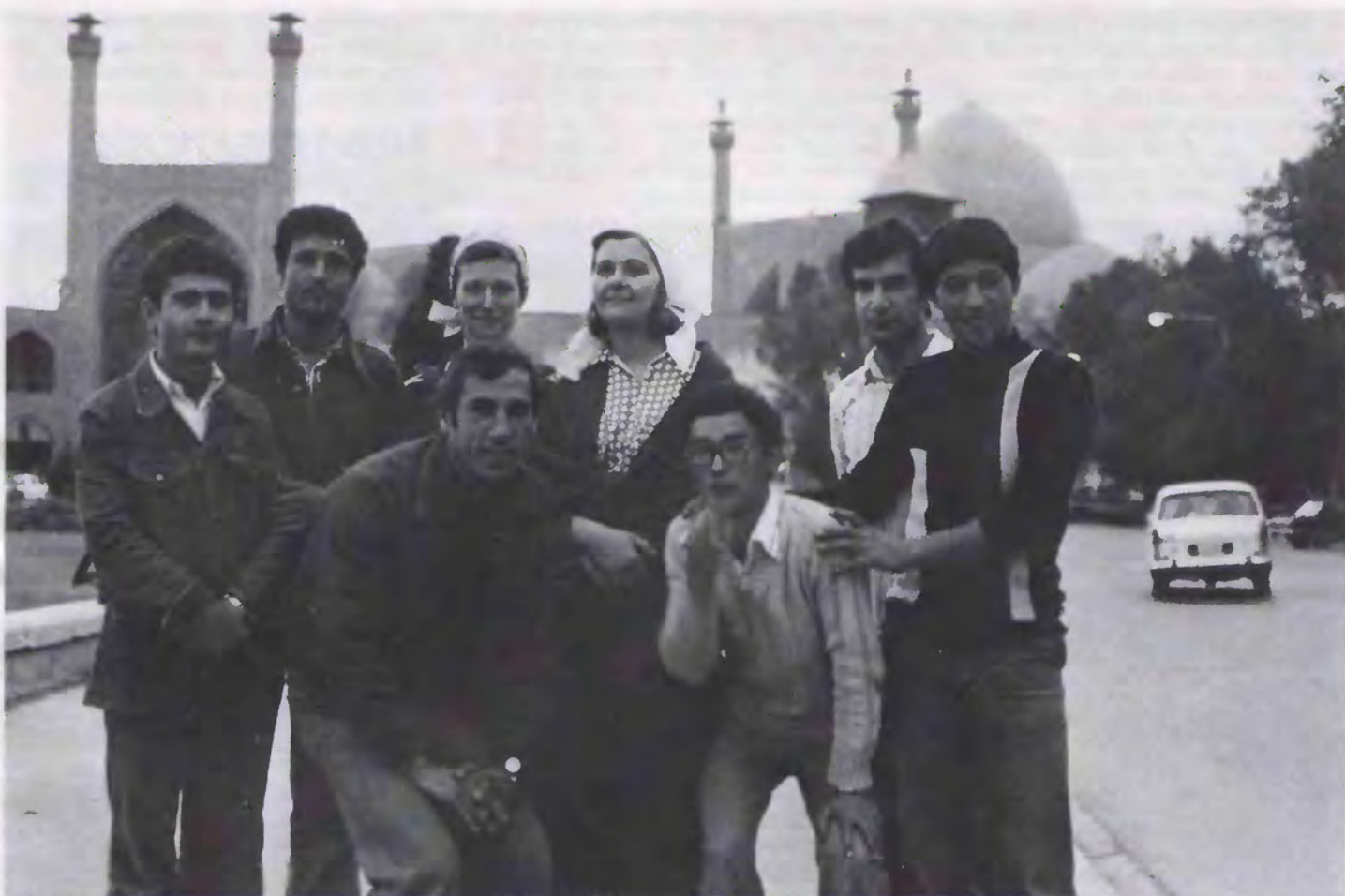
The Japanese, German and American missionaries with Iranian brothers on the 21-city prayer tour.