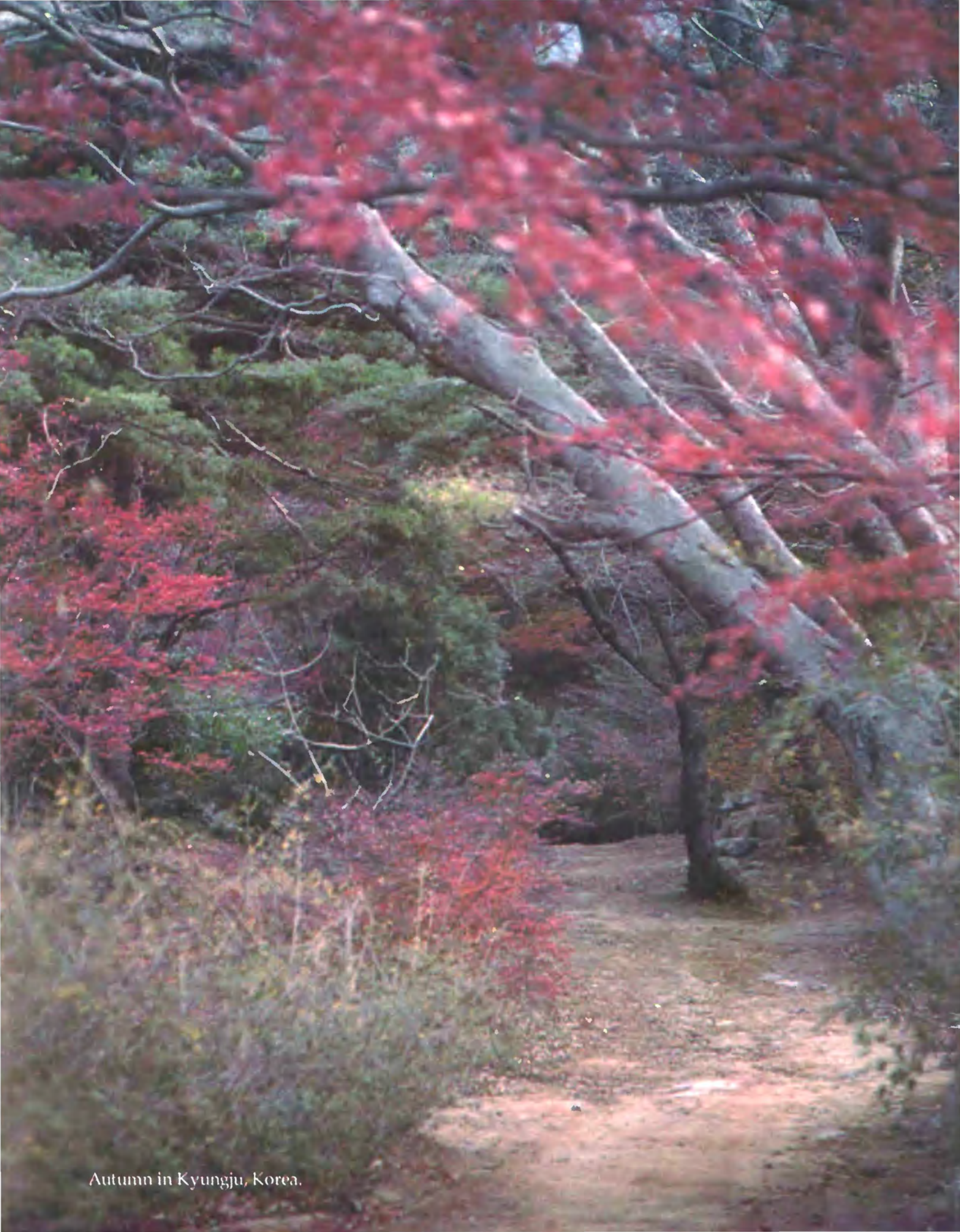
Autumn in Kyungju, Korea.