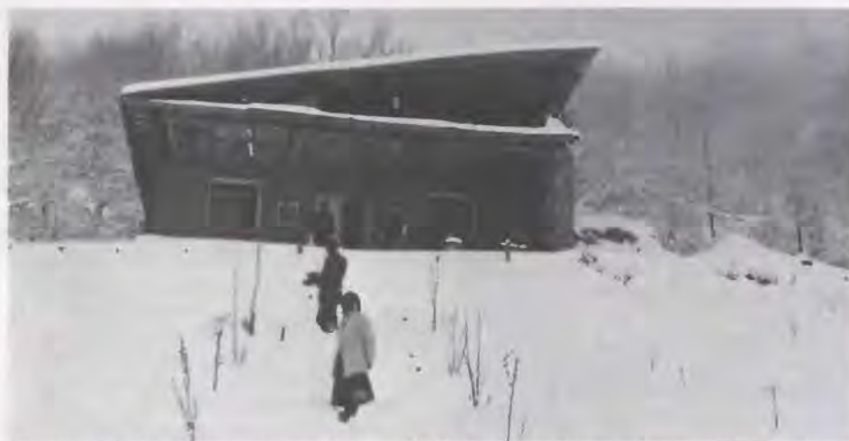
The completed training center, members, and baby fruit trees braving the mountains in winter.

Our center was quiet. Only my two sisters and another brother and I were there. The fundraising team was gone and some other members were working on the farm. I knew that the rev-