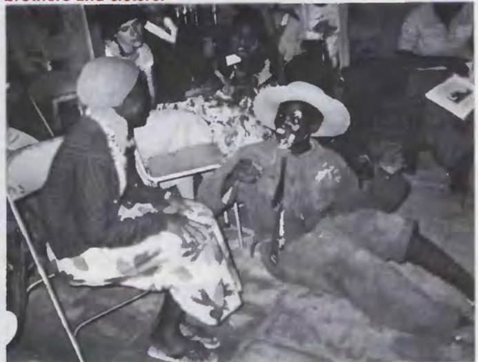
Skits and folk-tales are a long-time African tradition. Zambian members portray their talent.