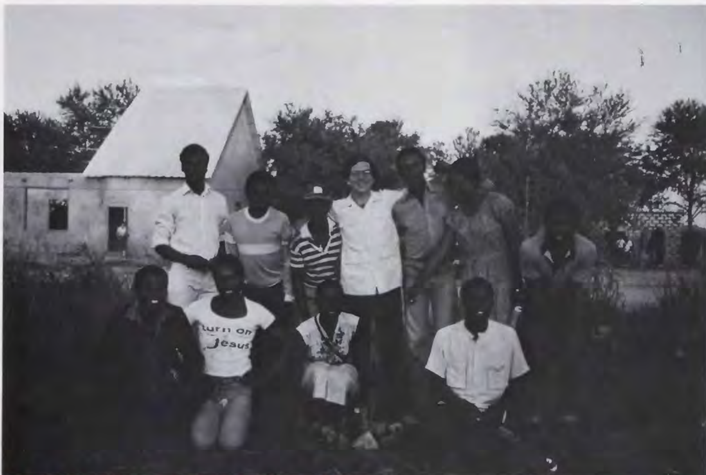
At the end of the training, each member planted a memorial tree.

GREAT HOPE...PROFOUND NEED/AN EXPERIENCE OF