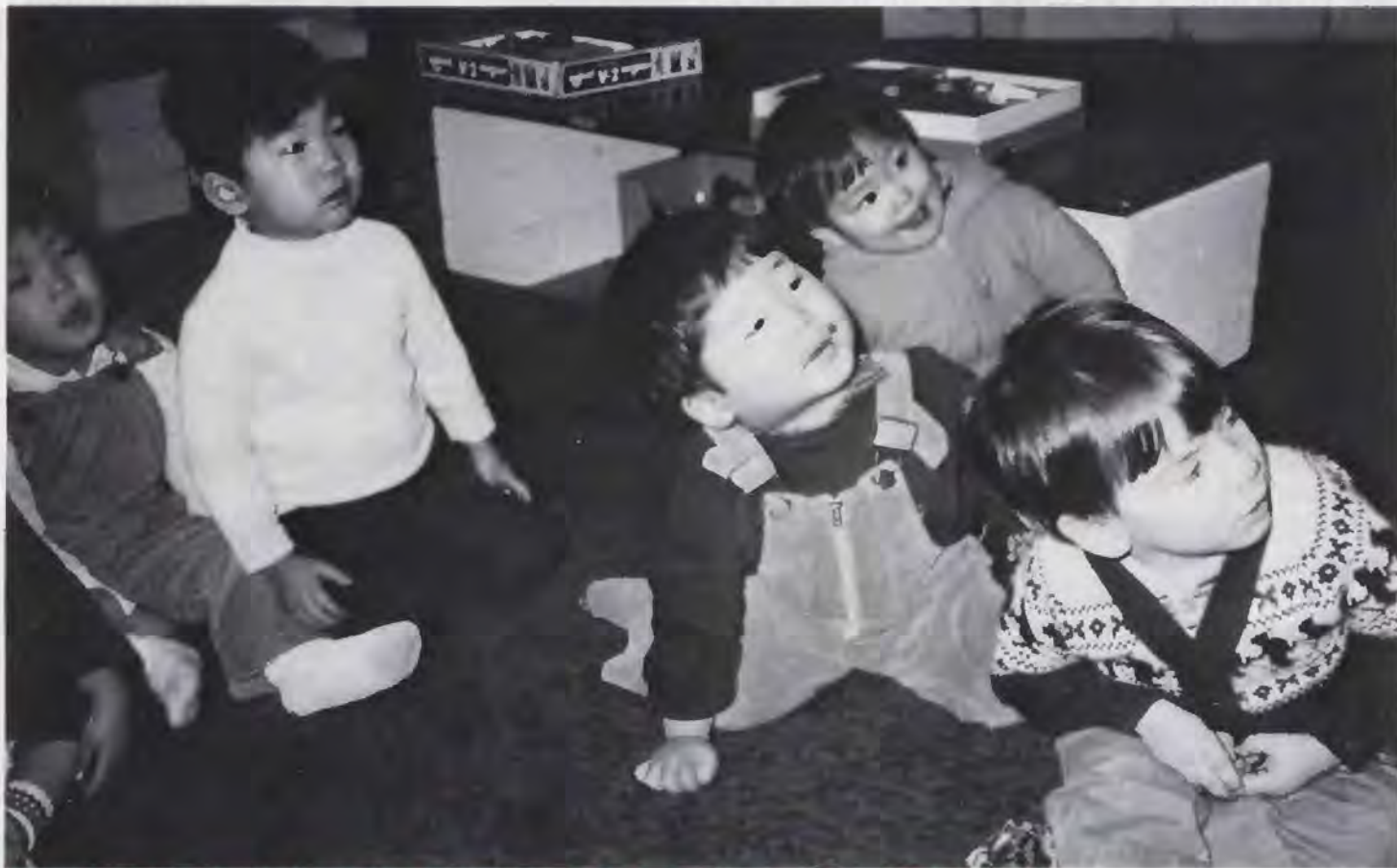
Blessed children attentively watching their teacher in the "art, science and practical life room."

In our nursery and kindergarten the main emphasis in education is on human relationships. If you do not have good relationships with others, neither will you have a good