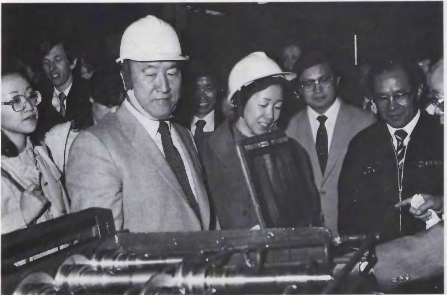
Father and Mother visiting our machine factory.