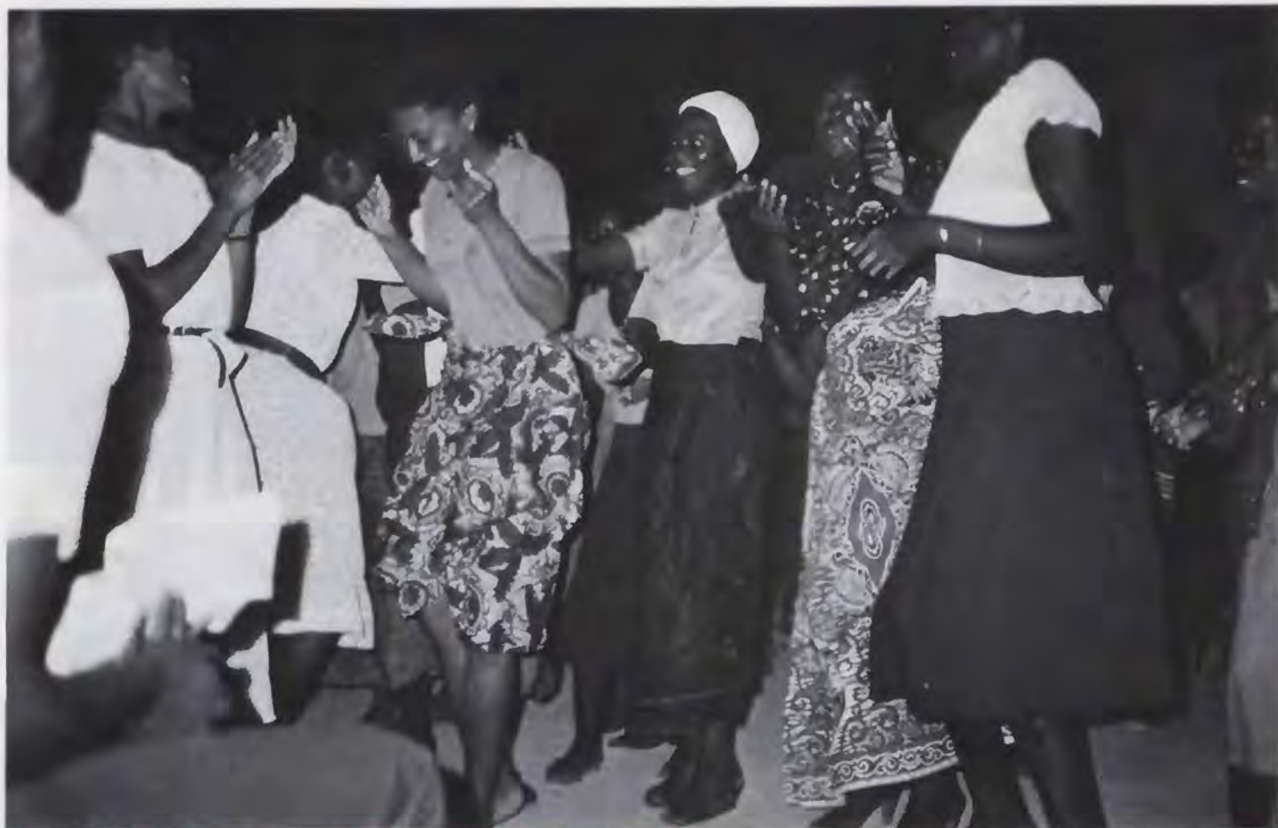
Zambian sisters showing a special dance at the farewell celebration.