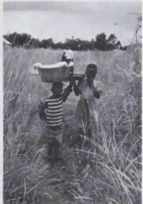
During the training, we received many curious local visitors.