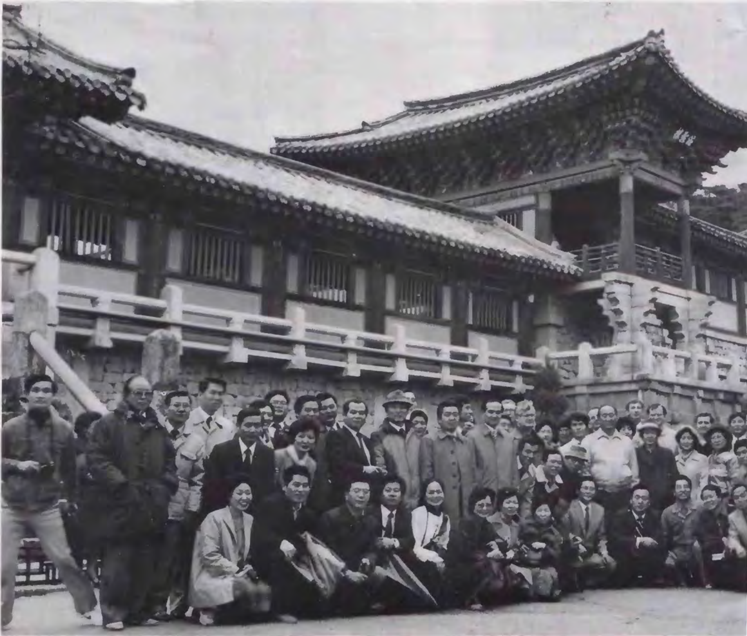
True Parents surrounded by 90 leaders from Europe, Japan and Korea.

REV. SUN MYUNG MOON SEOUL, KOREA EXCERPTS FROM APRIL 4, 1983 SPEECH