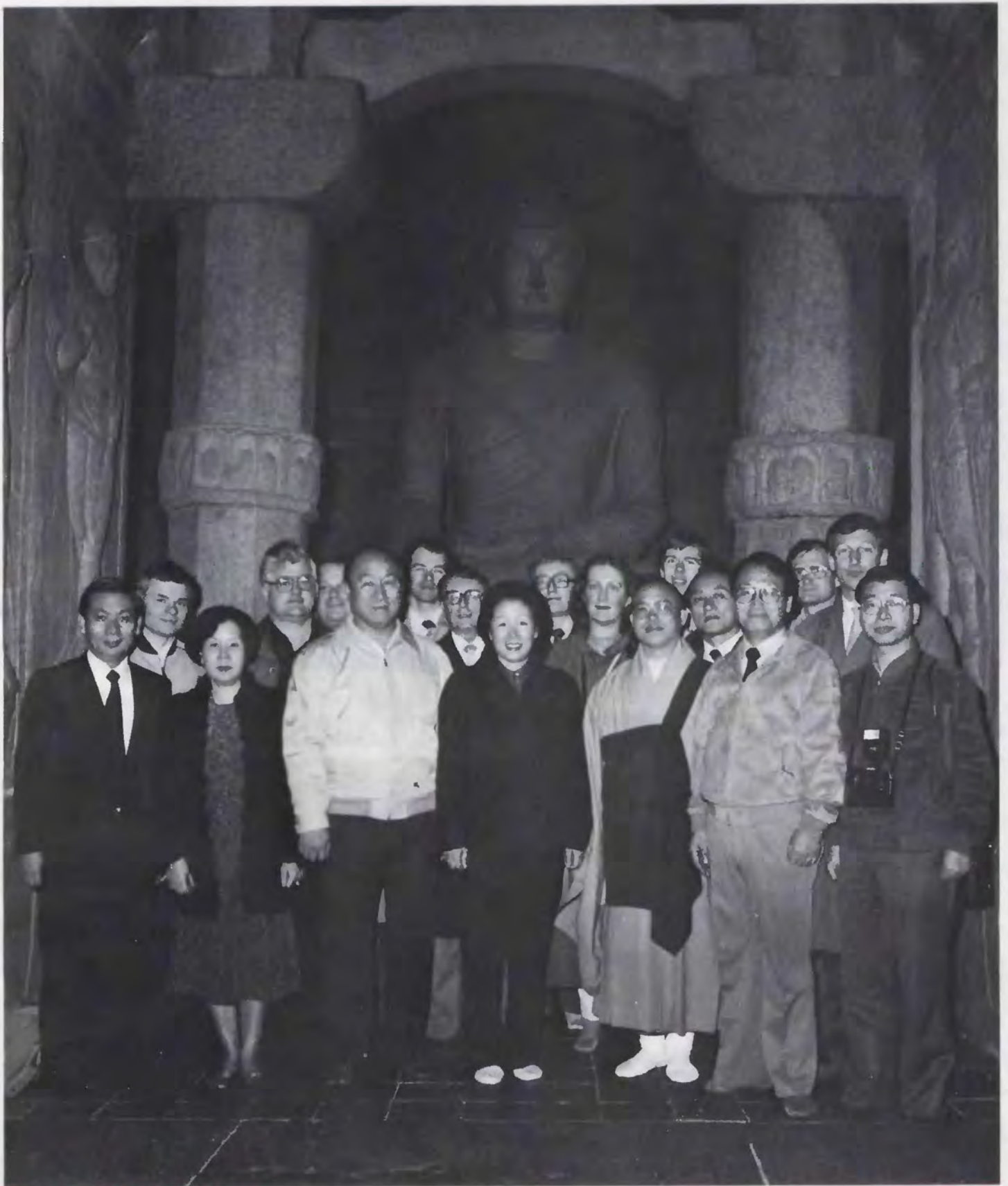
Special guests In front of Buddha...

other countries. On one hand, it is good for many members from around the world to come to us, but on the other hand, it is a cause for shame that we need support from others. So we need to make a strong determination to stand on the front line and set an example for the international members.