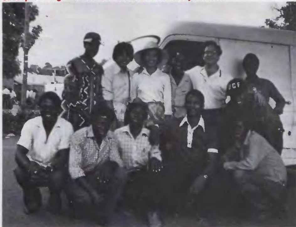
Members pose during fundraising.