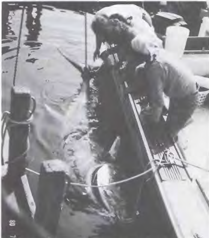
Sisters attach a winch chain to their tuna's tail prior to the fish being hoisted onto the deck.

So I thought, "After many long years, I met the True American!"