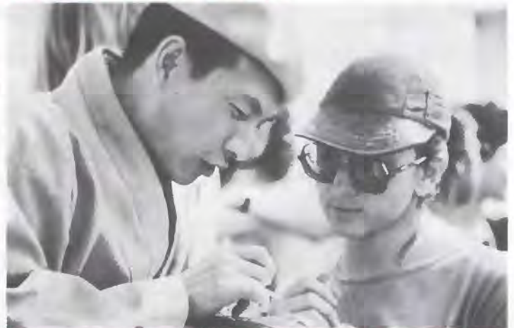
Korean Buddhist monk (l) and Turkish Buddhist (r) participant.