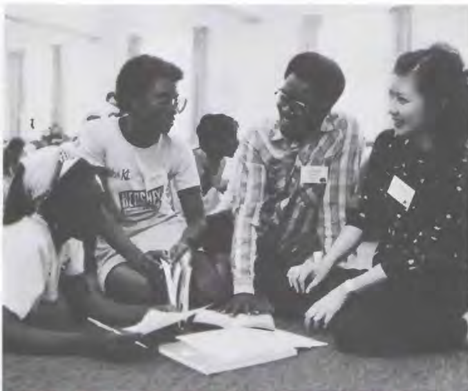
Discussion after the lecture. (From left to right) Nigeria, Nigeria, America and Thailand.

applying for this summer — and surely I was not the only one. I feared that this seminar could promote some kind of religious syncretism. Fortunately that has not been the case! I have deeply appreciated meeting strong and wonderful and at the same time open-minded believers who, however, don't think they have to sacrifice their own faith for the sake of unity. And I think