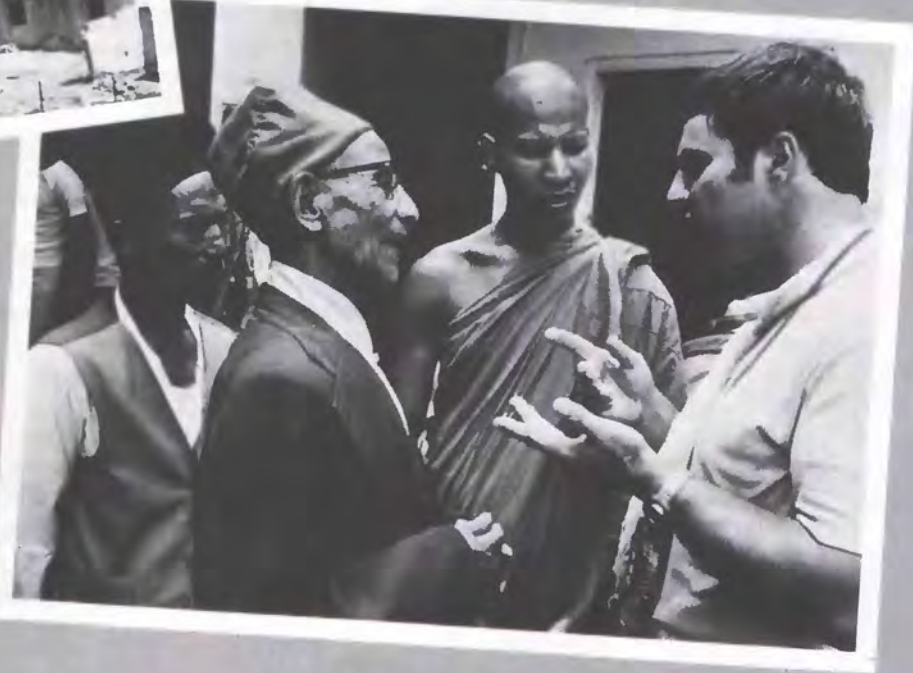
Hindu-Buddhist-Christian dialogue in Kathmandu, Nepal.