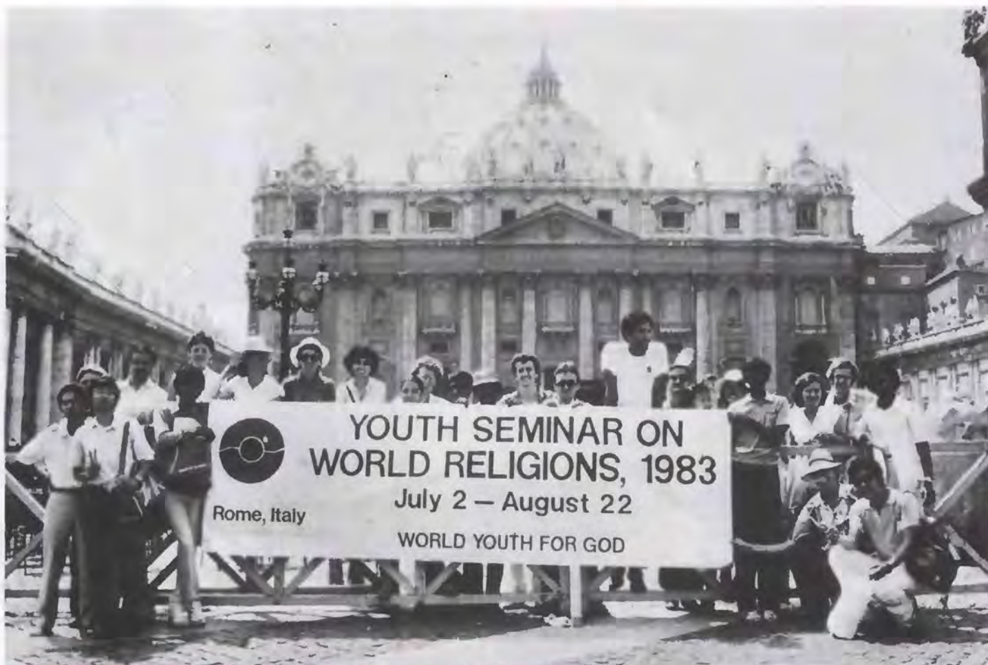
Group shot following the Papal audience in front of St. Peter's Cathedral.

into the future but our hearts often keep us mired in the past.