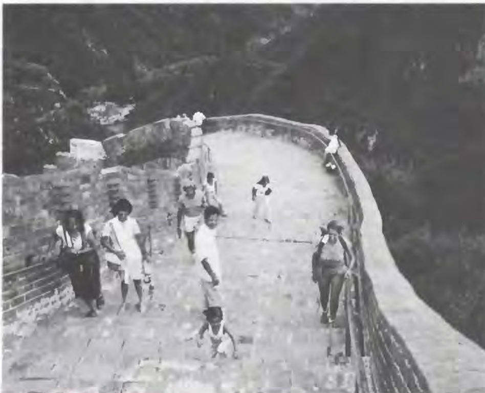
Mounting the Great Wall of China.