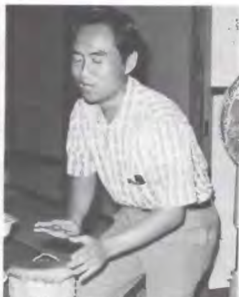
Practicing African drumming style at a Japanese Missionary Center.

I began to study the Bible, and I realized that my situation was similar to that of Abraham. When God called Abraham to leave his home in Ur of Chaldea, he obeyed without even knowing where he was going. He had such strong faith, yet later he failed in