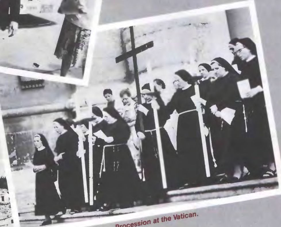
Procession at the Vatican.