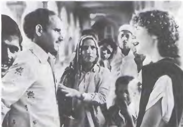
Moslem-Christian dialogue in Turkey.

could envision a world in the future in which the sincere love, dedication, and consecration of individuals to God is the basis of unity in diversity.