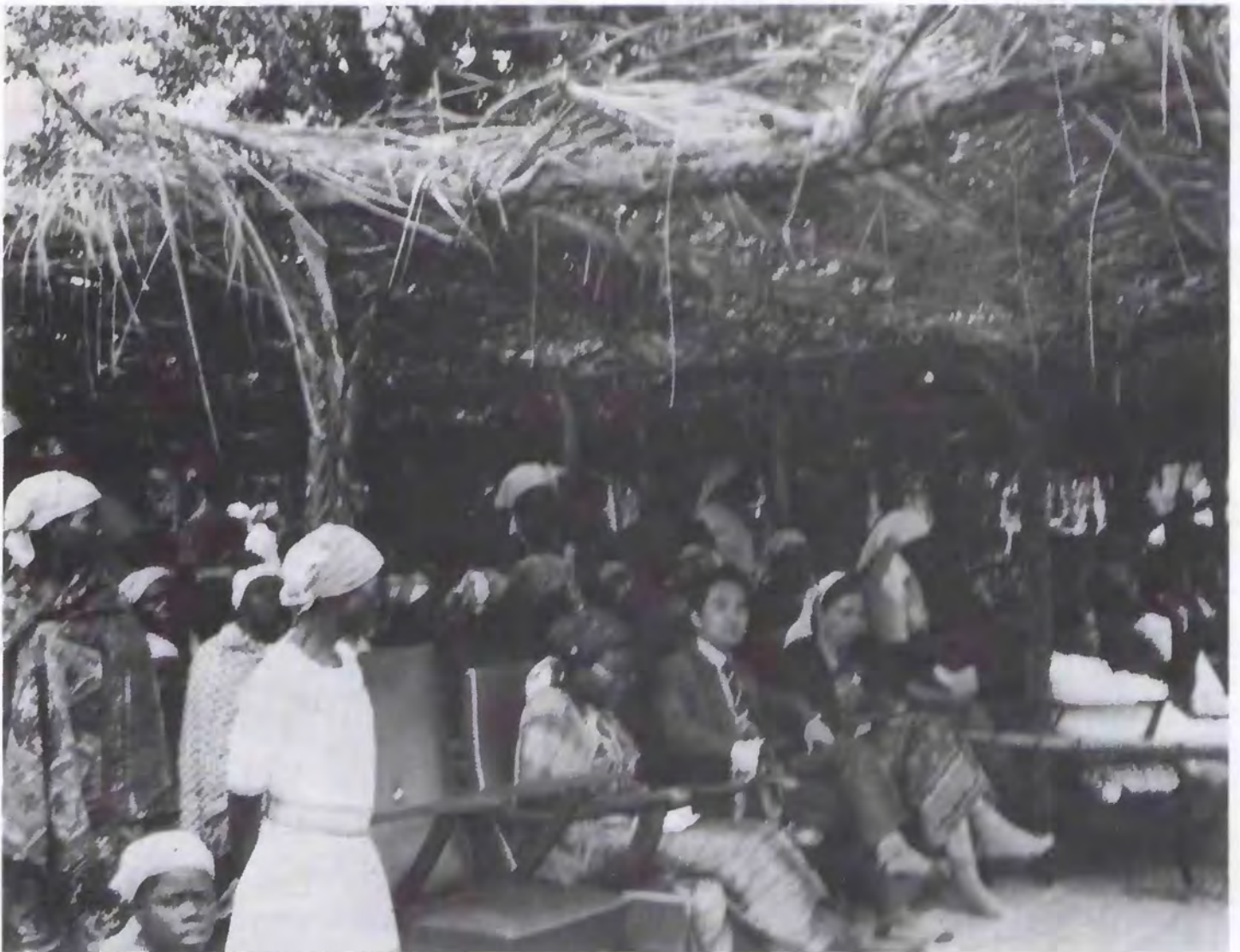
Invited to a big celebration in Zaire Church.