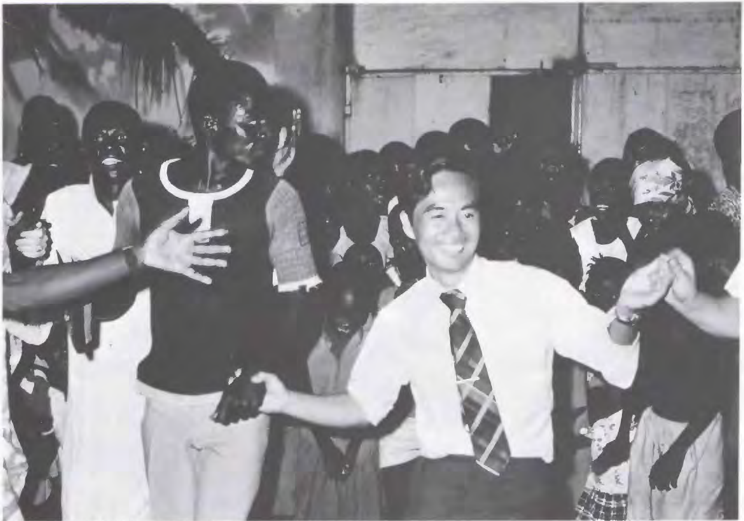
"Black" and "Yellow" dancing together.