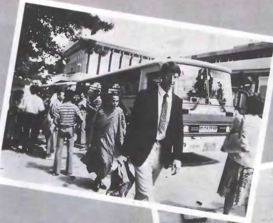
Arriving at the Little Angels School, Korea.