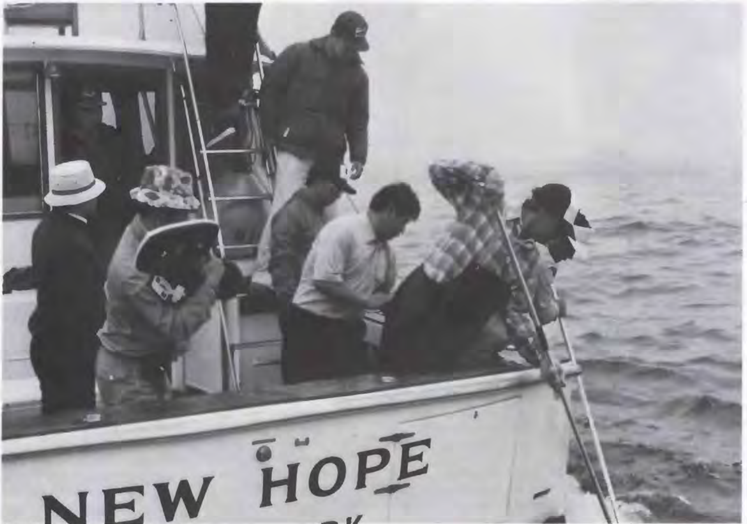
New Hope crew, fighting a tuna.

A nation is declining not because there are no strong people, but because there are so many hopeless or weak people.