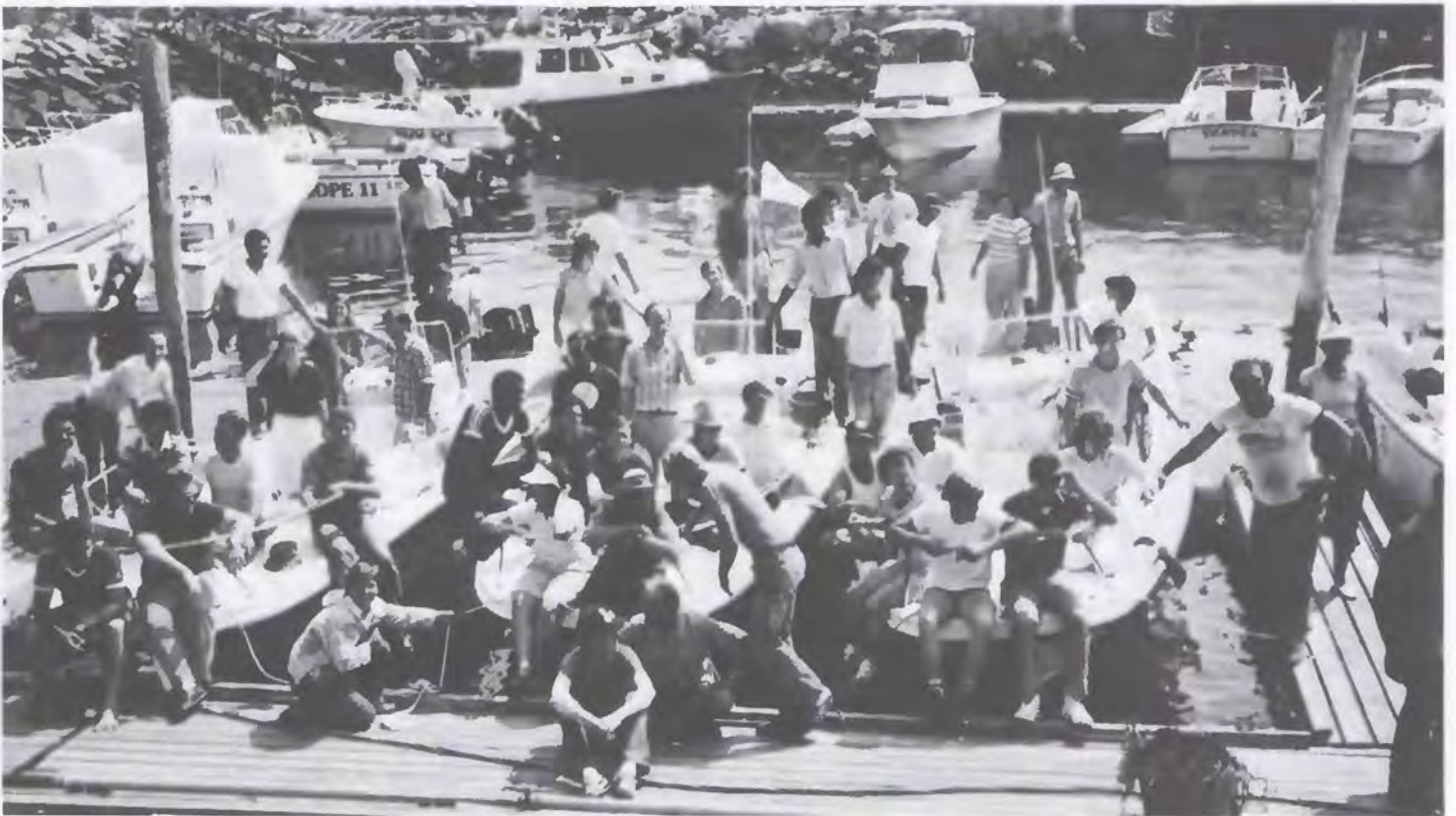
Ocean Challenge 1983 at the marina in Gloucester Harbor.