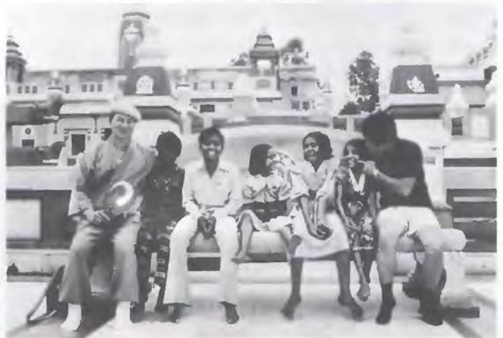
Participants in front of Birla Temple.