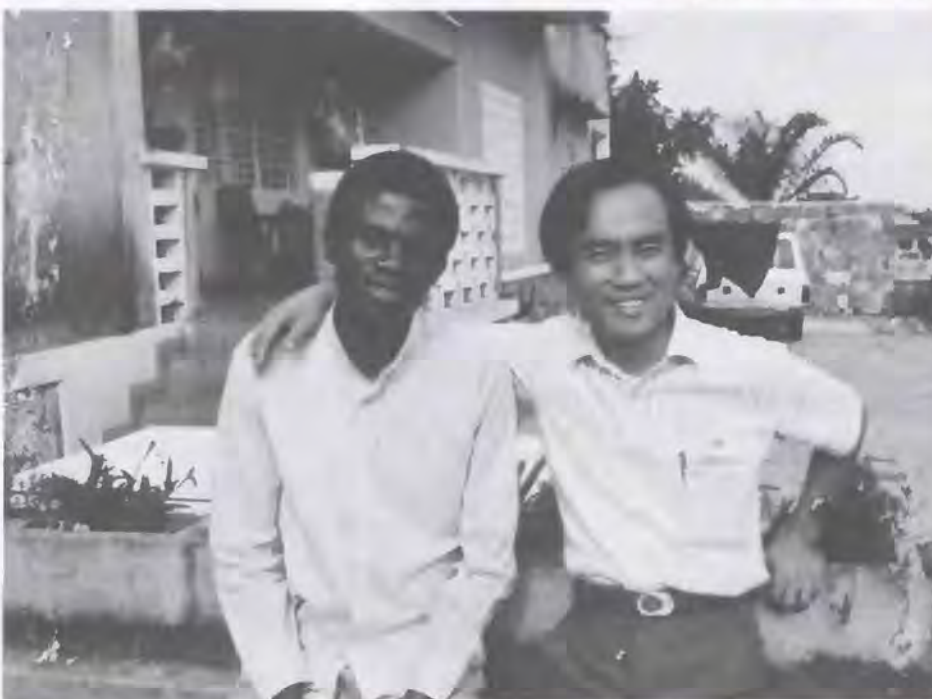
With a Zairian brother.

The police station was filthy. A policeman spoke many words to me in French, but at that time I understood almost nothing! Finally he remembered some schoolboy English and shouted, "You-have-to-leave!" He warned me that, if I tried to come back, I would be sent to a terrible