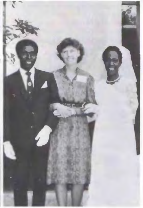
Members in Zaire.