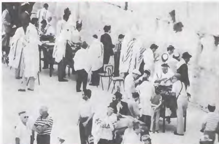
Western Wall (known as Wailing Wall) in Jerusalem.