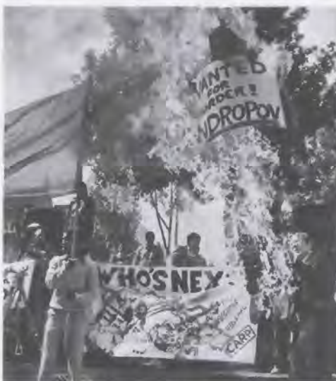
Burning the effigy of Yuri Andropov at the University of Wisconsin.