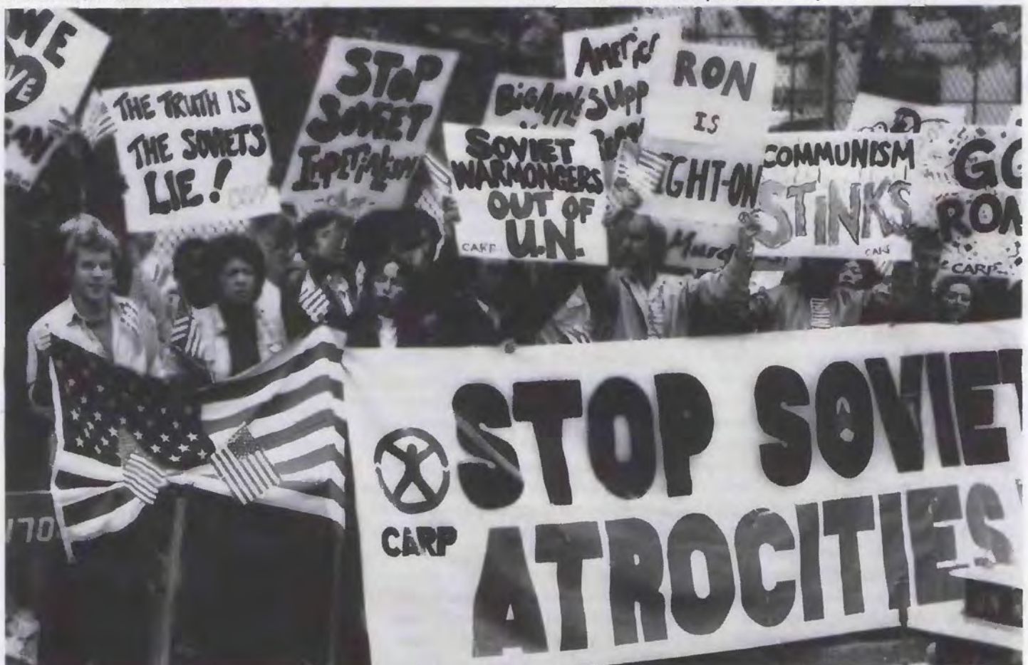
Second UN rally on September 26.