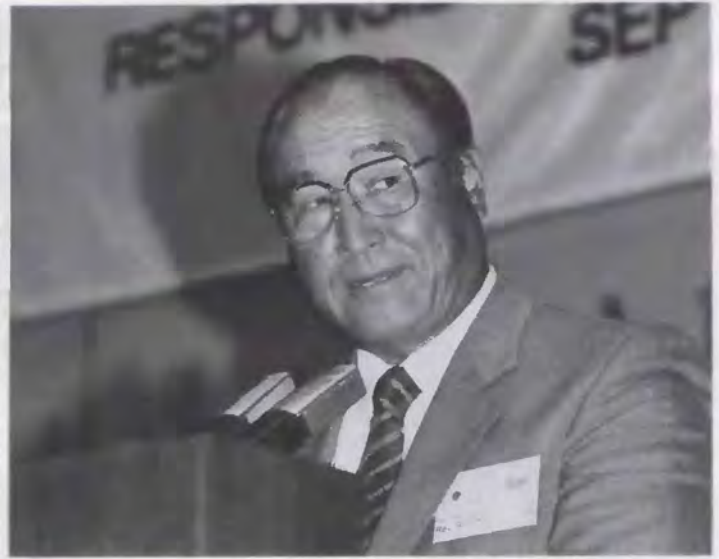
Father presents the Founder's Address at the Sixth World Media Conference.