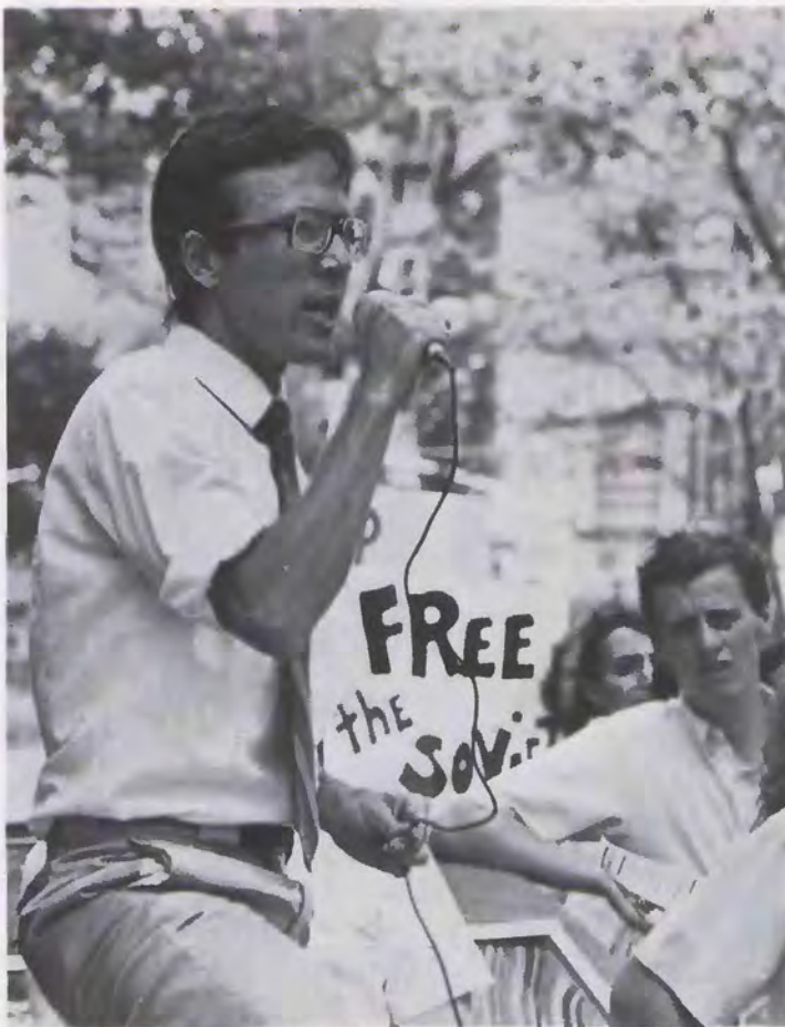
At New York Soviet Mission to the UN.