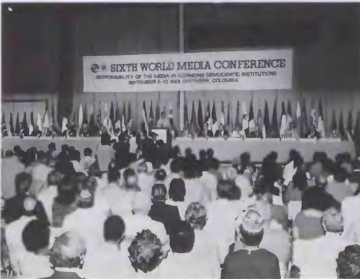
The conference was attended by 525 participants from 92 countries.