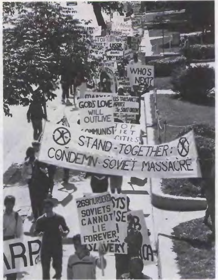
March at Madison Campus, University of Wisconsin.