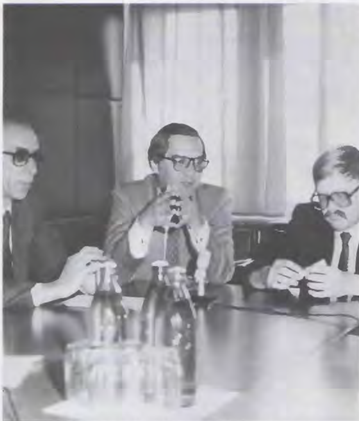
Three gentlemen from Novosti News Agency make things perfectly clear.

Almost the whole congregation was in tears from the beginning to the end of the service, including the many young people present.