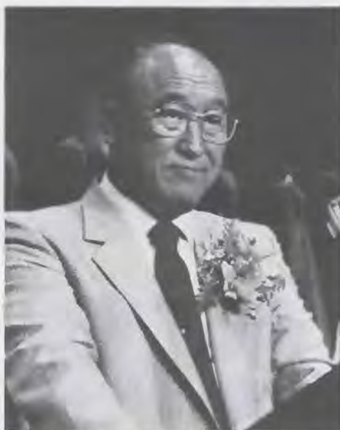
Father presents his farewell remarks at the final night's banquet.

The main ingredient of a conference are the invited guests. We hosted 525 publishers, editors, columnists,