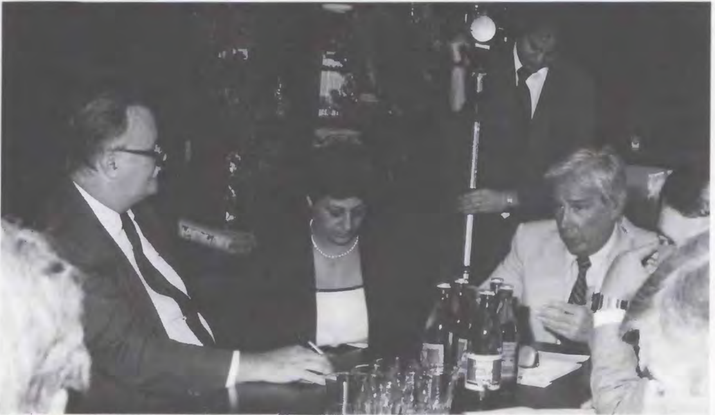
The Vice President of Pravda newspaper carefully explains how all hostilities since the Korean War, including the Korean War, were provoked by the American CIA.

One gets the impression that the Russian people are also accustomed to disbelieving nearly everything they hear from the Kremlin.