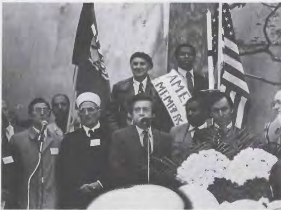
October 19, KAL Memorial with representatives of dissident groups and N.Y. Gov. Cuomo.

The left gained support in the sixties. Victory over communism must gain that support in the eighties; it is humanity's last chance.