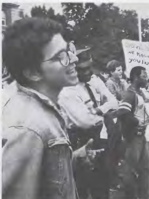
Debate after demonstration at Columbia University.

simply are exercising our right, if not duty, as an association of citizens of the United States, to speak out and affect the political process. That's the value and essence of democracy. The key point which separates us from a strictly political organization is that we are not partisan; we don't campaign for candidates nor do we lobby. We are not involved with party politics. We've supported and will continue to support any president and party which agrees with our viewpoint — a viewpoint based, as I said before, upon religion,