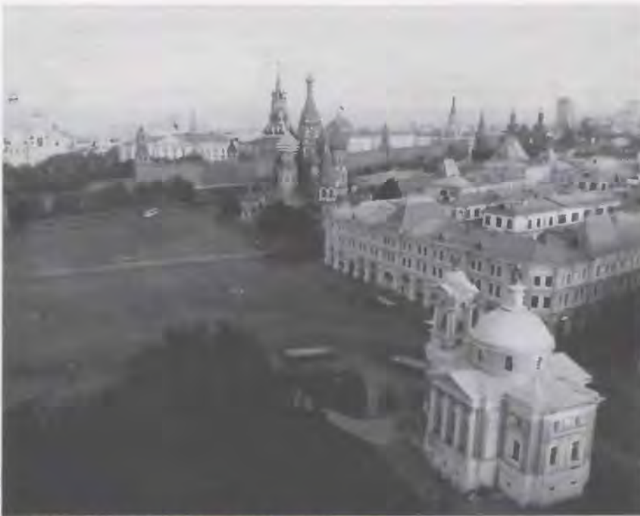
Even the Kremlin looks beautiful at sunrise.