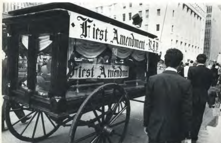
The First Amendment in a mock casket is drawn through the streets of New York City in a carriage.