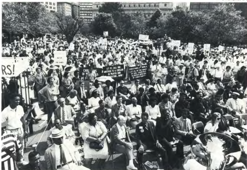
Thousands gather in Battery Park at the southern tip of Manhattan to listen to speakers on the religious liberty issue, August 28, 1984.