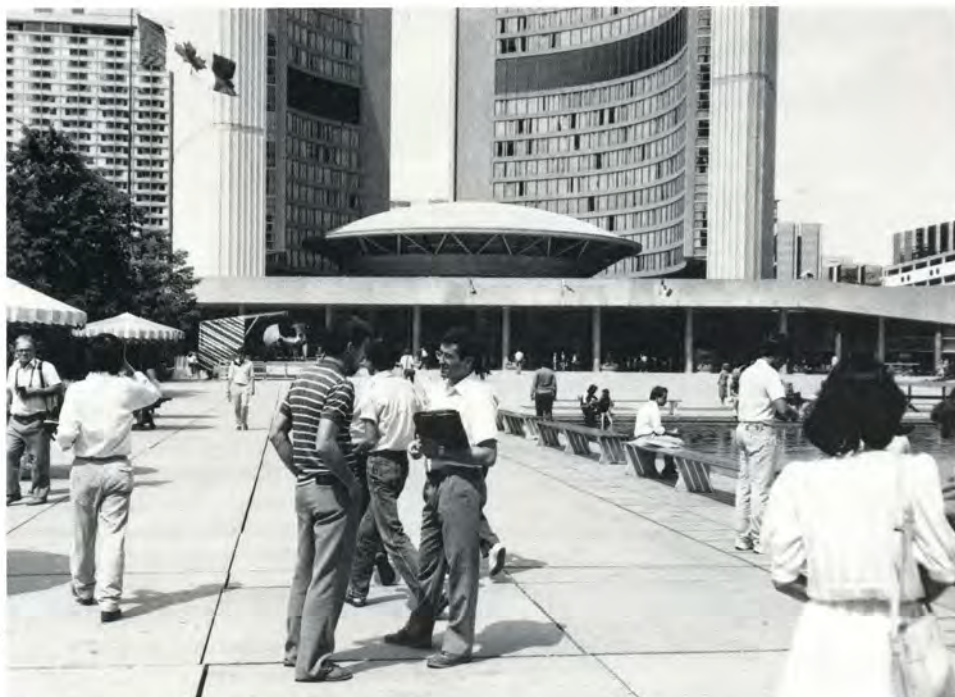
Street witnessing in Toronto.