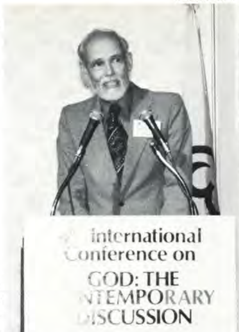
Dr. Huston Smith

Here our two projects become central for the religious freedom issue that I have used as my entree into what we are here for. Beginning with Rev. Moon's absence (on the particulars of which we may differ), I have moved through the principle of religious freedom (on which we presumably agree but which is not our direct concern), to what, I take it, does concern us directly; namely, the reality of God and the presence of that reality in the lives we live. (I must ask