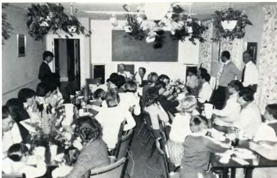
Evening report at the Toronto center.

Since we began this condition, spirit world has inspired many people to inquire on their own about our movement. Again, once they heard about Father's vision, many wanted to be asso-