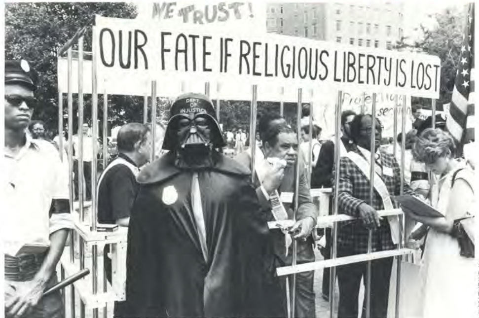
Washington, D.C., August 9, 1984. Ministers in a mock jail cell during the Washington Rally guarded by the "Department of Injustice."