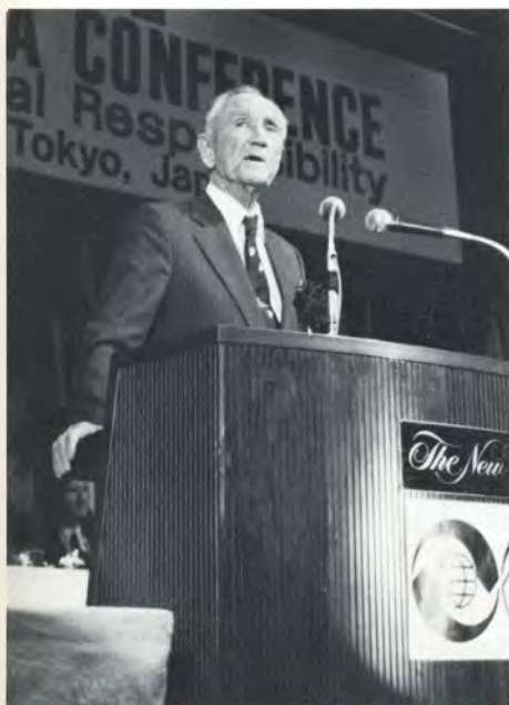
United States Ambassador to Japan Mike Mansfield, delivered a strong message about the value of the conference at the farewell banquet.