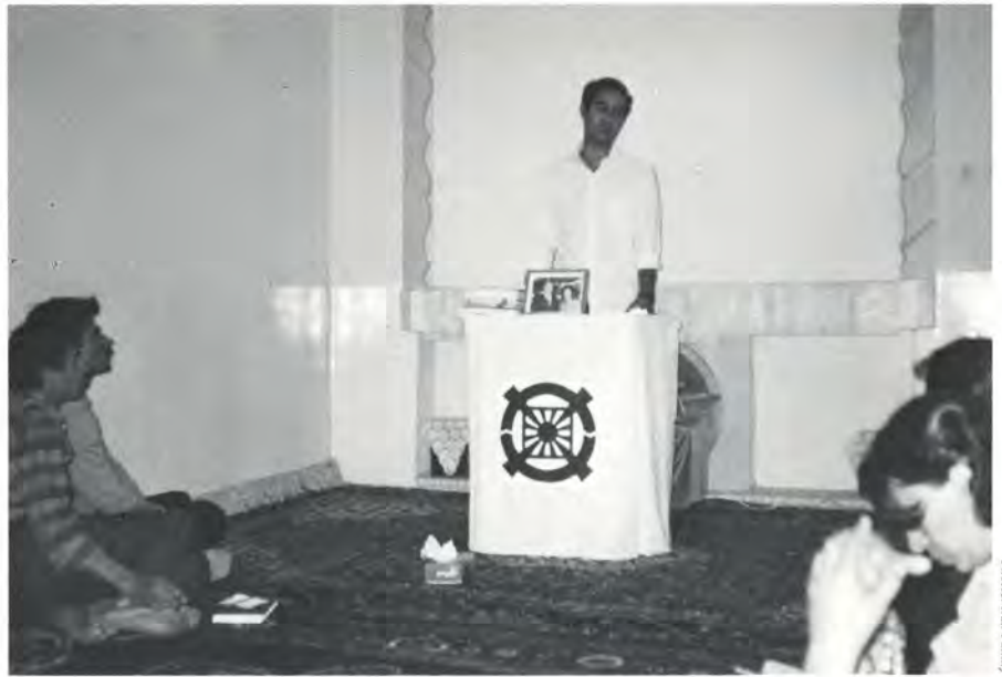
Sermon at a Friday service in Teheran.