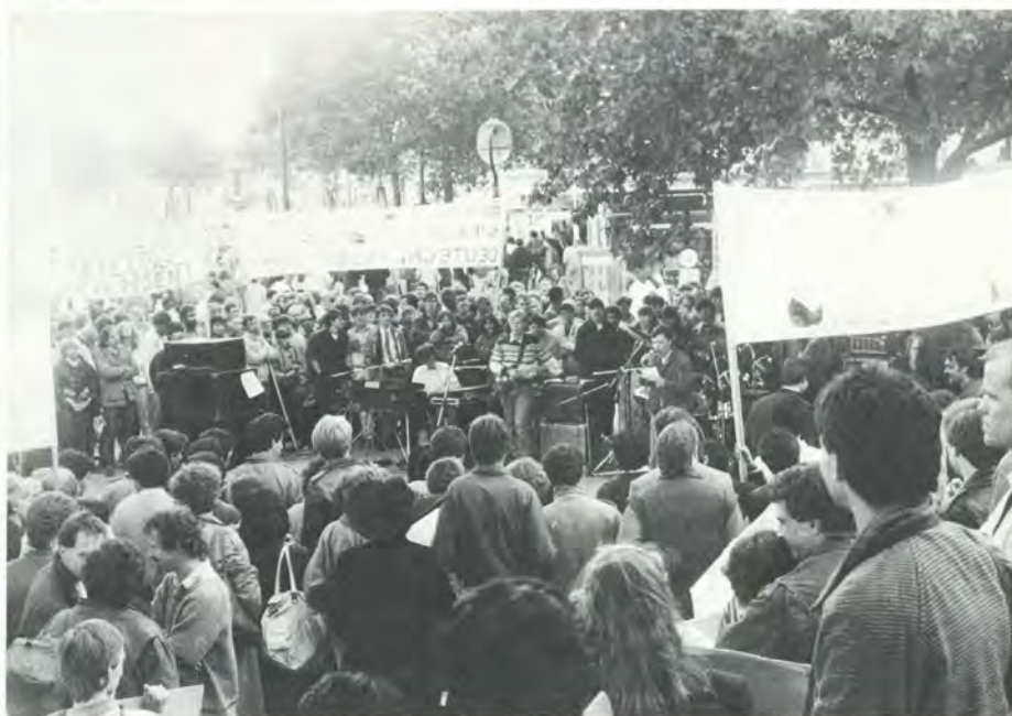
June 17, 1985. The final rally in the heart of Berlin attracted thousands of listeners.