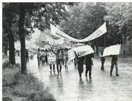
June 17, 1985. CARP demonstrators march through heavy rains down the historic Bernauer Strasse.

onstrators moved spontaneously towards the Wall, even treading on the territory of East Berlin, and shouted with the megaphone: "Gorbachev, schaff die Mauer ab!" (Pull down the wall!)