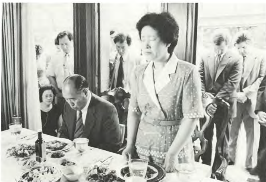
Mother prays before lunch on the day of Father's homecoming from Danbury.

Traditional family pictures were taken, and soon after that the tables were set again for lunch. This time, Father asked