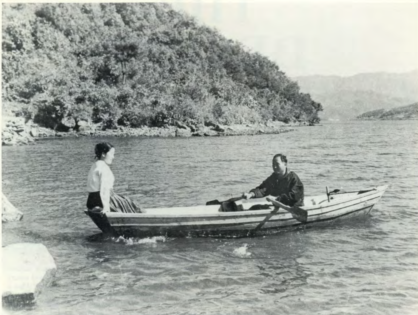
True Parents enjoy an outing on Chung Pyung Lake in the late 1960's.

capable of fulfilling my mission well, I felt ashamed and afraid before him.