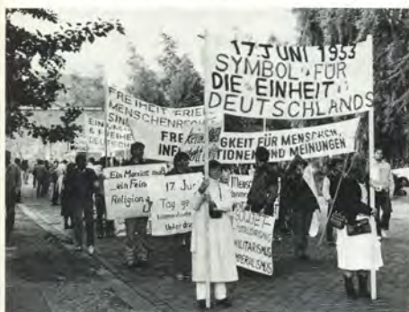
Demonstration on Bernauer Strasse commemorating the Day of German Unity.