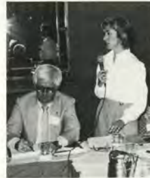
June 22-23 ACUMI in Atlanta.