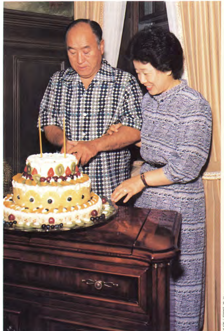
July 20, 1985. True Parents at an East Garden ceremony commemorating the first anniversary of Father's imprisonment in Danbury.

Today the United States of America is comparable to the Roman Empire two thousand years ago. After Jesus' crucifixion, Christianity spread throughout the Roman Empire, and through four hundred years of persecution Christianity was accepted and became the backbone of future European culture. Similarly,