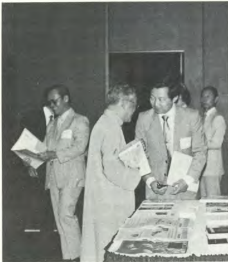
Participants meet over a conference book table.