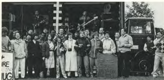
The Blue Tuna Band in the truck, the international choir in front. By using the two groups and the truck, CARP could hold demonstrations in four places on July 17.