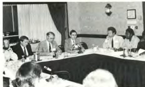
June 29-30 ACUMI in Chicago.

There is also a need to create an academic resource center for the myriad projects of the Unification movement, such as the minority alliances, the academic conferences, the social action and relief work, the newly initiated You and I magazine, campus activities, and ministerial outreach. The ACUMI professors will serve as a resource center in general, offering practical assistance where needed.