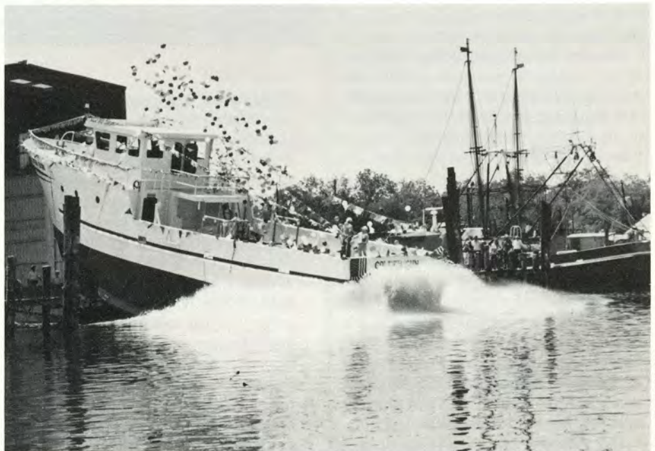
The newly-christened "Golden Sun" plunges into the waters off Bayou La Batre, Alabama.

The gala affair was broadcast the following evening on the local Channel 10 news. The newscaster hailed the launching as not only an inspiring event in itself but as a much-needed boost for the entire fishing industry. Appropriately, he entitled that portion of his newscast "New Hope." ♦