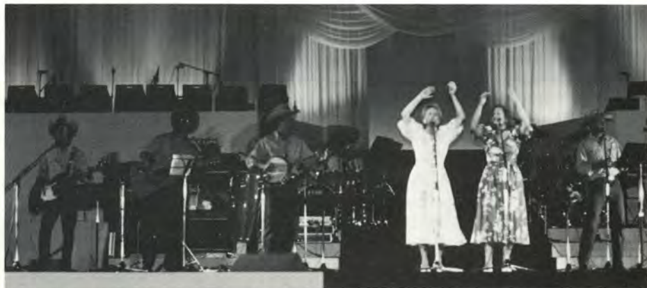
Musical entertainment at the CARP Festival.