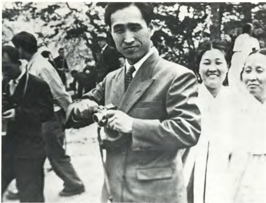
Father takes a Sunday walk through a historical park in Seoul, circa 1956.

I had grown up without a father to discipline me. My father died when I was only eight years old and I had no elder brother. So nobody had taught me discipline from the position of a father. What amazed me and left a deep impression on me was that the very first time I met Rev. Moon he educated me about discipline. After this meeting I felt we had known each other for a long time, because