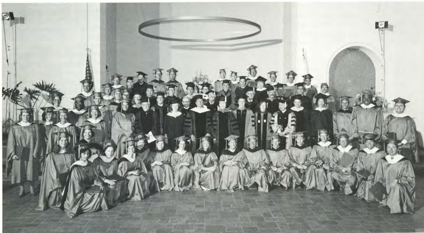
UTS: The class of 1985 with administration and faculty.