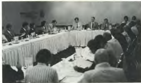
July 6-7 ACUMI in San Francisco.

Along with the zeal, youth, and commitment of Unification members, not to mention the financial resources they make available, our activities definitely call for the active and concerned participation of the academic community. By drawing on the expertise and wisdom of scholars, each of our activities can have a more effective impact on society. This is one of the most important reasons for ACUMI's formation.