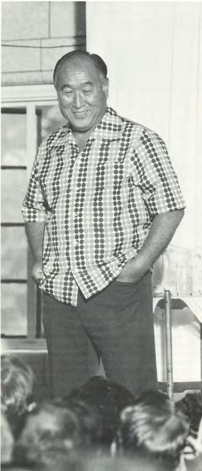
R. M. DAVIS / NEP

In the future all your posterity, throngs of people, will come to your tomb and pay their respects and literally weep. You will be the great ancestor.