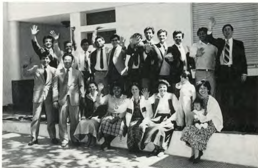
Argentina church leaders in 1984.

There were many rumors that all of our centers would be closed and that our church would be banned from the country. In the end, however, we gained a great victory.