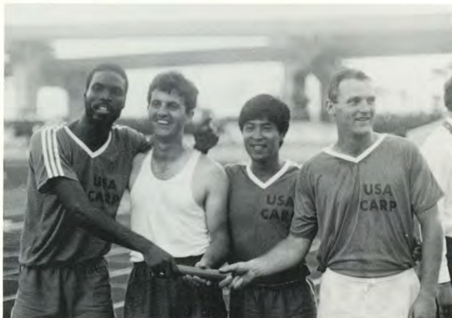
U.S. relay team.

one-heart dream. By the end of the convention, I could see that one culture's strengths could enrich another's weaknesses, especially within an atmosphere of mutual support and appreciation. My heart was particularly moved by the Filipino brothers and sisters. To be holding onto such an incredible dream—in a social and economic reality that can only be described as miserable—takes courage and an acute personal awareness of God's presence. I could not hold back the tears as they performed their national songs at the closing banquet. The same waves of emotion welled inside me as I watched the Thai members perform a native dance the same evening.