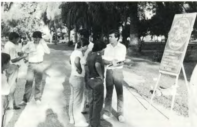
IOWC-type team witnessing in a pioneer city.

However, through this process we became more mature. Nine of our members received the Blessing in 1982. Our membership reached 100 and we were working in twelve cities. We formed an IOWC-type witnessing team, a mobile fundraising team, and an office staff. We bought a 70-acre farm to be used for workshops and the development of farming skills.