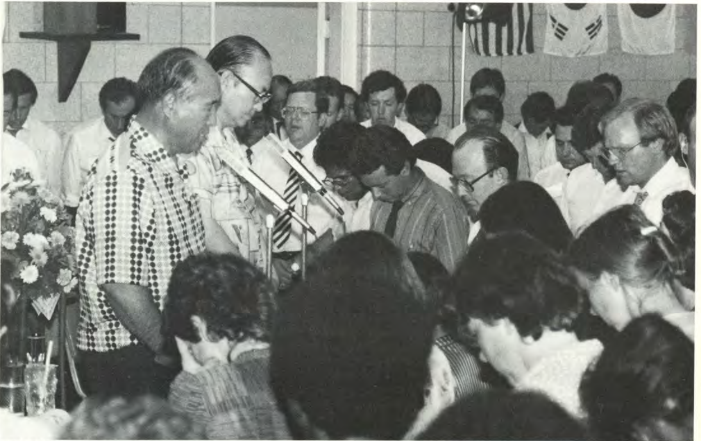
July 20, 1985. Special 11:00 p.m. prayer at leaders' conference commemorates Father's arrival at Danbury one year ago.

We should start praying not only for our own children, but for our grandchildren, our great-grandchildren, and for all our posterity for thousands of years.