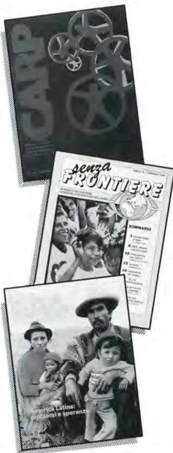
Some magazines published by the Italian family.

The first International Parents' Meeting took place in Mauny, France, in 1978. Forty Italian parents participated. We opened two new training centers, a large one in Varese serving northern Italy which replaced a smaller one we had had previously, and another one near Rome, serving central and southern Italy. We published a