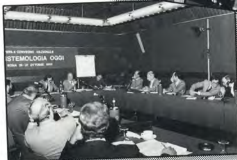
A PWPA conference in Rome.