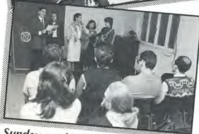
Sunday service in Milan.