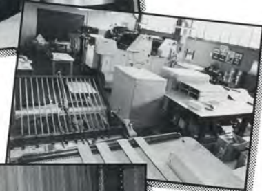
A view of the printing shop.