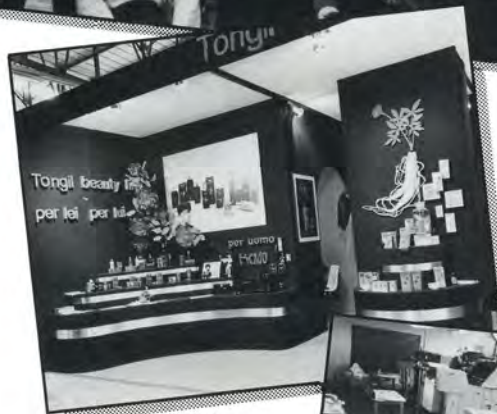
A Tongil Trading Company stand during an exhibition.