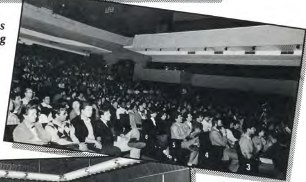
1200 people attend our band concert in Milan.