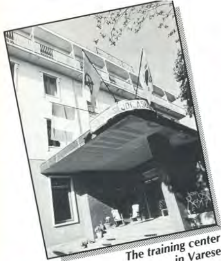
The training center in Varese.