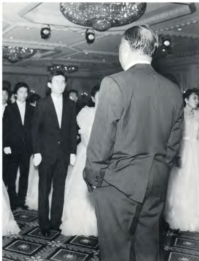
R. M. DAVIS / NFP

Worldly people live for their own convenience. They even sell out their conscience to rise in the world. If you follow them, your deeds will destroy your spiritual progress. Only through love, even in the face of suffering along the way of God's will, can you inherit God's ideal