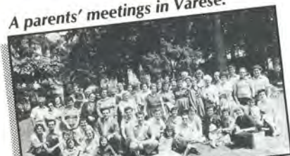
A parents' meetings in Varese.