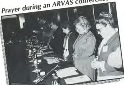
Prayer during an ARVAS conference.