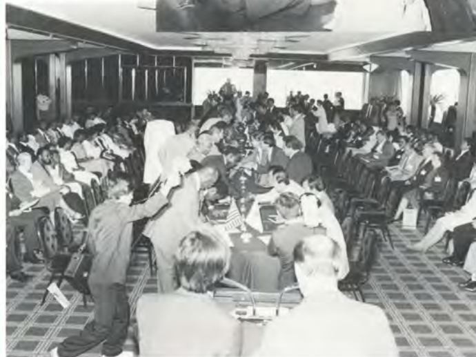
In an unprecedented historic moment, American ministers shake hands with the pastors of their Korean sister churches over the conference table at the Sheraton Walker Hill Hotel.