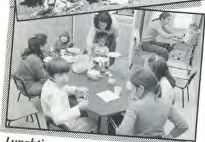
Lunchtime at the kindergarten in Varese.

felt the need to organize a mobile team composed of four members who could visit priests in other cities. We found this to be a good plan. The team is now meeting priests who are very open and who desire to understand more about us. Often one of our members, after having established a good relationship, is asked into a parish to help the local priest. These priests know our affiliation, and they like us and understand our spirit.