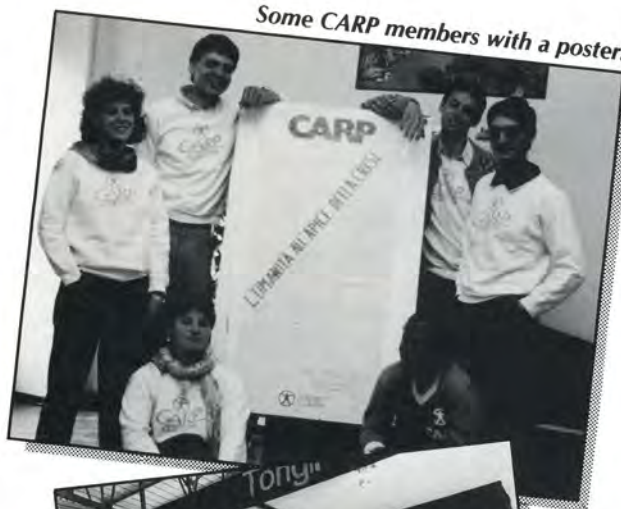
Some CARP members with a poster.

The center members and some home members dedicate Sundays to visiting priests. Since we have centers in only eight cities, we