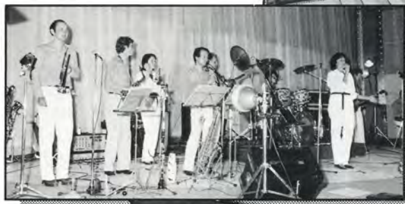
The Go World Brass Band during a concert.