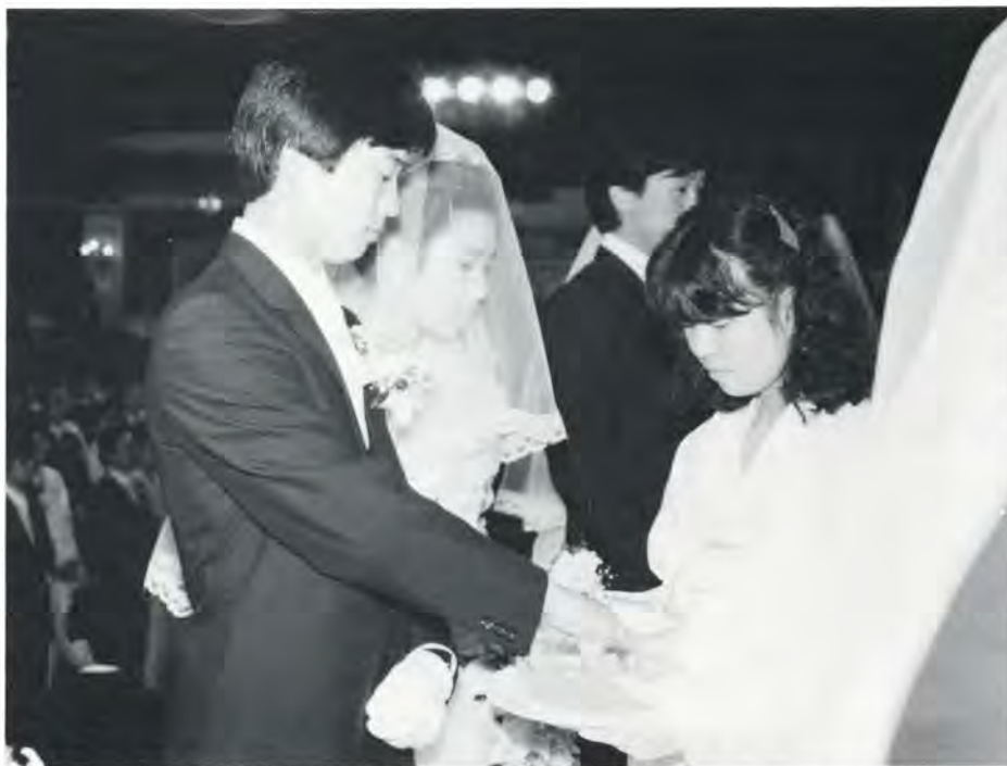
During the wedding ceremony the grooms dipped their hands in holy water.

ing it was too late; my father was already in spirit world. I don't remember having any kind of family life. Yet in spite of everything we never really had a grudge against our parents; we never hated our parents for not being there. I don't know how, but somehow we knew that what they were doing was for a good purpose, for Heavenly Father.