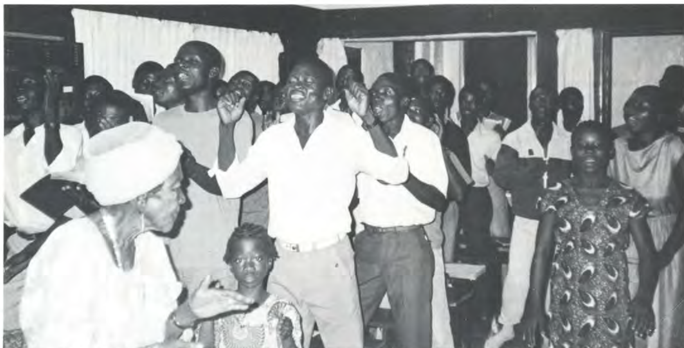
Center members and home members, old and young, singing at a monthly birthday celebration.