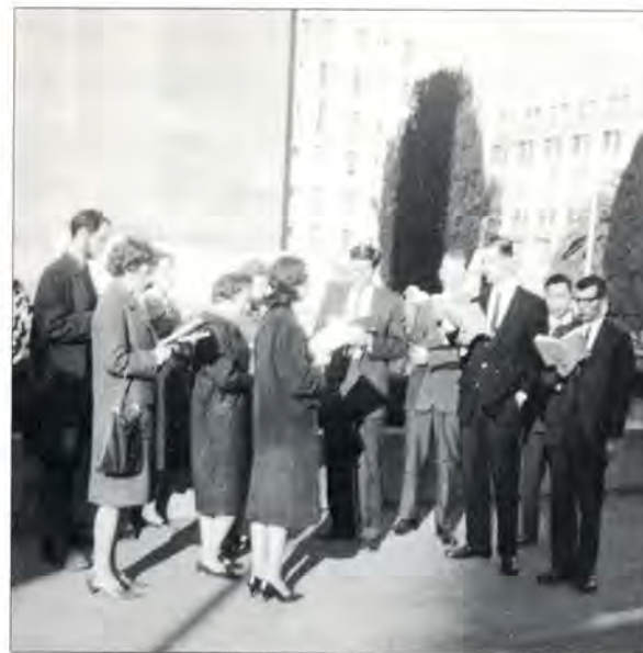
Autumn 1963: Singing at Union Square in San Francisco.

Parents, I got confirmation after confirmation from Heaven that Father was the one. Then I said to God: "Now I know that Your son has returned, and I'll give my life, my heart, and my love to him." I made up my mind to serve God and True Parents faithfully. Wealth and power had been important to me, but all of a sudden nothing mattered as far as the material world was concerned. A much greater love replaced everything I had experienced before.