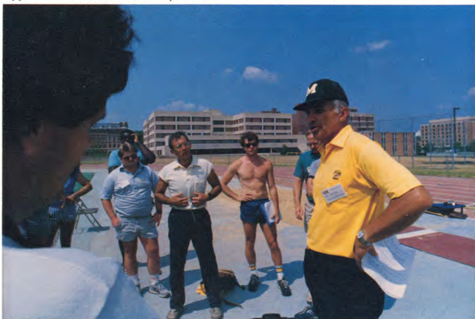
Participants listen attentively as one of the Olympic staff coaches explains the techniques of the triple jump.