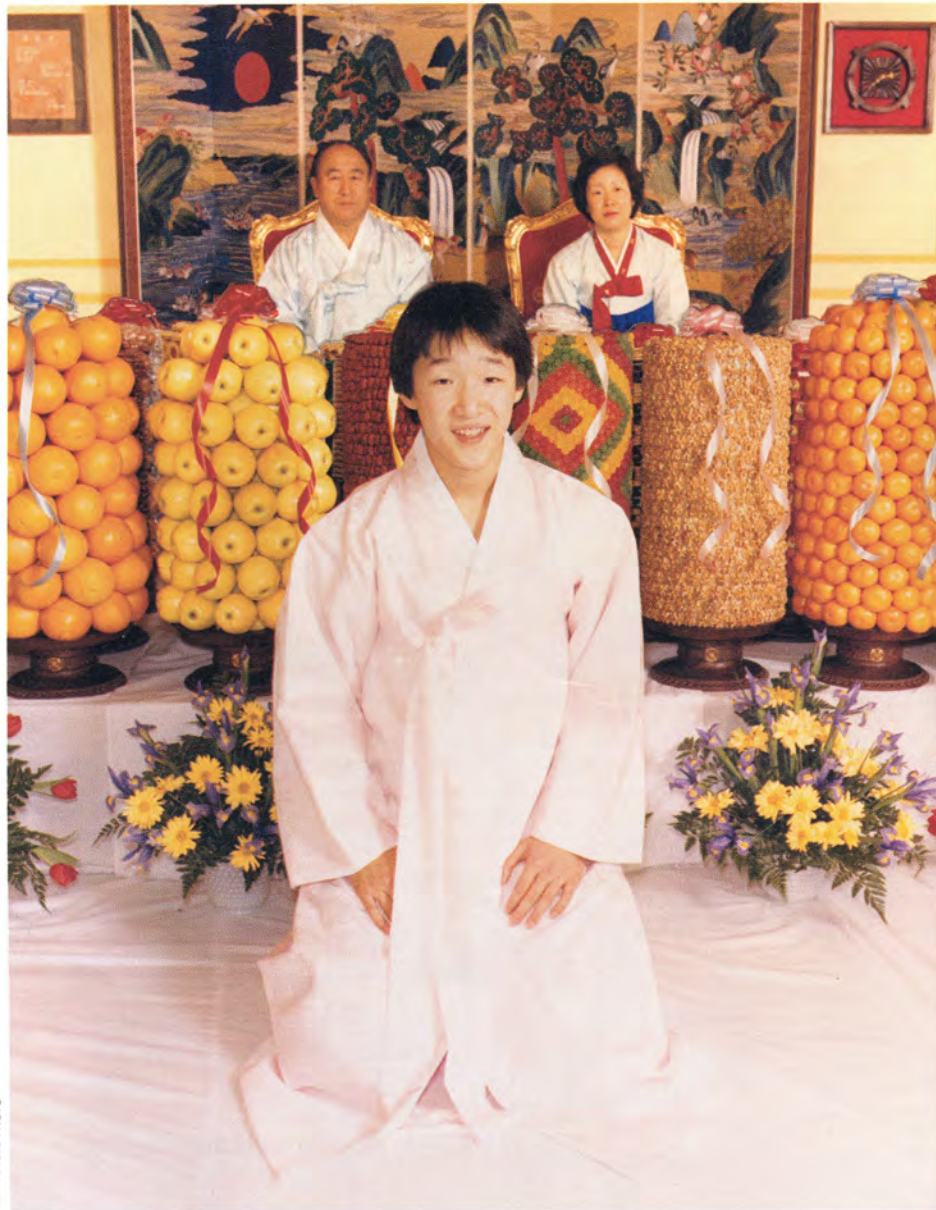
NEW FUTURE PHOTO