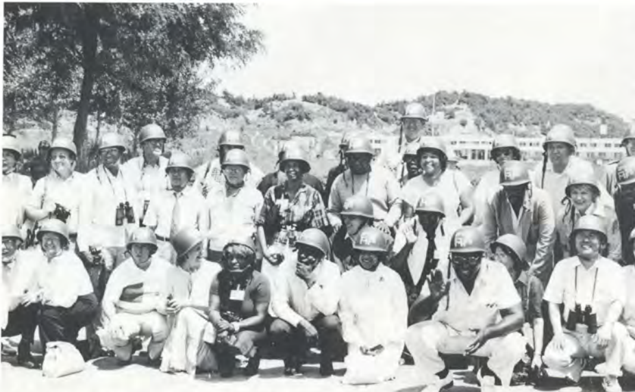
The ministers don army helmets for head protection in preparation to enter the North Korean infiltration tunnels at the DMZ.