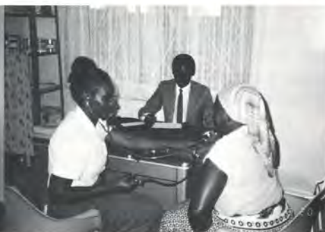
A patient consults a visiting doctor.

135. Each day we receive about 30 to 40 new patients; the remainder are returning or continuing patients.