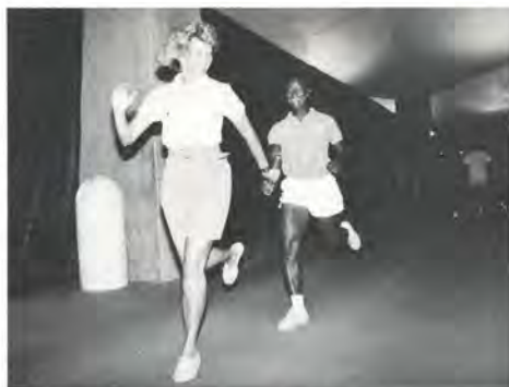
Coaches practice the special skills involved in passing the baton in relay races.