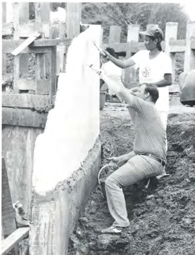
The last finishing touches on the bridge.