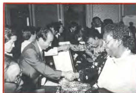
The Sister Church Signature Ceremony.