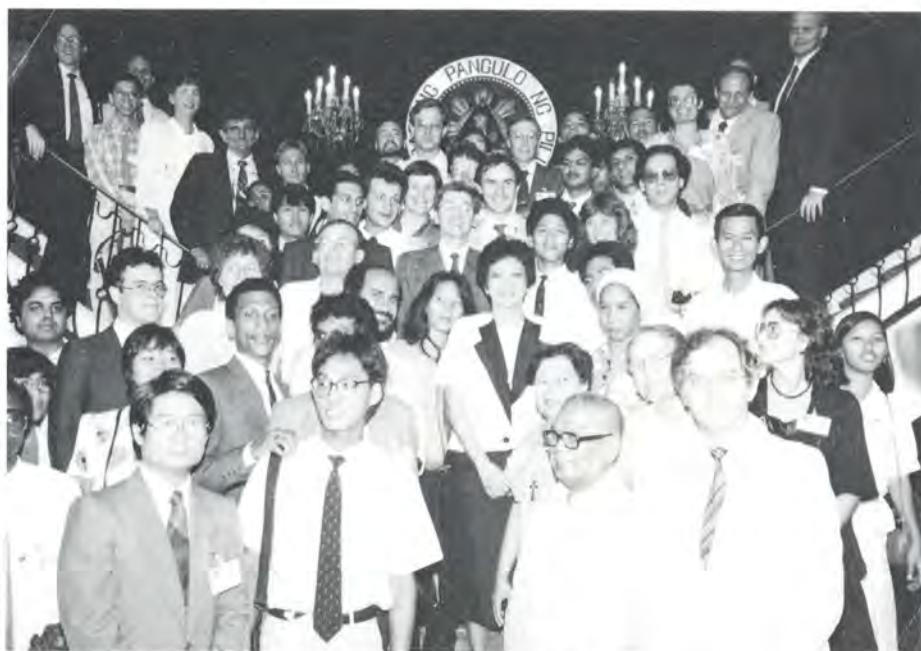
President Corazon Aquino with some of the RYS participants.