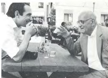
Openness and heartistic connection among the participants developed throughout the week.