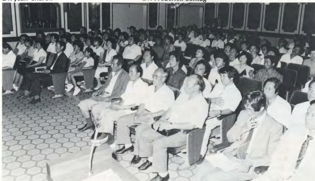
A Korean audience listens to one of the professor's speeches.