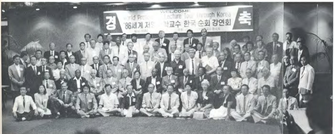
The Western and Japanese professors participating in the tour.