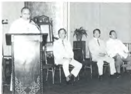
Cardinal Sin gives his address.