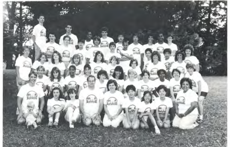
The older campers with their counselors.

BETWEEN JULY 19 AND AUGUST 9, CAMP Sunrise happened—once again! For the last seven years Camp Sunrise has provided an opportunity for blessed children to come together and share, to learn new skills and have fun. This season a record number of campers—over 120—attended.