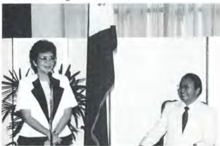
President Aquino speaks to the group.