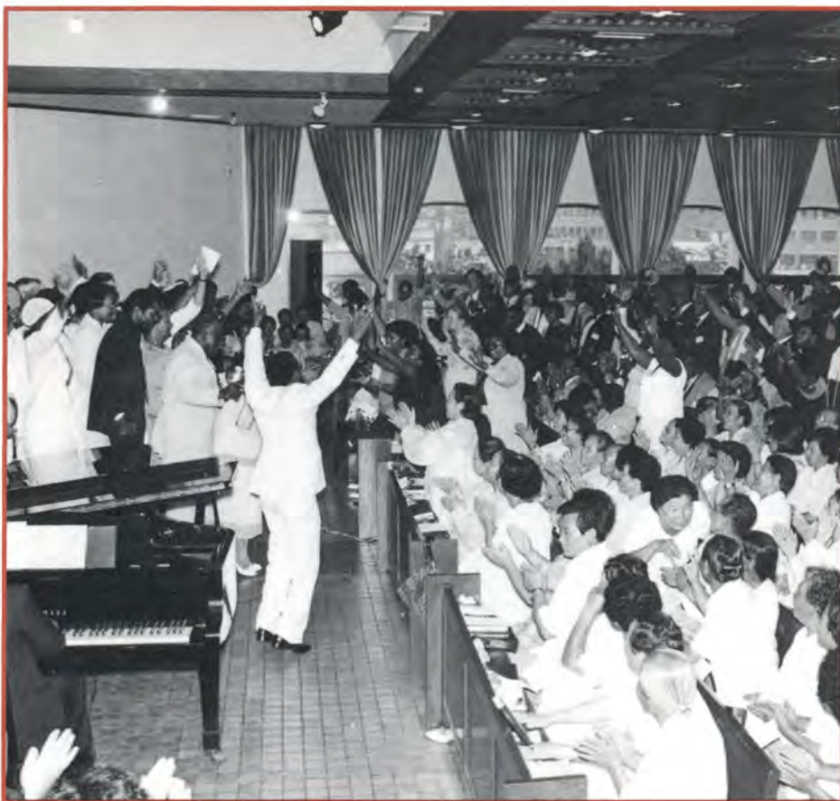
Rousing gospel singing at Sunday service at the UC Headquarters Church in Seoul.

For our day trip to Pusan we went by air. At the airport the ladies were separated from the men and we women were frisked thoroughly for weapons by strictly no-nonsense female security. We were told that because Korea is in a politically tense situation, precautions have to be taken on all domestic flights. Any cameras with film in them were confiscated for the duration of the flight. I said my camera had no film in it. The lady said gruffly, "Open!" I fumbled with it nervously and finally opened it to show her there was no film inside. She found something in my purse and took it out. "What is this?" "A tape recorder," I said. "Play!" she commanded. So I played it and she seemed satisfied. I guess she wanted