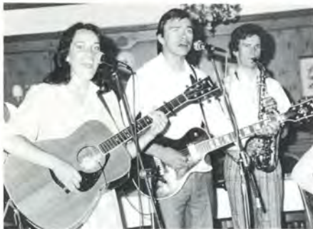
Our band entertained everyone on the last evening.