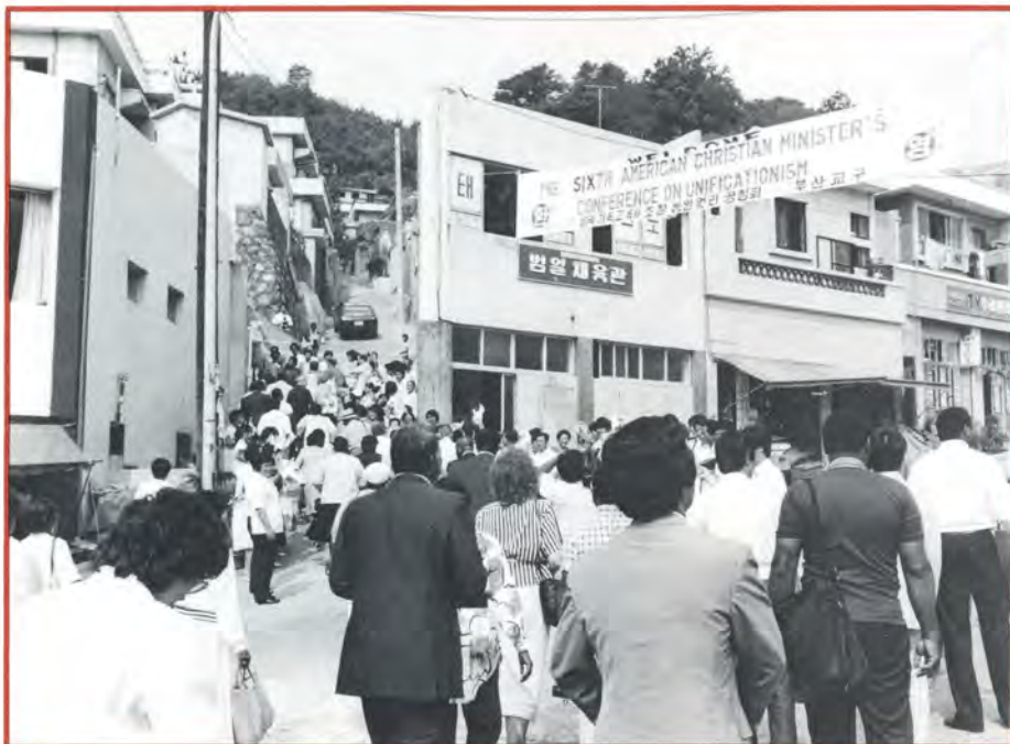
Outside the entrance to the museum in Pusan. The narrow alley leads up to the Rock of Tears.