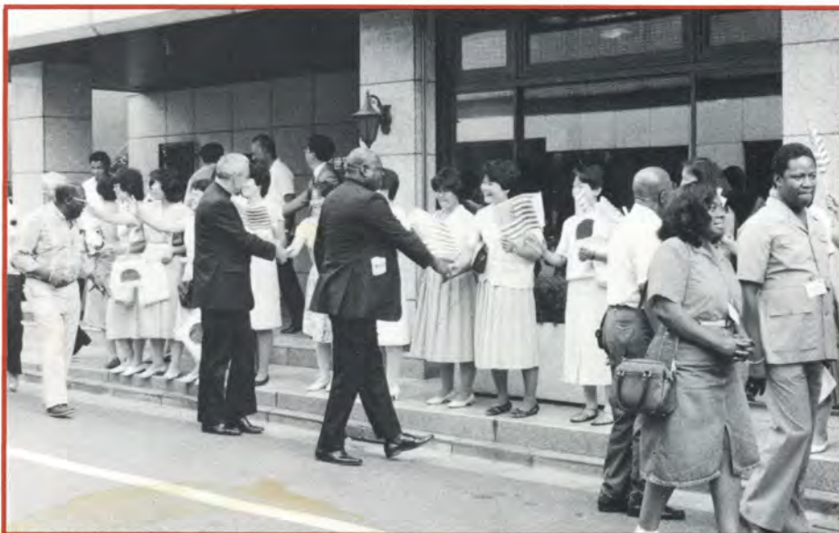
Outside the UC Headquarters Church in Tokyo.

We got a taste of Japanese culture the first day by participating in a traditional Japanese tea ceremony. The tranquility of the ceremony was not possible to preserve as the ministers swarmed noisily around the group and wanted to take part, but the beautiful Japanese ladies in kimonos maintained a sweet, unhurried dignity in serving every last person who sat down. No one could resist receiv-