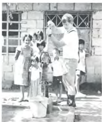
The new water pump.