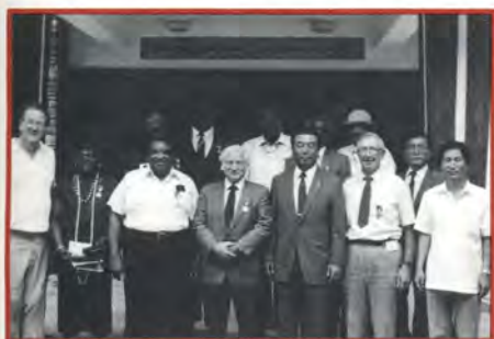
The Korean War veterans with their medals.

On the last day a Sister Church Signature Ceremony was held. About 30 pastors of American congregations volunteered to pair up with pastors of Korean congregations (not necessarily of the same denomination) and become sister churches. Some of the Koreans had even brought gifts to give to their “sister” minister. They were total strangers to each other but were taking a leap of faith and heart that had never before been