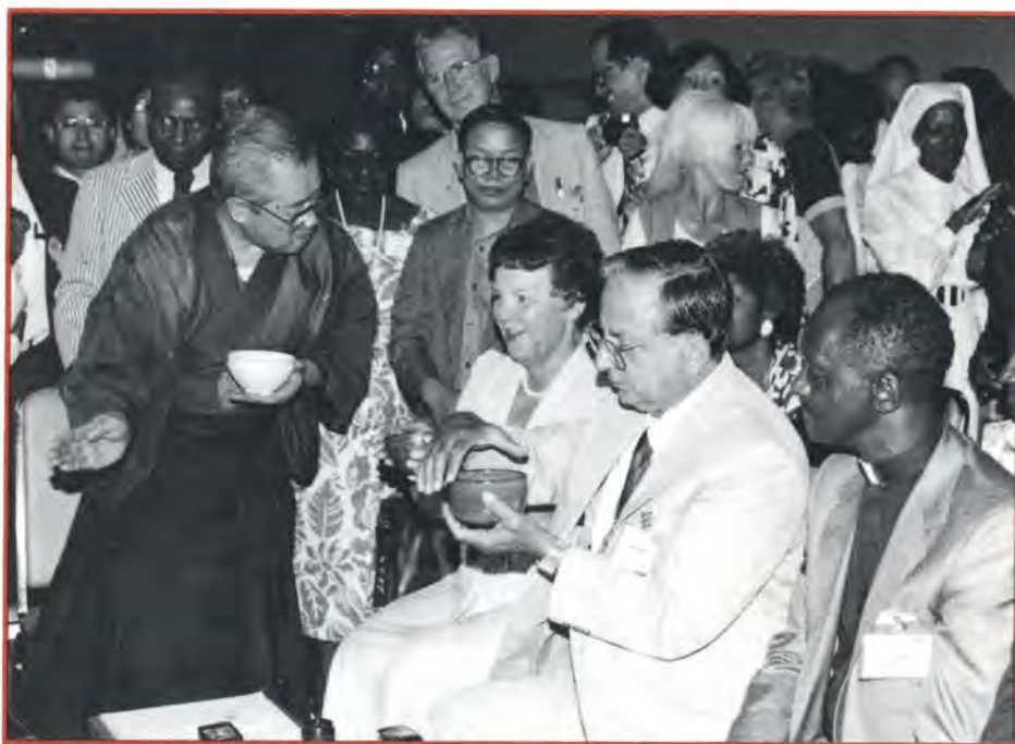
Ministers are graciously served at the tea ceremony in Tokyo, Japan.

ing a cup of tea so delicately and yet so firmly offered. As the recipient of Japanese service you feel almost hopelessly at the mercy of the server—you are flattened by their uncanny grace and you can't tell them to stop!