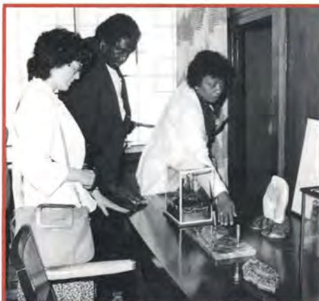
Upstairs at the Old Chung Pa Dong Church.

You could only hear whispers as the ministers brushed their fingers reverently over the sparse furniture and marveled at Father's humble beginnings.