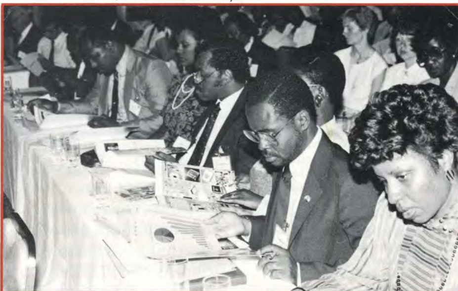
The ministers read literature about the Japanese Unification movement.