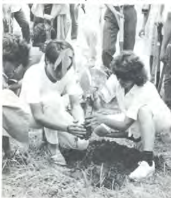
Planting a mahogany seedling.