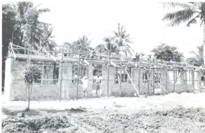
School construction in progress in Iloilo. This building will house three elementary classrooms.

At each site the work was grueling. The environment was so hot and smelly that sometimes it was hard just to get up in the morning. The volunteers challenged themselves to give their love continuously through