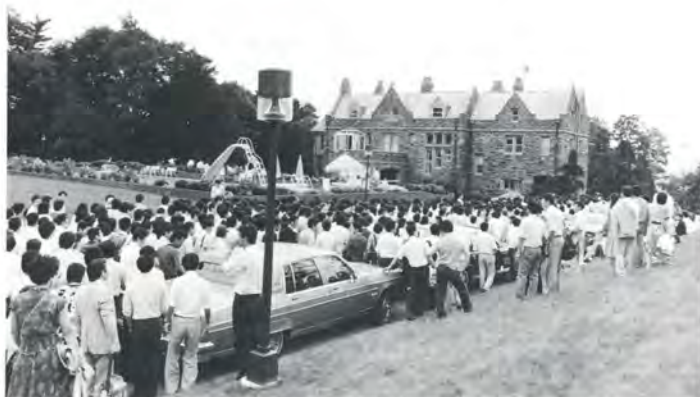
All the Japanese members were invited to East Garden.

Japan has been the enemy of enemies to Korea. Once Japanese authorities even tried to kill me, and because of them I actually came to the brink of death many times. I have chosen Japan as the Eve nation because forgiving and loving the enemy and going beyond one's own misery is the highest condition before Heaven. Young people are coming here from an enemy nation to do God's will. America was once an enemy to Japan, and now you Japanese must try to save her. Germans must also try to save America. Then Japan and America can save Korea. By uniting enemy nations, we can establish the highest tradition centered on God. □