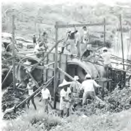
RYS in the Philippines, p. 28