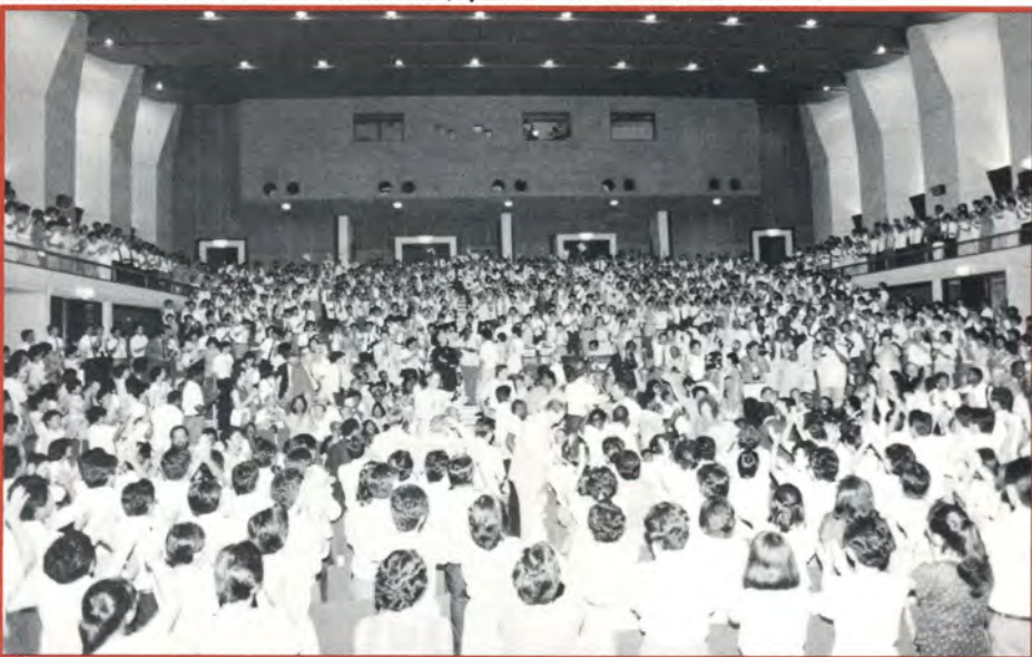
At the Youth Rally in Tokyo over a thousand new members greeted the ministers.