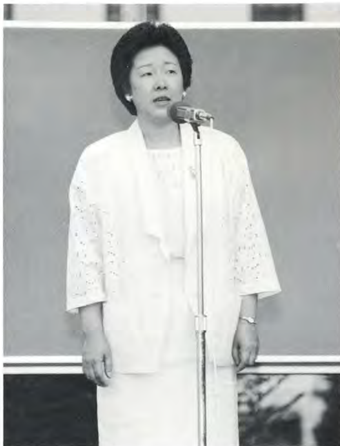
True Mother speaking.

It is very easy for us just to revere and follow Father, but it is not easy at all to substitute for him. I myself know