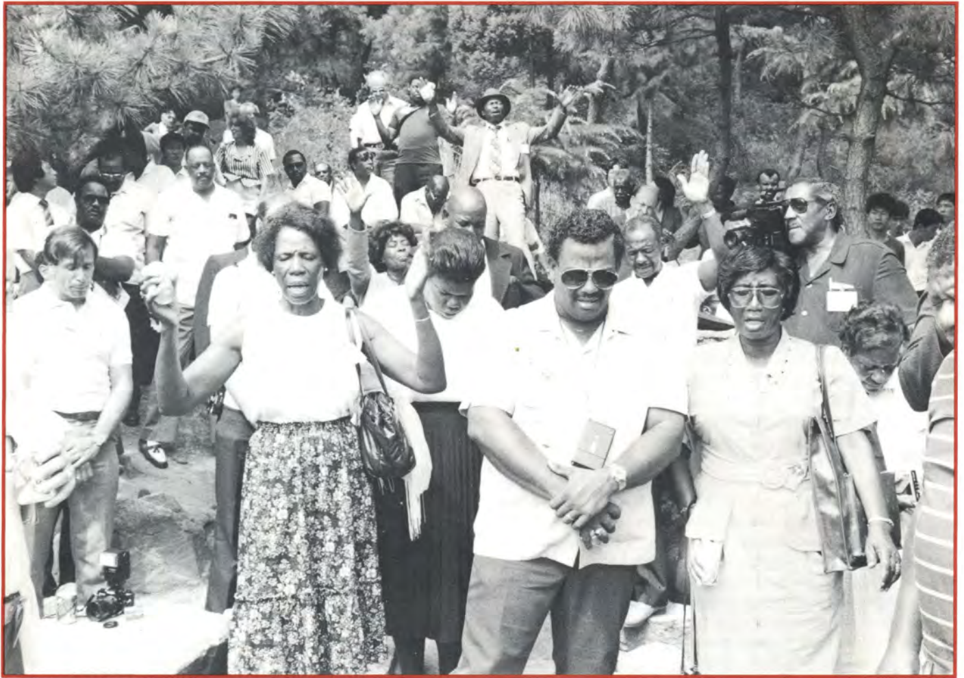
At the Rock of Tears.