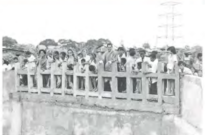
Some of the RYS volunteers and the village children celebrate the completion of the bridge that connects a Christian and a Muslim community.

Love is a wonderful topic, but behind love lie the actions of selfless giving and service. Without concrete actions, love cannot survive. Secular, romantic love is a fleeting emotion. When it dies, so does the young couple's willingness to serve each other. The husband begins to look at his wife as someone who will always prepare his meals on time. The wife may come to regard her husband merely