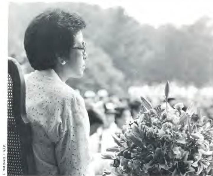
J. HALLINO / NEP

Up to one hundred percent reparation, God is unable to forget the fall and the history of restoration, but by touching that additional reparation, God can forget everything.