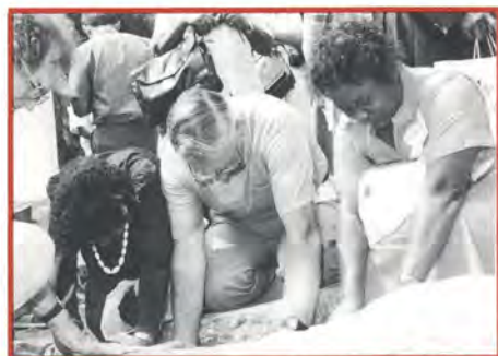
A numbers of ministers started praying and crying deeply at the Rock.