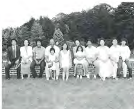
Testimonies by the True Family, p. 8