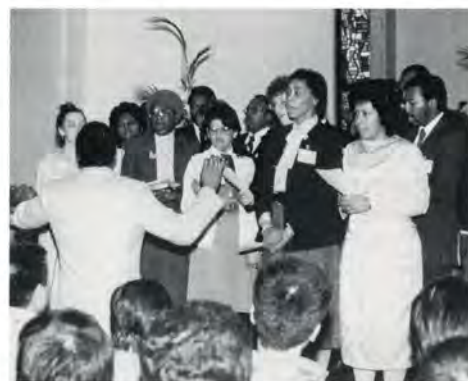
American ministers sing some gospel at the headquarters church in Seoul.