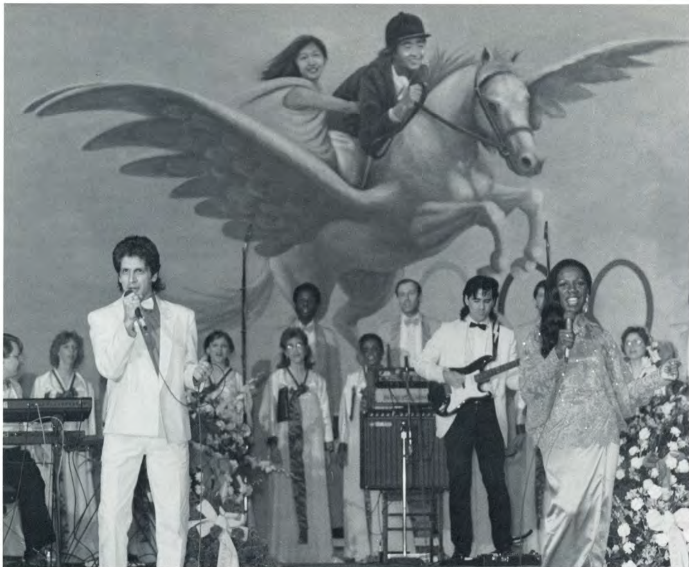
K. OWENS / N.E.P.

from Seoul, Korea, where she was performing that same evening with the Universal Ballet Company in a production held in honor of the bride and groom.