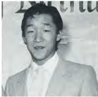
March 13, 1987, 12:40 a.m. New York City

America is a country that God is most concerned about. You already have been involved in many activities and projects. My blood that has been shed in this land can already be used to purify the land. But you people, you Unificationists, must now remember that you can claim that victory, you can be cleansed, you can be washed clean from all your sins. And indeed the sin of this nation can be taken away through the blood that was shed. You must, however, believe in me. You know that True Parents have ordained me with a glorious mission. I only want to share the love from both Heavenly Father and True Parents with you all.