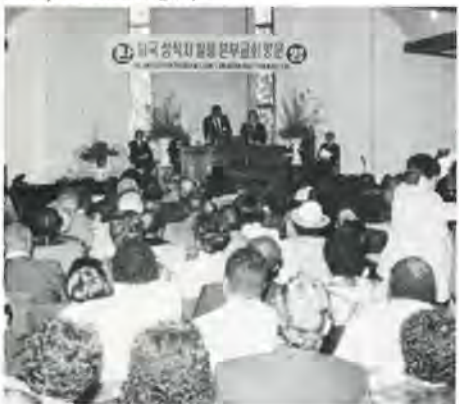
10th ICC, p. 38