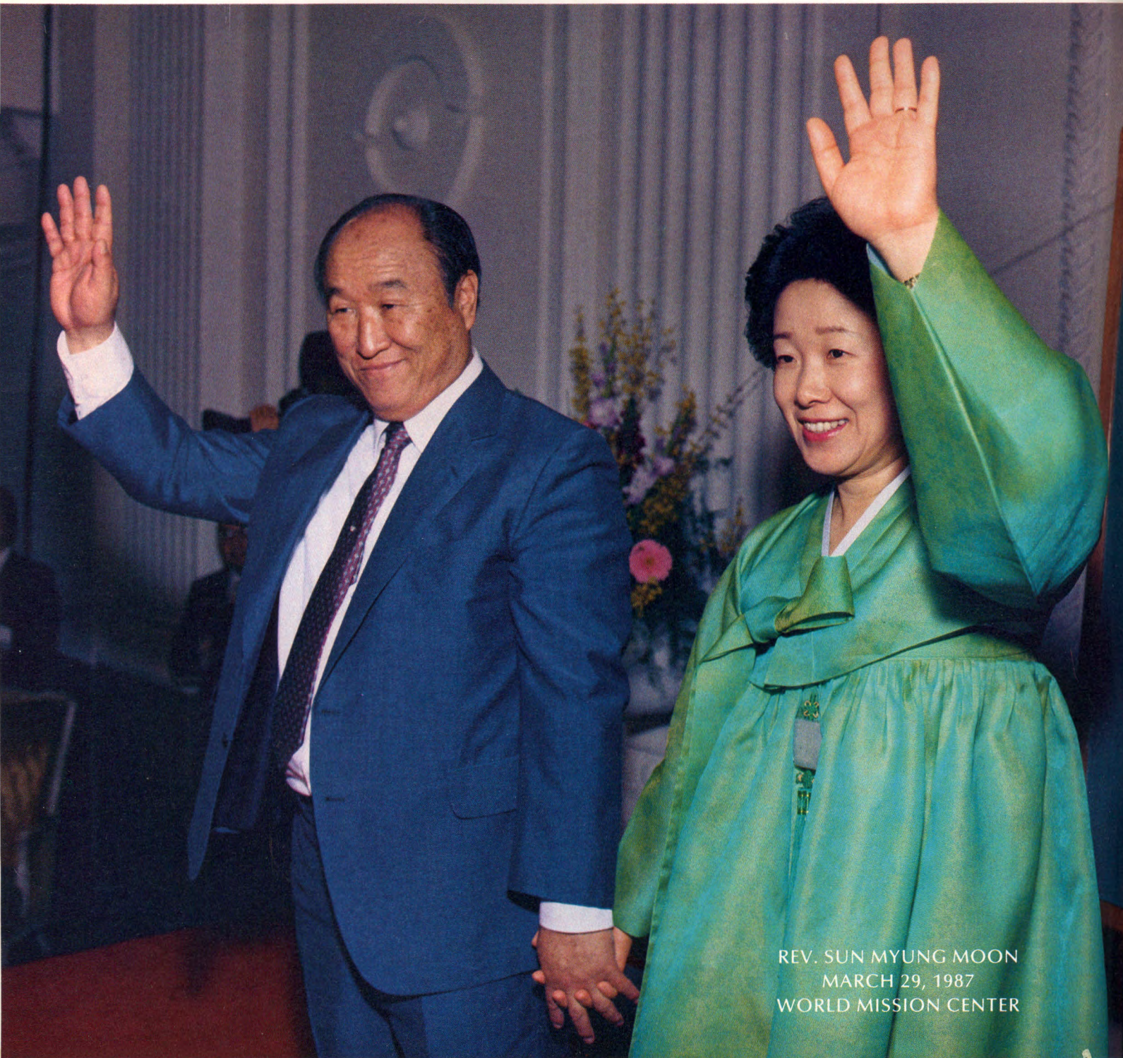
REV. SUN MYUNG MOON MARCH 29, 1987 WORLD MISSION CENTER