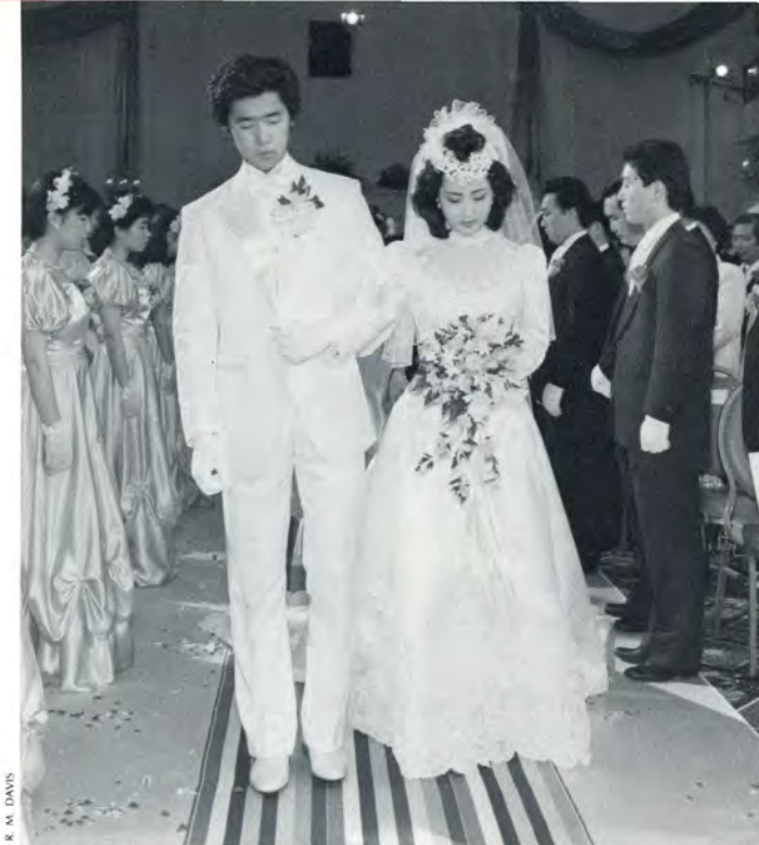
The bridegroom and bride walk slowly toward the altar, flanked by the bridesmaids and groomsmen.