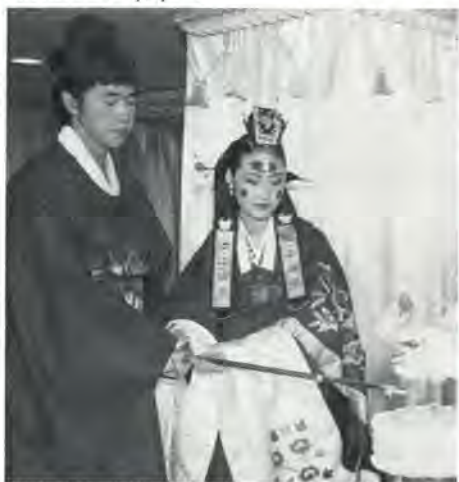
Holy Wedding, p. 10