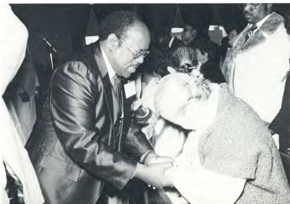
A spontaneous connection of heart between East and West.