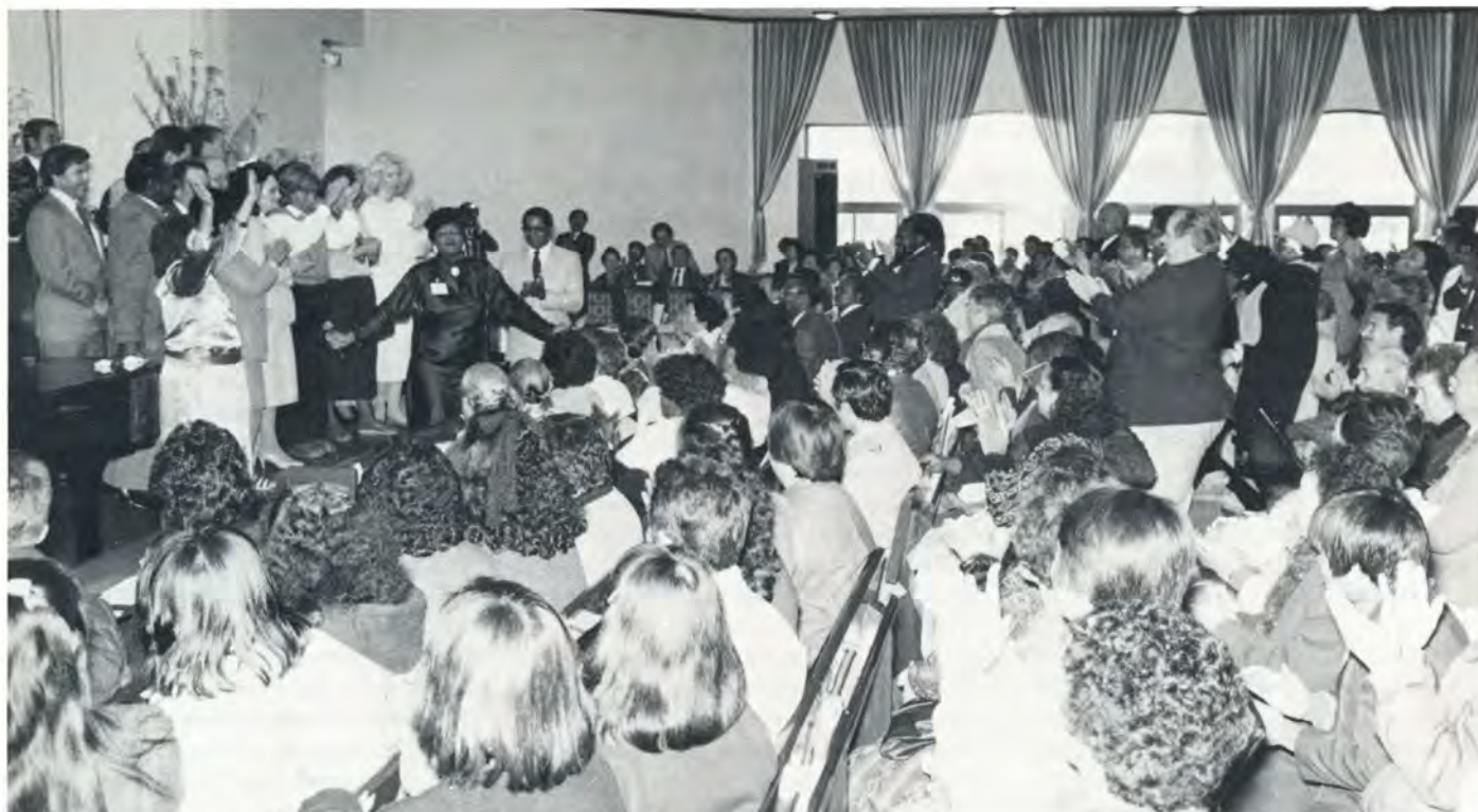
The ministers of the 10th ICC sing at Sunday service at the church headquarters in Seoul.