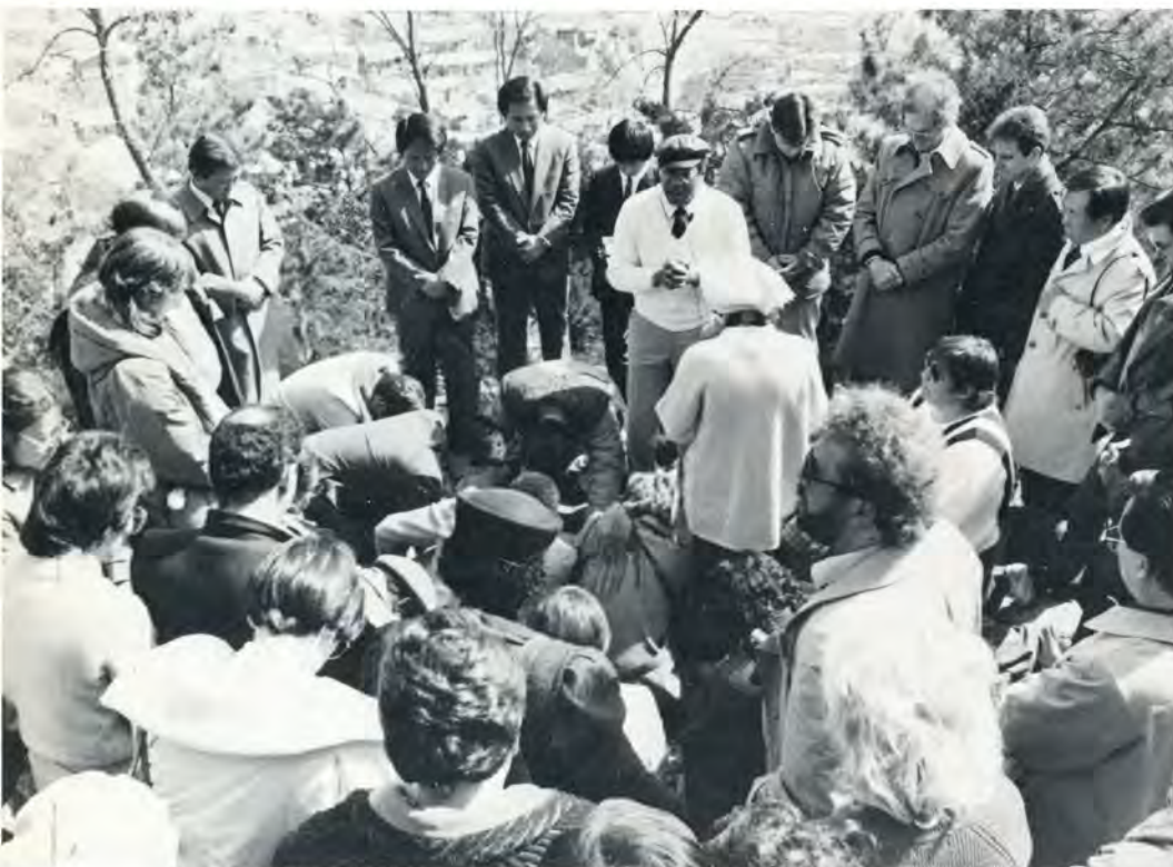
Prayer at the Rock of Tears.

One last thing to mention is that we always have to remember the incredible foundation of prayer that has been laid in Korea. We have no idea of the depths of suffering of our elder brothers and sisters. Without them, we could never have been able to experience these things. They are really the kings and queens of heaven!