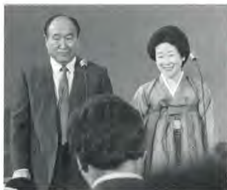
Parents' Day, p. 4