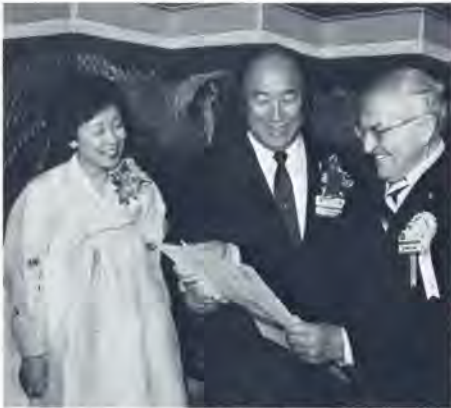
Gathering of world leaders, p. 9