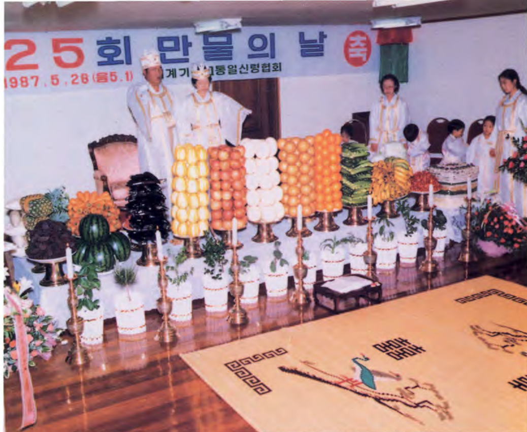
True Parents celebrate the Day of All Things at Han Nam Dong with some of their children.

Once I was pioneering in the northern part of Korea, where I had 50 home members to take care of. These generous members would offer me donations of food from their harvests