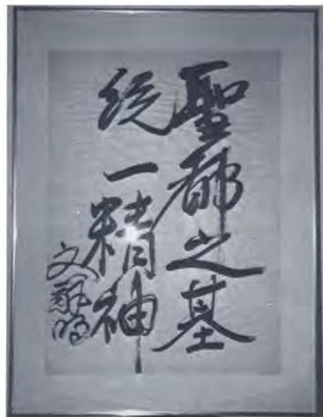
Father's calligraphy: "A unified spirit is the foundation of the holy city."