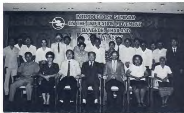
Every month we hold an ISUM for educators and professionals.

BECAUSE OF IRFF'S WORK IN THAILAND, MANY PEOPLE IN THE HIGHEST LEVELS OF GOVERNMENT KNOW AND RESPECT OUR MOVEMENT.