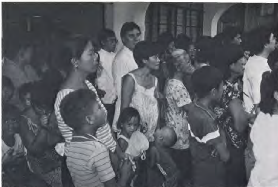
In Paombong, the crowd waits patiently for the clinic to open.

In one week our team traveled to three different towns, setting up our temporary clinic in each one. Everywhere we went, there were so many people waiting to see us we couldn't take any breaks. The people who assisted us, whether they were Unification Church members or not, supported us continuously. One day I treated patients for 12 hours straight, and the Filipino woman who worked with me stayed with me every moment. She wouldn't eat anything un-