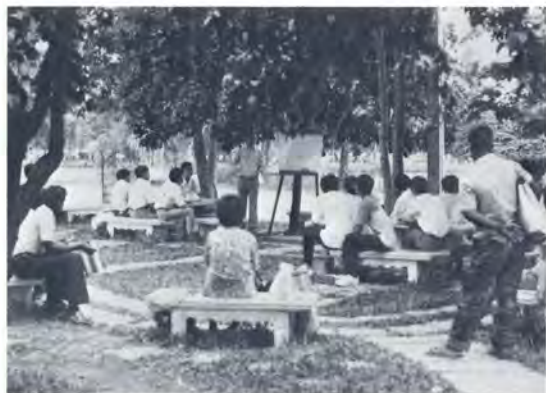
A mini-lecture on campus.

From 9 am to 2 pm the members fundraise to support our activities, offering many kinds of products: flowers, stationery, pictures, stickers, dolls, key holders, and wallets. In the afternoons we go witnessing. We concentrate on the campuses because we have a better response from young people. Middle-aged people tend to be less open. Our center in Bangkok is located near the university. Usually we put posters and photos in front of the center to attract attention. If a member brings a guest over early in the afternoon, he teaches his guest individually.