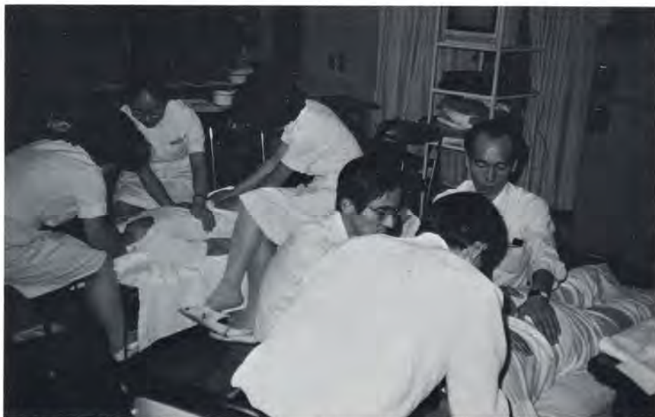
The doctors and nurses at Isshin practice newly-learned reiki techniques on each other.

I visited another woman who was recovering from a cancer operation during which her right lung had been removed. She was still in great pain. Her breathing was restricted, and her voice was very weak. After the first reiki treatment she began to improve, and by the fourth treatment the pain had gone, and her breathing and voice were much stronger. She had been going every day to the hospital's morning service but was now able to sing the holy songs with everyone else. She was so impressed and grateful that she occasionally followed me around the hospital, introducing me to the other patients. Her response to me was totally different from the way