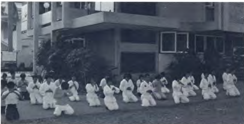
An early morning tae kwon do lesson in front of the Bangkok headquarters.

Before breakfast, the members study Korean or tae kwon do (Korean karate) and then clean the center. The atmosphere we maintain in the center is vital, so cleaning is very important. All day long the members are singing, which creates a high spiritual atmosphere by the time the guests come in the evening. Some members have testified that they joined in part because of the singing. Thais love the happy enthusiasm of our members.