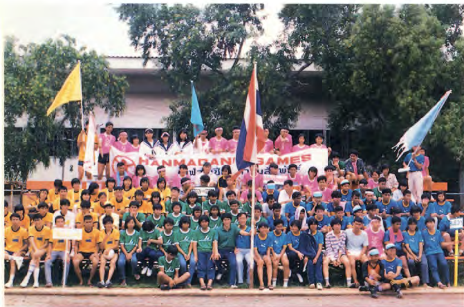
A Thailand version of the Han Ma Dang Games.

The future of our work in Thailand is very bright. Father said that we will be able to find many spiritual children here. Other nations in our region have different roles. Singapore, for instance, has a good potential for financial success, but Thailand's mission is to bring many members. For this reason we concentrate mostly on witnessing.