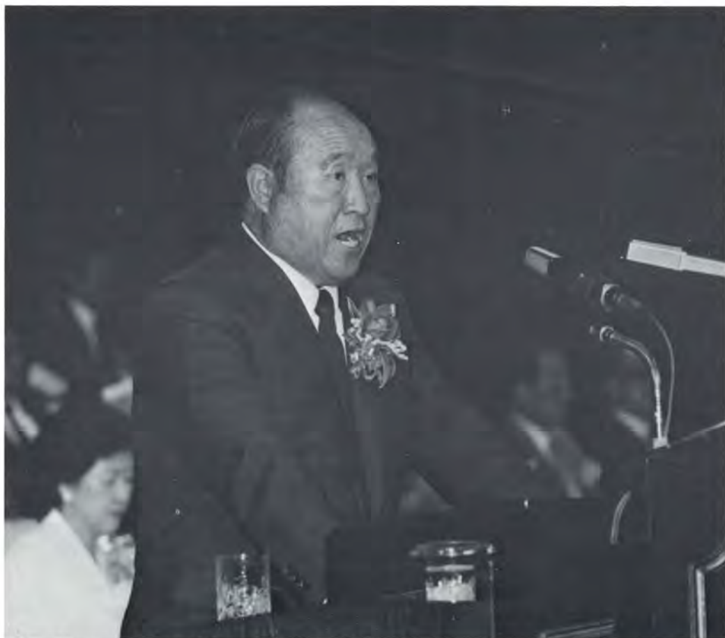
Father delivers the Citizens' Federation Founder's Address.

The creator of this universe is a God of intellect, emotion, and will. We were created in His image, and He finds delight in the flow of