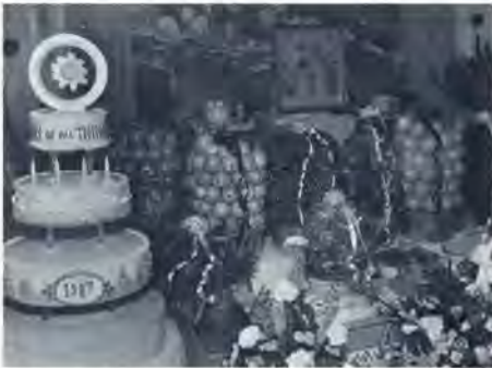
Day of All Things, p. 18