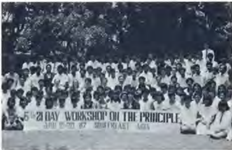
The land of smiles, p. 25

FRONT COVER: While Mother looks on, Father signs a program at the Summit Council for World Peace.