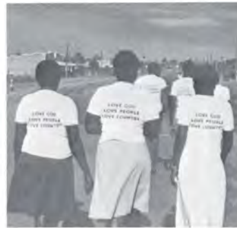
Below: The Kisumu team proudly displays their banner. Left: Volunteers joyfully digging in. Top: Volunteers wear their new AED T-shirts.