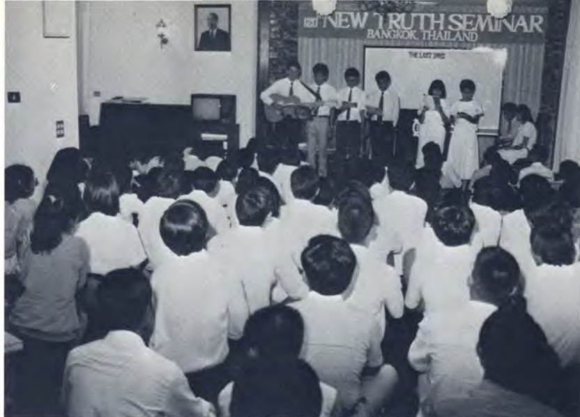
Our New Truth Seminars attract many guests every Saturday.

The other countries in our region—Malaysia, Singapore, Indonesia, and Burma—have had varying degrees of success. The Thai church has been the most financially successful so far, so we help support the other countries. Whenever they send their members to