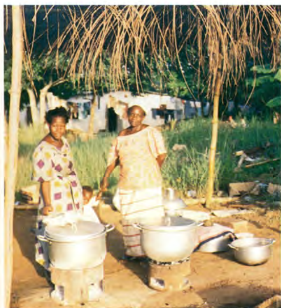
This cooking facility caught on fire during one of the lectures.