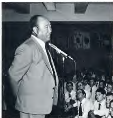
Father's July 1 speech, p. 7