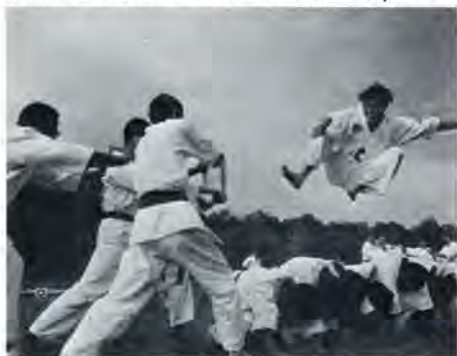
Wonhwa-do around the world, p. 32