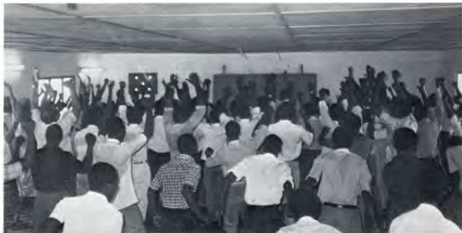
The final "Mansei!" of the workshop.