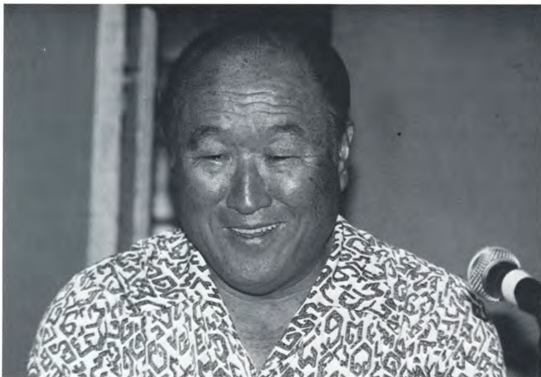
Father speaking to Ocean Challenge members at Morning Garden, Gloucester, on July 2.

line in detail his vision for a project, thinking not only 10 or 50 years ahead, but even 1,000 years from now. Father also relates everything to the past, by explaining how present events fit into the overall scheme of God's restoration work. Rather than giving specific advice about how a particular mission should be executed, Father instead always showed leaders a larger perspective on what they were doing to contribute to God's providence.