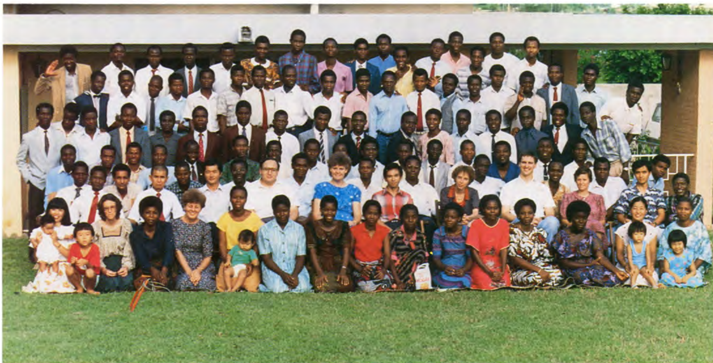
The workshop participants came from 18 different African countries.

to be yanked to safety as the oil set part of the cooking hut on fire.