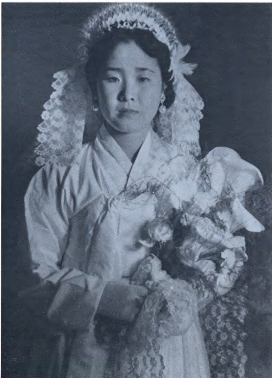
True Mother as a new bride at age 18.