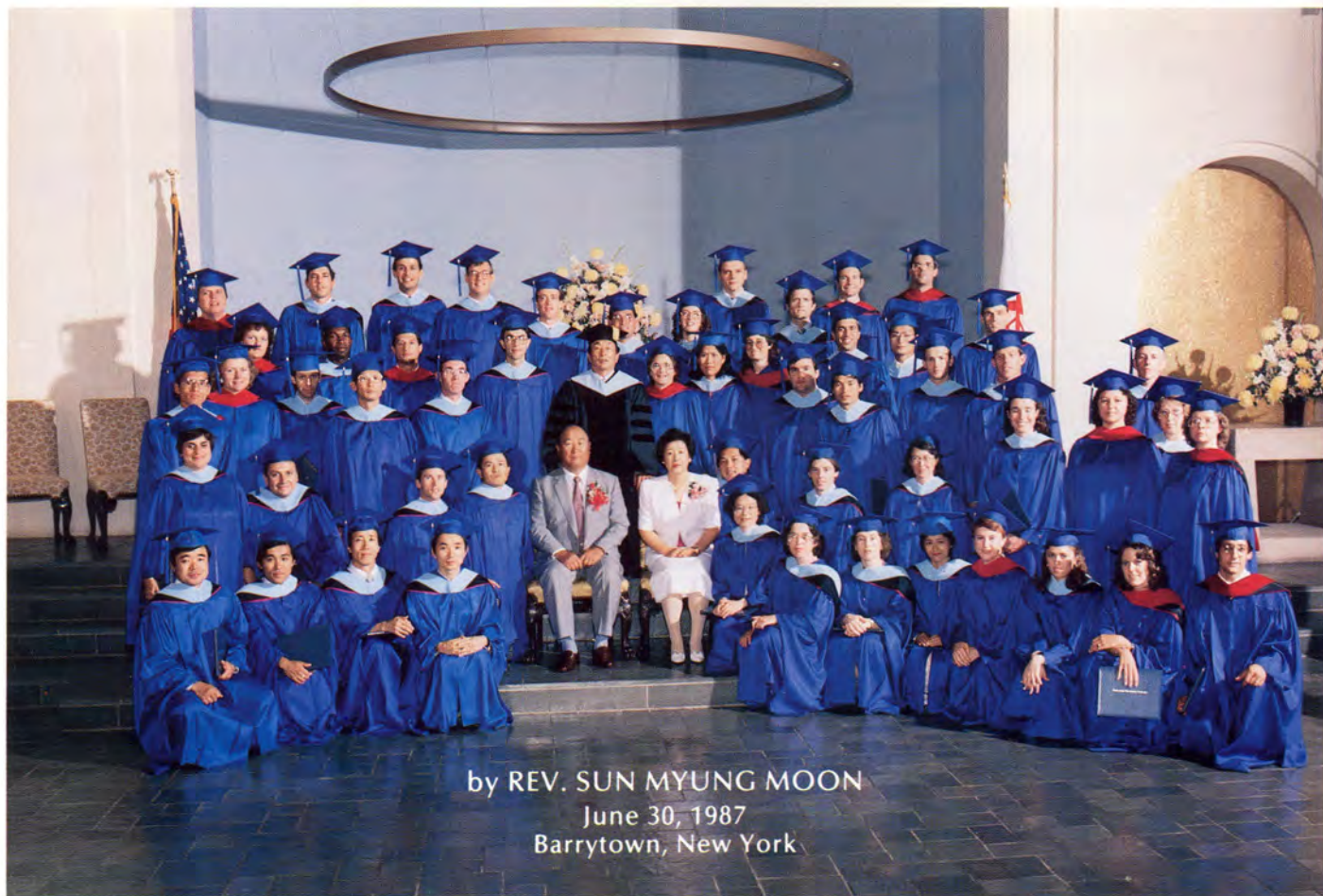
by REV. SUN MYUNG MOON June 30, 1987 Barrytown, New York