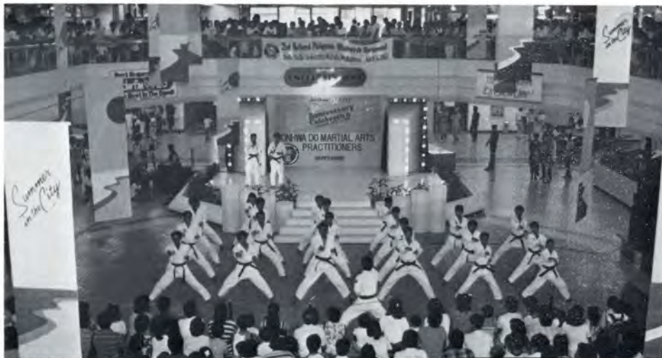
Public demonstration at a shopping mall in Manila, the Philippines.

Wonhwa-do is truly deep and personal for me. Ever since I walked this path, life has been difficult, but there's always meaning in it, and this makes it so very valuable and precious. □