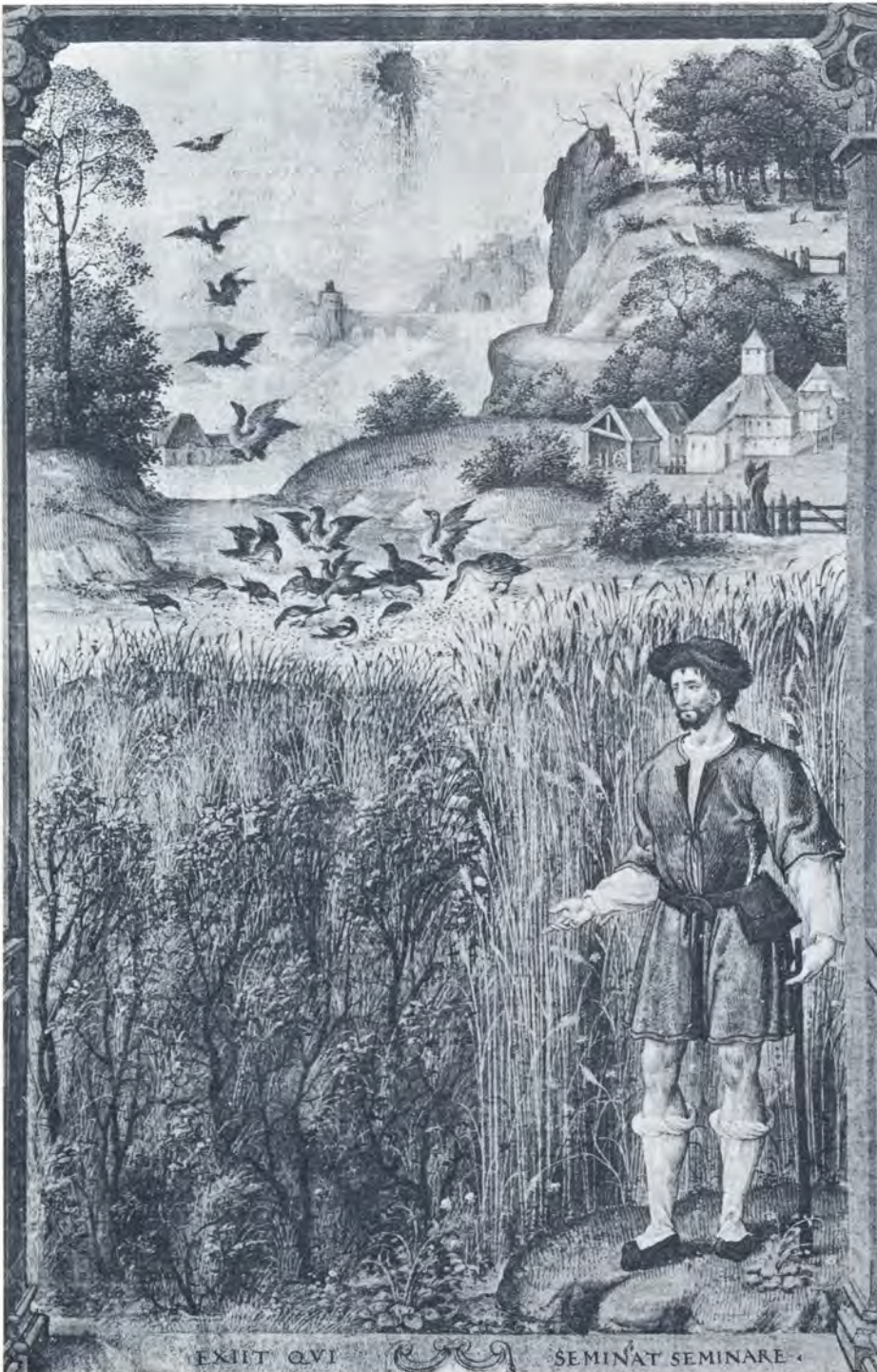
A French engraving dated 1539 depicting the parable of the sower (Matthew 13).

Taken from a sermon given to members in Atlanta, Georgia.