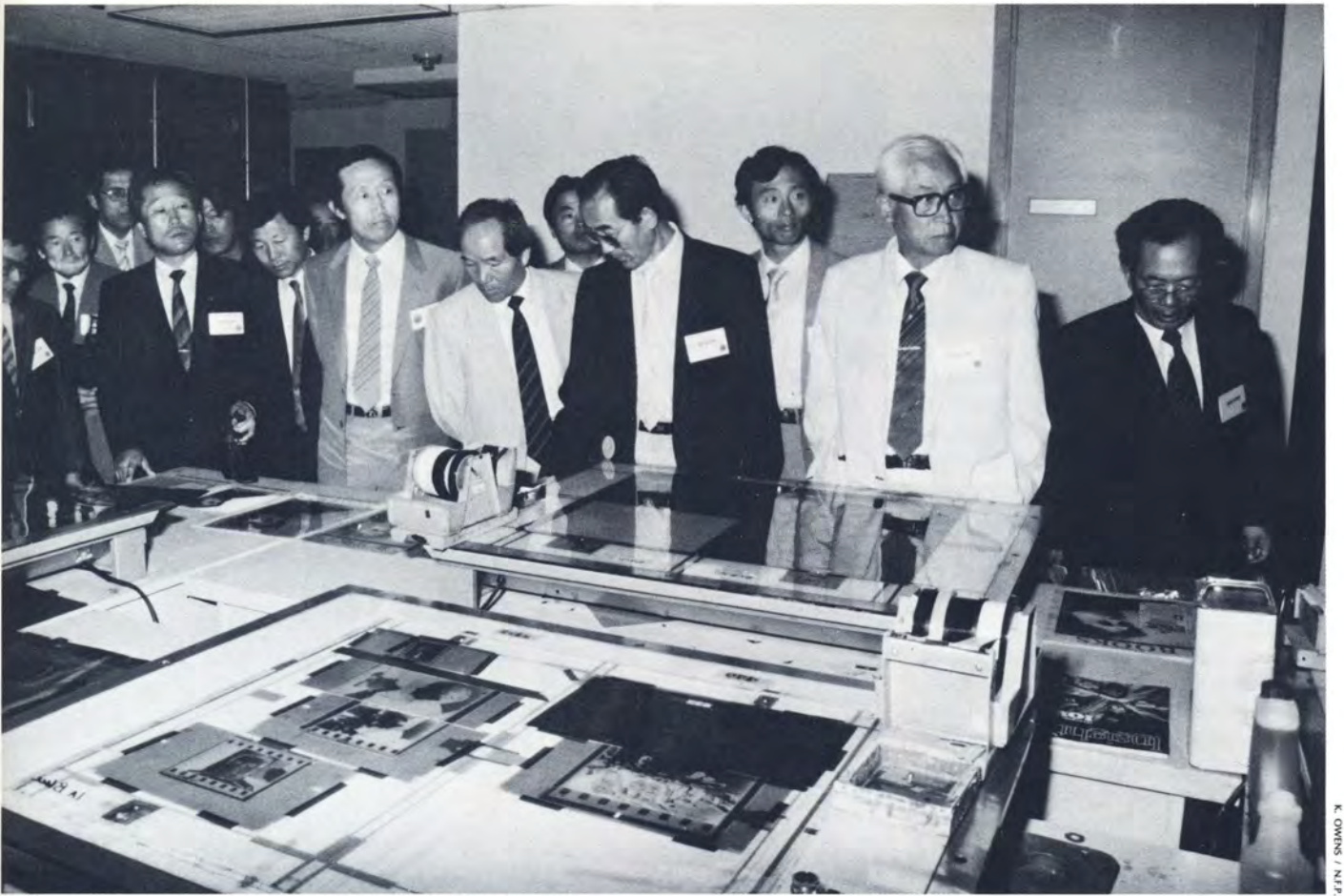
At the facilities of The World & I magazine in Washington DC.

Movement International (ACUMI). The speakers contributed to the development of the seminar theme of the responsibility of scholars in today's world, and they each indicated ways in which the various activities sponsored by the Unification move-