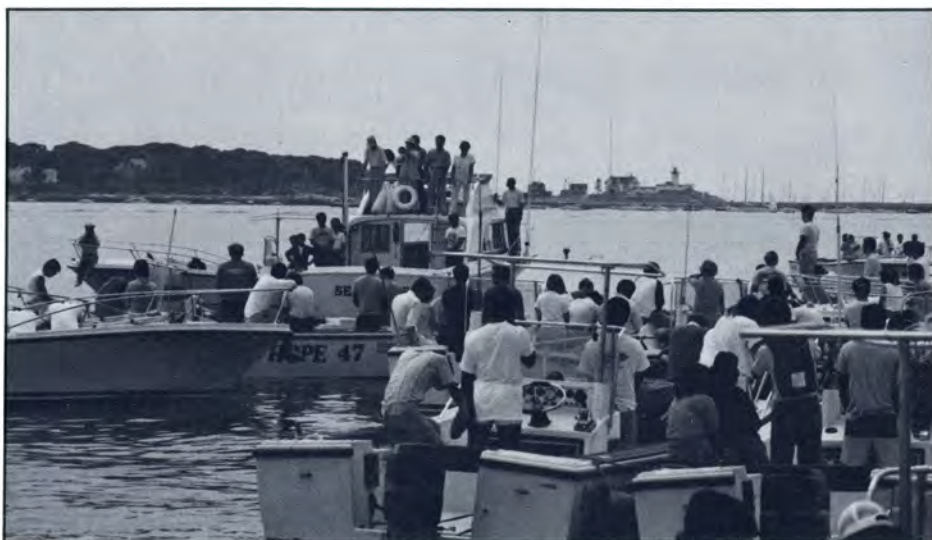
The fishing season in Gloucester officially began on July 2 with the blessing of the fleet.

On July 2, the blessing of the fleet inaugurated the beginning of the Gloucester tuna-fishing season. First we held a four-hour Il Jeung prayer vigil from midnight until 4:00 am.