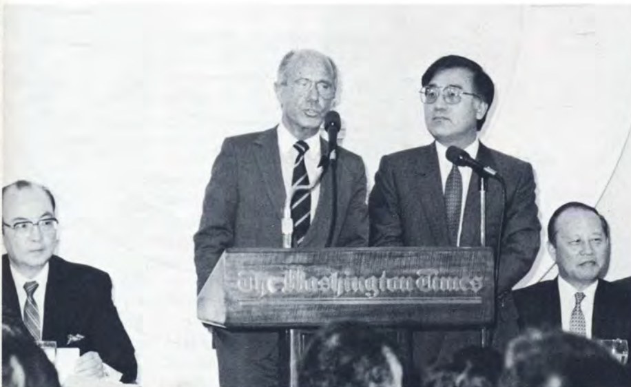
Mr. Arnaud de Borchgrave speaks about his experience as editor-in-chief of The Washington Times .