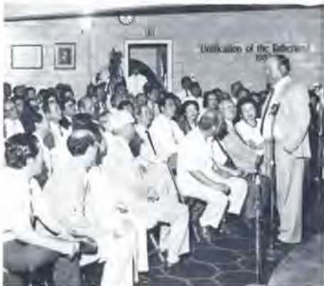
Korean professors' tour, p. 24