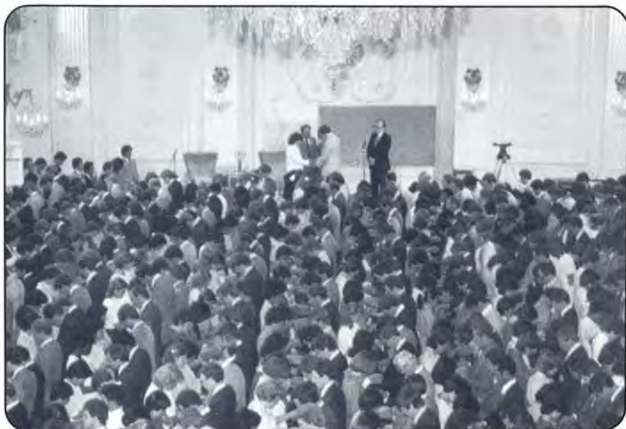
Holy Wine Ceremony, 1982

Visions of a warm smile and blushing cheeks Fair of hair and tall (like me!) She seemed as familiar as a fond memory Like a sister or an old friend Like a mysterious land fragrant and colorful, blessed with sheltered shores and balmy breezes Where from every storm I could anchor and find a home. And for one more couple God can cease to cry. □