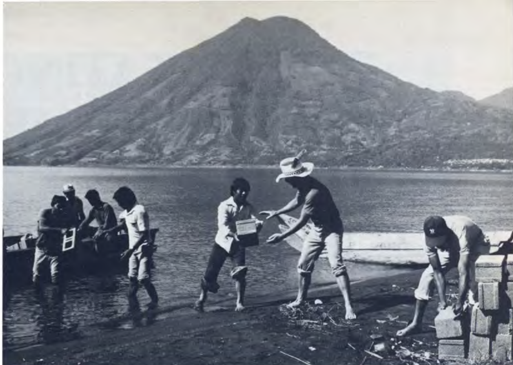
A cooperative spirit in an unmechanized land.

Besides the construction work in the villages, the students participated in many cultural events, including talks on the indigenous peoples, Guatemala's economy, and its new democratic government. They also experienced bargaining with Indians for bright handicrafts in the famous marketplaces. The program ended with a journey by airplane and bus to ancient Tikal, where the mighty Mayan empire, considered by many experts to have been on a par with the ancient Egyptian and Greek civilizations, had its seat of religious worship and government. Mysteriously, Tikal was abandoned, left to be reclaimed by the alternately singing and