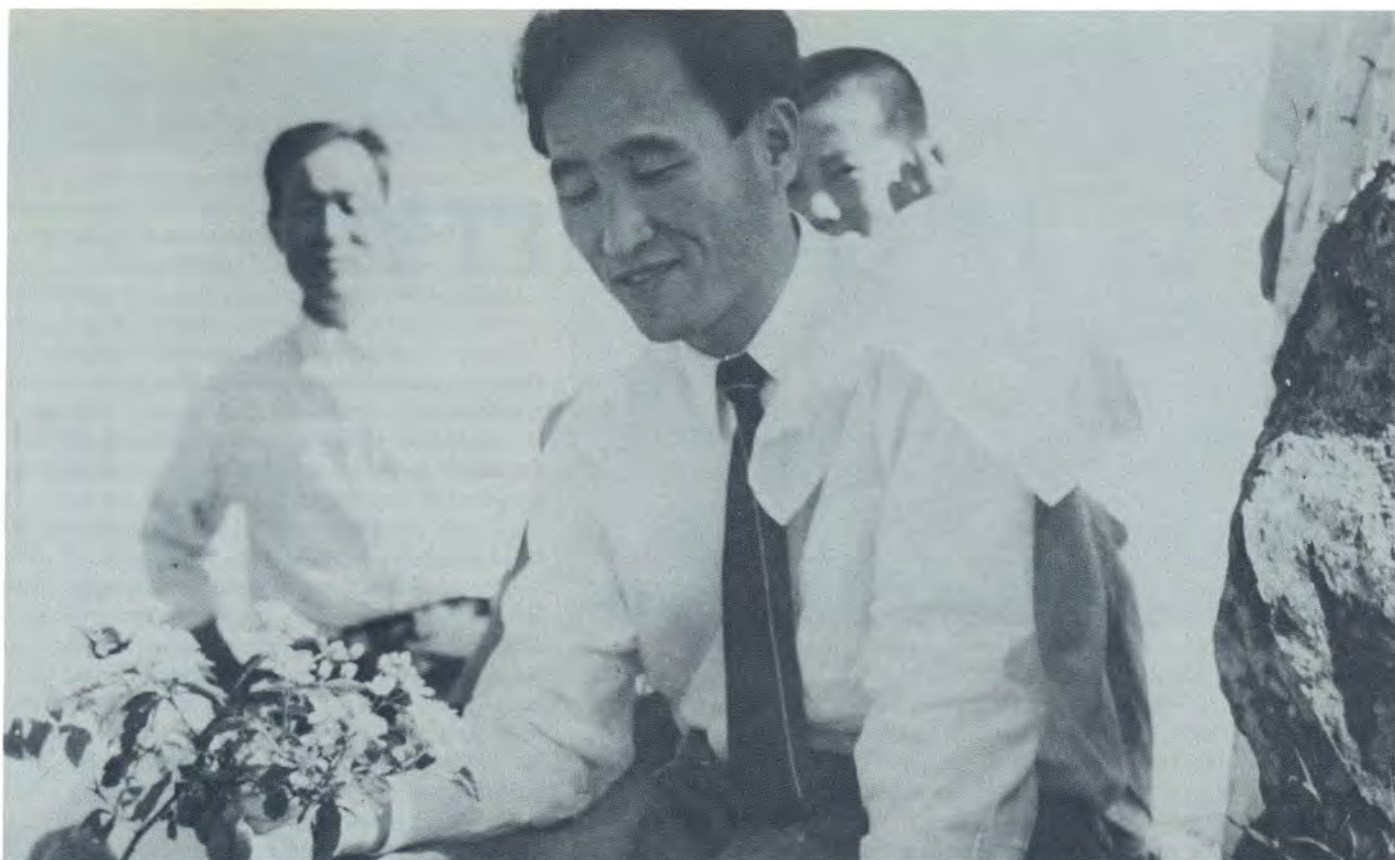
A butterfly perches delicately on the flowering branch Father is holding.

is important, but more essential is that, beginning as a small baby, they observe and take part in their parents' own life of attendance. They should see your dedication in holding morning service and prayer meetings with True Parents' photograph on your altar and should learn from you a life-style of attendance toward the True Family.