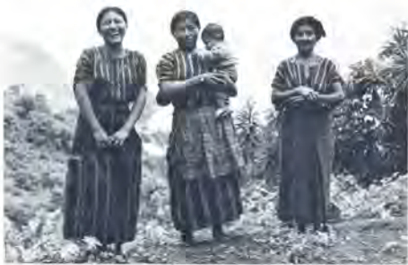
Serving the Guatemalan people, p. 36