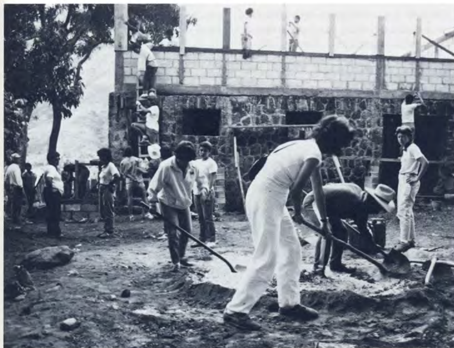
The construction of a building—using shovel, axe, and muscle.