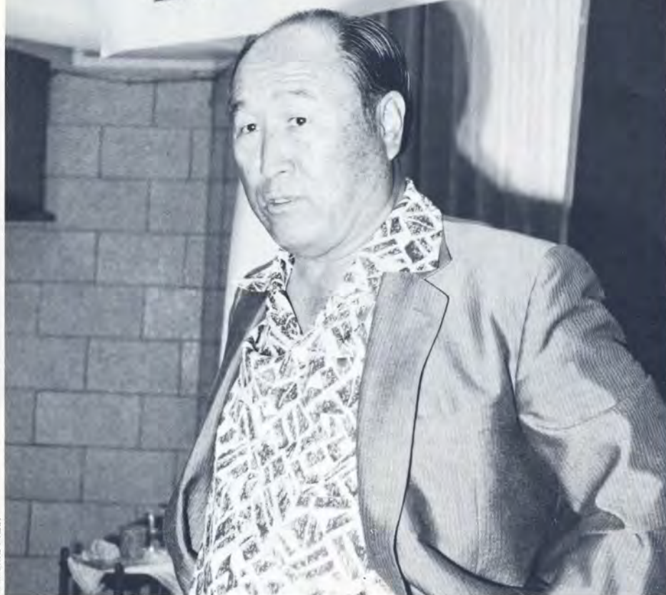
R. M. DAVIS / NEP

percentage-wise, in every other Blessing, but because there are so many of us, the problems are much more visible.) We are also the only group that is made up of two Blessings—the 2,000 and the 6,000. We face the challenge of helping each other identify with a group as large, widely dispersed, and diverse as we are.