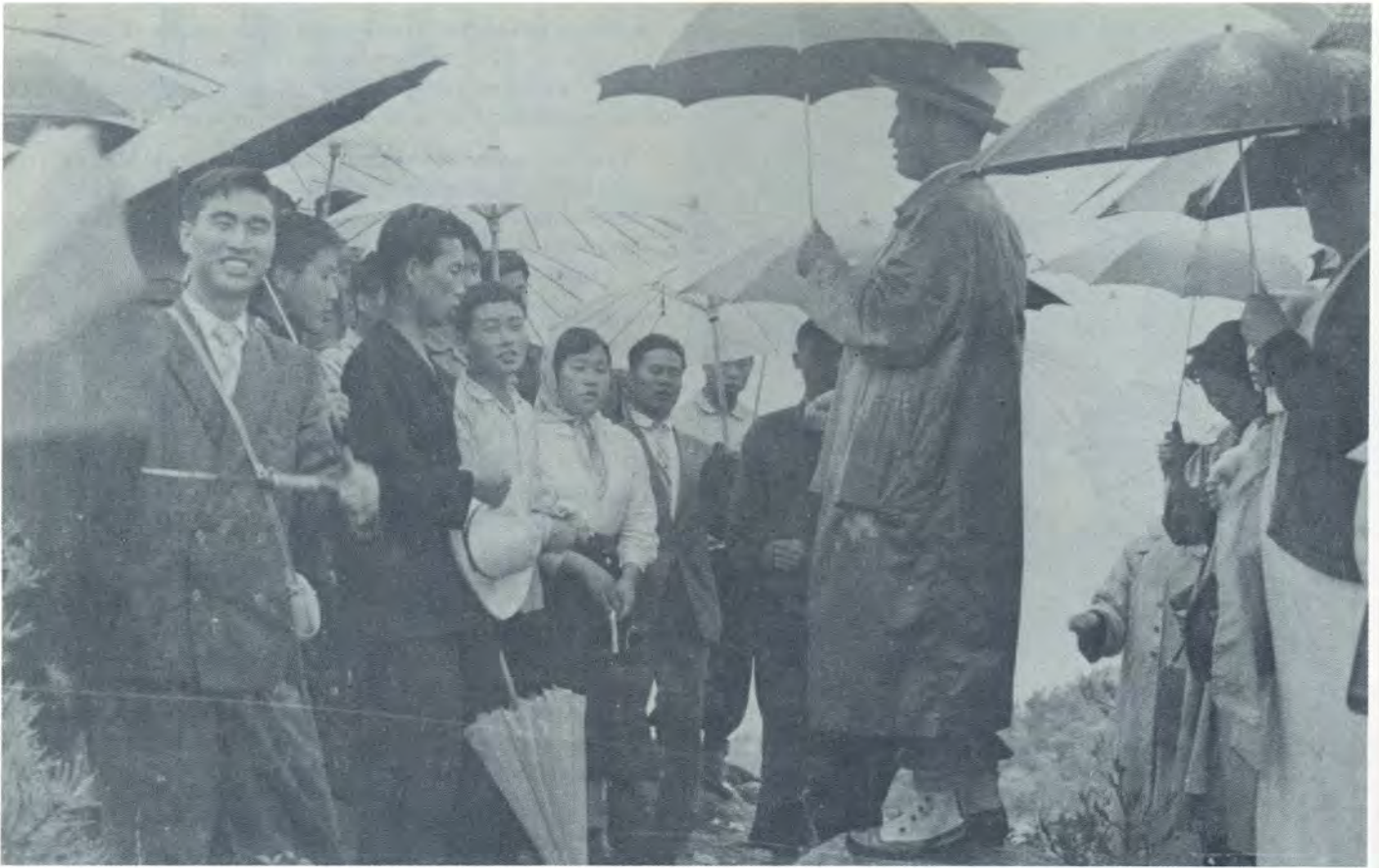
True Father leads a song at a prayer meeting in the rain with his early followers.

in church. However, Father would explain that sometimes human beings created very narrow church laws and regulations under the name of God. Since God's heart is broad, he said, God would not make a law against popular songs. He taught us that most important is our motivation for singing a song and who it is directed to. Most popular songs are about love—horizontal love. But why not imagine the words are relating to vertical love, our love for God? Because we sang such songs, we were persecuted by the conservative Christians. Father didn't care if we weren't following the traditional way. "They don't fully know God's heart," he would say.