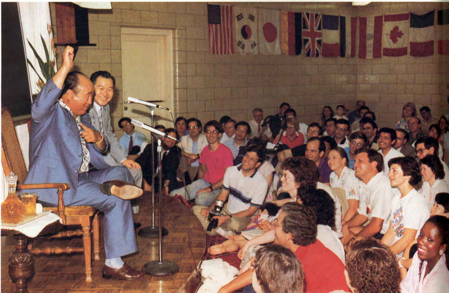
Father's visit was an unexpected delight for everyone who came to Belvedere for the 8,000 Couples' Anniversary Celebration.

No matter how much fallen man tries, he cannot reach God's side without God's help. Therefore, God has been desperately trying to help His children return to Him through the foundation of religion, crying out in anguish, "How can I liberate my sons and daughters?" But the many religions that have evolved are fighting each other instead of working together to bring everyone back to God. What is the purpose of the Unification Church? To