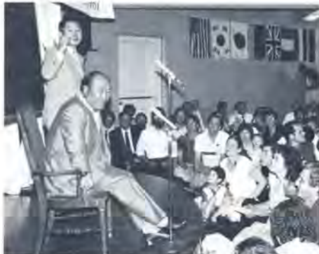
Anniversary of 8,000 Couples, p. 4