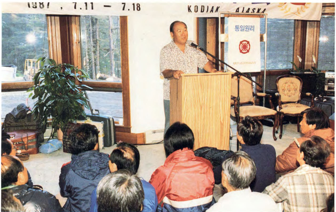
Father warmly welcomes the Korean professors to Kodiak, Alaska, the first stop of their trip.

T HE FIRST KOREAN PROFESSORS World Tour and Seminar, sponsored by the International Cultural Foundation (ICF), was held July 11-24, 1987, bringing together a group of 144 professors from major universities throughout Korea for a program that took them to Kodiak, Alaska, Washington DC, and the