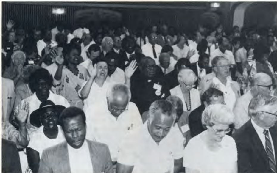
Ministers deep in prayer at Sunday service in the Seoul headquarters church.

7,000 people himself. That was his whole ministry, but not enough of the people accepted and followed him.