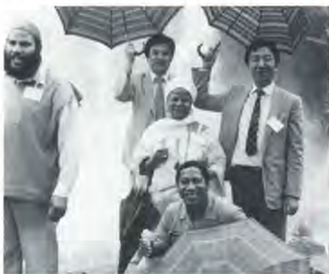
ICC—Fulfilling the dream, p. 41