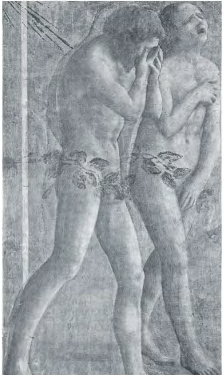
The Expulsion of Adam and Eve from Paradise," by Masaccio, 1427.

Because of the failure of Adam's family, God called Noah. Centering on Noah, Heavenly Father wanted to recreate the Garden of Eden. Noah's family was to absolutely unite with him, substantialize the four position foundation, and make a foundation of faith and substance so that the Messiah could come in Noah's family. But Heavenly Father's plan was