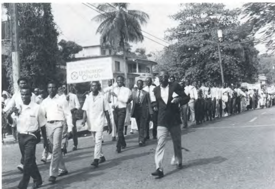
The Unification Church members leading the March for Christ through the streets of Monrovia.

Last October, a Christian group called The Full Gospel Businessmen's Fellowship International openly attacked our church, along with eight other religious groups, saying that we were not Christians, but instruments of Satan, and that they would see to our elimination from the country. They made this statement on national TV, on an "anti-cult" program they began to air every Friday at 10:00 pm. They planned to "tear apart" a different group every week. At the end of the second show, they announced that their next target would be the Unification Church. Three days later the Minister of Information appeared on national TV and warned this group and barred them from continuing to air