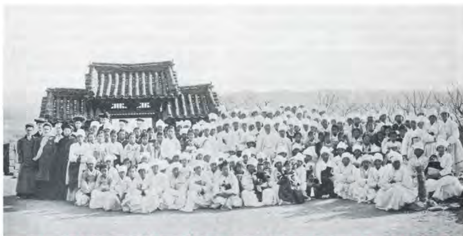
Members of a women's Bible college in Korea in the early part of the 20th century.

preacher. But there was nothing fanatic in him. After the meeting was over, he would kneel down on the floor and continue to pray. Many also remained with him and prayed. Maybe 15 or 20 would stay all night to pray. I was one of them. Perhaps around midnight, someone would stand up and speak in tongues,