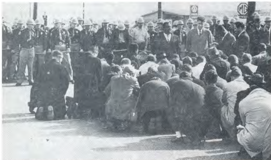
In 1965 in Selma, Alabama, at a civil rights march for the right to vote, Rev. Dr. Ralph Abernathy leads the marchers in prayer.

Catch the vision yourselves. Start talking it up. The Civil Rights Movement, I think, is going to be truly fulfilled in all its dimensions.