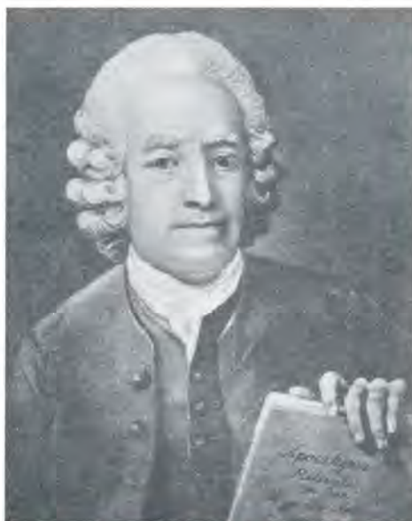
Emanuel Swedenborg, the famous 18th-century philosopher who communicated with the spirit world.

I finished five years of study, and upon returning to Korea, I began teaching at a women's Bible college in Pyongyang. Japan's control of Korea was becoming tighter and tighter. In time I was forbidden to teach the Bible, so I would often go to the famous