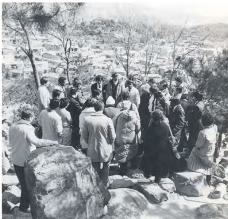
Ministers and members at the Rock of Tears, Pusan.

Fourth, Rev. Moon is a visionary who can dream dreams and put them into practice. I think it is obvious to anyone who studies Rev. Moon that he is totally dedicating his life to the accomplishment of that vision. And fifth, I also see that the members of the Unification Church and the ministers who have caught the vision, our alumni who are working with us, are also true believers in the cause.