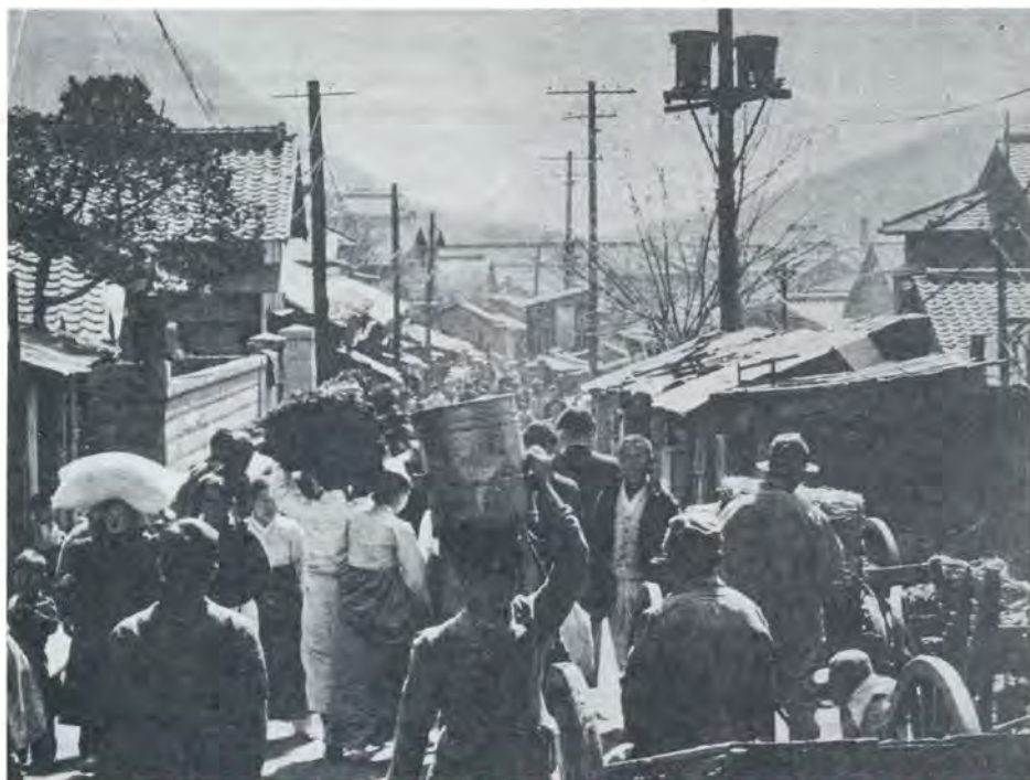
"I became quite ill from the water and living conditions in Pusan, flooded as it was with war refugees"—A street scene in Pusan in 1953.