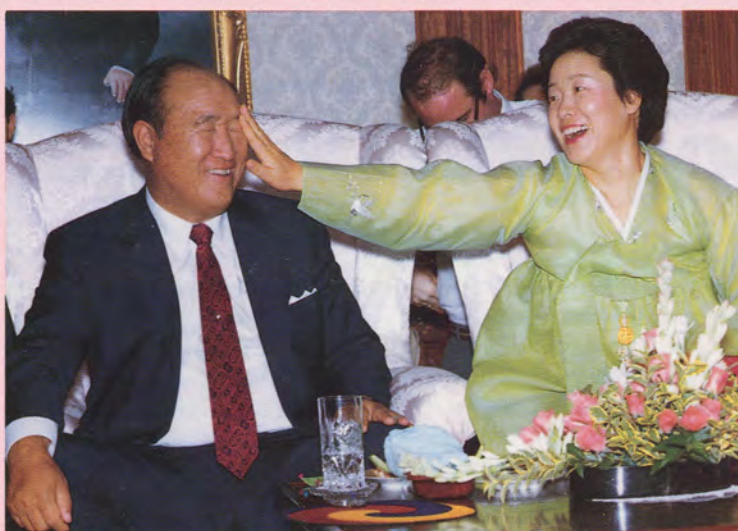
"Totally united as the Father and Mother of all mankind"--True Parents with church members after the Summit Council for World Peace, June 1987, in Seoul, Korea.