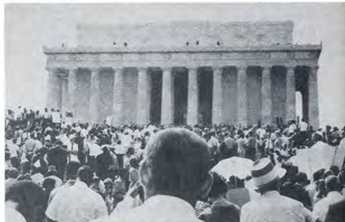
In August 1963 the largest civil-rights demonstration in America took place at the Lincoln Memorial in Washington DC. Disorder was expected, but the day proved to be an expression of hope.

The most educated minds from around the world are attending our conferences, sponsored by such groups as the Professors World Peace Academy, which has chapters in 72 nations. We also have the annual Science Conference, which brings scholars and scientists together every year, some of whom are Nobel Prize winners. The greatest thinkers in the world are coming together to discuss how to bring peace on earth, how to build the ideal world. And Rev. Moon isn't telling them what to think; he has faith that when they gather together for a purpose greater than their individual purposes, God will guide them to do the job right.