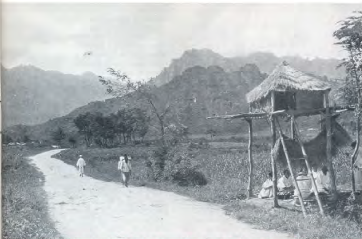
"I was forbidden to teach the Bible, so I would often go to the famous Diamond Mountains to pray" —The Diamond Mountains in North Korea.