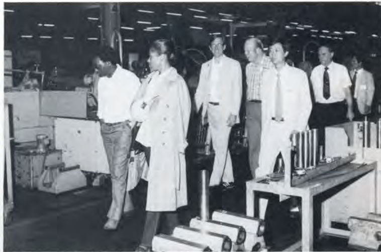
An ICC tour of the Tong Il machine factory.

we would go our separate ways and never see each other again because of our differences. But that won't happen anymore because we are realizing that we are all in this together for the same purpose, for the same cause, and that we