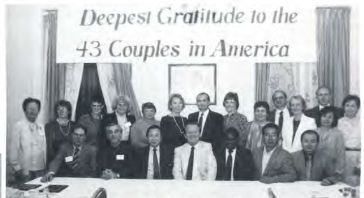
Above: Representatives of the 43 Blessed Couples in America are honored at a dinner on September 23, 1987.

Most of you are blessed. The Blessing is very significant because it is Father's true accomplishment. He has created the horizontal foundation for us to win this world back to Heavenly Father. The 36 Blessed Couples symbolize all the ancestors of the human race: Adam's family, Noah's family, Abraham's family. Based on the 36 Couples, absolute unity must come about to restore all the failures in human history. Two times 36 is 72. The 72 Blessed Couples signify the restoration of Cain and Abel. The number 120 represents the ideal nation. There were 120 disciples who gathered in the upper room to receive the Pentecost when the spirit of Jesus and the Holy Spirit came down. These 120 disciples prepared the spiritual foundation to reach to the societal, national, and global level. The 124