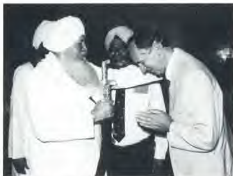
The history of the CWR, p. 26