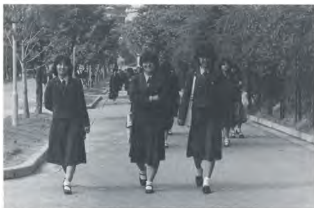
School girls in Seoul.