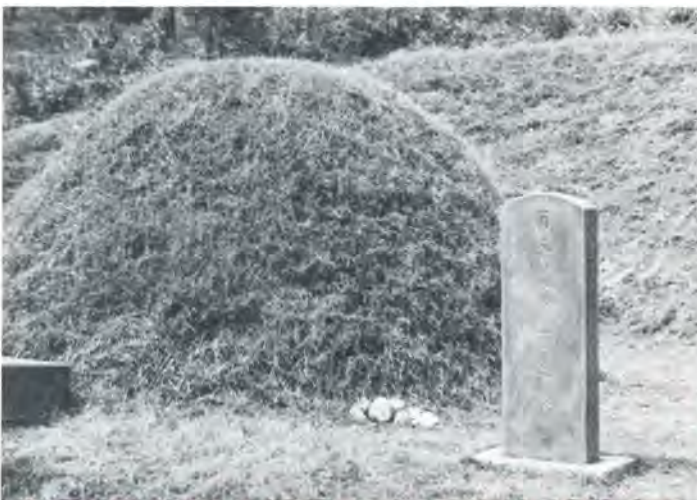
The Won Jun of Hae Jin Moon, second daughter of True Parents (born July 28, 1964, died August 4, 1964).

You all are Unification Church members. When you joined the church, you were supposed to liquidate all your satanic ways. But you are still living with your fallen nature because you are accustomed to it. Even those countries that stand on the side of