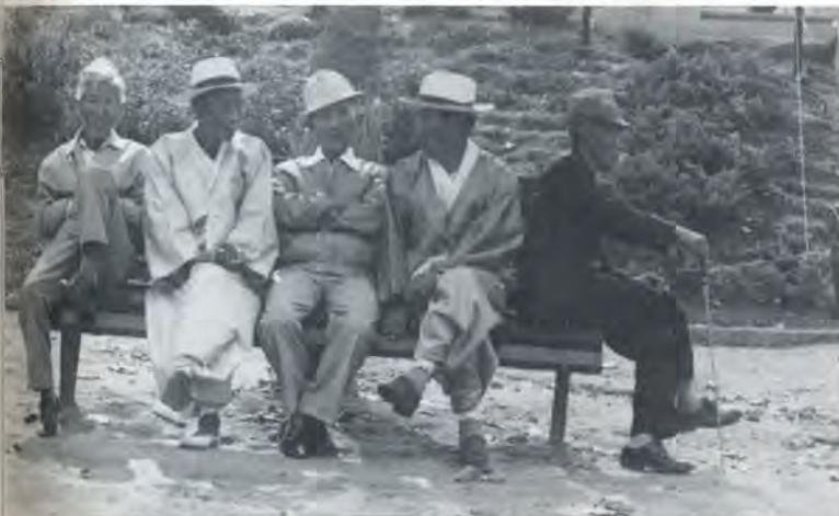
Five Korean men on one bench.

the events are held in North Korea, many foreigners will come into Pyongyang, and then the North Korean people will see the reality of the outside world. So the strategy of North Korea is to pretend that it wants to co-host the Olympics while not actually holding any events inside the country.