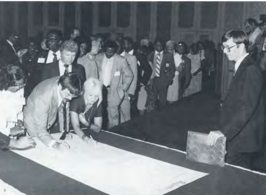
Ministers at the sixth ICC sign a proclamation of commitment to the goals of Christian unity.

I think most of you are aware of Rev. Moon's vision for what can be accomplished when 7,000 American ministers experience Christian unity through the ICC conferences. His strong belief is that God will then be able to intervene powerfully on earth. The number 7,000 comes from the time when God told Elijah that He had 7,000 righteous people prepared to receive him. Rev. Moon has told us that at the time of Jesus, God also had prepared 7,000 people ready to follow him. It was John the Baptist's responsibility to find them and bring them to Jesus, but he did not fully unite with Jesus, so Jesus had to try and find