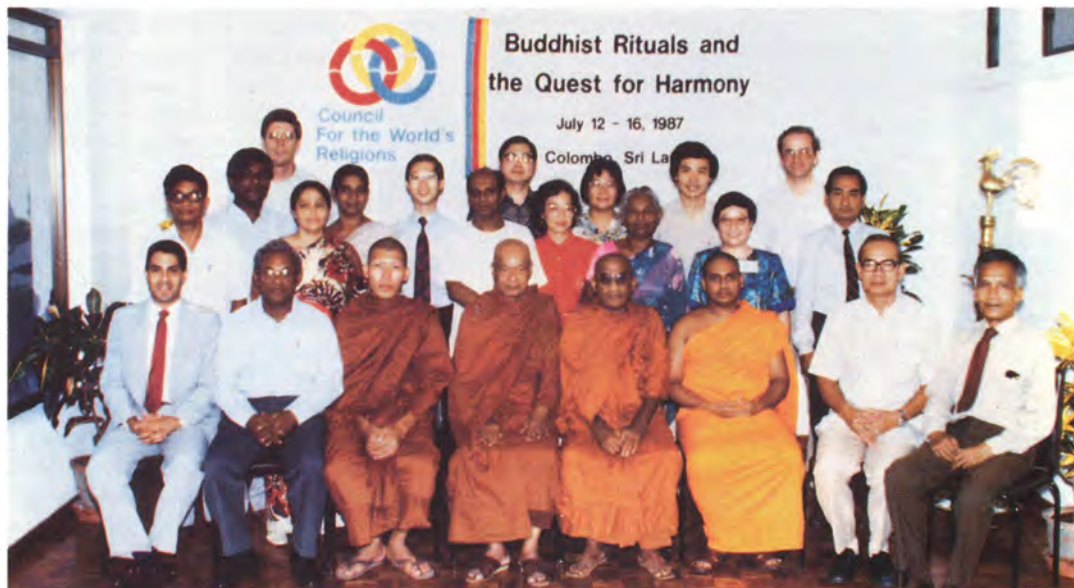
Group photo at the intra-Buddhist conference in Colombo, Sri Lanka.