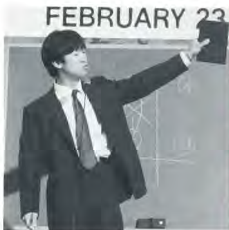
True Parents' Birthday speech, p. 10