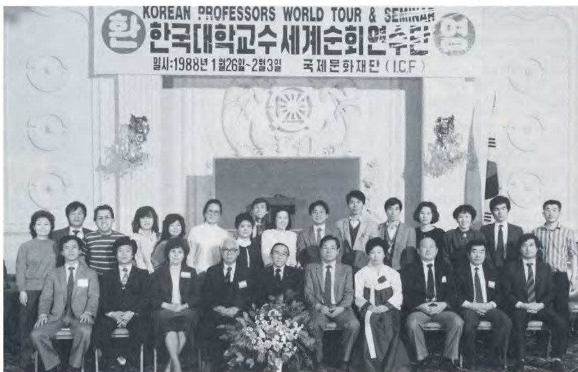
The staff of the Korean professors' tours.