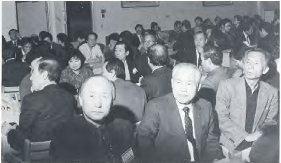
The Korean professors at a restaurant in Los Angeles.

in Korea, these three elements are being harmonized, and the professors are taking their part in this by speaking out to the public and by verifying the ideals of unificationism through their research.