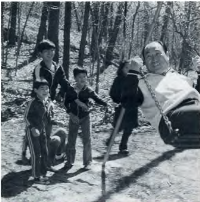
"Until we put everything we have into what we are doing, we cannot realize true joy."

The more we love, the more love and ownership will come to us. That is the living, daily philosophy of the Unification Church. When we practice this, we are guaranteed to be on the right path. Even if we do not realize where we are going, we are