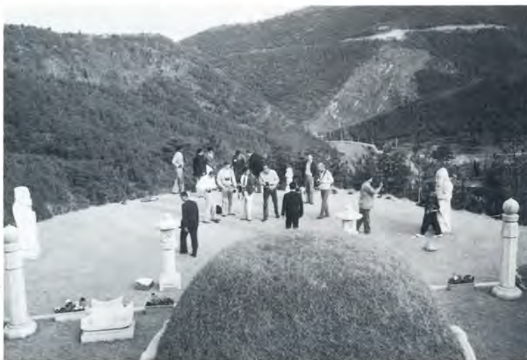
Brothers and sisters gather at Heung Jin Nim's Won Jun.

Then seeing Heung Jin Nim in person and getting practical internal guidance from him was a great blessing. We could see ourselves more clearly and begin to remove the gray areas in our lives and in our relationships with the ministers. His guidance has made my relationship with them, and also with my wife and family and with True Parents, much deeper.