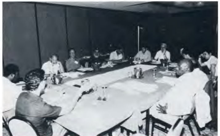
Religious scholars examine the nature of God at the sixth conference on God: The Contemporary Discussion, held in Key West, Florida.

What is true life? God is the center of life, and He invested His own life into the creation. That is true life. God invested Himself completely, not halfway. He did not keep some back.