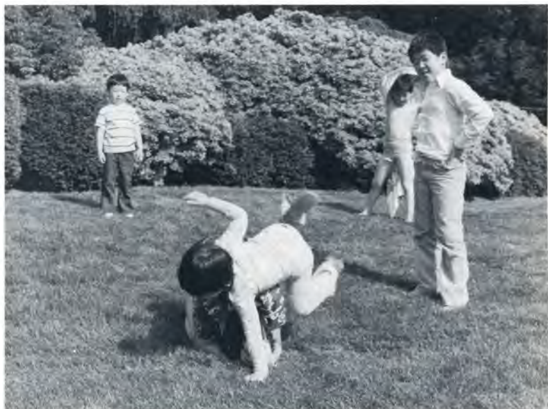
The True Children playing on the lawn when they were young.

When I was in middle school, I was third highest in my class. I was the captain of my football team and named Most Valuable Player (MVP). I was also MVP in lacrosse. All my team-