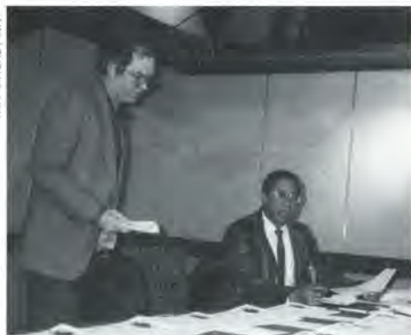
Korean ICC staff interviews, p. 28