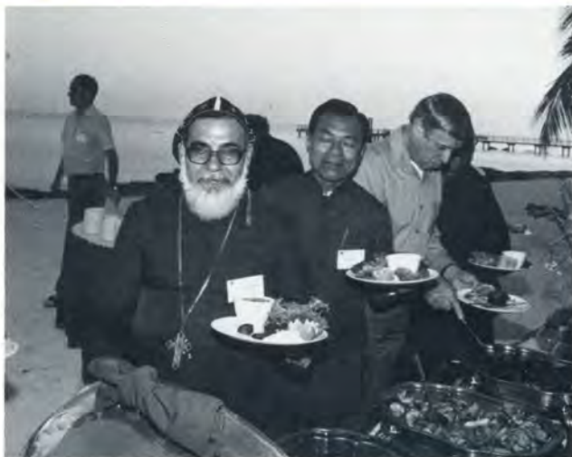
The closing banquet on the beach—"The good food and friendly company helped everyone unwind."

Tibetan Buddhist monk; on your left is an African philosopher. A Jewish rabbi and a Christian theologian sit in front of you, while the sound of an ancient sacred Zoroastrian chant fills the air. Each morning you attend a different kind of worship service, and each day you hear and discuss a vast range of ideas in your groups. In one group an Indian participant describes the physical and spiritual aspects of a pilgrimage to a Hindu holy shrine. In another group, a Sikh leader responds to the challenge that Darwin's theory of evolution presents to his religious worldview. Over a meal, you quiz two South African theologians, one black and the other white, concerning the plight of their country. Both express a burning desire to help create the changes necessary to avoid violent confrontation in their nation. These multiple daily experiences teach you to expect the unexpected. The dynamics of the interrelationships make the exchanges of the conference much more