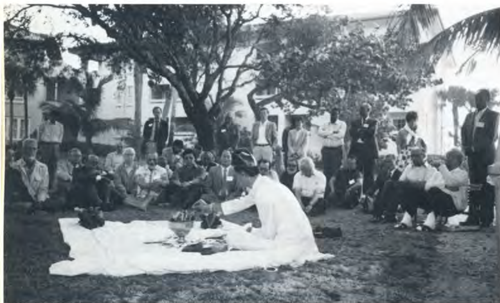
Morning worship given by a Zoroastrian priest.

In addition to religious diversity, each culture of the world sees the realm of the sacred in different shades and hues. For example, to most East Indians the cow is a sacred symbol to be venerated because of its quality of contentment, a sublime virtue in the predominantly Hindu culture. Because of its sacredness, it must never be eaten. To the Korean farmer, the cow is also highly respected, but for very different reasons: It offers all parts of itself to serve man. The milk is used as a drink, the hide becomes clothing, and the flesh gives food to sustain life. To use another illustration, when a Kenyan herdsman reads the tales and trials of the herdsmen of the Bible, such as