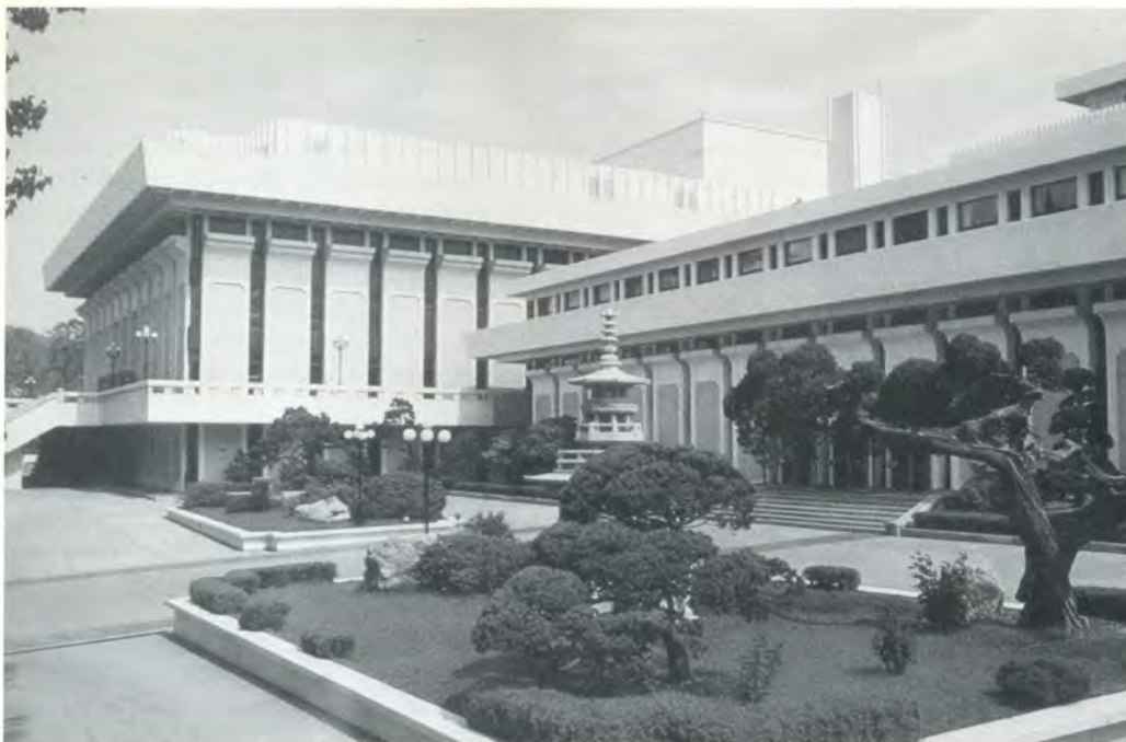
The Little Angels Art School and Performing Arts Center, Seoul, Korea.

tending regular classes at the school. Most of the students in this group are now in their second year of the Little Angels High School.