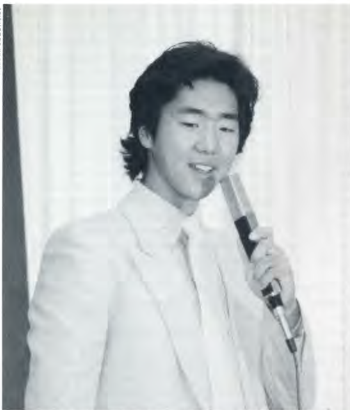
"I'd like to hug all of you, but I don't have arms big enough!"

True Parents have been suffering too long. Father has been walking this 40-year course all alone. It's time that we as their children really vindicated them from their immense suffering. To me, what is truly valuable is to vindicate my parents from being misunderstood. That's my own conviction, and it's the conviction of all my brothers and sisters, too. How about you? They are your parents, too. When I was going through some of my old books and papers, I could see that in the past I really didn't know about my own Father's life. As I read about his life, I felt so many tears. How could I be so blessed to have such great parents? I felt so unworthy to be their son! But I'm not going to stop there. I'm going to try to be worthy! Do you think that just because you joined the church you can be called a son or daughter of True Parents? You have to become worthy. You truly have the greatest parents. My conviction is getting stronger every day. Yours has to, too. That's your five percent responsibility.