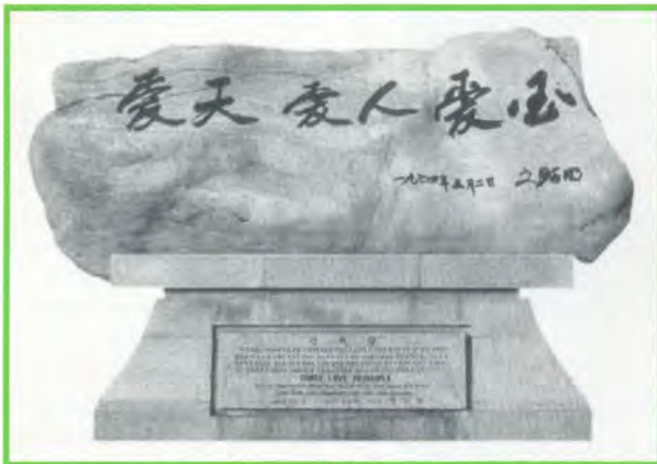
This rock on the grounds of the Little Angels School is inscribed with the school motto, which was given by Father: "Love God, Love Mankind, Love Your Country."