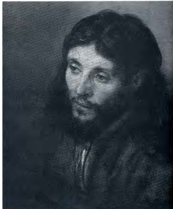
"You can see Jesus' spirit all throughout the conferences. Many of our members who come here gain a deeper relationship with Jesus than they ever had before."

This conference, I feel, is truly Jesus' pride and joy, his offering that he can give to Father. I know Father gives Jesus the credit for bringing the ministers together.