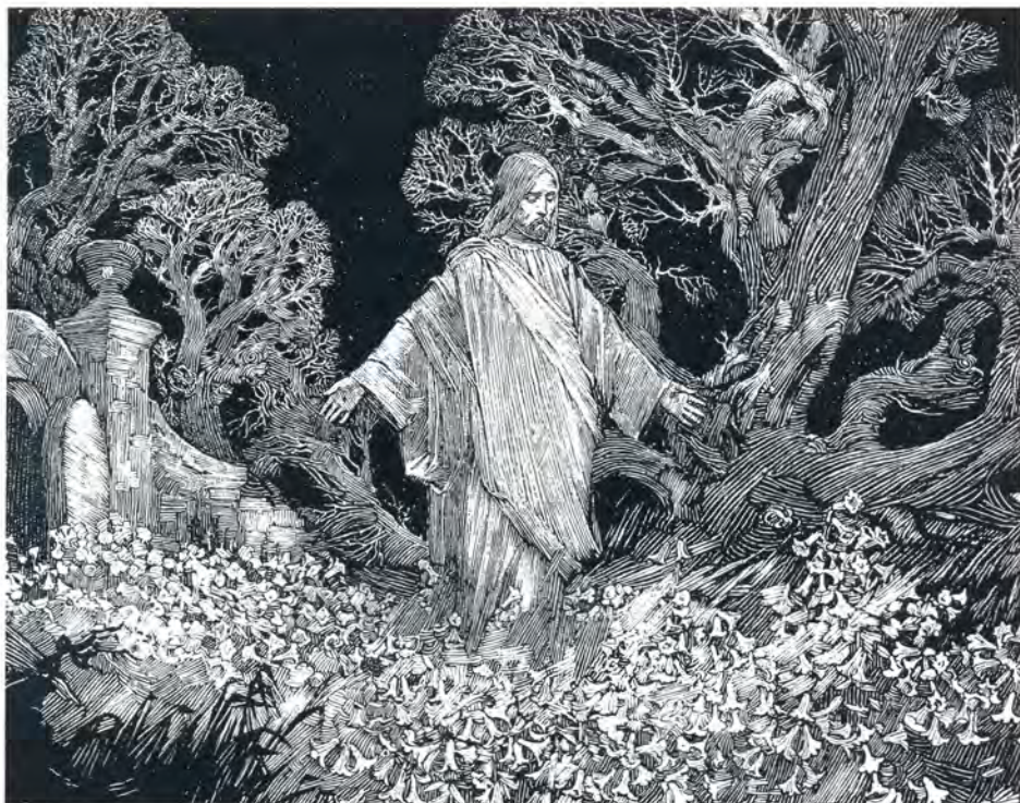
"The Lilies" by Franklin Booth.