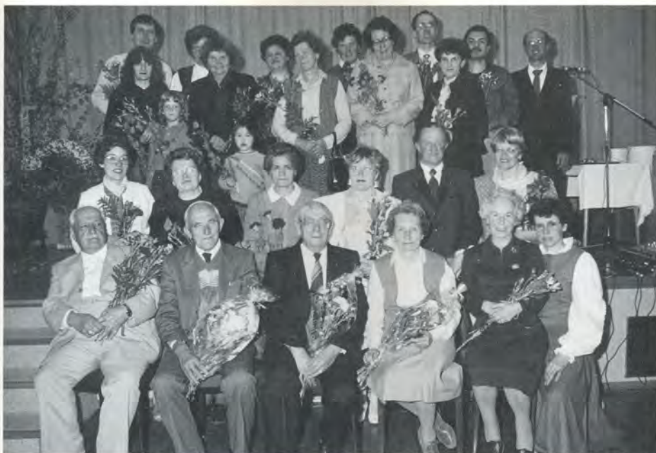
Flowers and gifts were presented to all the birthday guests of honor.

experience was could be illustrated by one elderly couple's request to the photographer: "Please send us a picture in memory of this celebration—whatever the price may be!"