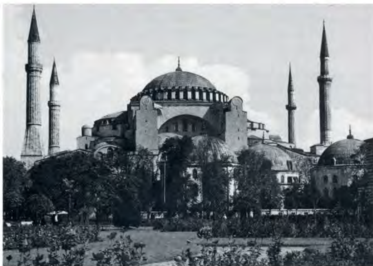
Above: The participants visited the Church of St. Sophia in Istanbul, once the central church of Christendom, completed in A.D. 537.

Bishop of Johannesburg, South Africa, a close associate of Nobel Prize winner Bishop Desmond Tutu; one of the founders of the World Congress of Faiths, a leading interfaith organization; an advisor to the Archbishop of Canterbury on Interfaith Affairs; and several other of the most influential thinkers in Christian theology and philosophy of religion today.