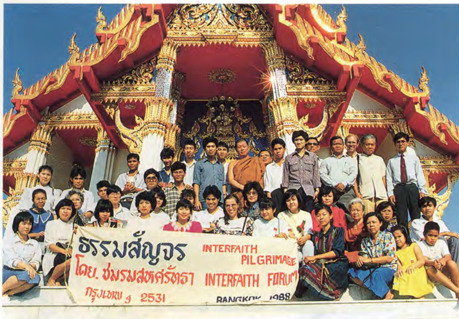
The highlight of the second Interfaith Pilgrimage was a visit to Wat Thammamongkol, a huge Hinayana Buddhist temple.

On December 19, 1987, we organized the first Interfaith Pilgrimage. I originally planned this project only for home members and associate members of our church and for people in my hus-