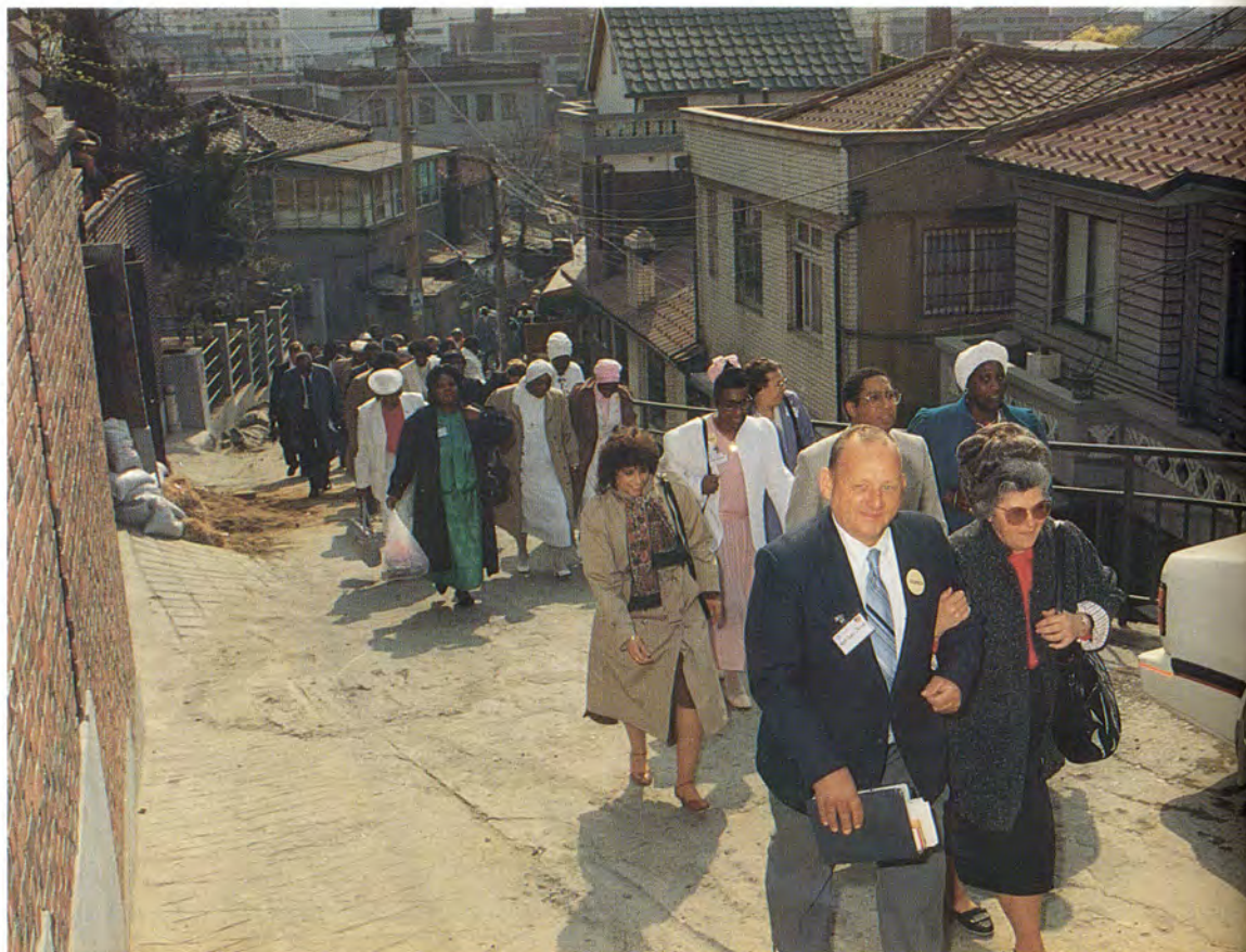
Ministers at the 31st ICC walk up the hill to the Old Chung Pa Dong Church in Seoul.