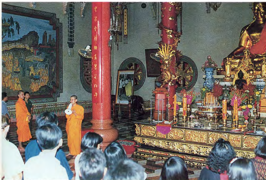
A guided tour of a Mahayana Buddhist temple in Bangkok during the first Interfaith Pilgrimage.

I have found interfaith work to be very effective for our home church work. The Thai people, who are 95 percent Buddhist, generally have a negative impression of Christianity. If the people have the opportunity to learn about the variety and beauty of all the religions, their hearts can gradually open to receive the unifying understanding of the Principle. □