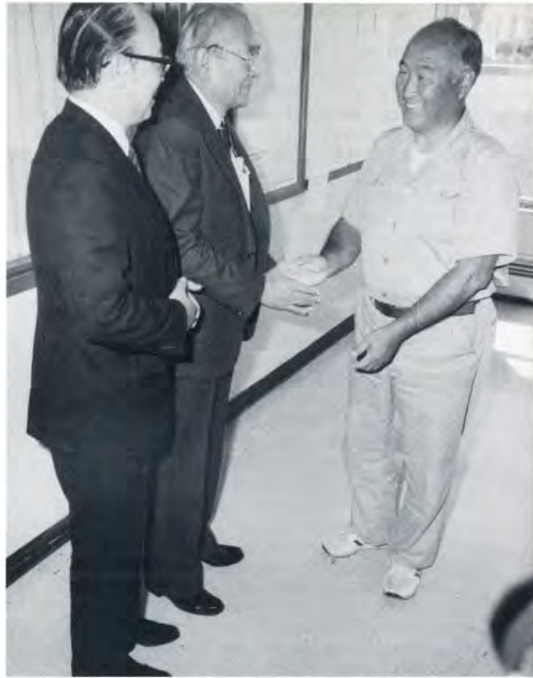
Father shaking hands with a Japanese journalist who interviewed Father in Danbury.

After the verdict, everyone in Father's entourage started going out the exit, but Father suddenly left them and walked across the courtroom toward the three prosecutors. He put out his hand. The assistant prosecutor mechanically shook hands with Father, but neither of the two main prosecutors would shake hands, although Father stood there smiling warmly with his hand out-