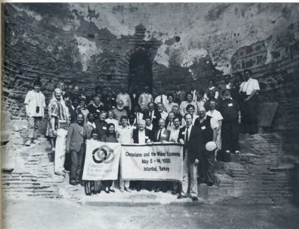
Participants of CWR's third inter-Christian conference gather at the Nicaean Church near Bursa, Turkey, where Christians held the seventh Ecumenical Council in A.D. 787.