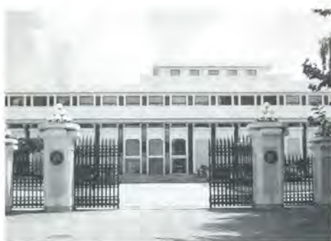
Blessed children study in Korea, p. 20