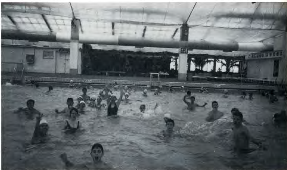
"The whole dormitory was one, so I took all 45 blessed children swimming. As we played games in the water I felt incredible heavenly joy!"

I began to cry and cry in regret that we didn't had more blessed children, so that Heavenly Father could experience much more happiness with His children.