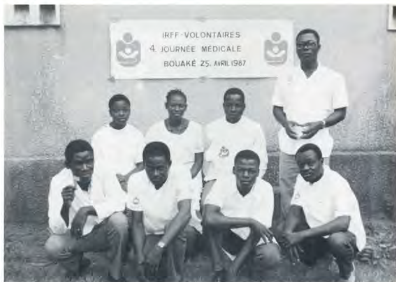
IRFF volunteers for the national immunization project.