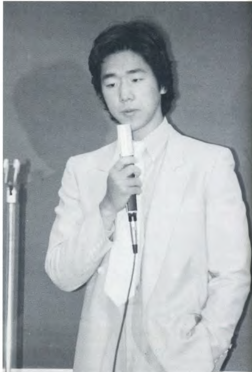
"My soul, my life, and my breath exist for True Parents."

To understand your purpose as Unification Church members, you have to understand that the root of the fall was individualism. If the archangel Lucifer had said to himself, "I do not exist except for the sake of my God," do you think the fall would have happened? If Adam and Eve had had an absolute