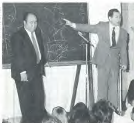
Father speaks at Belvedere on April 1, p. 4