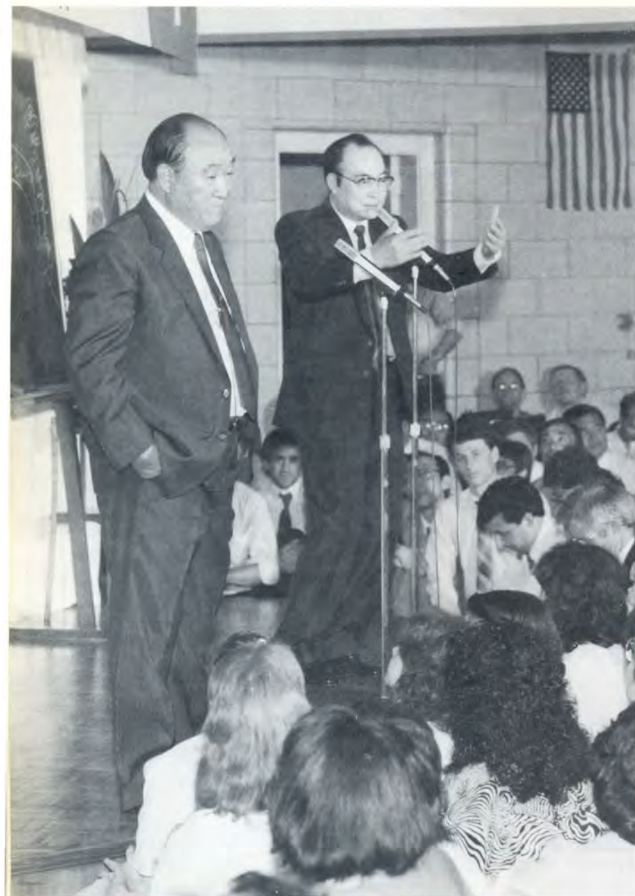
Father speaks to the members at Belvedere on the Day of All Things . . .

creates a vacuum. That kind of person will attract true love. When there is true love, there is no disunity; only unification and harmony prevail.