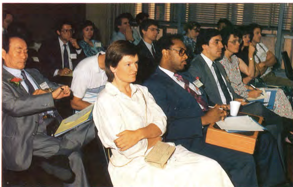
Divinity graduates and guests attend the first conference of the Unification Campus Ministers Fellowship on June 6, 1988.