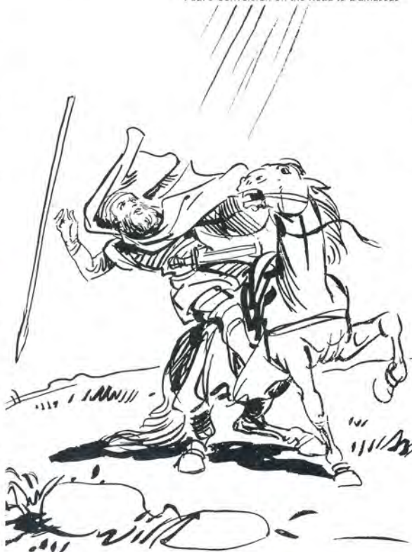
"Paul's Conversion on the Road to Damascus"

"From an extremely evil position, Paul came completely around to God's side. So you have absolutely no excuse for not changing."