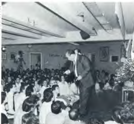
Father on the Day of All Things, p. 4