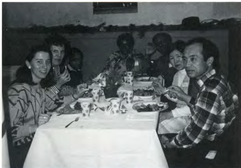
Members and home church neighbors enjoy the international meal.