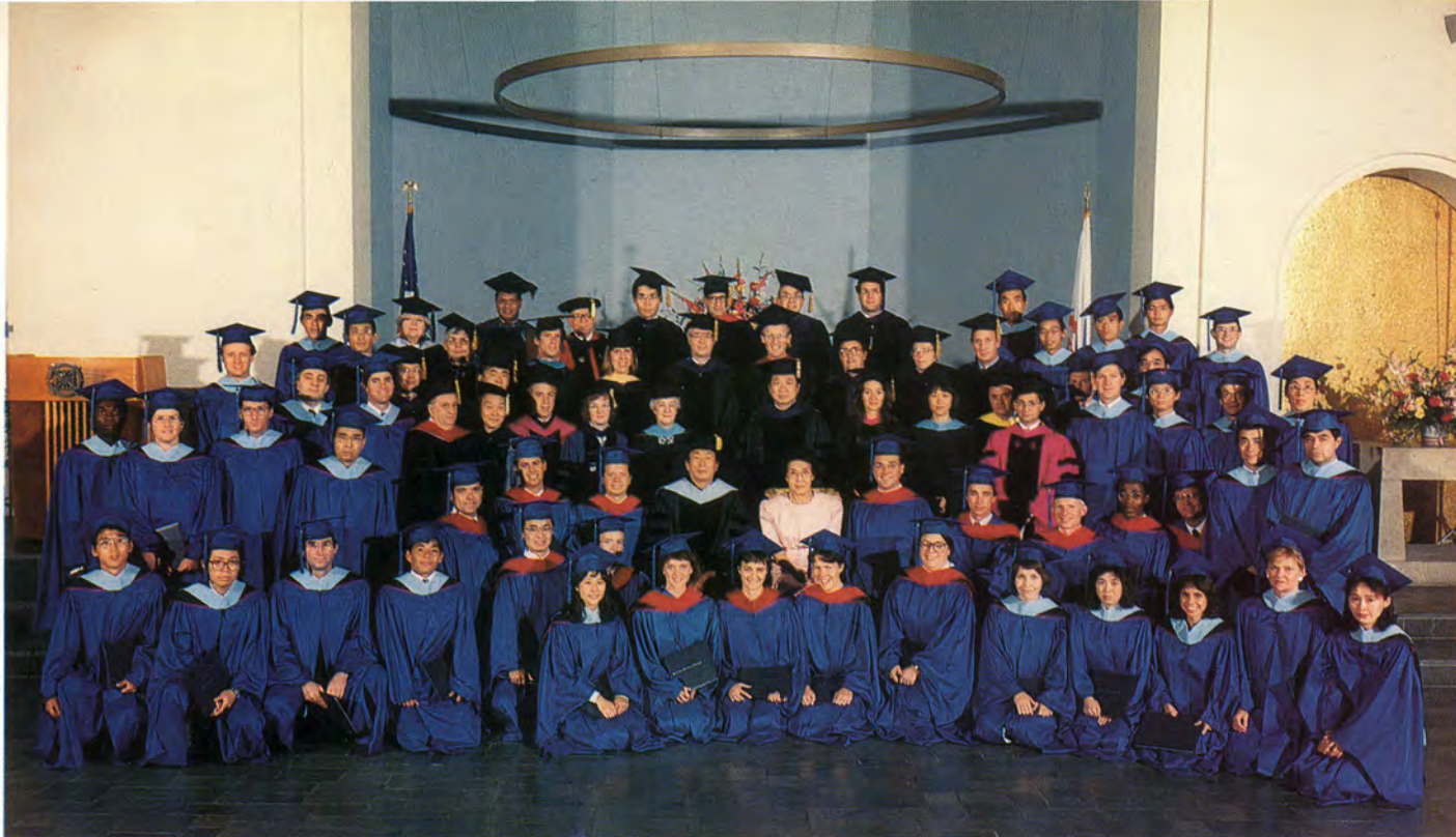
Forty-seven students graduated from the Unification Theological Seminary on June 30, 1988

be simply ministers, leading secluded lives, but men and women who will save this nation and world according to God's will and plan for restoration.