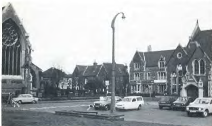
"I learned all about the struggles and persecution we have to go through in a rich area."

While I was visiting my houses, a young Anglican priest watched me every day. Finally he came to me and said,