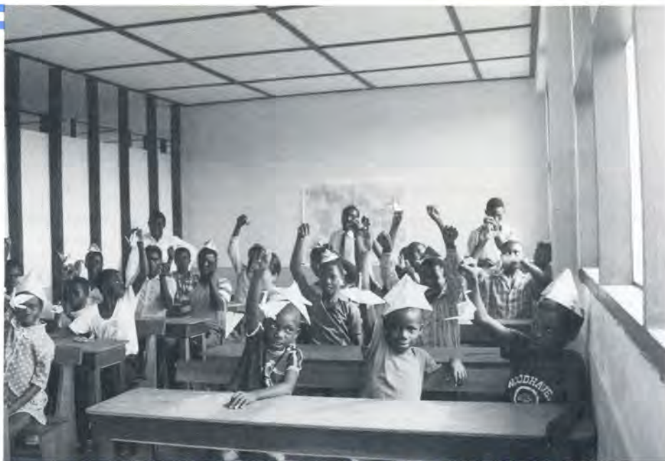
"With God's guidance, more and more children will be able to attend and grow."

In the years to come, we want to build additional classrooms as well as begin a complete system of grades one through