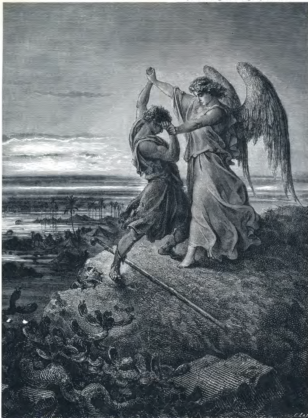
"Jacob was the first person to succeed in subjugating Satan."

You have committed yourselves to these 21 days. You know the meaning of this course; therefore, you have to be responsible to keep your commitment. You agreed to go the whole course. So are you going to live up to your commitment or will we find you "doing your own thing"? If you never seriously commit yourselves, you will become irresponsible and lose your value. How can you hope to become perfect if you cannot demonstrate the commitment and responsibility God is looking for in these 21 days?