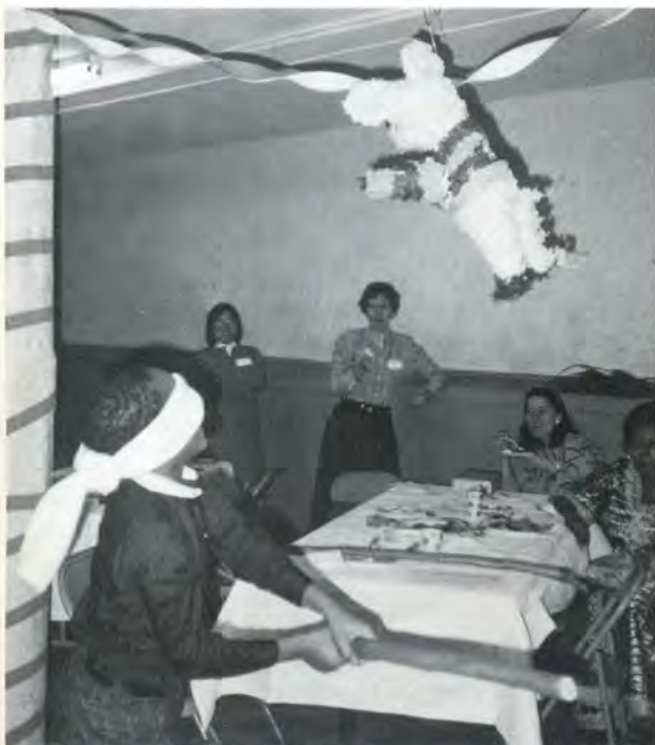
A child swings heartily at the candy-filled piñata.