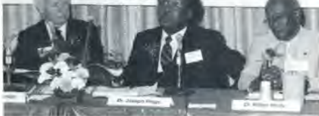
Developing campus ministry, p. 24