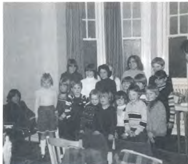
"I wanted to help the ministers fulfill their mission to truly care for their people."

ened to make his big dog attack me. I tried to visit him every day to resolve this conflict. His wife always told me, "Don't come here! If my husband catches you, he'll set our dog on you!" One day when I went to visit the house, he