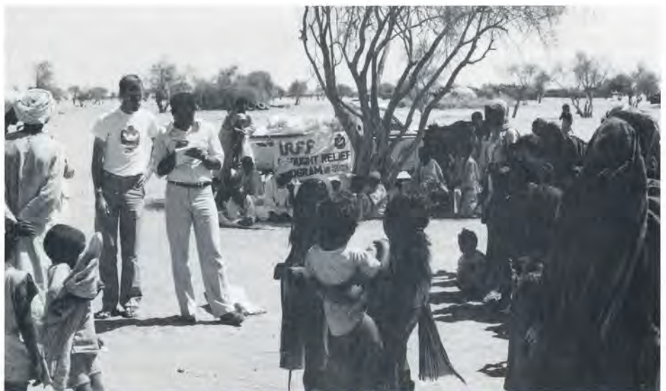
IRFF's 1985 drought relief program in the Sudan helped thousands of starving nomadic people.

It's very important to recognize a person's good points, but beyond that, it's important to stimulate his original good nature and let it come out.