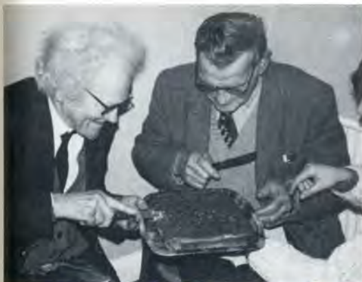
A homemade cake--the way to a person's heart.

A note in our July issue stated that a subscriber's change of address should be sent to Today's World Subscription Department. This is in error. Notification should be sent to: Accord, c/o Subscription Department.