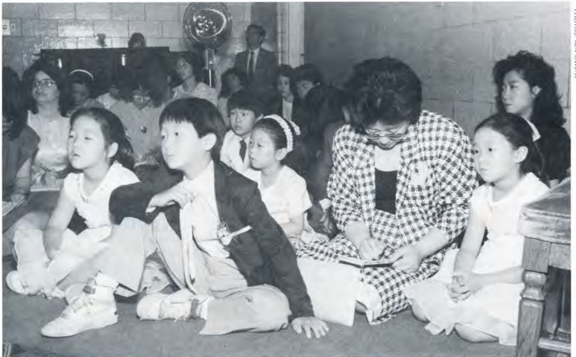
... as Mother and the True Children listen intently along with the members.

The world is destined to become one—there is no question about it. In order to become one, you need a central axis around which to become one, a core ideology. I have come to the conclusion that the core ideology must be the true love ideology. Those who are trying to make themselves a vacuum, emptying themselves out and living and breathing for the entire world—those are the kind of people who shall prevail and unify the world.