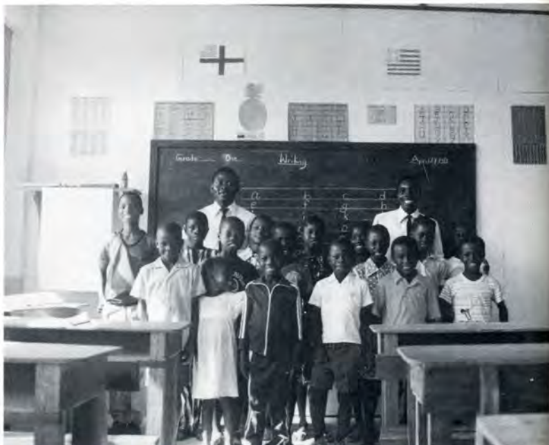
Happy students at Kpanyan Central School in Kabada, Liberia.

We reminded each other that what really counted was our sincerity and heart, and that it was always better to start from a humble position.