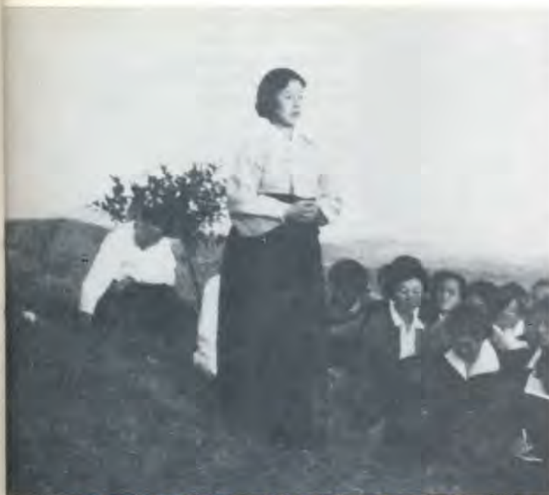
"The most painful thing was that Mother could not complain. That was her test. She had to indemnify what Eve had done 6,000 years ago."

way, and she certainly never expected to marry somebody who was more than 20 years older than she was. Mother related to us that when she looked at Father's face, she saw the face of her uncle, and because of that she was able to accept Father more easily. You can't imagine how difficult it must have been for a 17-year-old girl just coming into womanhood to marry someone more than twice her senior! That was pretty difficult and amazing in itself, but more incredible was the great persecution she endured following her marriage—unknown, I think, to all of you. There were many elder sisters in the church who had received revelations that they were to marry Father and become True Mother. They really believed this with all their hearts. When the real True Mother was chosen, nobody could believe it! They said, "Oh my God, she's only 18! She doesn't even know the Principle! What is she doing here!" They despised Mother. None of us can understand how much Mother persevered and how much she went through to achieve the position of True Mother.