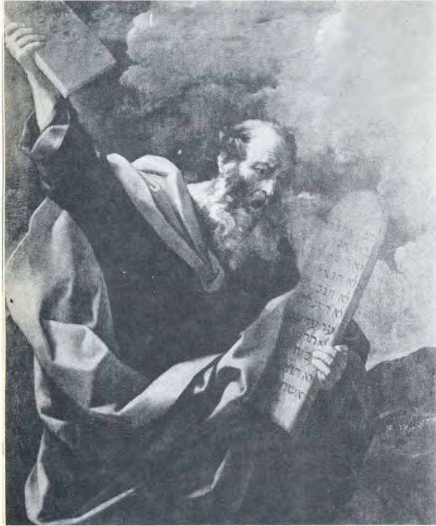
"Because the Israelites did not feel responsible, Moses had to bring them the Ten Commandments while they were still in hell."

what I mean when I say you have to die many times. You have to sacrifice and give yourself.