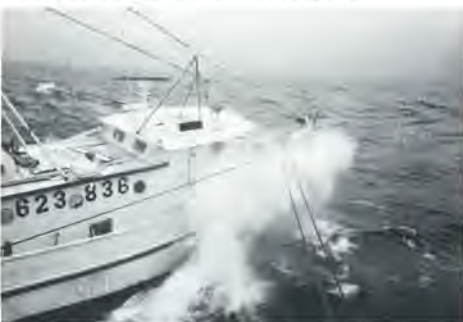
Ocean Challenge '88, p. 29