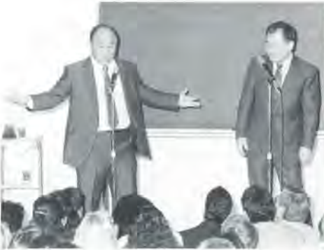
Father's speech, p. 4