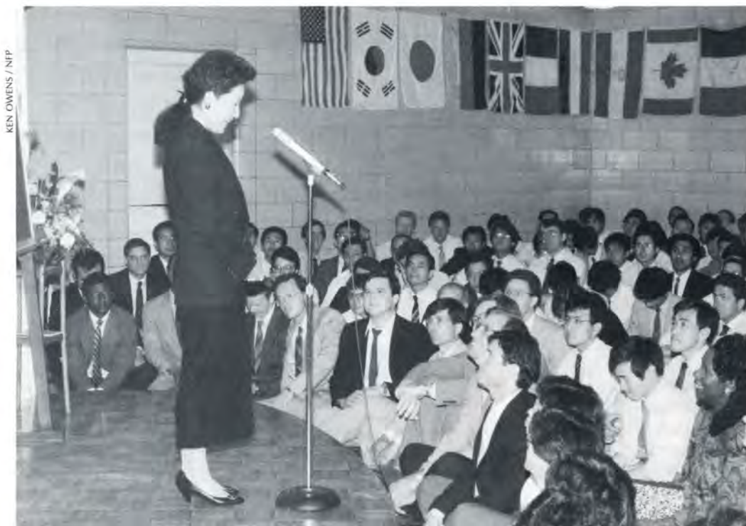
"It is in humbling yourself that you gain and maintain true love."

spect is bowing your head. But if your heart is not connected, then everything you do is meaningless. In our church, we have Parents, leaders, and the members. Leaders stand in the position of number two—such an incredible responsibility to carry out Father's desires and to be totally united with True Parents. I feel sorry for them. Please support them. They are the ones who tell you what Parents want, and you must be totally united with them. That is the only way we can do what True Parents are asking us to do for the world and for the cosmos. If you are