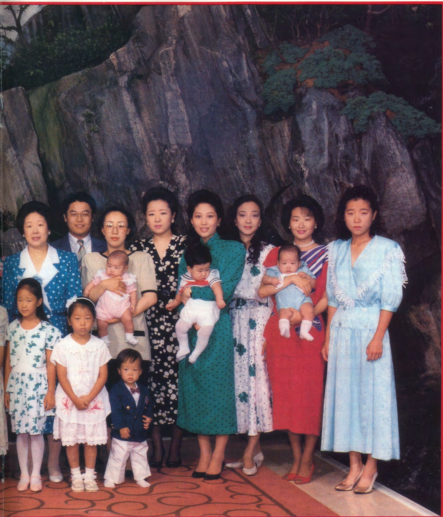
This family portrait was taken in the solarium at East Garden. The room was designed by a famous Japanese landscape artist to include the natural rock formation seen behind and to the right. This is the first time a pre-existing formation was included in the building of a room. In the spring it is covered with flowers. There is a waterfall and pool with carp in it around the edges of the room. The wall painting on the left was done by Mr. Wabe.