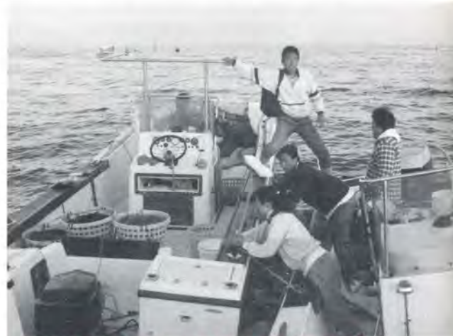
Transferring various materials from one boat to the other, Ipswich Bay.

and internal success. For now, our successes can be seen in our determination to fulfill the providential vision Father has for us and to resolve the difficulties and differences that are evident amongst us: the old and the new, the second generation and those who are endeavoring to pass from the old