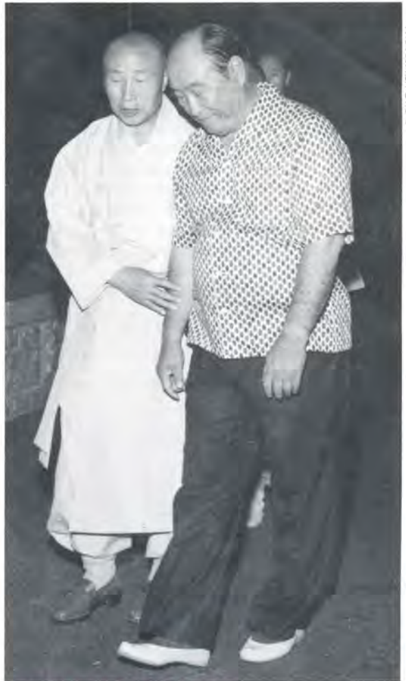
Buddhist monk strolls with Father.

Chun Doism leader realized that Father has been fulfilling that very thing which they have been seeking for the last 50 years. He expressed his sincere feeling that Rev. Moon has done enough for the sake of America, so America should