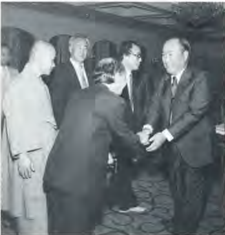
Korean religious leaders, p. 24