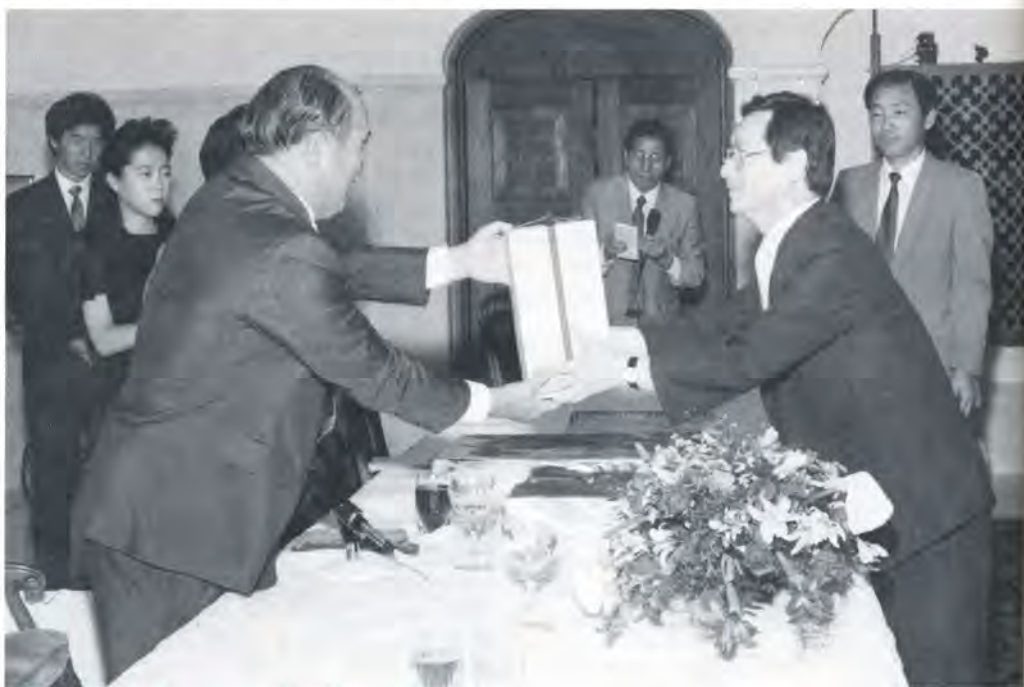
Protestant leader presents his gift to Father.

All these gifts were symbols of the dedication of their minds and hearts to