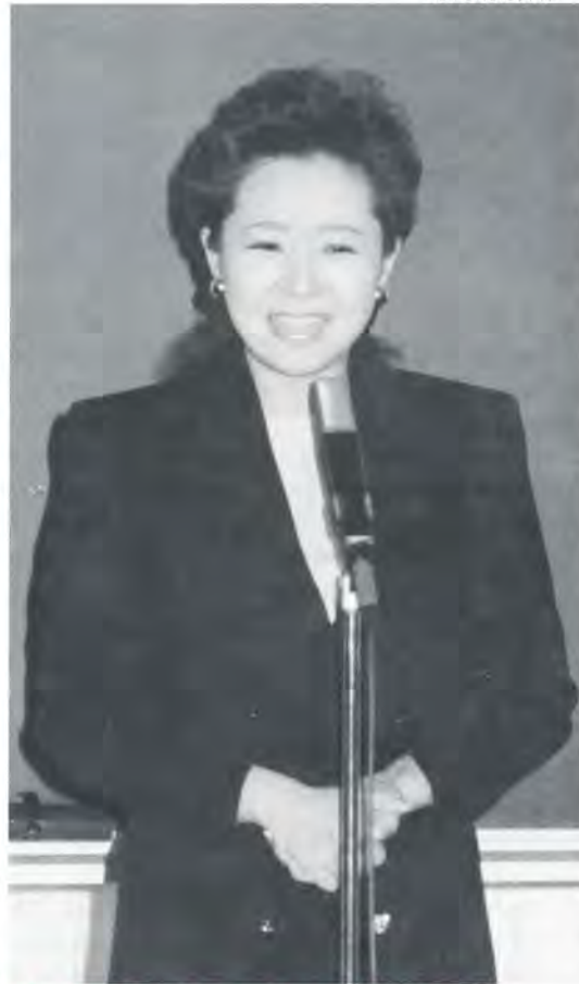
"My blessing is to return love to my subject."

I want to say something to you: Principle teaches us that when God sees us through His eyes of love, we are all equal in that we all have five percent responsibility to do God's mission. But biologically, our characteristics are very different. Our desires and longings, the things that we want to attain in life are different. In this 20th century, with the advent of feminism, many times women get confused about proper priorities and positions in terms of their role as women and their "careers."