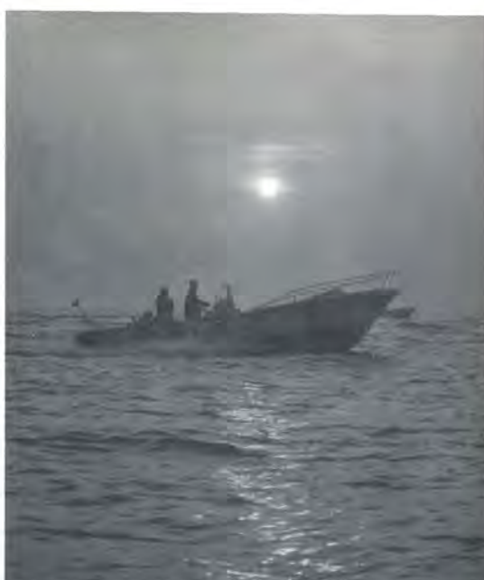
Sunrise on the ocean.

The spiritual atmosphere on the ocean is very clean and pure and simple. True Father accomplished many missions on land after making conditions of being on the ocean.