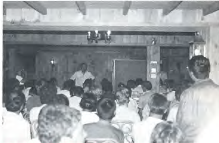
Father speaks to Ocean Challenge participants.

the ones who catch the mighty fish, the importance of the land crew is overlooked. If it were not for those who work constantly on maintaining and rebuilding the engines—and on teaching the captains basic maintenance and troubleshooting, the fleet would never even touch the briny seas, and the fish would