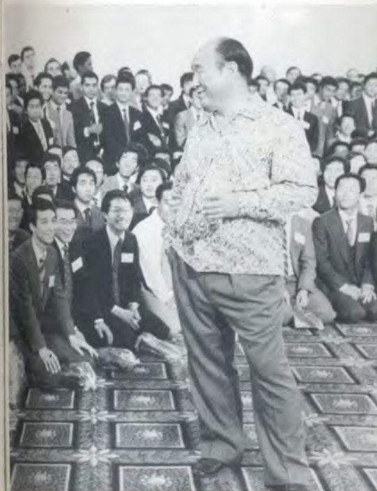
Father at the March '87 matching.

Can you guess what I found in those eyes? It's true that he looked at me very intently, but far from the piercing judgment I expected to see, I found myself looking into eyes that were full of absolute, tender, warm, embracing true love. All my doubts and fears melted away in an instant, and I was wrapped like a newborn baby in the warmth of Father's true love.