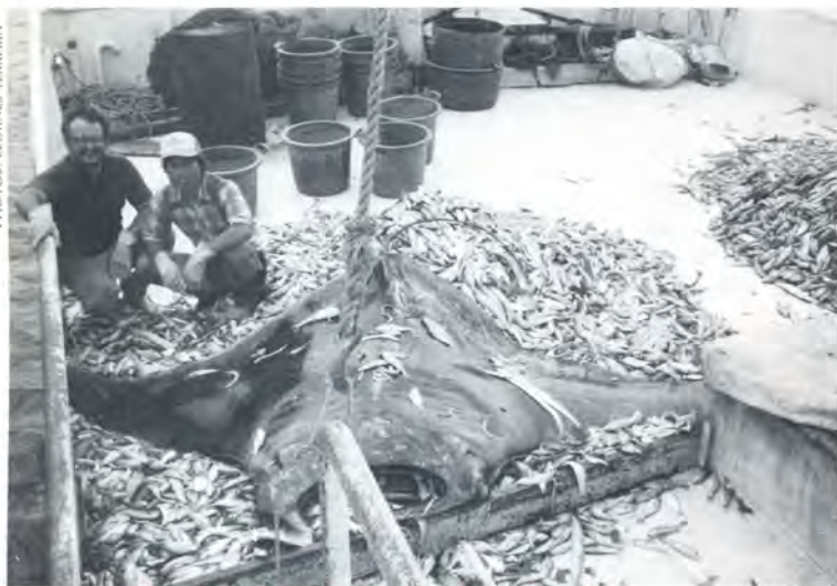
A large "devil ray" that got caught in the net.