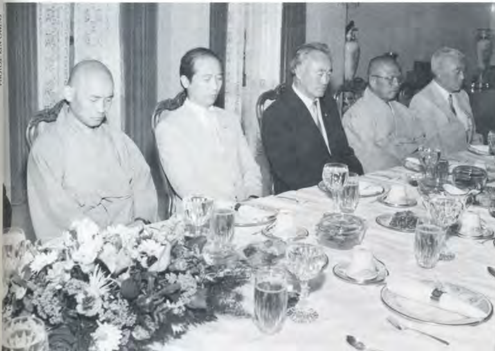
The man who received the revelation from Jesus is in the middle; at the far right is the leader of the entire group of clergy.