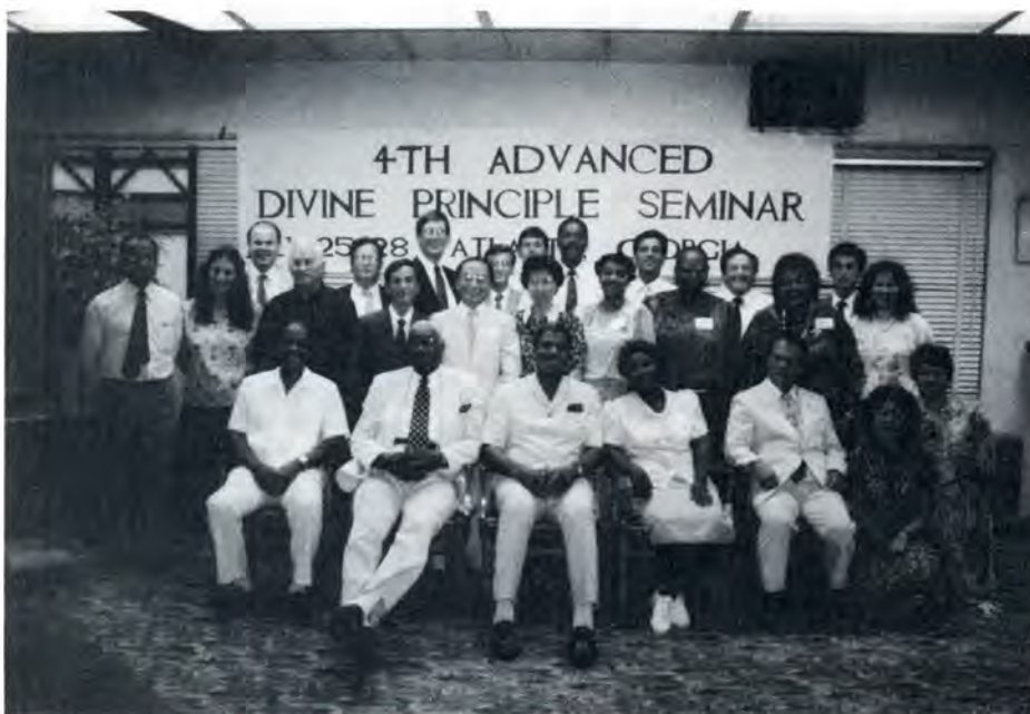
Seminar participants and staff pose for a group photo.