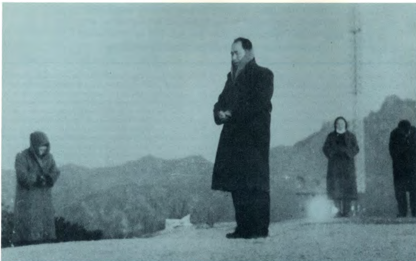
Father creates a holy ground on Twin Peaks in San Francisco in 1965.

Many American members don't understand how a religious leader could engage in such an activity. But I do it so the creatures can leap over into the infinite realm of the love of God. That is their highest purpose and goal.