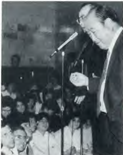
Father speaks on true love, p. 4