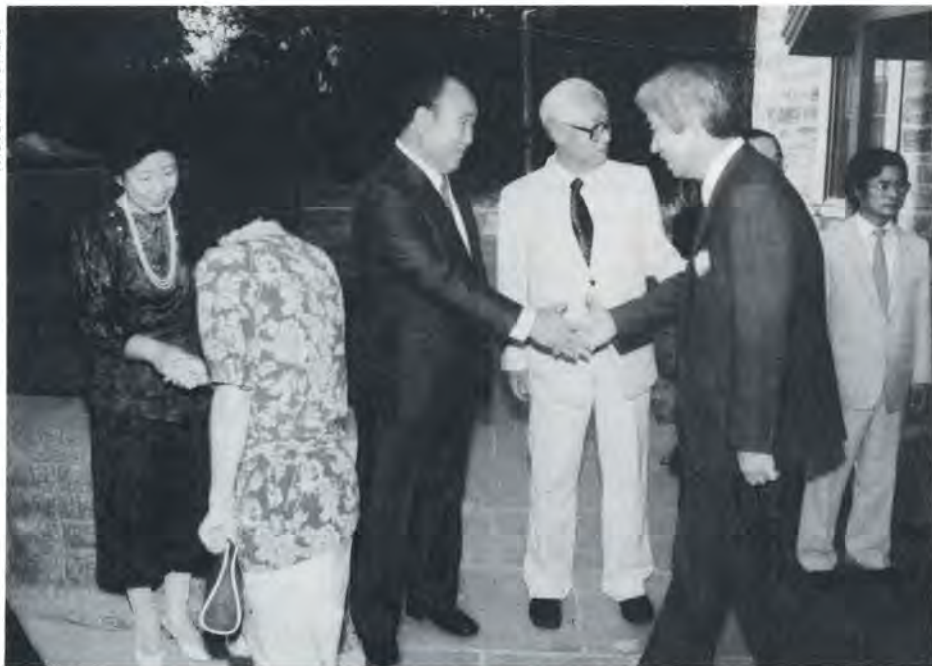
True Parents welcome the visiting professors to East Garden.

having lunch. The day continues with a tour of West Point Military Academy, then a scenic ride over Bear Mountain on down into Tarrytown, where a reception is held for them at Belvedere.