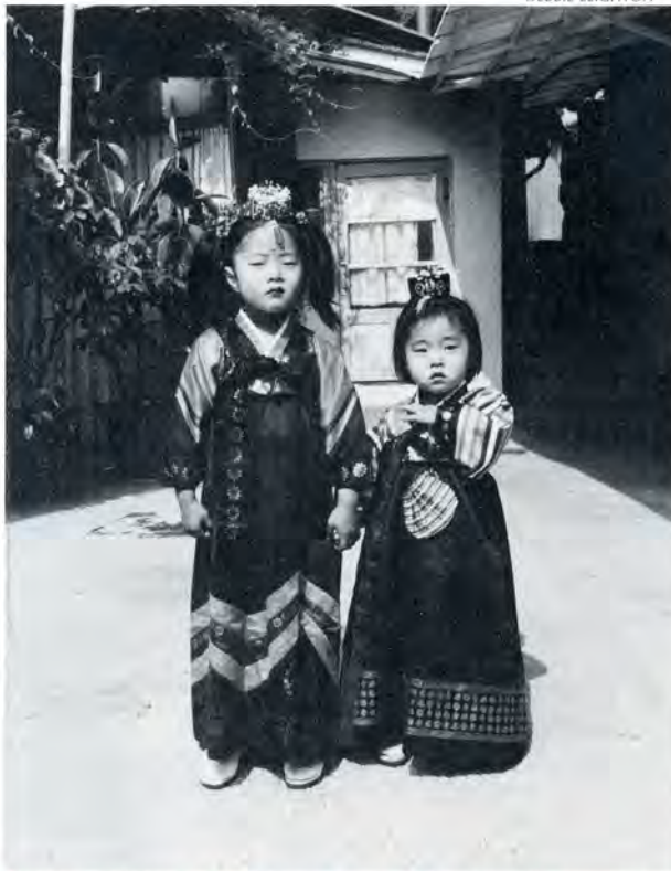
Korean children in traditional dress in their family courtyard.