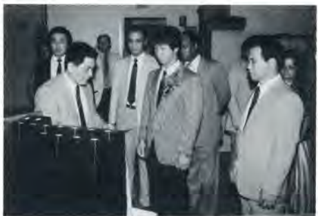
Video moves into the future, p. 28