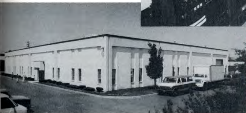
◀The new 12,000-square-foot plant in New Jersey.