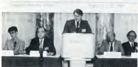
Celebration of the arts, p. 23