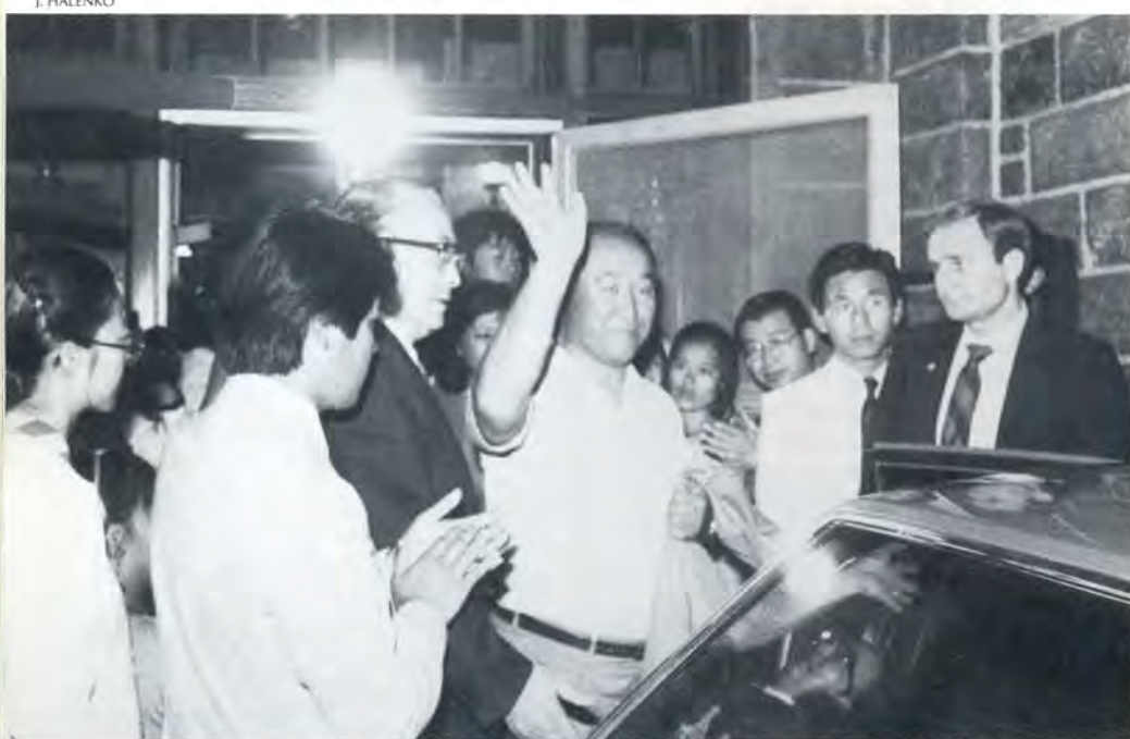
Father waves farewell upon leaving East Garden for Danbury on July 20, 1984.

Once a young man approached Father and said to him, "Rev. Moon, I have a personal request. You know, I never had a father. He died before I was born. I've always wanted to have a father. Rev. Moon, you are that father to me. From this time on, can I call you Father?" This occurred without his even hearing one