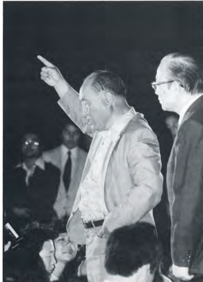
Father expresses his heart to the members at Belvedere on the night he leaves for Danbury.

Father entered Danbury on July 20, 1984. That day the members were all sobbing. Father was the only one who was not sobbing, and he scolded the members, saying, "I am now leaving for Danbury full of hope. God has prepared something extraordinary for me there. I am looking forward to discovering the