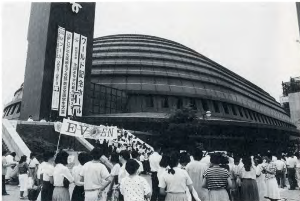
Students gather outside the hall.

The five-hour festival proved to be a great success. □