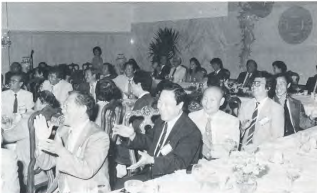
The professors enjoy the warm hospitality at East Garden—and individual entertainment.