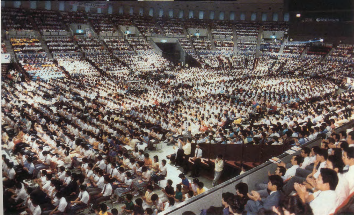
Above: Flag bearers lead the march of festival speakers and representatives. Below: Over 6,000 students fill the Kobe World Memorial Hall to capacity.

The participants, who have been promoting the Unification movement all over Japan, reconfirmed their consciousness of being Unification students who are responsible for the future of Asia and the world. They made a new determination to work more seriously than ever before. When laser rays