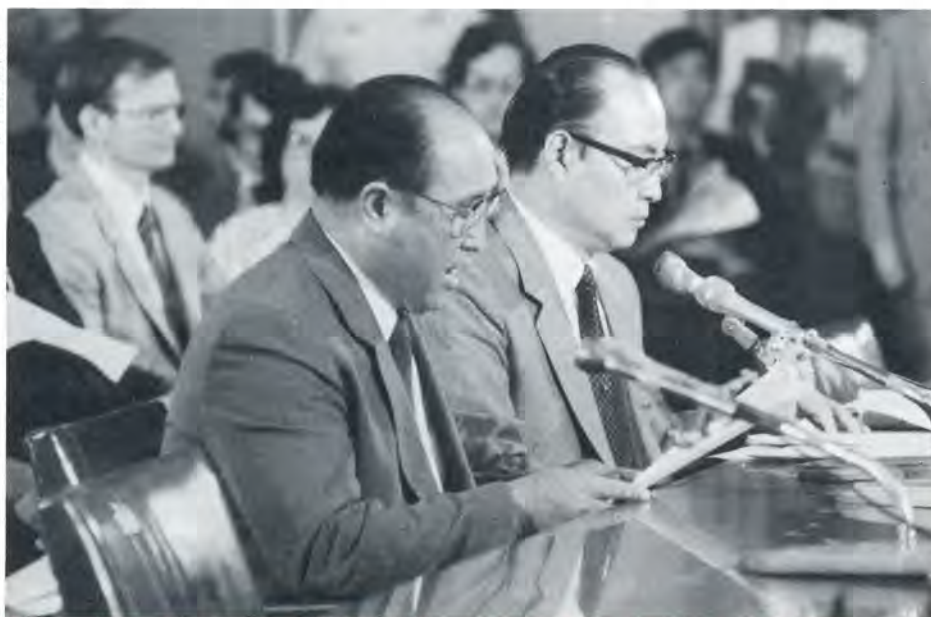
Father delivers his message at the Senate hearing in Washington DC on June 26, 1984.