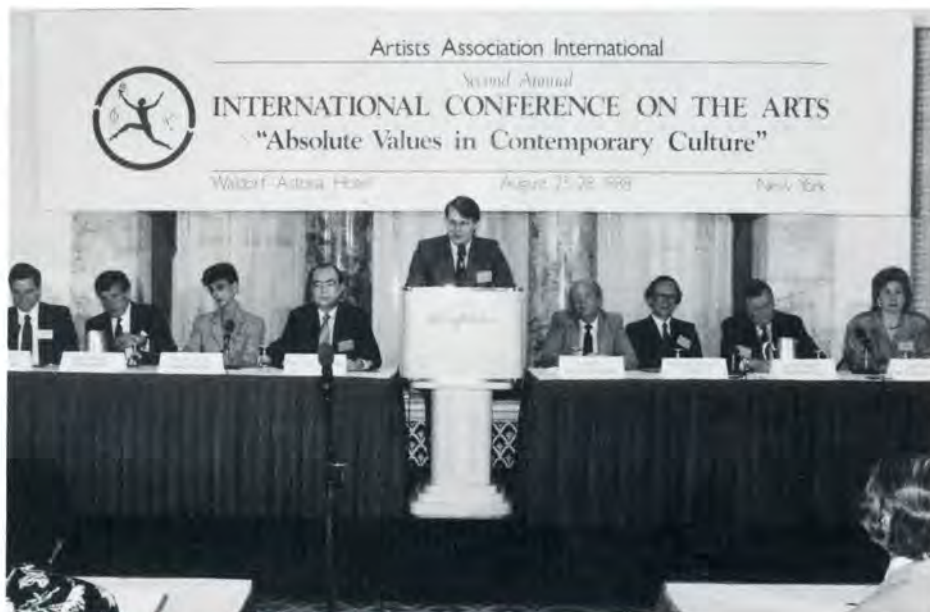
Featured speakers at the opening plenary session.

During the three main sessions, entitled "Striving for Absolute Values," "The