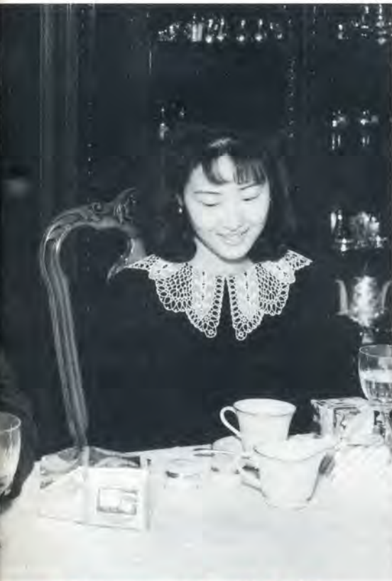
of their engagement, December 24, 1986.

The universe is built upon only one axis. When you draw a circle, only one vertical line can penetrate the center. When you look at the entire creation plus almighty God, what would be the vertical line that penetrates the center of the universe? Is it power? No, power is always a manifestation of the horizontal line. It is the result of horizontal confrontation. Knowledge and wealth are also horizontal. Love is the only thing that is universal and vertical.