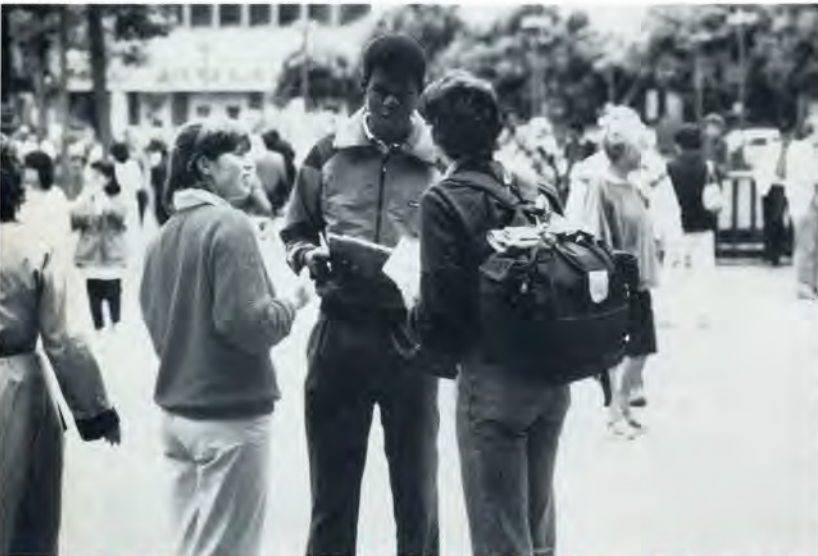
"True love means concretely listening to and loving another human being."

ers in Japan treated me in exactly the same way. Every moment they were solicitous of my well-being. It made me feel that I wanted to be even more solicitous of their well-being. We're competing in how to best love each other.