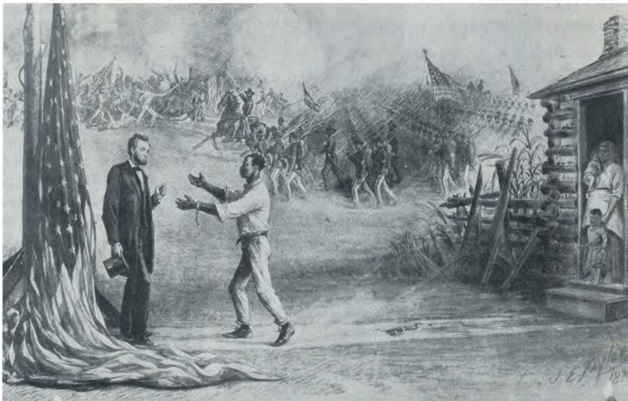
In the midst of the Civil War and despite great political opposition, Abraham Lincoln bravely proclaimed all people held as slaves within any state "forever free."

hope and gave up. There has been a spiritual battle going on, and they deserted the cause, just as at Valley Forge when many soldiers gave up and ran away. Wars are not pretty or nice. People