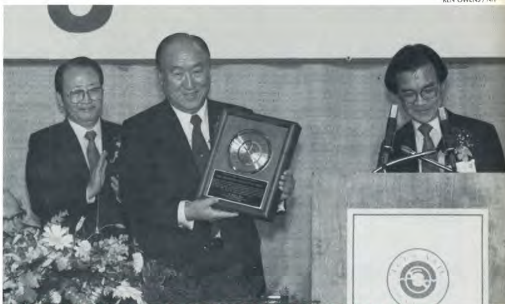
Father receives a plaque from Dr. Haing S. Ngor, a Cambodian medical doctor and actor.