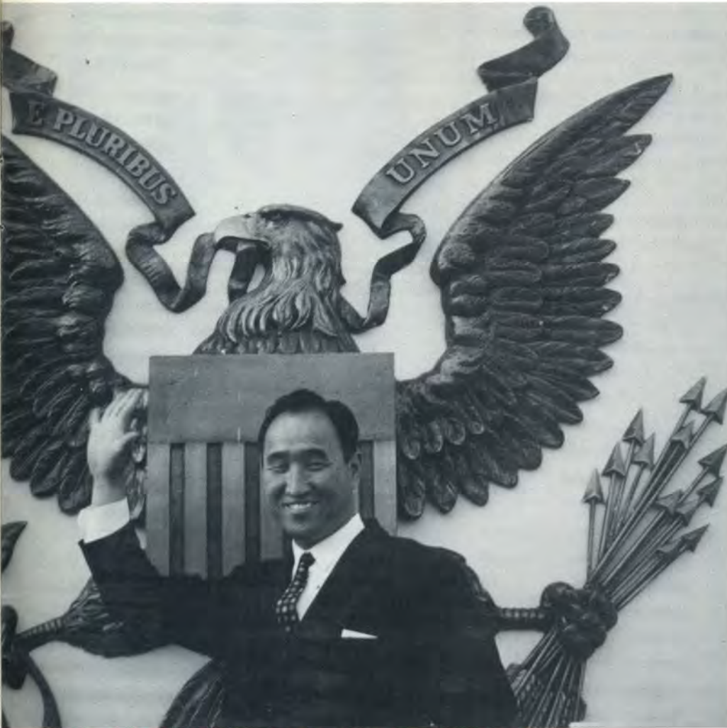
True Father in Washington DC during his first world tour in 1965.

Messages from an American Patriot and Educator