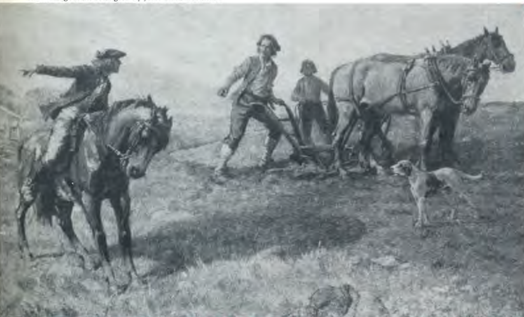
The patriot Paul Revere called all the able-bodied men to come out and fight for the cause of liberty at the first battle of the Revolutionary War, the Battle of Lexington and Concord.