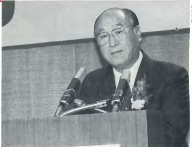
R. M. DAVIS

Then we should also examine the world's shortcomings with regard to the horizontal dimension of absolute value, which is the standard of true giving. For example, we can never have world peace until those nations that have been blessed with material and technological advantages share them willingly with the other nations of the world. The blessings of science and technology are meant for all humankind, and they should