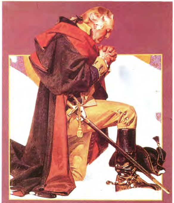
"This nation was founded by religious righteousness and fervor unparalleled in all of history. But what path are you allowing history to take now in this country?"

You may feel that the race riots of the 1960's are over, but they are not. You exhibit racism by not loving your brother, by not feeling you are as one race in this nation, in this world. Let me tell you that your racism—your anti-this race and anti-that race—will never launch a new America through which God can serve the world. After all, that is exactly what God hoped to do so long ago—serve the world through this America. Once you live in the spirit world, race and culture do not have the same bearing. Be people of the world—united citizens for God.