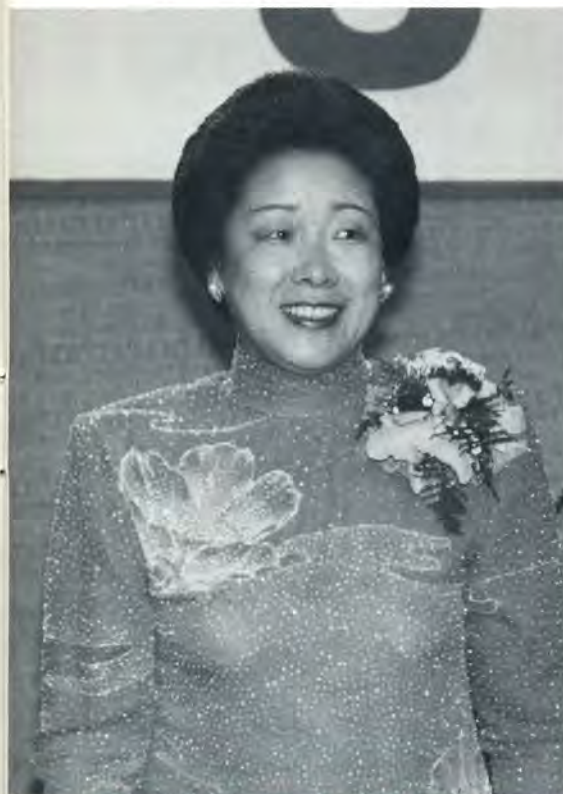
True Mother at the Farewell Banquet.

It's been a joy to meet young members of the church from all over the world. They're wonderful young people, and we're full of admiration for their dedication, spirituality, comradeship, and the support they're giving Rev. Moon. We feel that we've gained enormously in friendship, understanding, and affection from many people. □