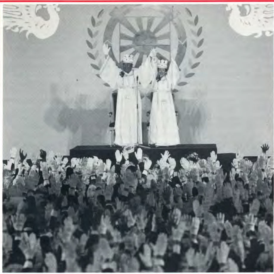
The True Parents raise a heavenly mansei at the Blessing of 6,516 Couples on October 30, 1988.