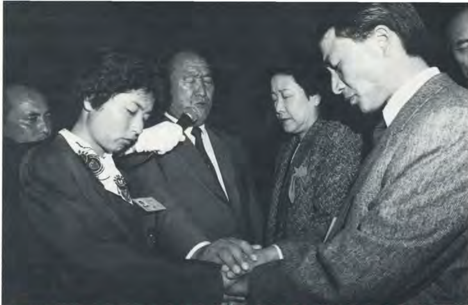
"Through your eternal commitment to one other human being, you discover the eternal aspect of yourself." Holy Wine Ceremony—October 29, 1988.

On the plane I was meditating on the mystery of loving another person. As soon as you enter into God's eyes and actively listen to that unique other human