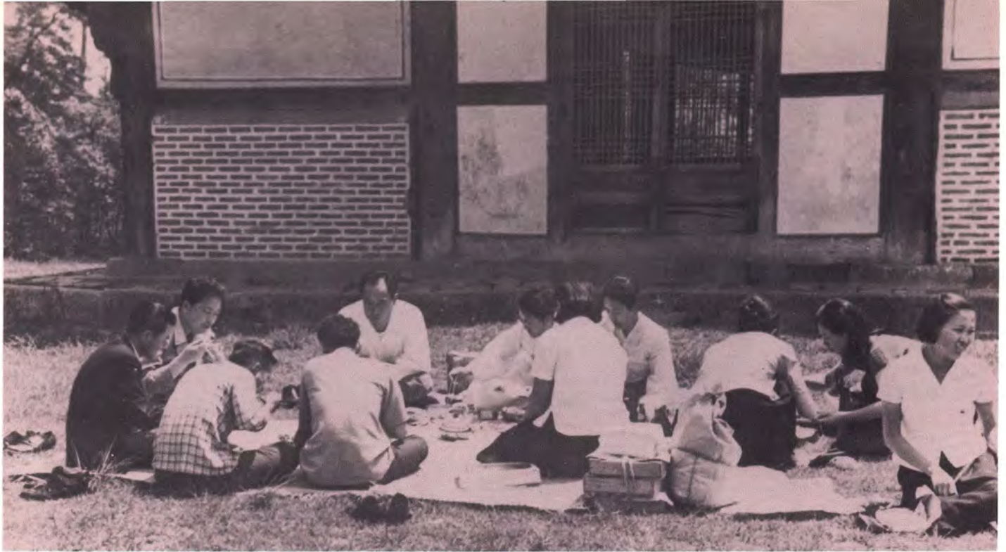
True Father having a meal on the lawn with some of his early followers.

structure of the church, or the leaders of the church. Well, okay, let's talk about the church. Here I am, there you are. We are the church.