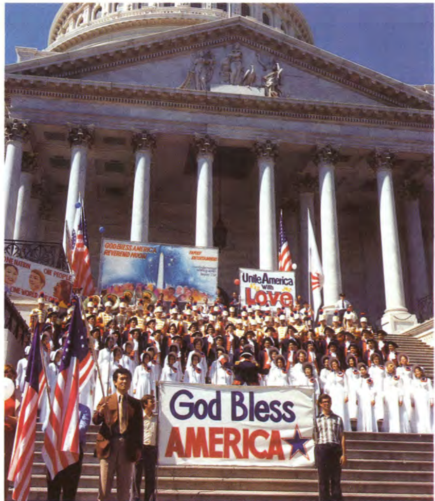
This rally to wake up the consciousness of Americans was held on the steps of the U.S. Capitol during the Washington Monument campaign in 1976.