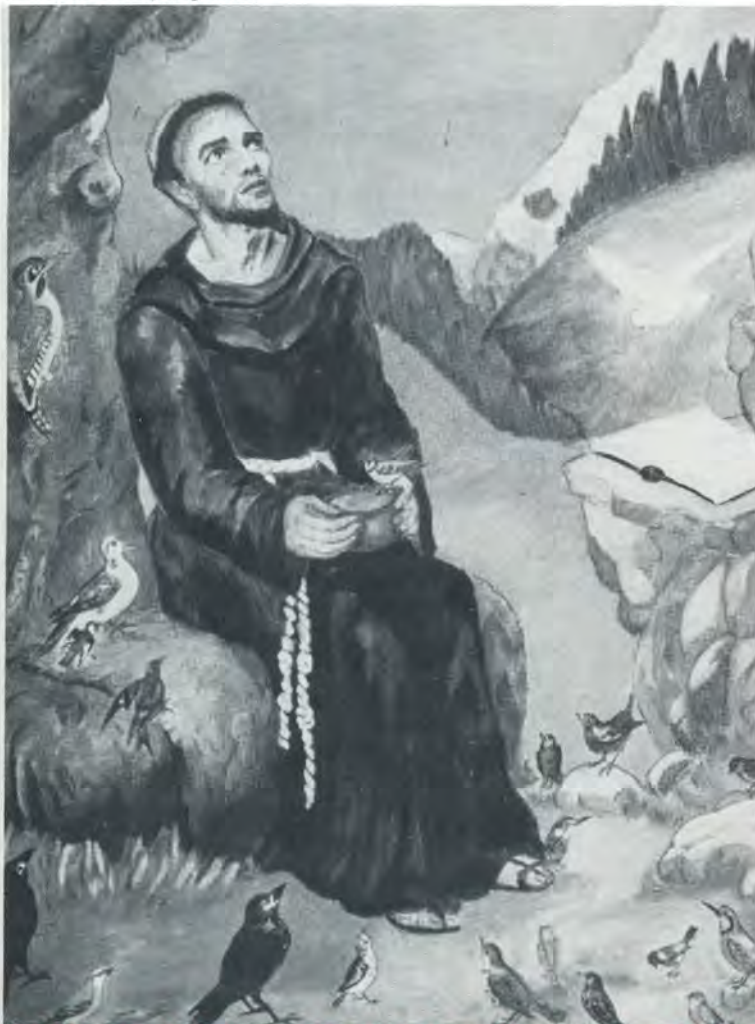
Saint Francis' sole desire was to live in the heart of Jesus, even to suffer the very physical and spiritual pangs that Jesus suffered for the sake of mankind.

You may say that your modern world is a much more difficult one in which to be "holy." Most of you call me "saint" for having done very simple things. But my world was even more materialistic—