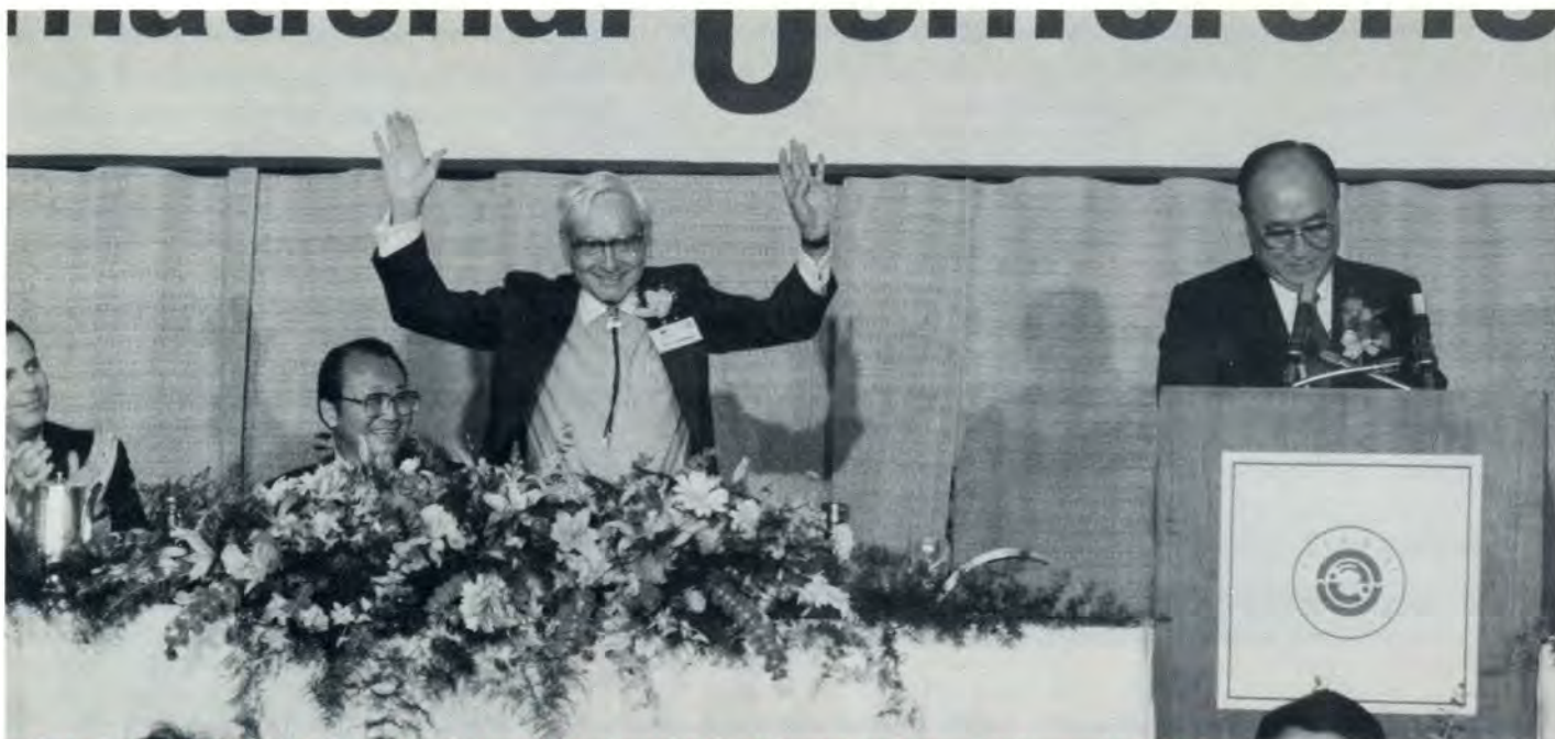
At the Farewell Banquet, Father acknowledges the fine leadership of Dr. Alvin Weinberg, chairman of ICUS XVII.

He also expressed regret over Father's unjust imprisonment several years ago, calling it politically motivated. "I hope," he said, "that this kind of persecution against Rev. Moon will soon come to an end."