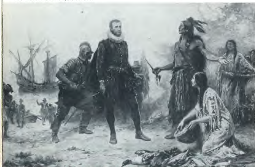
Hudson the Dreamer by J.L.G. Ferris

"Let us realize that the original citizens of America, the native American Indians, were not included in America's advancements nor given the credit due them for their sacrifice in building America's greatness."