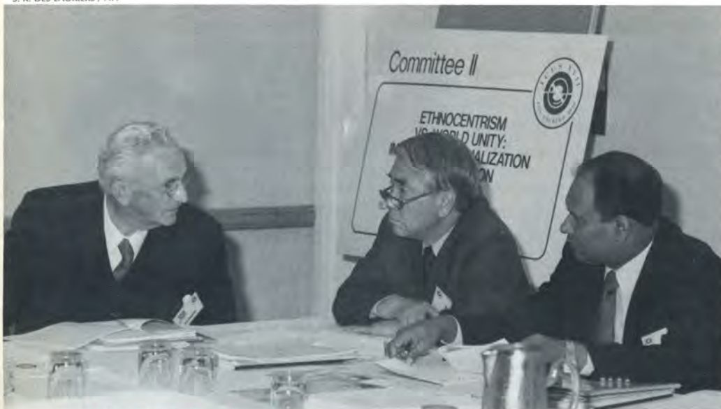
A discussion in Committee II.

We can never have world peace until those nations that have been blessed with material and technological advantages willingly share them with the other nations of the world. . . . We should reassess the contemporary world and proclaim a new standard of giving.