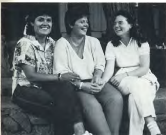
"We have to be the ones to make our church a community of love."

If you can't love a unique other person, you're just into ideology.