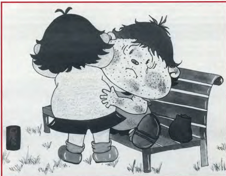
Eesaw looked into his brother's eyes and threw his arms around him.