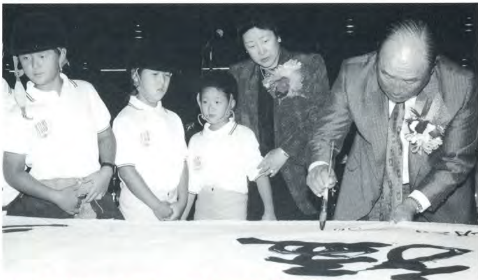
True Father drawing the calligraphy "Courage and Greatness".

After putting the horses through different paces, the children proceeded to "jump" over poles several inches from