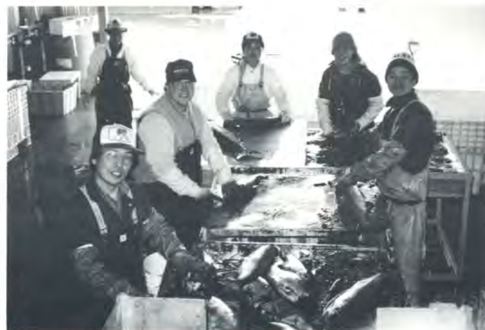
Processing by hand very early in the season.

The men were organized into work crews to cover all the aspects of the business. The Chinese traditionally worked the canning lines. The beach gang unloaded whole fish from the wooden scows and reloaded the canned product onto tramp steamers headed south. The Norwegians and Italians competed for recognition as the best fishermen and those too young or not trustworthy enough to fish yet spent the season