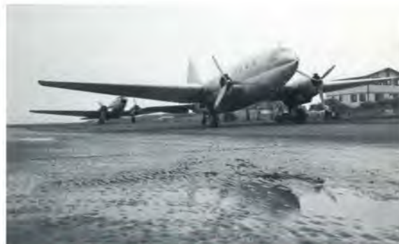
The airplane lands right in front of our ISA plant and guest house.

ing Egegik so soon. Even though this was a year of victory, we know that the challenge is not over. More difficulties await as we push each year to become a more profitable business and more importantly, true stewards of this special area and its people.