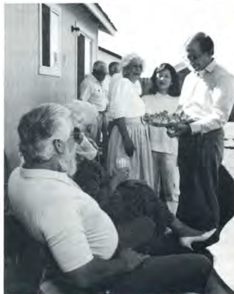
To be able to host this event, thanking our family, was indeed a God-given privilege.

On August 12, 1989, we finally had the party honoring my parents. A total of 50