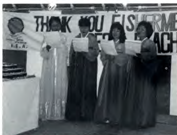
Our sisters sing at the end-of-season party.