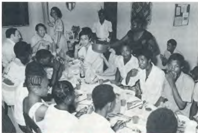
Rev. Kwak visits Central African members.

If you make some mistake, you need to repent. Through repentance, you can be connected to God.