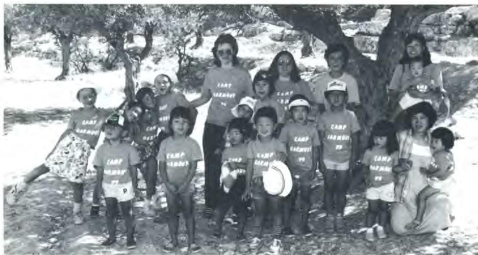
The camp participants visit the Holy Ground in Israel.