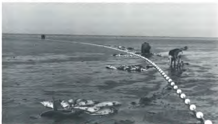
A 50 fathoms-long set net where fishermen pick out the tide's catch.