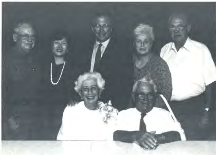
To see our parents so happy made all our efforts worthwhile.

bookkeeper and mother of four children, I always found it difficult to do more than write or phone his parents, or send them little gifts. One of my real internal struggles was to make a foundation with them where they could feel satisfied about the Unification Church and without any complaints toward our True Parents.