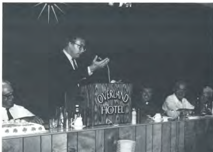
Father asked us to "Go and love our families as if we were Father."

He explained that we should, "make revival meetings on the family level—not centered on ourselves." And with our relatives gathered we should "ask them in tears for forgiveness for not having loved them during the time we were