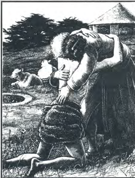
The Prodigal Son

Generally, a member faces any given intense or difficult conditions once. Heavenly Father gives a person the chance to overcome and go beyond these difficulties, which the person does by setting up indemnity conditions. A person should only need to try once to overcome a certain stumbling block in his faith. Yet, if we find ourselves in the same situation again and again, we must understand why and deeply repent that we