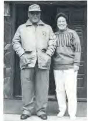
KEN OWENS / NFP