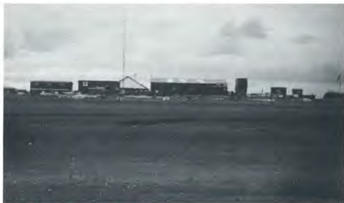
ISA plant when the tide is out.

There are two types of fishing used in the Bristol Bay, both utilizing a gill net made of a thin mesh that catches and traps the fish by the gills. One type is drift gill netting, where a 32' boat lays out a 150 fathom length of net and then drifts along the strong river current while fish hit the net. The other type of fishing, long utilized by Alaskan natives, is a set net. A set net is a 50 fathom