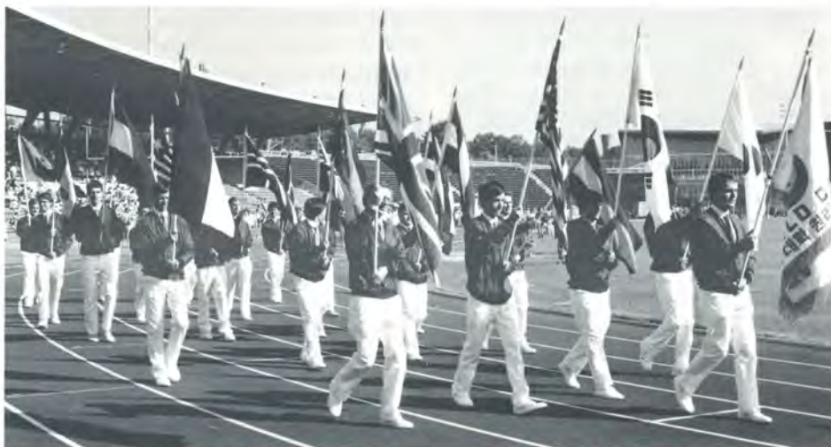
▲ National representatives parade in front of the stands. ◀ Inspired CARP students prepare for the Games.

That same evening the tired but exhilarated athletes and spectators made their way across London to the Closing