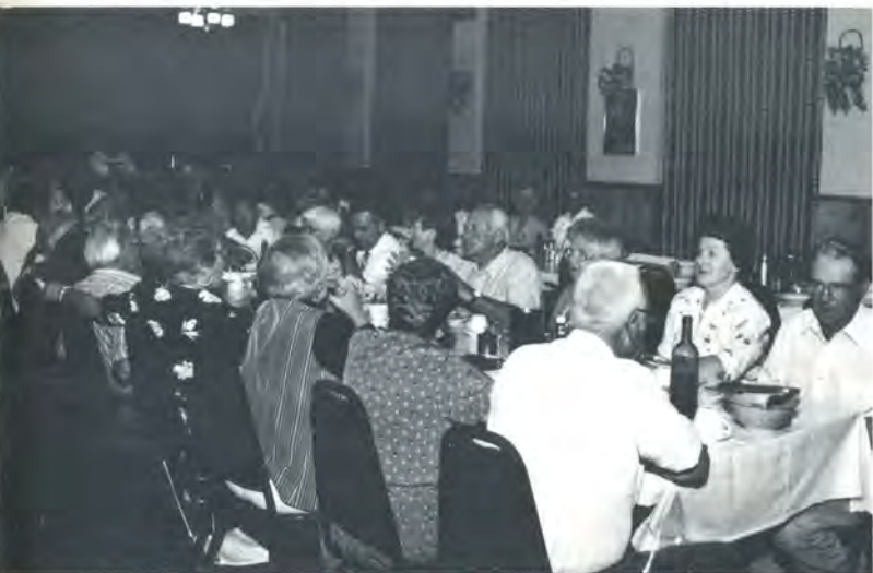
Fifty relatives attended this first hometown revival.

rious challenges to the standard of my life of faith. In retrospect, these were God-given trials that served to help me remove my fallen nature in preparation for my hometown offering. I knew that for this family-level program to be successful, I had to find the right balance that would not take away from my mission.