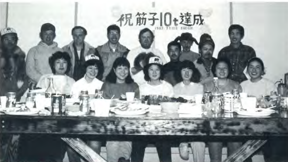
Party to celebrate reaching the 10 million tons of salmon roe goal.

One of Mr Chai's main concerns has been to modernize our camp and raise the standard on the beach for housing, shower facilities and equipment to take care of the fish so that we might be able to ship the best product available. In 1986 a major building project was undertaken with the construction of a bathroom facility. It is equipped with indoor