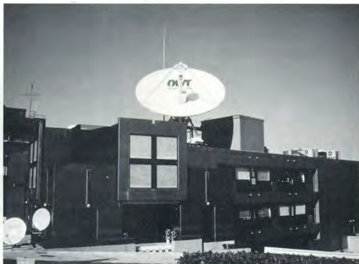
Ground station and its parabolic antenna.