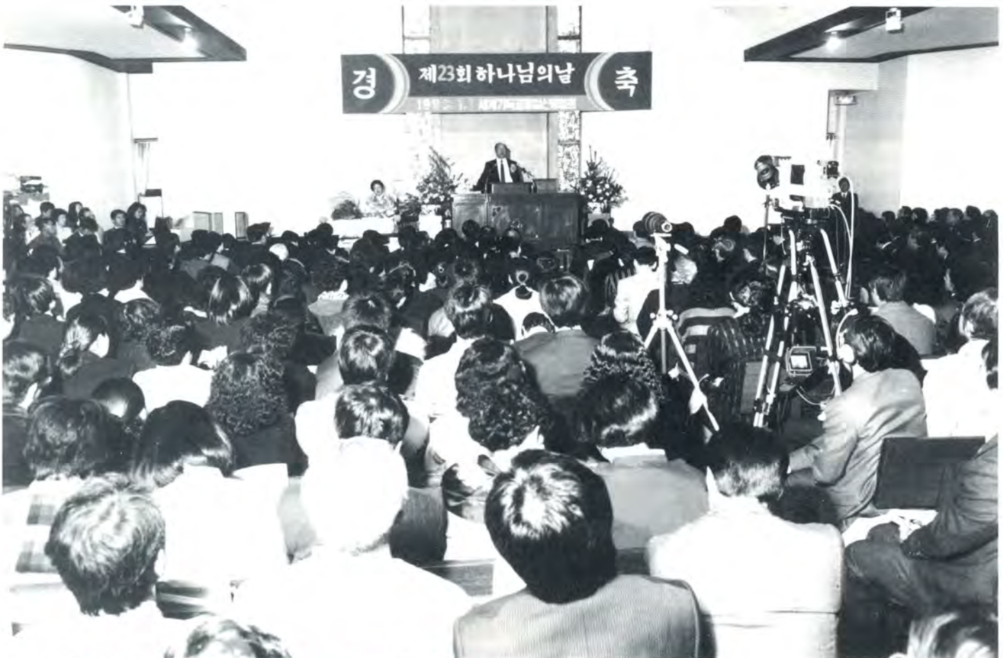
Father gives the God's Day sermon at Chungpadong Church in Seoul.

All mankind can be likened to the branches and leaves of a tree with the false root of Satan. To be restored, the branches and twigs must be cut off and grafted onto the true olive tree. Where is your root? It is in Adam and Eve. The mass weddings of the Unification Church are ceremonies of engrafting into the blood lineage of True Parents. This is exactly like the Korean persimmon tree. There is a "true" persimmon tree and a "stone" persimmon tree. The true one has good, edible fruit, while the other one doesn't. But when the branches from the false one are grafted onto the true one, they bear edible fruit.