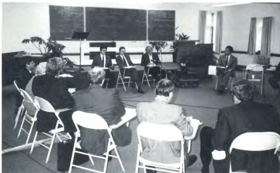
Lecture presentation and discussion.