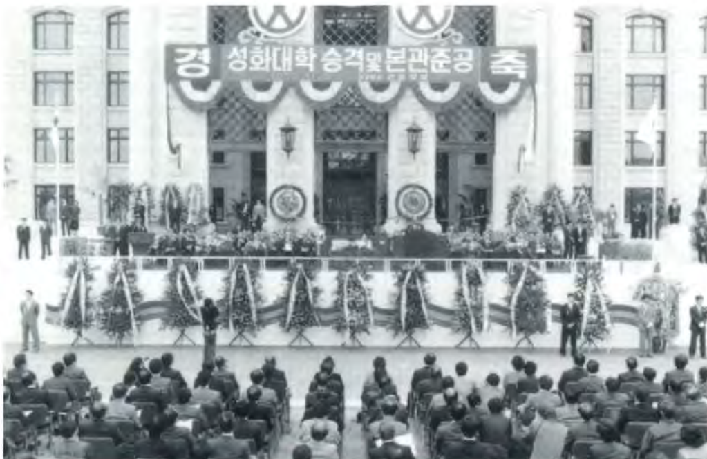
True Father speaks to faculty, students and guests on the occasion of Sông Hwa University's opening.

May God bless your families. Thank you. □