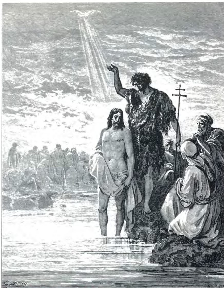
John the Baptist and Jesus (Matt. 3:16)

Your heart, mind and spirit are more important than your body. Put your emphasis in the right place. You take care of yourself. I want to see all of you accomplish your responsibility.