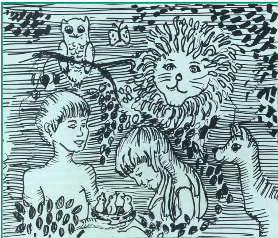
Adam and Eve are delighted with the creation.

Creatures came from all over to see the children. Lions, tigers, deer, bears and even the insects gathered at their birthplace. Lucifer stood by the children and brought each animal to them to be petted. It was a glorious day. It was to be the first of many such days. □