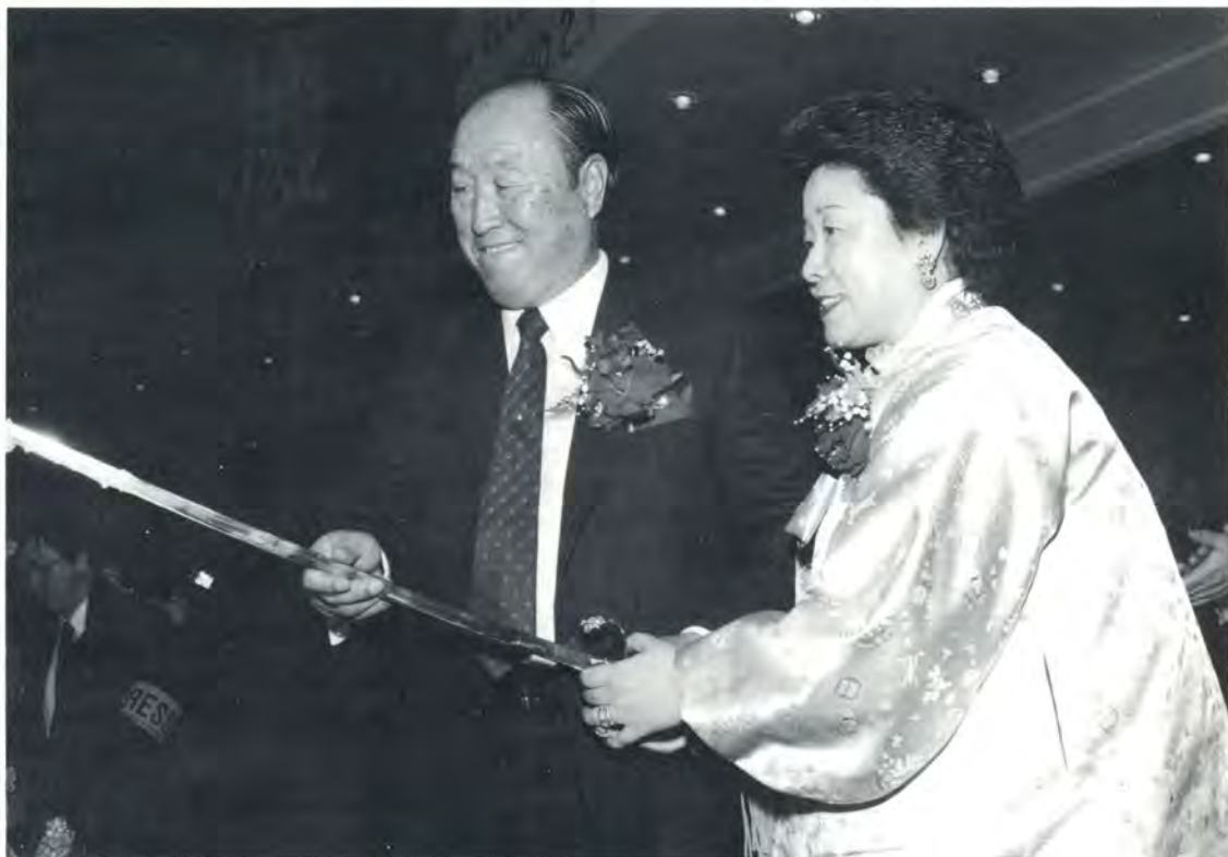
True Parents cut the birthday cake.

Let's think for a moment from a point of view that goes beyond narrow sectarian and religious interests. If the Korean people could undergo a change in character according to the