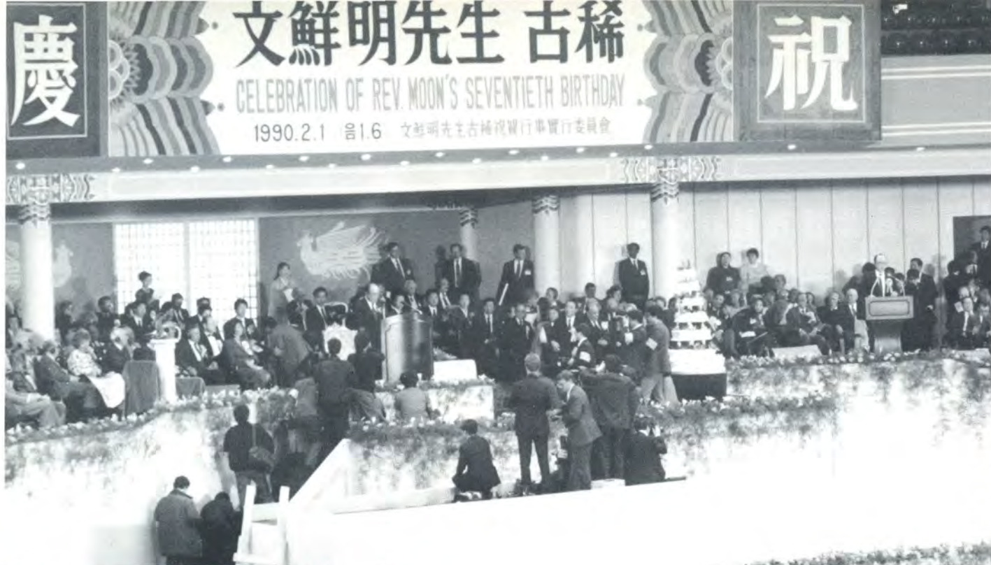
Dignitaries, seated on the dais, listen to Father's address.

horizontal love as a curse, has unjustly controlled man on all levels from the individual to the world. God, on the other hand, in an effort to return all this to its original state, had been carrying out His salvation providence. In accordance with the Principle, He has been working for the natural subjugation of Satan, and working through the Messiah to graft mankind onto His lineage.