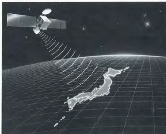
Satellite amplifying waves from the ground station.

The telecast took us to Kyushu, to follow an investigation of the Japan-Korea tunnel near Karatsu in the Saga prefecture. At a studio, the Secretary-General of the International Highway Corporation explained that the tunnel is