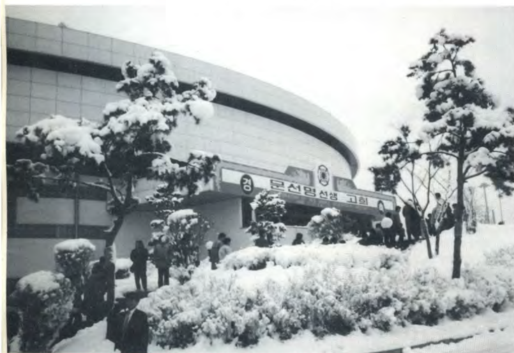
Guests enter the Olympic stadium for Father's birthday celebration.

Ladies and gentlemen, all the activities that I have founded around the world are models of movements that rise above national boundaries, work to tear down the