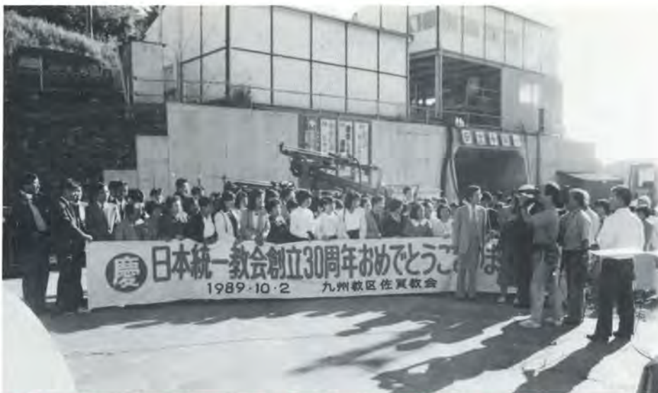
The first telecast included a report on the International Highway Project.

"The Unification Church, founded in Korea, now has missionaries in 138 nations. So far, we have been able to receive only small amounts of information