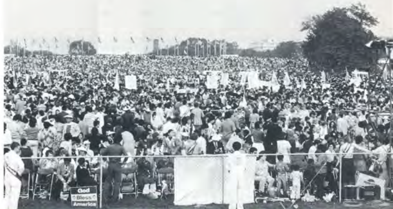
Washington Monument was the culmination of Father's public speeches in America.

By withdrawing from Vietnam, America abandoned her God-given role as the defender of freedom. Satan acted quickly, using communism in Africa, Asia and even Latin America to block God's Providence. America's failure to unite with Father's call to support Richard Nixon also precipitated America's own spiritual, political and economic decline. America's intelligence agencies were undermined and America continued to suffer from a spiritual sickness which came to be known as the "Vietnam