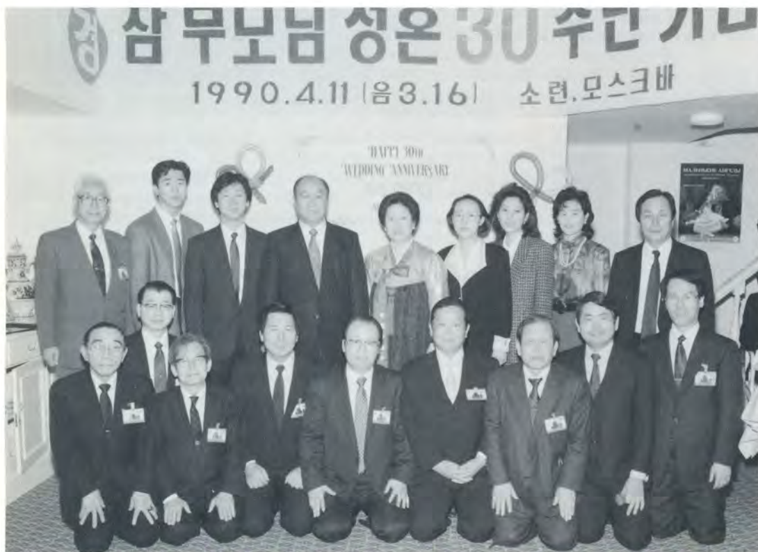
Several members of the True Family and Korean and Japanese elders pose with True Parents on the occasion of their thirtieth wedding anniversary.

Can you imagine if two thousand years ago Jesus Christ had gone to Rome, visited the Senate and been welcomed