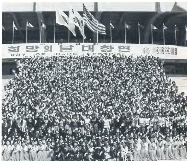
Church members gather for a kick-off rally for the International One World Crusade in 1973.

Father was desperately serious. He compared communism to Goliath and the Unification Church to David. Like