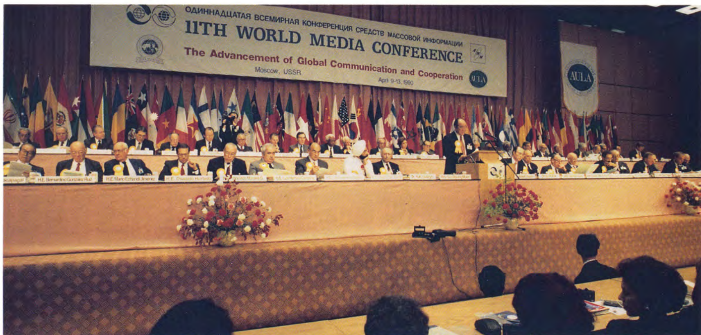
Father addresses the audience during the opening plenary session of the 11th World Media Conference on April 10, 1990.