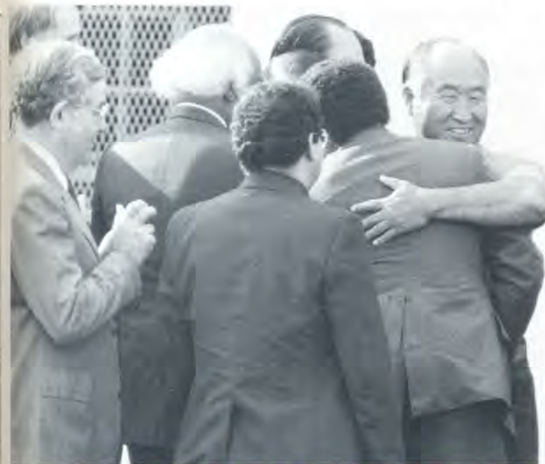
Ministers embrace Father as he leaves Danbury on July 4, 1985.

The Moscow rally and the encounter with President and Madame Gorbachev were not chance events. They resulted from years of Father's careful planning, preparation and sacrifice. Personally, I believe that the Moscow Rally and the Gorbachev meetings were necessary to fulfill a Providential mandate. If this historical event had not taken place soon after the collapse of communism in Eastern Europe, it would be far more difficult for future generations to recognize that those changes had occurred, not because one economic system is superior to another, but because one man prayed, wept and bled so that the day would come when our divided world would be made whole, under vertical and horizontal True Parents. □