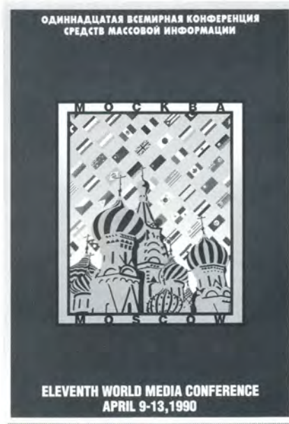
11th World Media Conference pamphlet.