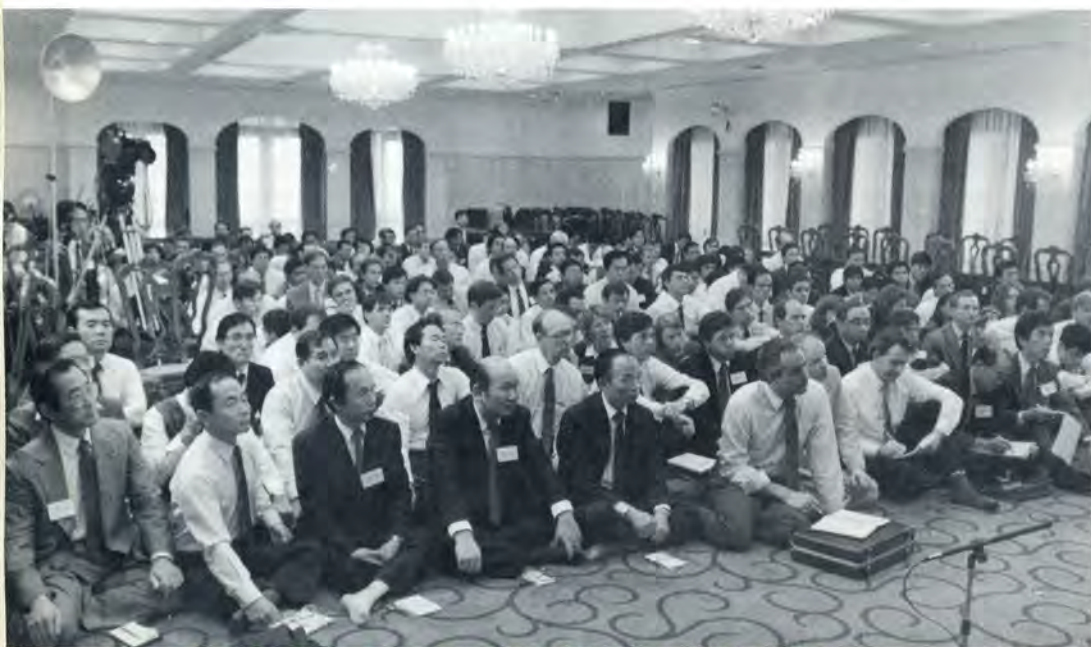
Church leaders from all over the United States gather at East Garden.

that, their coming into Canaan would mean nothing. Compared to the Israelites, the Canaanites were rich men possessing many sheep, cattle and beautiful houses. So the Israelites looked like miserable beggar children. The Israelites envied the Canaanites and lost their identity as the chosen people. By the second generation, the Israelites had completely lost their culture and their nation. You have to understand the significance of this clearly. I know you are in the same situation and face the same temptations. Like the Israelites, you are also the second generation or Abel generation of Unification Church members. The Israelites also faced high levels of wealthy people in the political and scholarly world. But remember, no matter how much power those people have, it cannot compare with our past 40 years. We