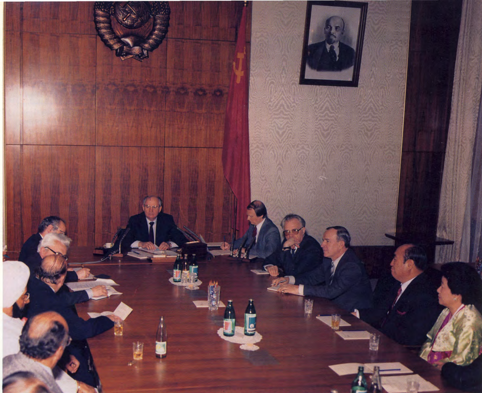
True Parents and 38 World Media Conference participants meet with President Gorbachev at the Kremlin.

people on Adam and Eve. If this meeting did not cap the new era, one wonders what would."