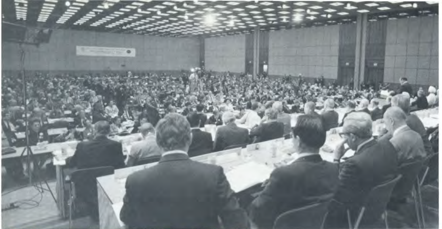
The 11th World Media Conference convened in Moscow on April 10, 1990.

Most people were amazed that Father would deliver such a spiritual address. It was definitely unusual fare for a conference on media. Still the Soviet press played it very big, giving it front page coverage in Pravda and Izvestia . The official Soviet news agency TASS sent the story around the world. Novosti Press Agency , our co-sponsors of the conference, had no fewer than six television cameras covering the events at all times. I was even approached by the Moscow bureau chief of the North Korean newspaper The Workers' Daily for an interview. He asked me if Reverend Moon would be willing to hold such a conference in Pyongyang. He was shocked when I told him, "Of course he would."