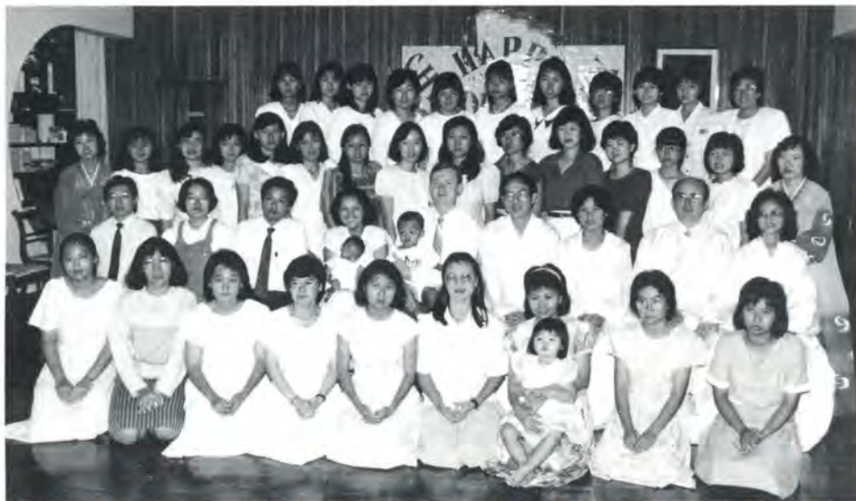
Brothers and sisters gather for Children's Day celebration in Kuala Lumpur, Malaysia.

One impressive point in the Philippines is the level of contact with politicians, religious leaders, and academic leaders. They have established strong contacts that members have developed over the years. I could meet politicians and presidents of universities who were connected to CAUSA, the World Media Association, and PWPA. I spent a whole day just going from one congressman and senator to another, speaking to them about all the projects that Father is doing. I was amazed at how open they were, and also I was very surprised that