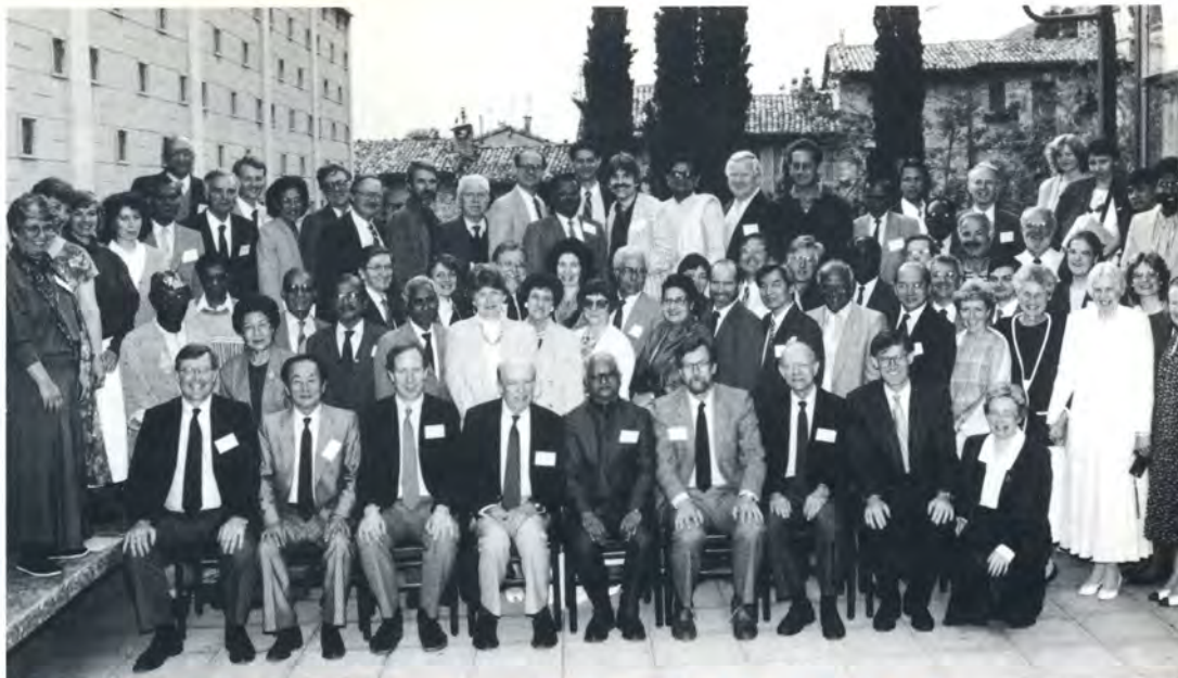
Conference participants gather for the group photo outside La Cittadella Ospitalita.