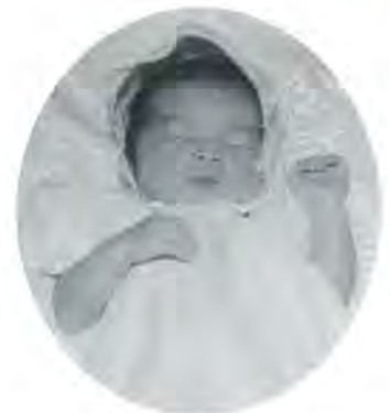
Shin Yeon Nim

FRONT COVER: True Parents share a relaxing moment during the 11th World Media Conference in Moscow.