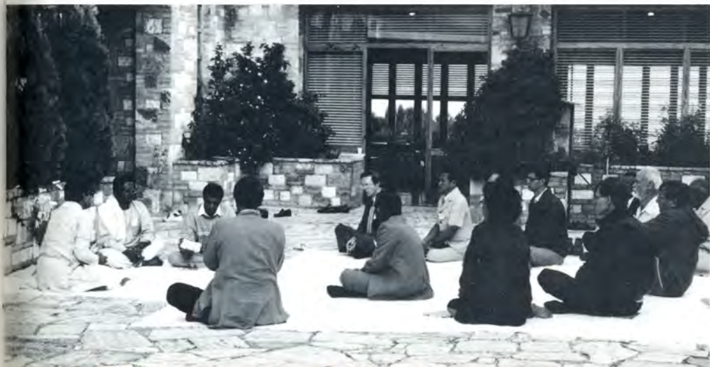
The Buddhist morning service included a lesson in yoga exercises.

In order to help us understand the other traditions more, prayer/meditation services were held each morning. All the services with the exception of the Jewish service were held out on a terrace which overlooked the valley towards Santa Maria Degli Angeli, which is the site of the Porziuncola, the little chapel St. Francis rebuilt with his own hands. It is also where St. Francis discovered