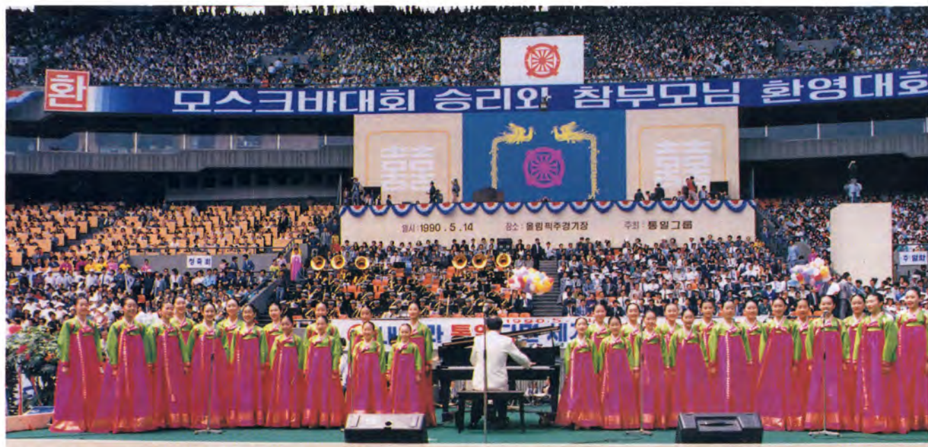
The Little Angels' performance charms the audience at the main Chamsil Stadium.

The worldwide foundation of the Unification Movement has been influential in not only America but also communist countries. In his speech, Rev. Moon announced that: "I have placed Unification Church mis-