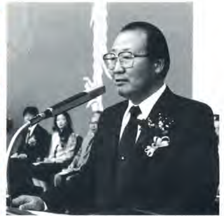
Chamsil Stadium Rally