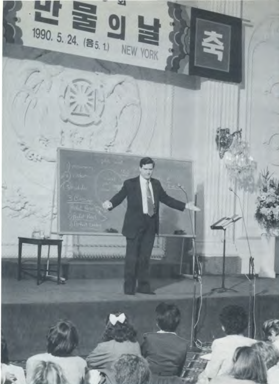
S. K. DES LAURIERS / NFP