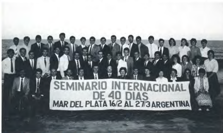
Forty-days participants have their group photo at the ocean.