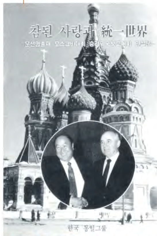
Cover of Father's speech distributed to the Korean audience.

For the Westerners who live in Korea, trials and suffering are a common denominator in our daily life; yet days like today help us feel so grateful to be on this path of faith and to understand that only through persecution and pain can major blessings be freely given by God. □