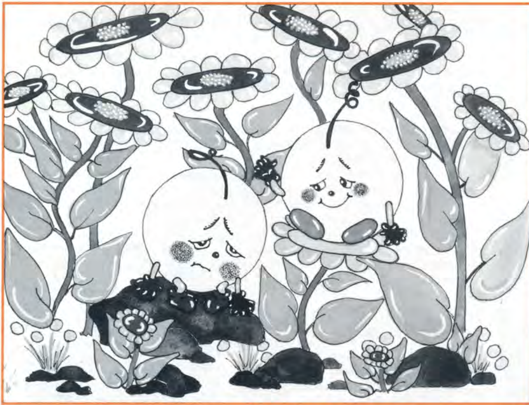
Pudgie asks a scowling Wudgie to take a walk with him.