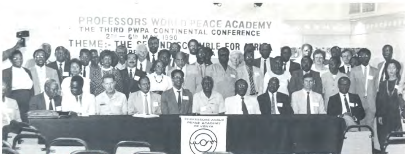
Participants in the Third PWPA Pan-African Conference.