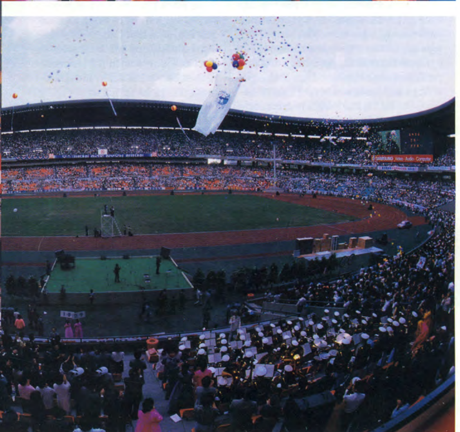
Above: True Parents listen as the Korean National Anthem is sung before Father begins his speech.