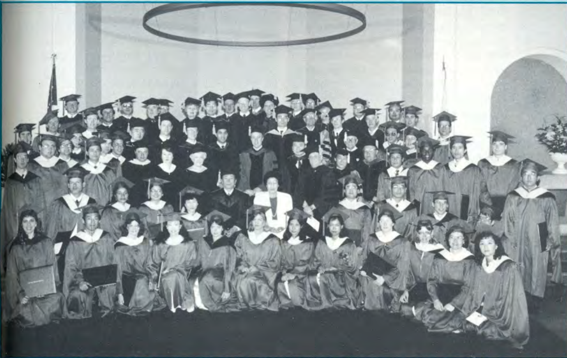
The 14th graduating class of the Unification Theological Seminary holding their diplomas, the first ones issued directly by UTS.