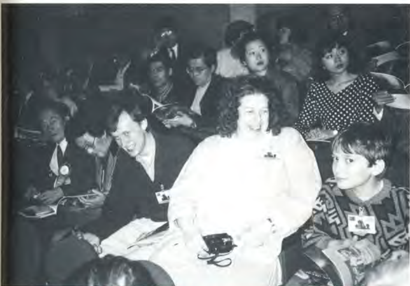
Attending the Little Angels' Performance during the World Media Conference in Moscow.