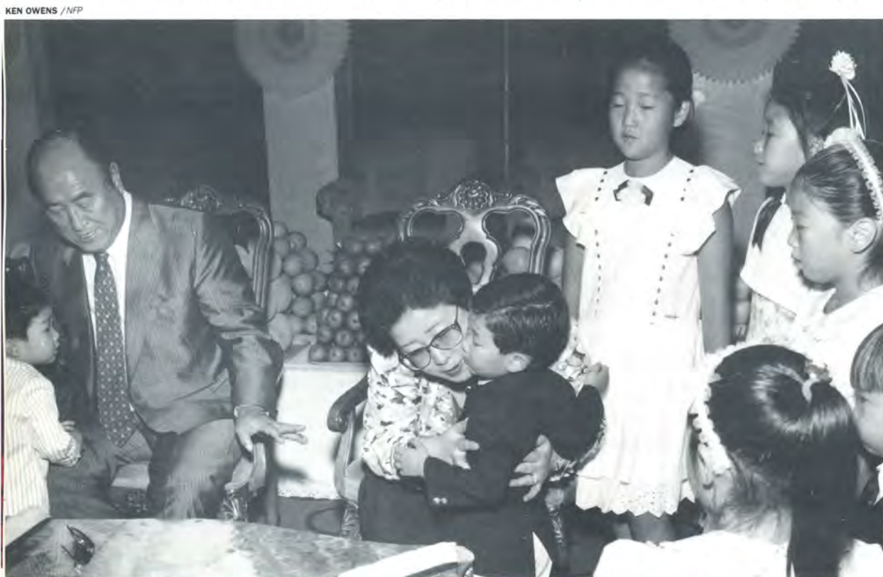
Upon their return to America in July, True Parents greet the children at East Garden.

You now have your individual portion of responsibility. I took care of these larger portions. It is up to you now, during this individual ownership age, to be responsible. I cannot be responsible for you. To achieve this means you need to bring our mind and body into unity. Is your mind in complete unity with your body? (No.) If not,