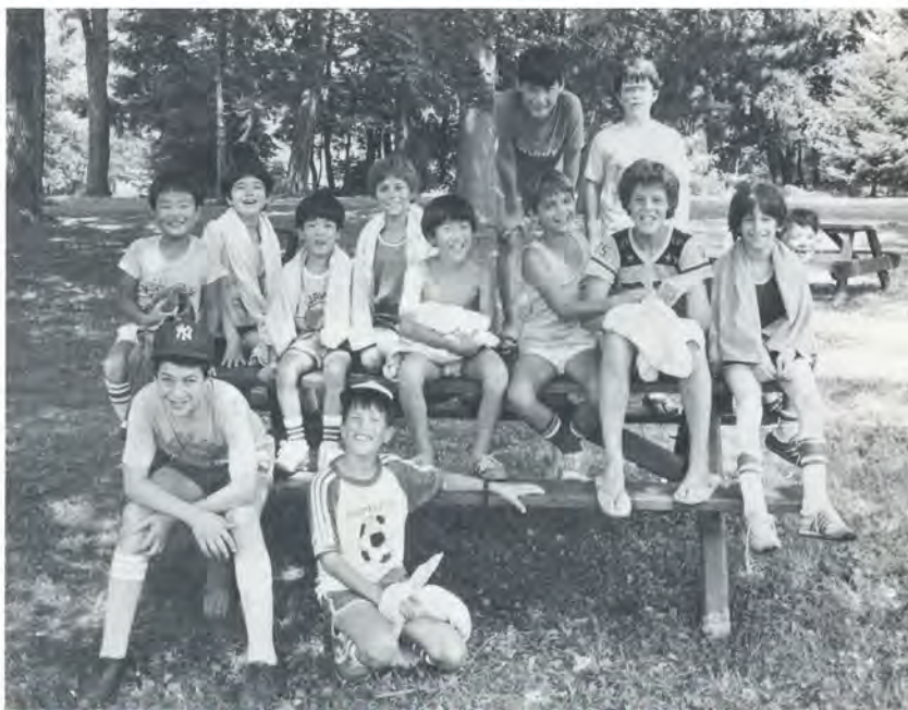
Happy participants in one of the early workshops for blessed children in America.

Lynda: Our members often don't have money for expensive private schools. My concern has always been, what can be developed for parents who want the best education for their chil-