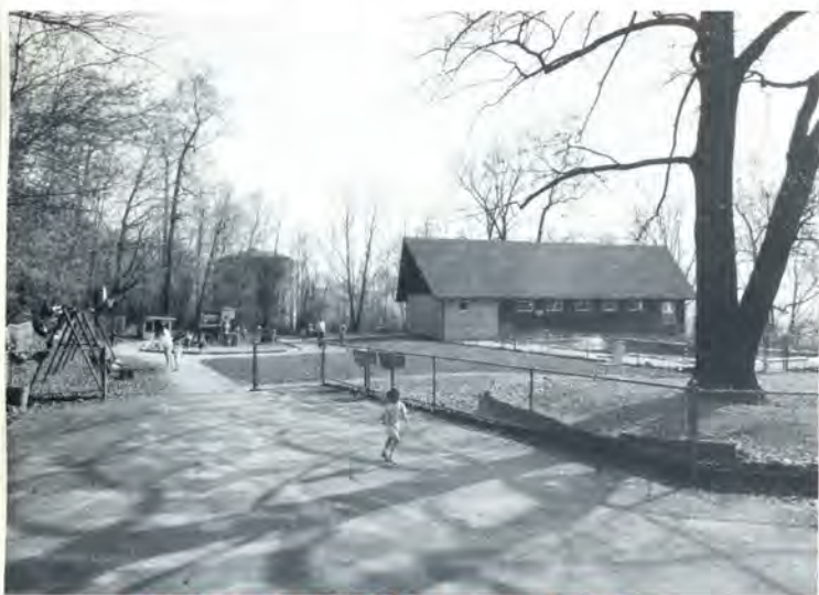
Jin-A school is located in a peaceful setting.