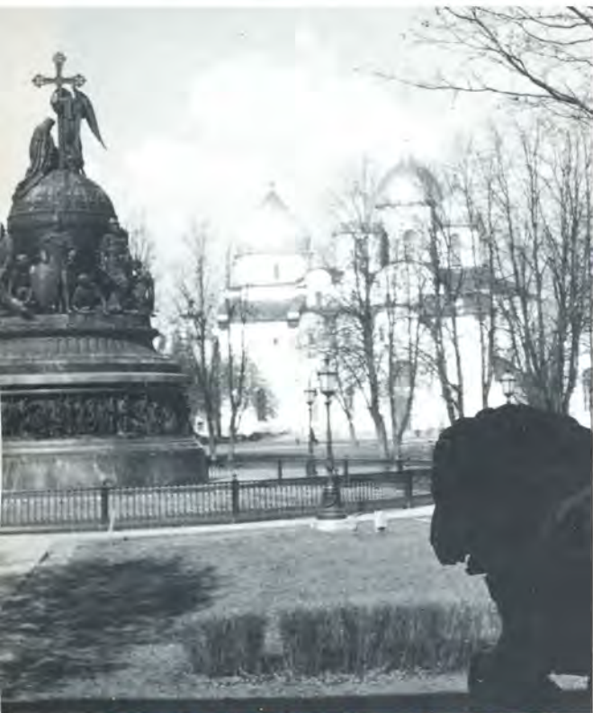
The Cathedral of St. Sophia and the Millenium Memorial in Novgorod.