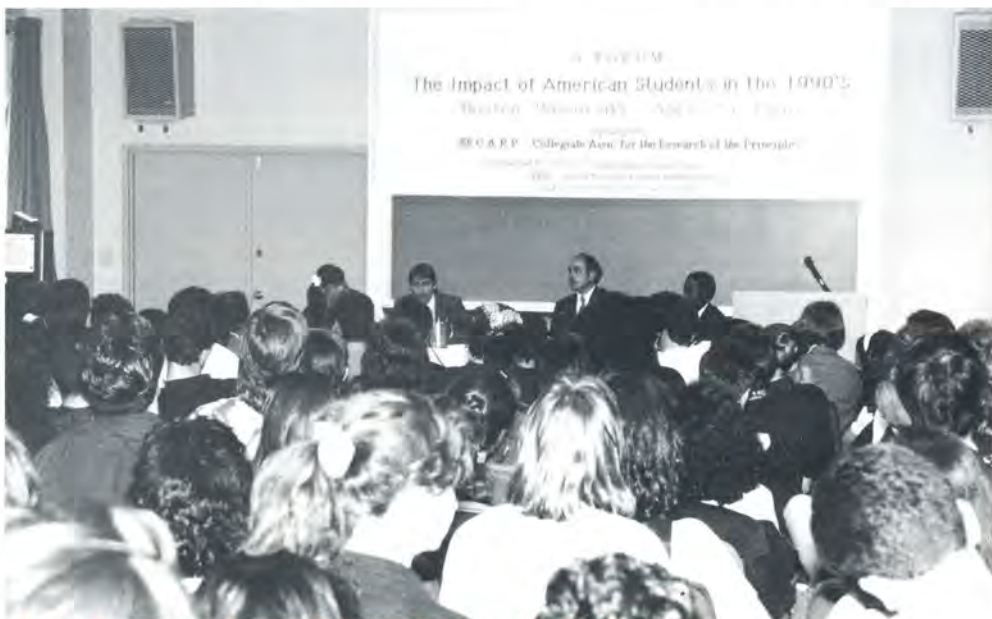
A standing-room-only crowd attends the Boston CARP Forum.