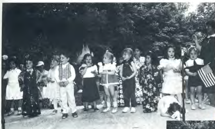
Children perform at Jin-A Open House.