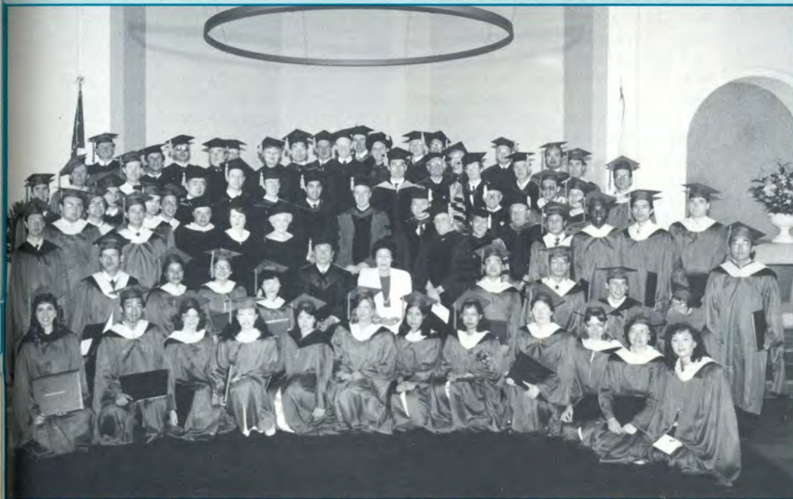
The 14th graduating class of the Unification Theological Seminary holding their diplomas, the first ones issued directly by UTS.