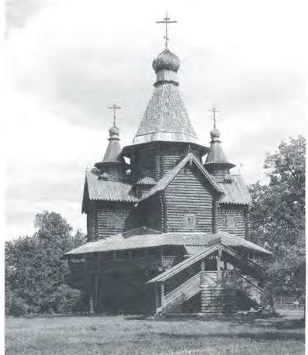
The Museum of Wooden Folk Architecture in Novgorod.

the unfinished sanctuary did not interfere with their gratitude over having the building returned to them. Over one