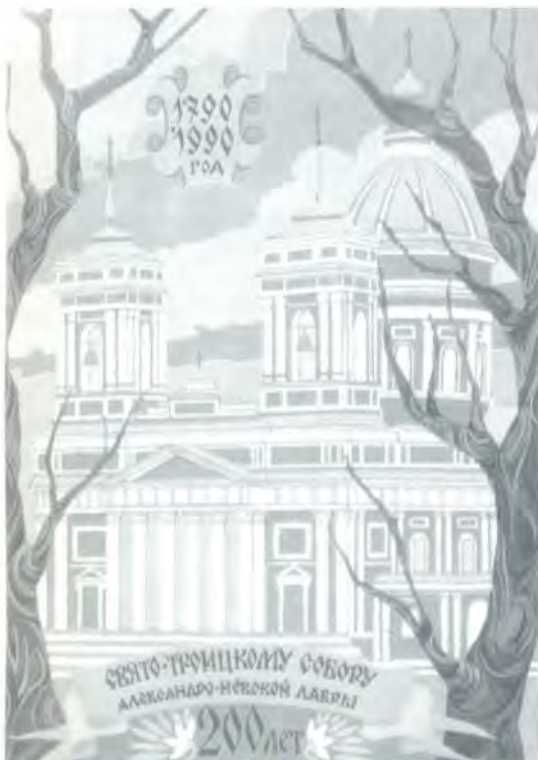
Russian Easter card depicting Alexander Nevsky Monastery's Holy Trinity Cathedral.