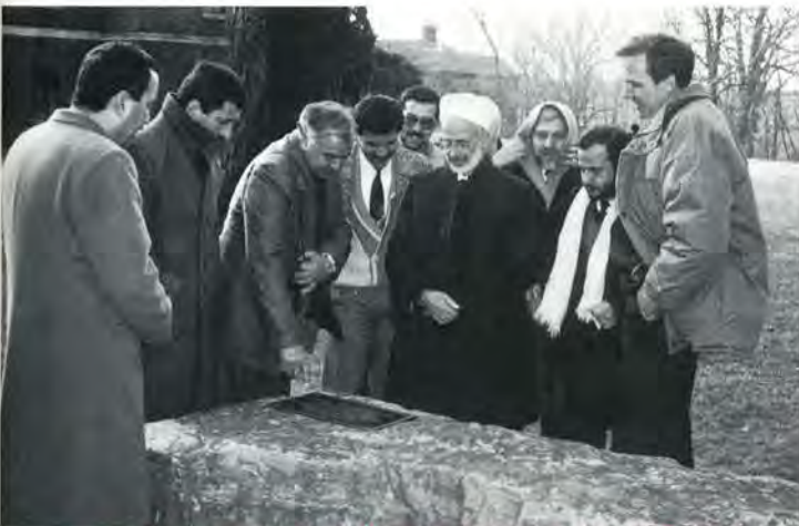
Muslims examine the dedication plaque at the Unification Theological Seminary.

True Parents invited them to East Garden where they recited poems congratulating Father as the "Conqueror of Satan." True Father responded by a moving speech in which he referred to himself and the Mufti as the two wheels of a vehicle which will carry the whole world to God. We were inspired by this