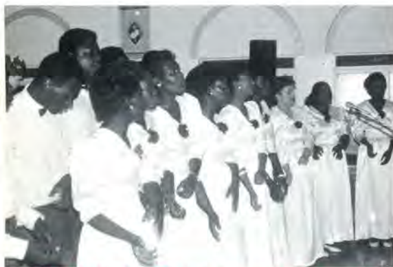
Our Unification Choir helps create a heavenly atmosphere during the evening.

The Unification Church Choir was chosen to open the religious night activities. Just prior to the event the three main Christian organizations, namely