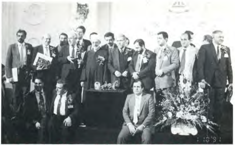
Muslims receive diplomas and gifts at the Graduation Banquet.