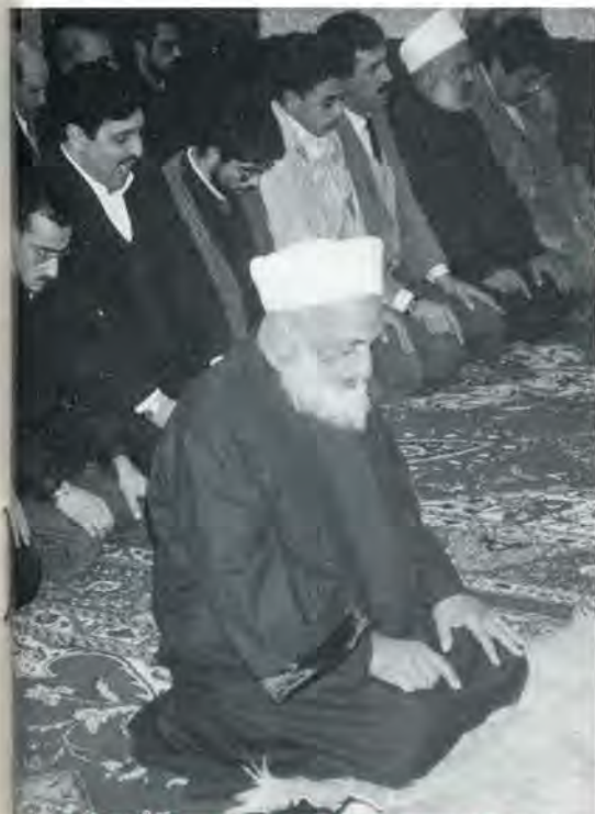
Grand Mufti Kuftaro leads prayer in Damascus, Syria.

A: It is different because this is the first time we, as a movement, are dealing with Muslims in this capacity. And it is not different because it is like other conferences or workshops which I have previously coordinated. I first heard about the Grand Mufti when I was working as a director of public affairs for the Unification Church of America. Because I come from an Islamic background, I was deeply interested and hoped to follow the development of our relationship with him. I feel the spirit world had been working to bring me to this mission. For example, the first time the Grand Mufti