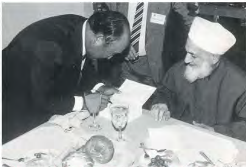
Father receives a copy of the Quran signed by Grand Mufti Kuftaro.