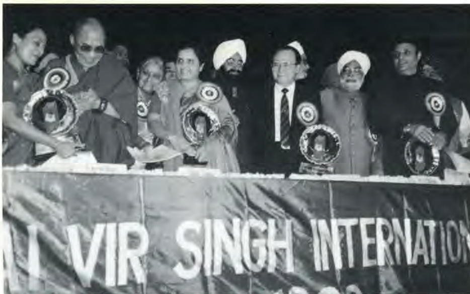
His Holiness the Dalai Lama (second from left) presents the Bhai Vir Singh awards.

him to become actively involved with the IRFWP. The Dalai Lama is a very genuine man who gives off a deeply spiritual presence. He seems to be a simple man from the mountains and yet is not someone to be underestimated for the spirituality that resides in him.