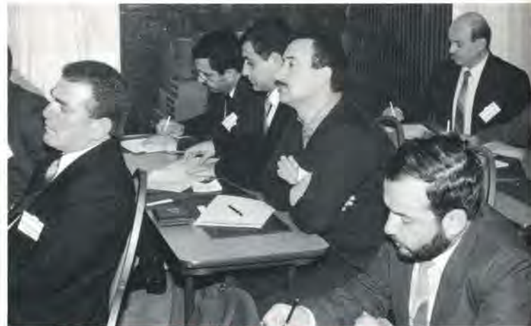
Muslim participants listen to a Divine Principle talk.