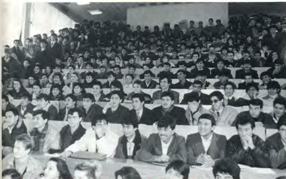
Students pack each row to attend the Divine Principle lectures.

dents are wary of messianic figures and universalist movements.