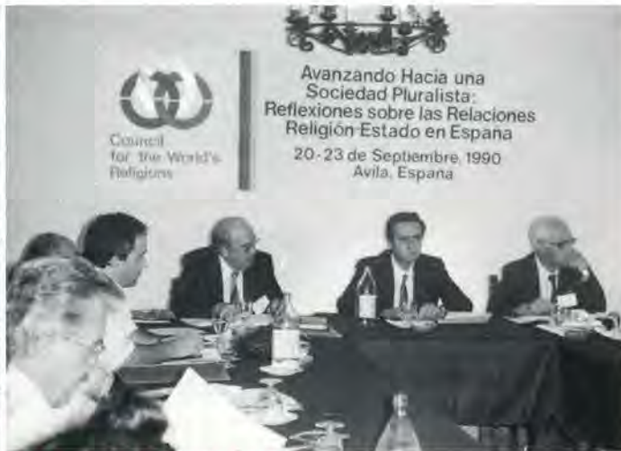
Religious leaders and specialists on national and ecclesiastic law discuss religion and the law in Spain.