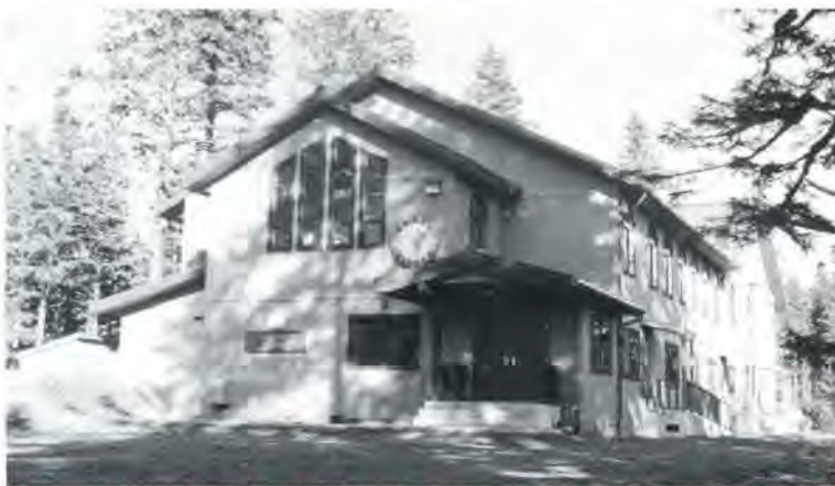
The newly built Kodiak Church was dedicated on December 15, 1990.