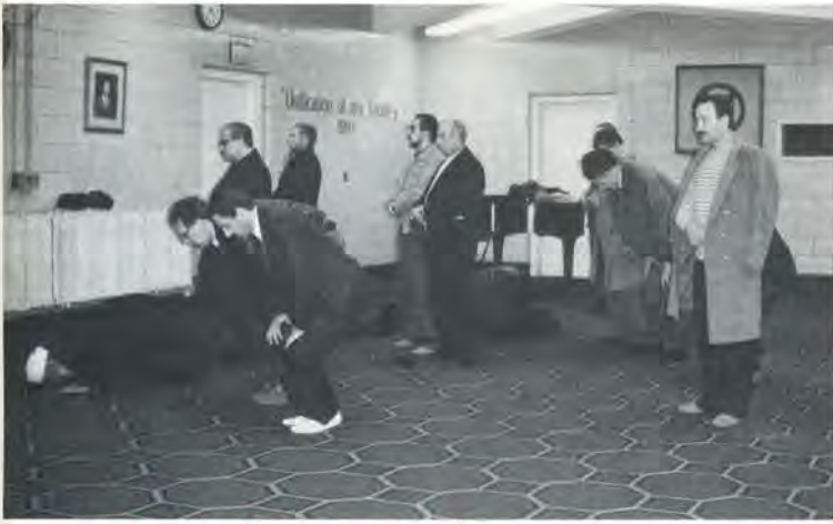
Participants offer bows at Belvedere.