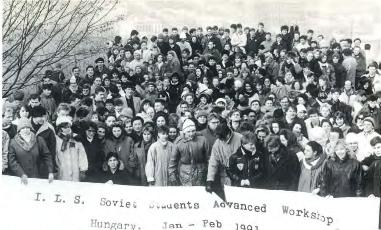
Students gather into a grand assemblage for the seminar photo.

The CARP staff just collapsed. Everything else was completely prepared! By an absolute miracle, however, the students and their parents pitched in and helped. The next day, the doorbell of the Moscow CARP center kept ringing and ringing with students bringing small