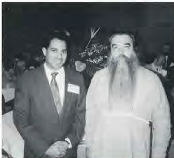
The Metropolitan Philaret represents the Russian Orthodox Church tradition.

Father, our spiritual master, has trained us to respond to all situations and to all other human beings with only one thought in mind: "In what way can I truly love?" We are being trained in the