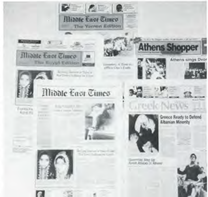
Five weeklies are produced in Athens.

been a very good quality readership—the diplomatic community, the international business community, expatriate English-speaking people within the region. In addition, there is a market that begins small, but is ultimately the most important and the biggest market: natives who speak English and appreciate a quality, objective, well-edited publication about their own region. This particular readership is the most interesting and has the greatest potential for growth, because everyone in the world is trying to learn English, with many of them having been educated in the West. This is the point of communication between the Western world and Middle East. Father has