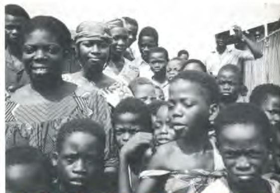
A few people from the small Benin fishing village represent the 150 members of their village and Christian church who now follow True Parents.

This witnessing condition was a great experience with Heavenly Father's deep heart. The language difference presented an additional external difficulty. Everyone knows how much Japanese people love to eat miso soup and rice everyday! Although the food