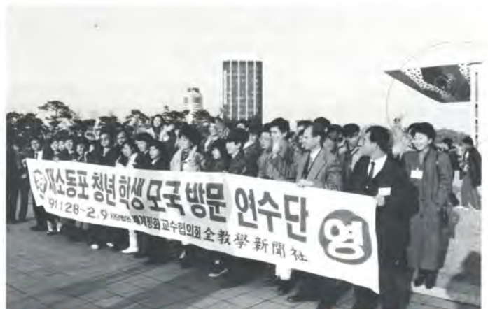
Soviet Koreans visit Olympic Park in Seoul during their first visit to their homeland of Korea.