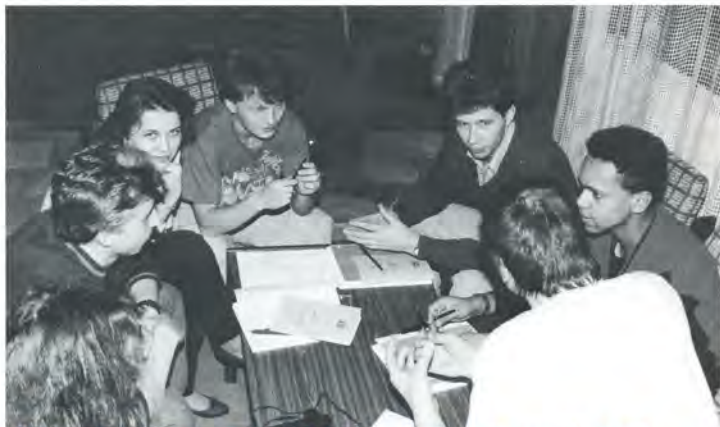
Discussion groups after each lecture were well-attended and animated. The students' questions delved into the depths of the Principle, enabling them to grasp the meaning and importance of what they were hearing.

One night we decided to pray. When there hasn't been a Christian foundation for three or four generations, it is awkward to even suggest prayer. We felt they had to experience prayer, first by being in an environment where we prayed and then by praying themselves. Some of the students were advanced from previous lectures; they had studied prayer and some were actually trying it. But most of the students didn't know prayer. So we decided to have an evangelical night at the end of one day's lectures. We closed by singing "God is not dead!" calling everyone up front in an informal group. Many people came reluctantly, while some just stood back. The majority of people standing up front were clapping, singing, and having a great time. Directly after that, I began to cry during an in-