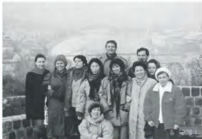
With the city of Budapest as a backdrop, a small group from the workshop huddle together in face of the Hungarian winter.