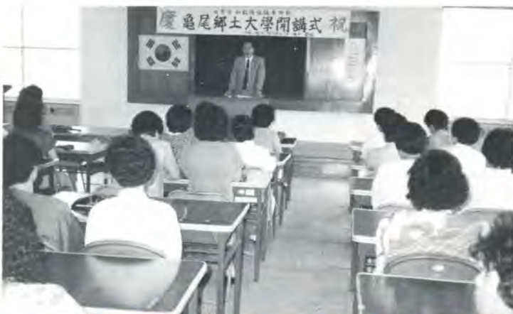
Housewives attend the community school where professors give lectures to help better the lives of families.

we sponsored a six month expedition to the Yangtze River in Mainland China, led by our Korean CARP Scuba Diving Team and accompanied by the Korean Broadcasting Station (KBS) camera team. A documentary film on the expedition was shown last month in a series of eight parts over two weeks on TV and gave a good impression of our work to the viewers. Most of the Korean people have a great interest in China but have never had the