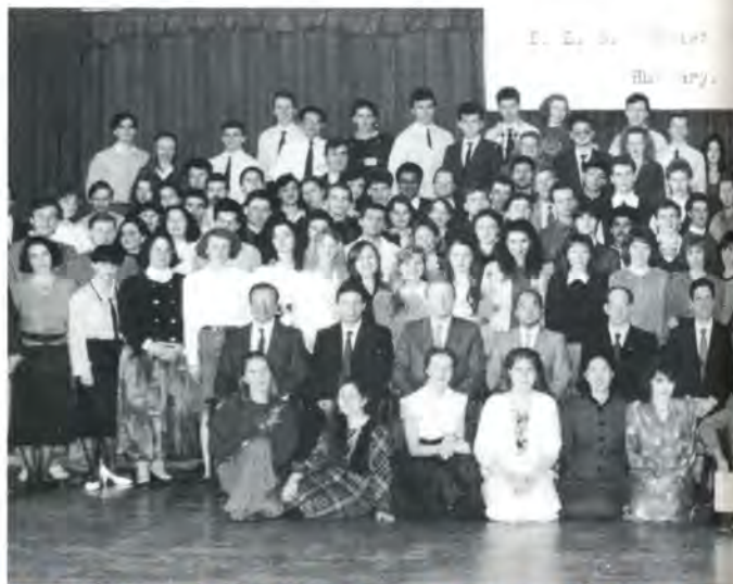
This is just one-third of the students who studied the Principle in

Signing membership is for the purpose of connecting their whole ancestry to True Parents. We told them they represented the Soviet Union and the generations under communism. Some of them were moved to tears by that deep realization. They felt they could save the generations that had suffered so much under communism, but they had to grow up fast.