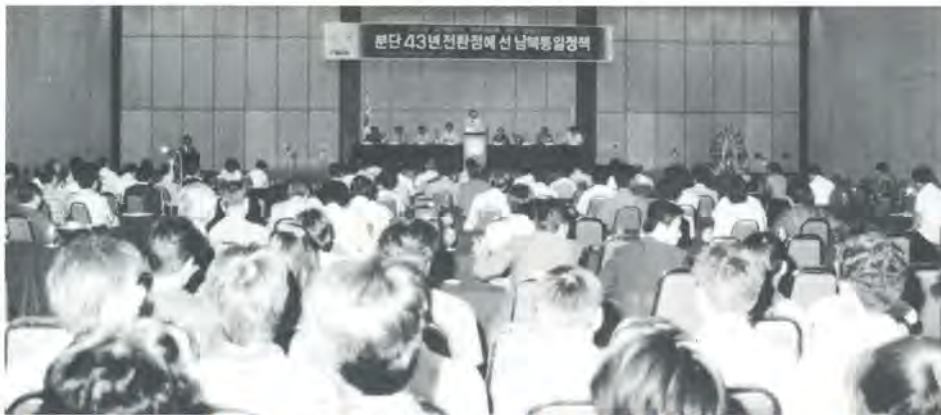
Participants attend the PWPA Conference entitled: "Policy for North-South Unification at the Changing Point."

chance to see such documentaries, since the government had forbidden showing movies about Communist China. However, now the government is eager to establish diplomatic ties with mainland China and was very pleased to see such an in-depth film on China introduced to the Korean people.