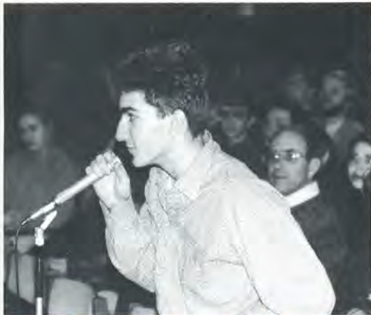
This student is posing a question to the nightly panel; the students were serious and always very detailed about what they needed to know.

is experiencing the Principle. We're not going to change their lives by a series of lectures; we've got to practice the foundation of faith and foundation of substance. That's really the issue and the crisis in the Soviet Union now.