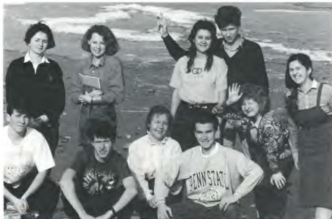
Nature walks, such as these students walking on the iced-over river that meanders through Hungary's capital, helped the Russian youth to "come out of their shells."