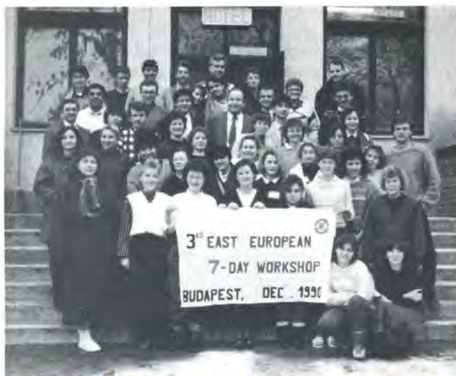
Guests from six countries joined together for a seven day workshop in Budapest, Hungary. The lectures were translated into Polish, Bulgarian, Czech, Hungarian, Serbo-Croatian and Russian.

About the fifth day, the four of us went out to pray at night on a mountain ledge in the forest. We were singing "Angels Watching Over Me" and we witnessed about ten shooting stars. One day some of the East European members wondered why we were laughing so much, then someone walked over to me and said "You are able to laugh so much during the day, because you spend time crying togeth-