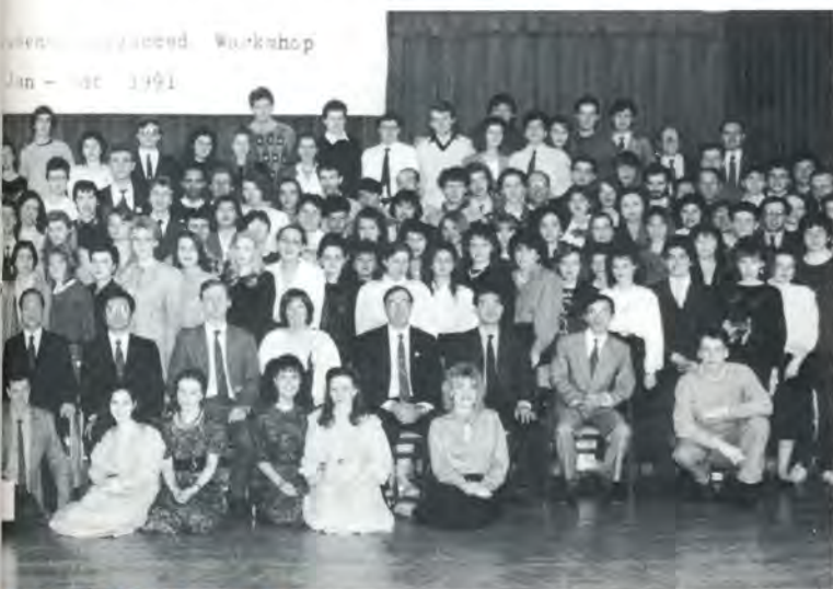
Hungary. What a crowd!