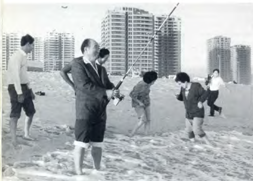
Father casts a fishing line at the Barra da Tijuca Beach, while Mother and others frolic on the beach.

So, the first presence of Rev. Moon in Brazil after these lamentable facts, even