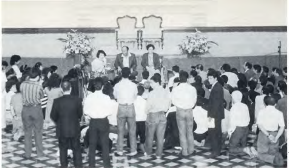
True Parents surprised brothers and sisters painting and cleaning church headquarters in Sao Paulo with an early visit. Two hundred members tearfully welcomed True Parents.

Saturday afternoon, and most of the members didn't sleep that night, preferring to stay in line in order to get a good place in the audience. The church was completely full before 5 a.m. After several Holy Songs, True Parents arrived a few minutes after 6 a.m. to an incredible hand of applause from an audience of about 2000 people. Our brothers and sisters were so interested to see how True Parents' acted—how they walk, how they talk, and so on—that it was hard to focus on Father's words. Many times we couldn't understand clearly what Father was asking but we always gave positive answers, that speech was more heartistic than intellectual. We could hear several strong "Sim's" from the audience, which means "Yes" in Portuguese. In fact, it was one of the first words learned by Father when he arrived here. He himself repeated it a couple of times and began laughing. He was glad to see all the brothers and sisters answering "SIIIIIIMMMM, Father!" After the speech we gave True Parents a big gold key with a Unification Church symbol on it. True Parents cut the three-level cake to celebrate their coming to