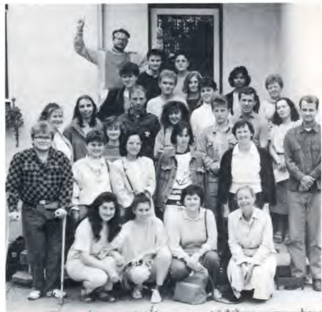
Students attend a seminar to prepare them to participate in the World CARP Convention held in Paris in August 1990.

A: What touched me the most was knowing that Father said he was always crying when thinking about the brothers and sisters behind the Iron Curtain. We could feel this very strongly. When we were in East Garden and Korea they showed us the places where older Korean sisters were praying for us. We