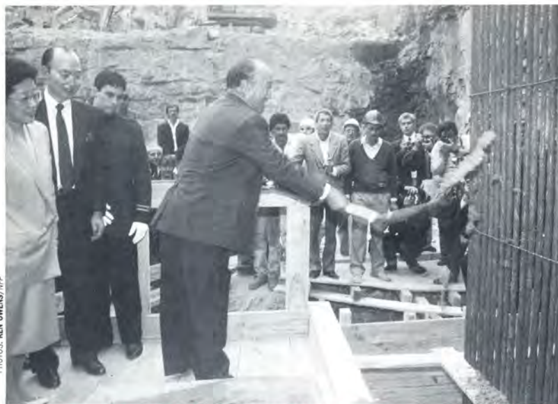
Father throws the first shovelful of dirt onto the construction site during the unveiling of the new 5-star hotel's cornerstone.