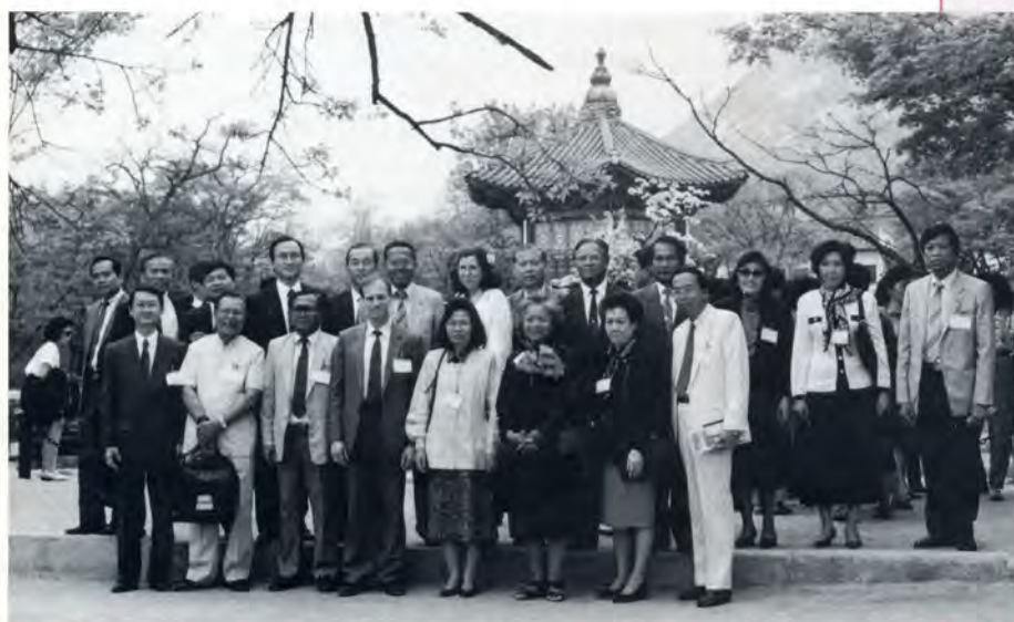
PWPA professors from Thailand visit a famous Buddhist shrine in Korea.

First, he taught us how to fast. He stressed the importance of overcoming our desire to eat. There were two kinds of fasting: one where you didn't eat or drink anything, and the other where you drink spring water. Secondly, he taught us how to overcome sleep. He showed us by teaching us until the early hours of the morning; then we would get up at 4 a.m. for daily morning prayer. When Rev. Moon was sixteen years old, God gave him directions to establish a world of goodness. He knew that he wouldn't have enough time in his lifetime to do this, unless he gained more time by sleeping less. To this day, he sleeps no more than three hours. Thirdly, he taught the need to overcome sexual desire. He said that we have to maintain the order of love. Horizontal love between husband and wife cannot be divided with anyone else. It must be absolute.