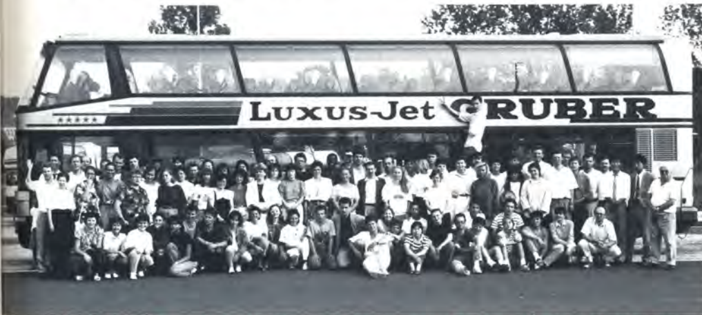
Austrian and Yugoslavian brothers and sisters get ready to travel to Paris for the 1990 World CARP Convention.

It is very important now to work toward a unified Europe. I am sure Europe can have a lot of impact on the worldwide level, through unity in the church and also externally. Many European philosophies, including Marxism, have had a big impact on the world. The United States offers not just freedom, but also the possibility to live a very high standard life economically. Combining these together under the guidance from the True Parents will eventually lead to a unified and prosperous world. □