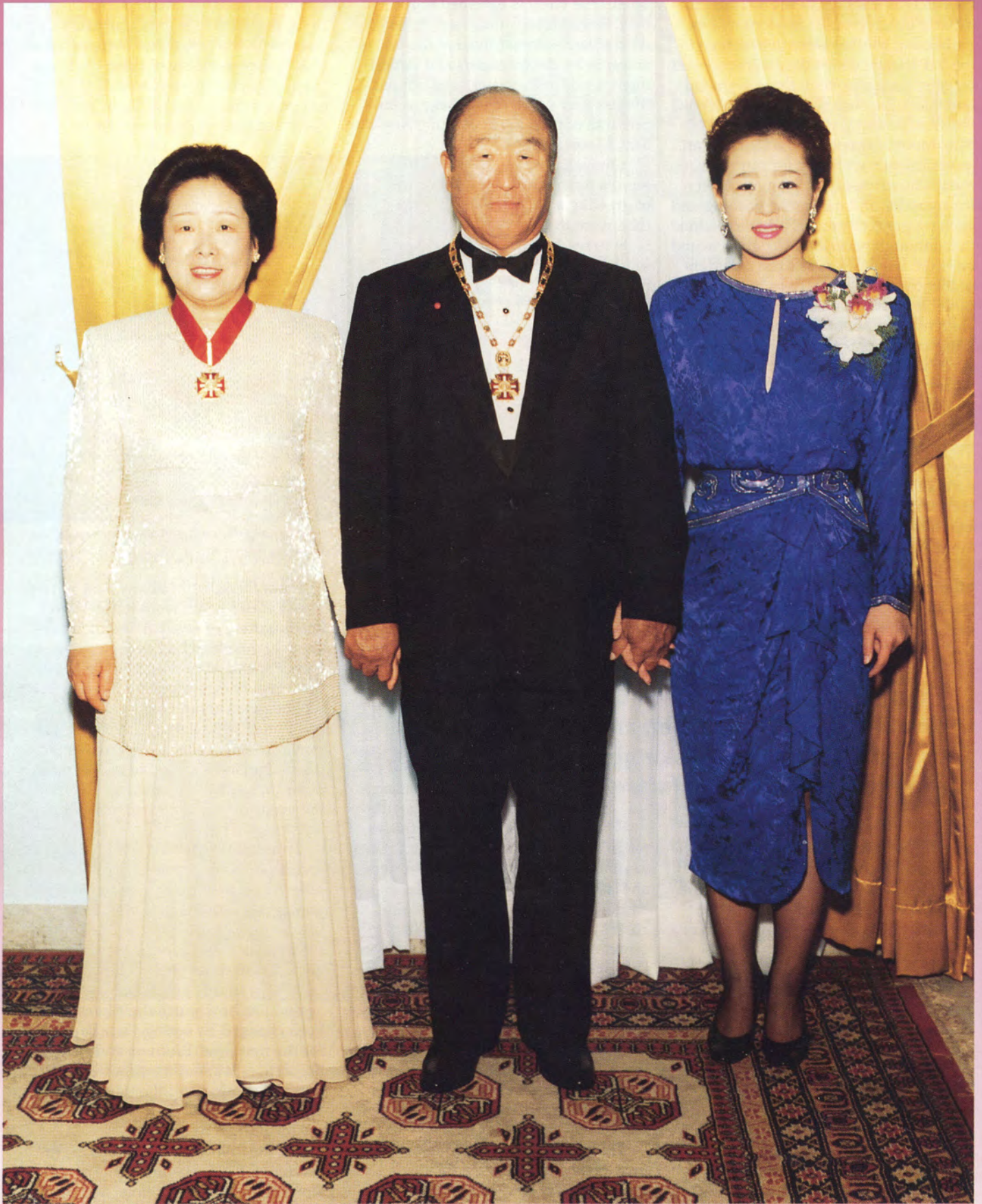
True Parents, honored as true patriots of Brazil, wear the Heraldic Medal of Brazil presented to them during their historic visit.