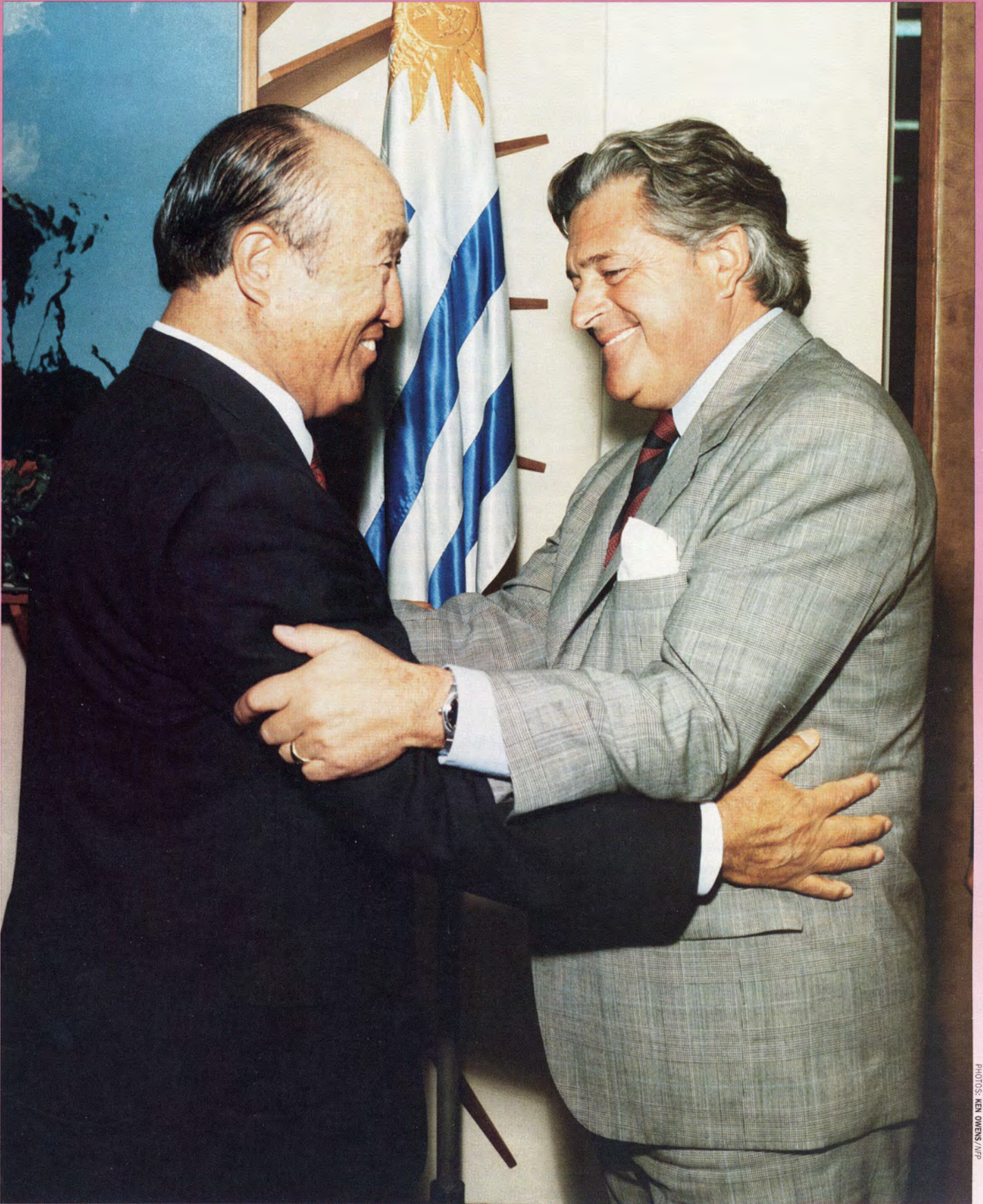
Father and Uruguay President Dr. Luis Alberto Lacalle embrace as they meet at the President's office.