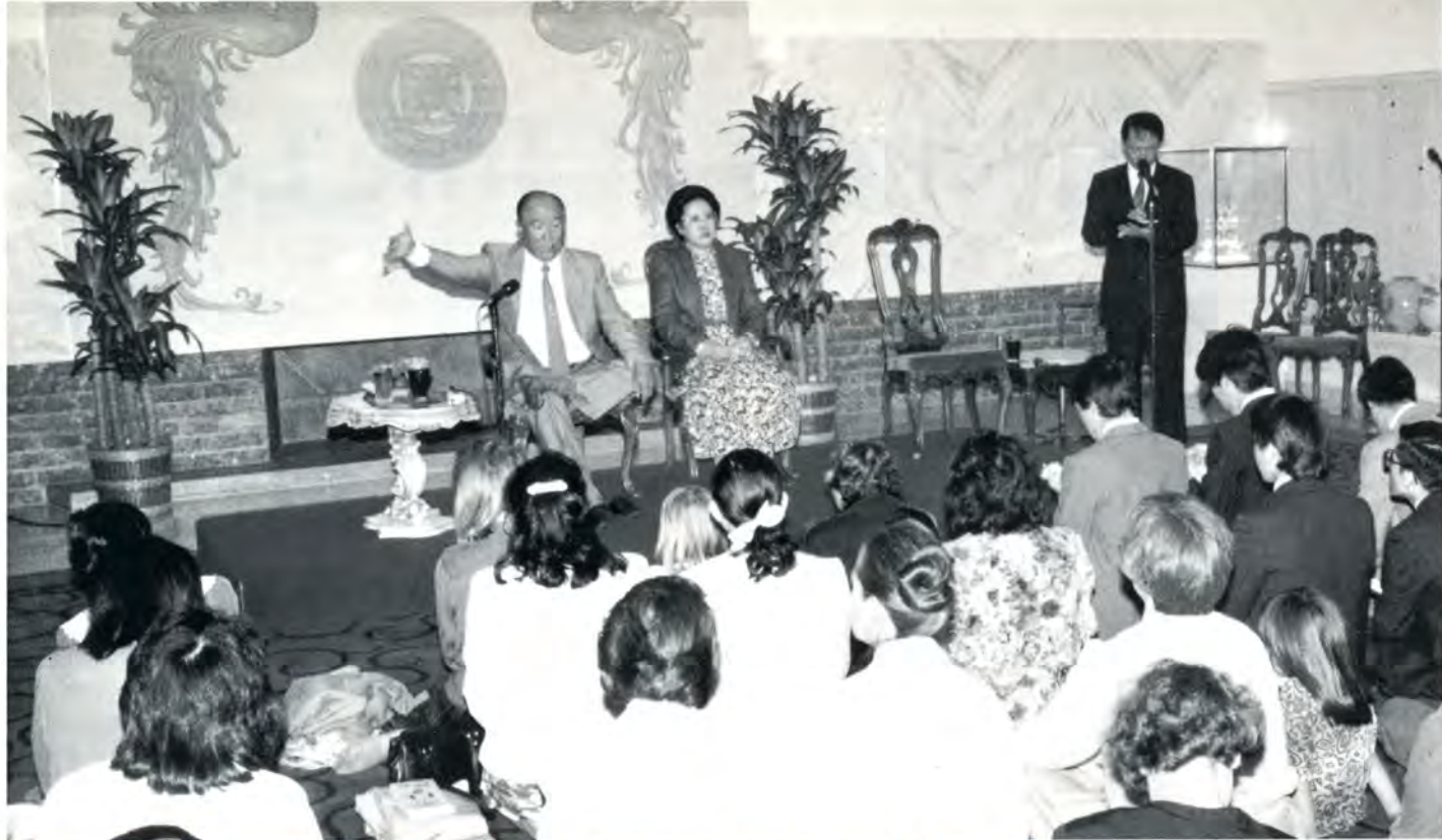
KEN OWENS / NRP