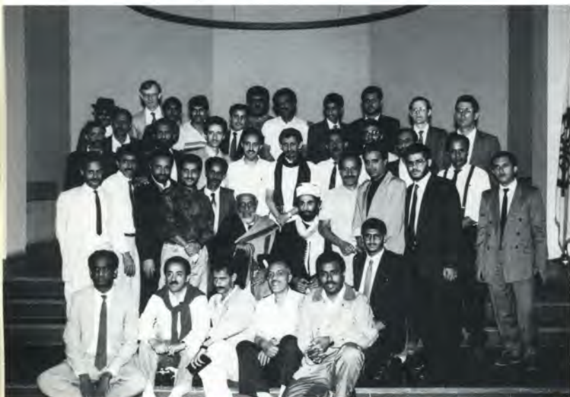
Yemeni participants of the recent 40-day Leadership Conference visit the Unification Theological Seminary in Barrytown, New York.

A: Yes, about studying Islam. There are several ways to study a religion: one can read all kinds of books or get in touch with the followers; but the best way I discovered to study a religion is to study the life story of the founder of