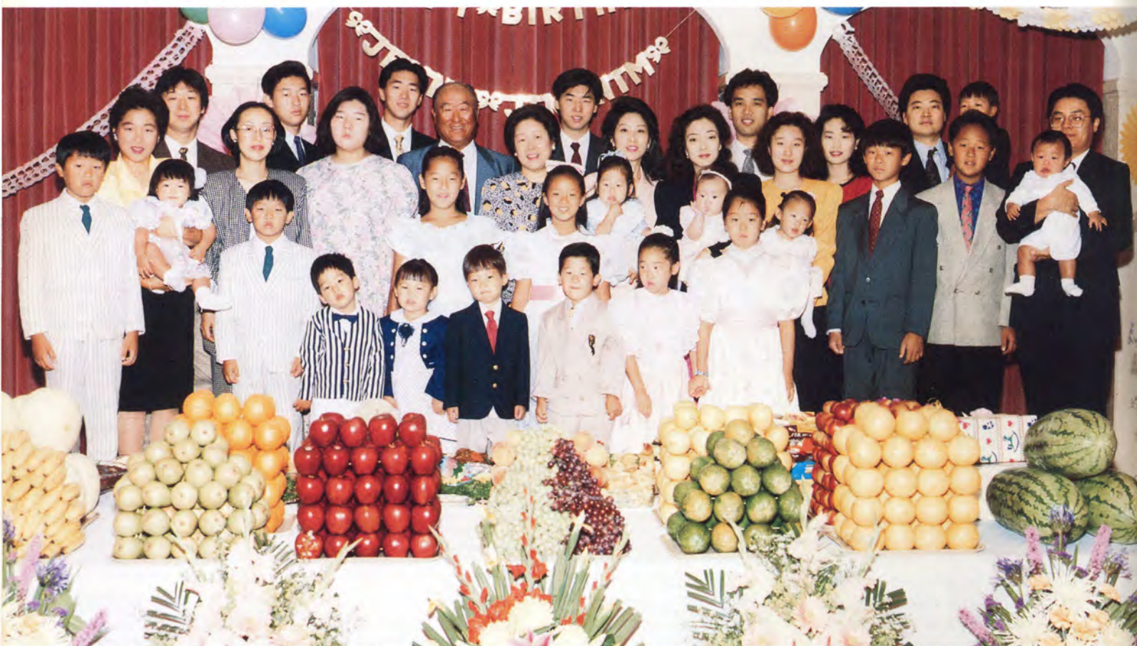
The True Family gather for a photo on the occasion of Jeung Jin Nim's 9th birthday celebration on June 13 in East Garden.

After the restoration course or recreation course centering on God, all of humanity would have recognized the comple-