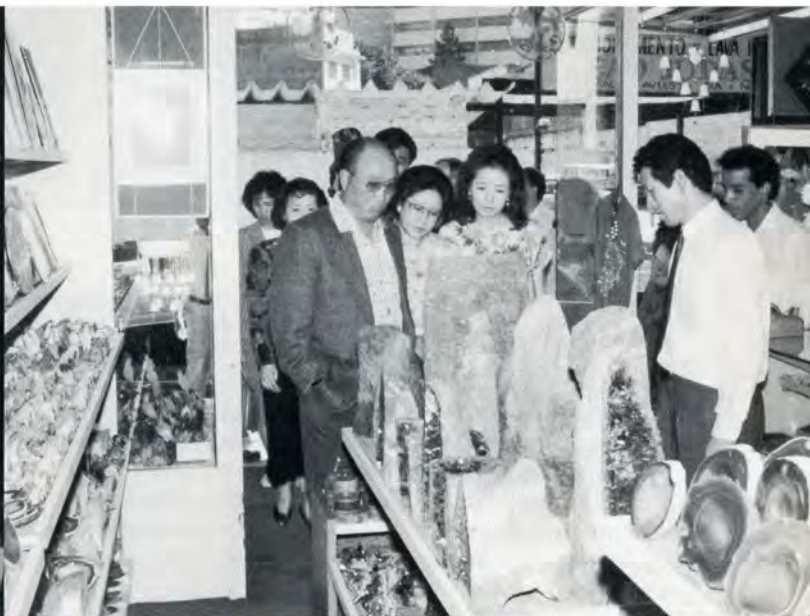
During his recent trip to Brazil, Father visited businesses owned by church members: left: a bakery, right: a gift shop.