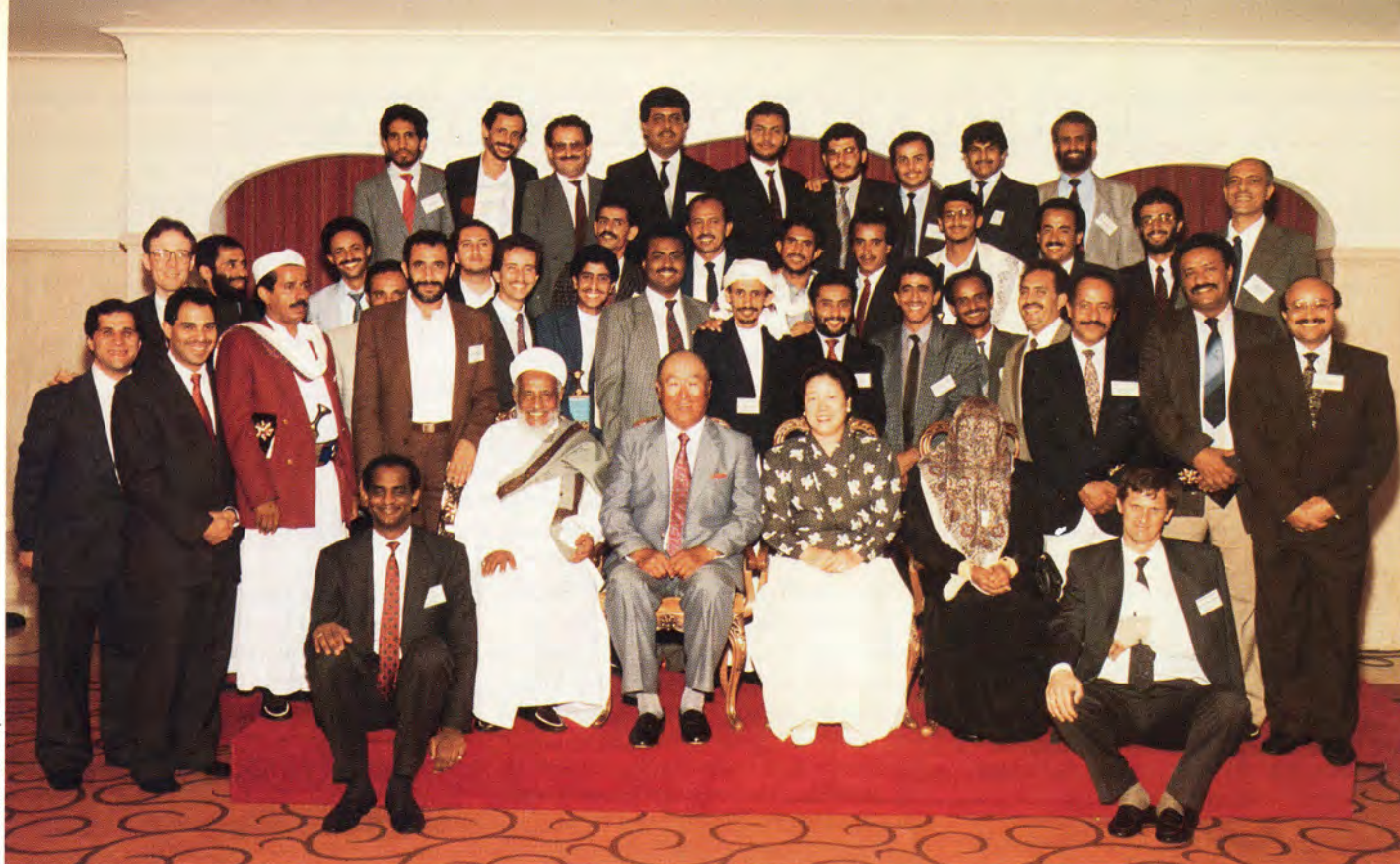
Yemeni participants of the 40-day Inter-Religious Youth Leadership Conference are invited to have their photo taken with True Parents.

from the beginning of the conference we made it clear that this was not a church per se, but the Unification Family. The participants could relate to this concept without the sensitivity involved in relating to most Christians. Arabic people are very family-oriented. Through the Unification Thought lectures they could understand how we must perfect our love in all different directions, with the family providing the base for building the Kingdom of Heaven on earth.