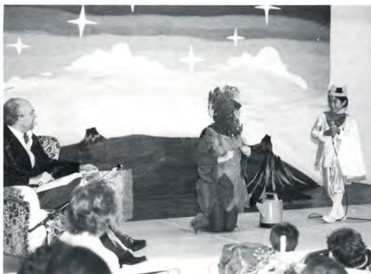
The evening performance of "The Little Prince" delights the audience.