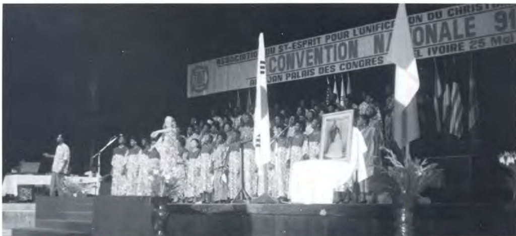
The Unification Church Choir performs for guests invited from all over Cote d'Ivoire.

One thousand people, including our members, gathered at the Hotel Ivoire