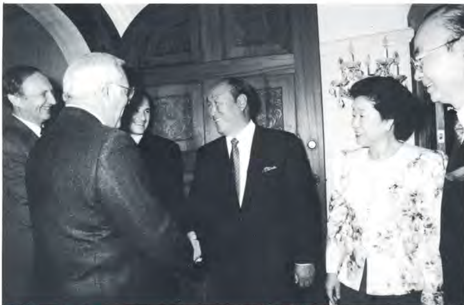
Father and Mother welcome Soviet participants to East Garden.

The son who was religious was actually his second son. When he understood how God had often chosen the second son in providential history, he felt that if his son was religious, it was not because of any failure on his part as a father. It was simply due to his position as the second son. This gentleman was so deeply impressed by Father's message that the day after the visit to