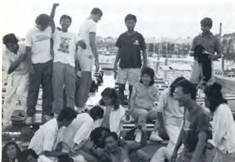
Several of the Second Generation participants of Ocean Challenge in Gloucester return to port after fishing all day.

The very next evening, the eldest son of the family I would be staying with showed up at the door and said, "Let's