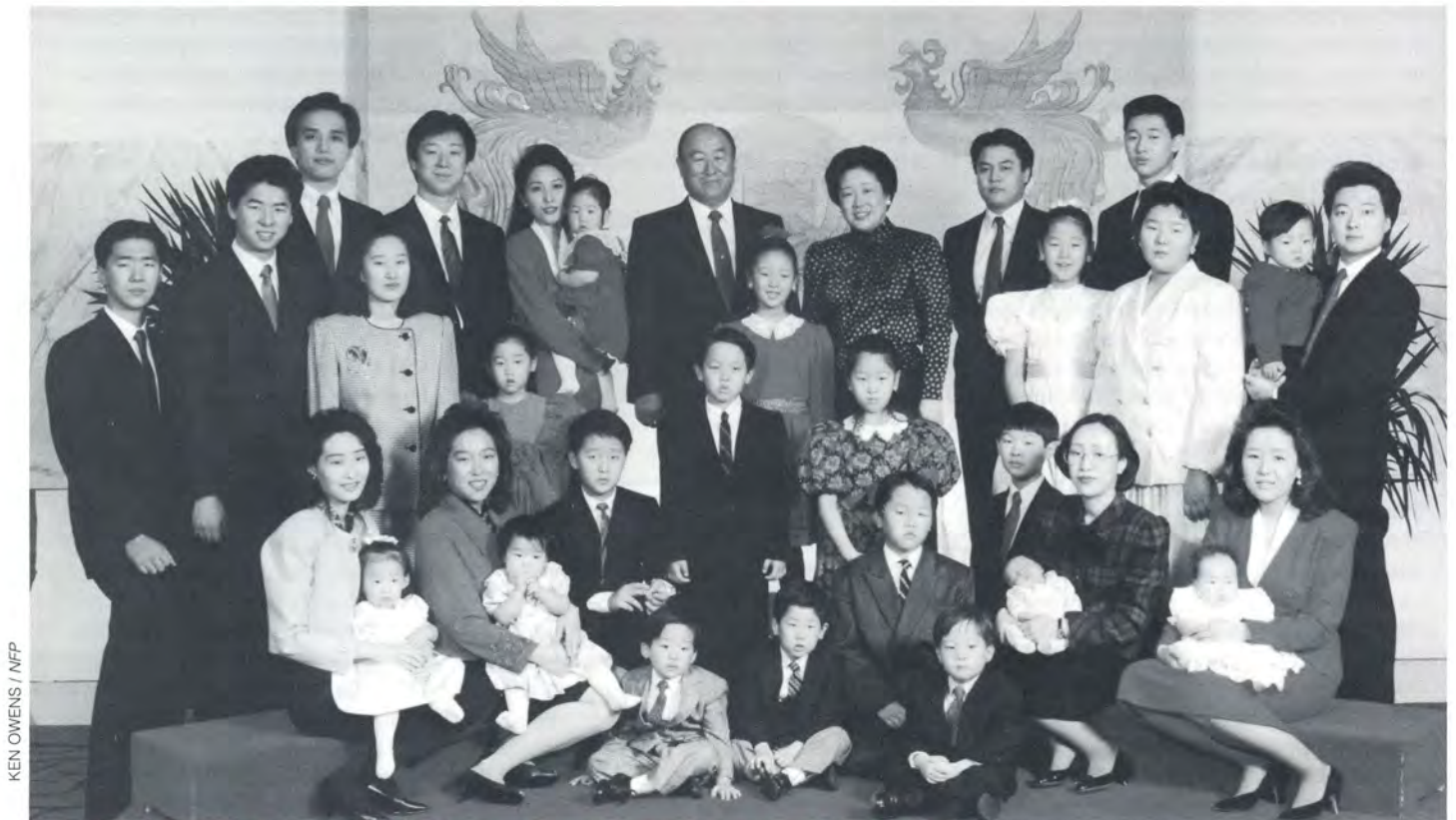
The True Family gathers together for a group photo at a recent occasion at East Garden.

"Young" means "glory." "Yeon" is "beauty"—so God will be glorified and