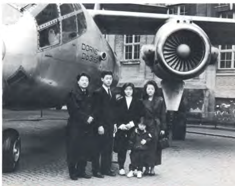
While in Munich, the True Family visits the German Museum of Technology and Industry.

So tell your children to study hard; also tell them that the True Children are coming very close to a straight A standard. Help them to understand how much harder it must be for the True Children to accomplish that and how they should do the same.