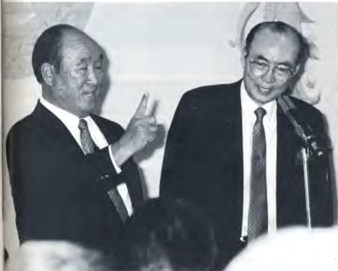
▲ Father delivers his talk with Dr. Bo Hi Pak translating. ► World Leadership Conference participants vigorously applaud Father's comments.

Sharing Father's thought with very sophisticated individuals including many intellectuals, government officials, and even heads of state has given me absolute conviction that there is no other philosophical or theological system which even approaches what our True