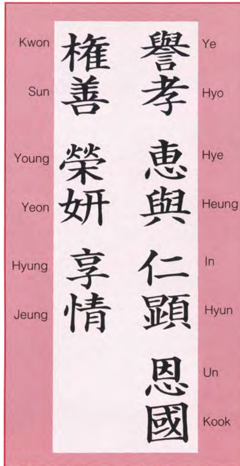
The Chinese characters for the True Children's names.

Fitting the True Children's names together in this order is like a poem. When you write poetry in Chinese characters, it is not like English poetry. It is not so much the rhyme scheme or meter that is important; putting the Chinese characters in a certain order gives you a