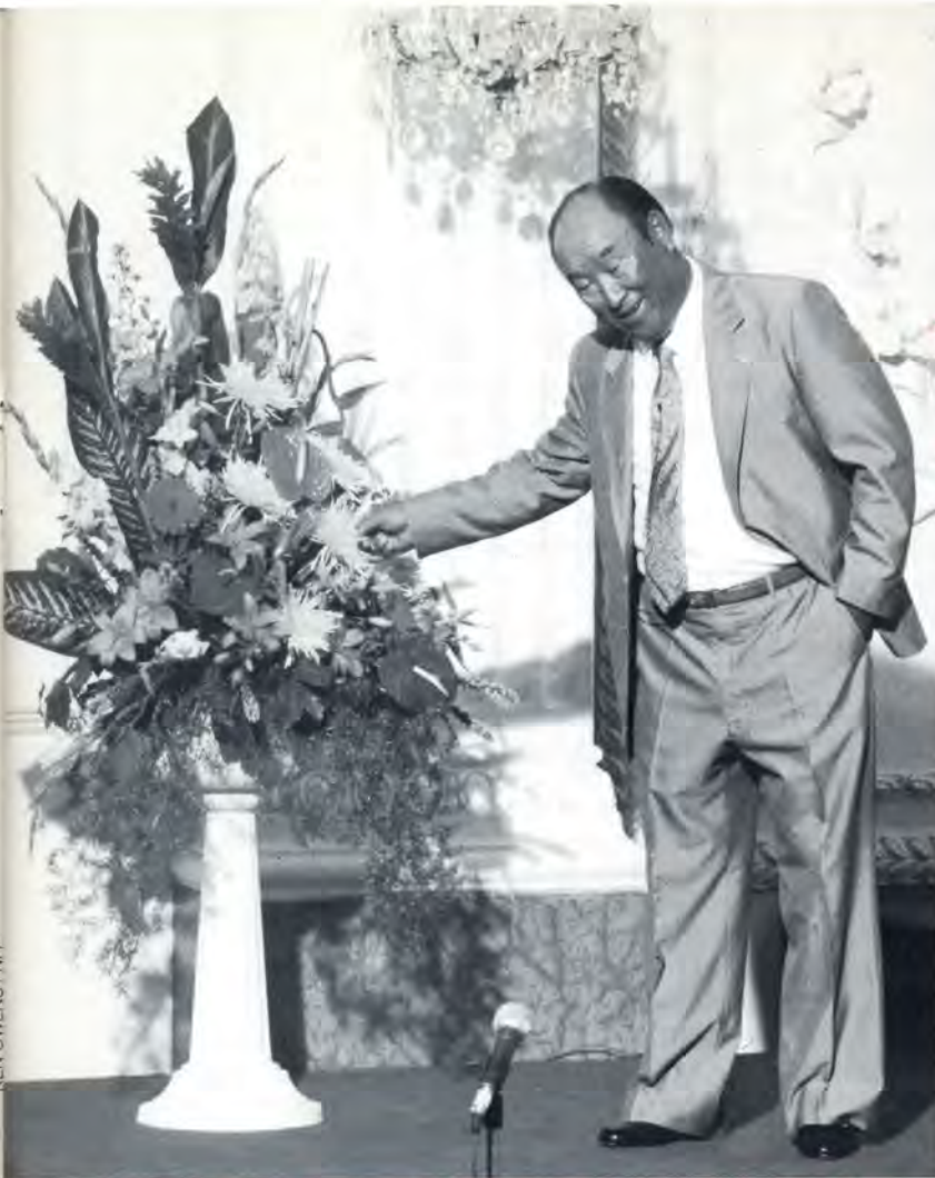
Demonstrating the appreciation a true man has for all things, Father lovingly touches a flower from the celebration bouquet.

there is no meaning to being alive. You may think, "Well, they can exist just by themselves." But there is no such thing as "just by themselves." Everything is created to exist in pairs, like God and man.