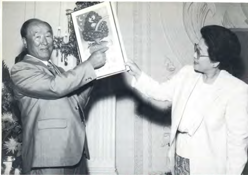
Father and Mother hold up the Happy Day of All Things card for everyone to see.

to go into your lungs: "Mansei!" Our work is holy, because we are surrounded by love fruits. Every morning we are awakened by sounds of love. Every morning will be a mansei morning!