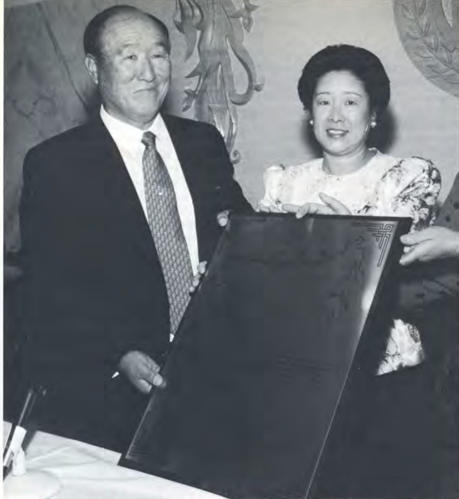
True Parents receive a plaque honoring their friendship with the Soviet delegates.