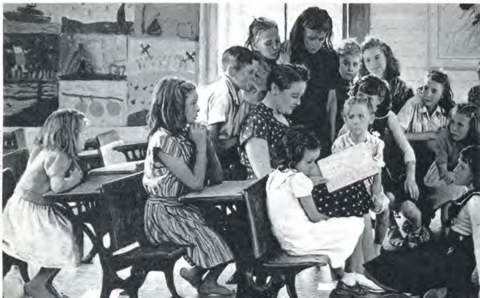
School is the second home and teachers are the second parents.

We need to know such things when we are raising children. Which education is more important? A Unification Church education is much more important than a Harvard, Columbia, Yale, Princeton, or Stanford education. In 1638, Mr. Harvard established Harvard University to make Christian ministers. Today, what percentage of Harvard graduates become ministers? It's a sorrowful thing. Until the end of the seventeenth century, around fifty-seven percent became ministers. Now it is maybe two or three per-