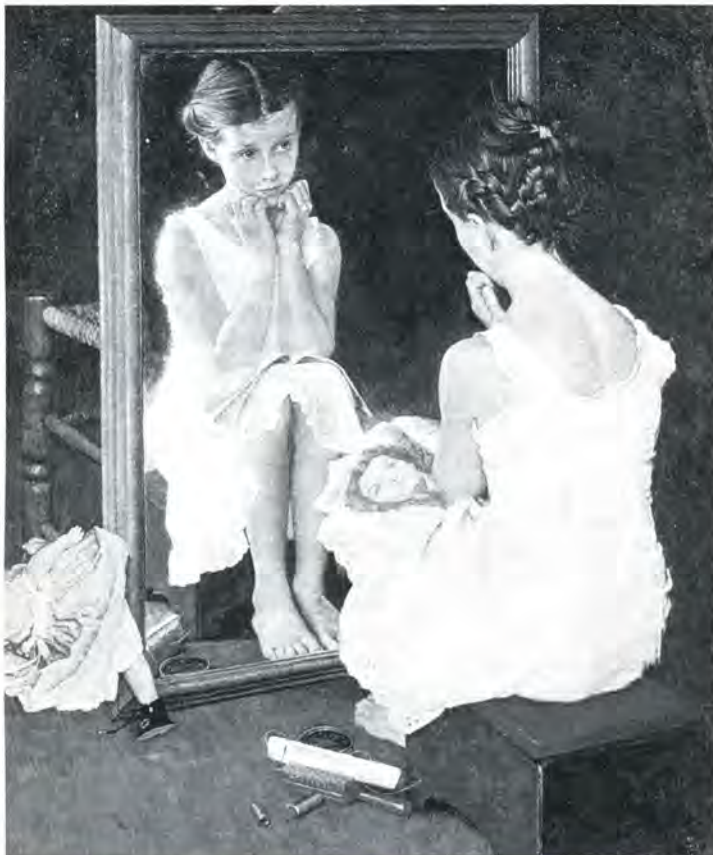
Internal truth is more significant than external truth.

Usually at night time we put our children into a small cage. (I call a crib a cage.) We put him or her in the corner of the room so the husband and wife can be together. It means, "We don't like the vertical love between us and the child. We like only horizontal love between wife and husband." What will children learn from such parents? They grow up and when they are around thirteen or fourteen years old they think, "I need my horizontal object. I don't care about my parents." It's because their parents had that attitude. We don't need a bed for sleeping. A bed is small so it is too narrow for husband and wife with a baby in between. So I suggest to take the bed out. Without it we can sleep very nicely on a soft carpet. Most people who like soft beds have back problems around age forty. Many of us have back problems because of soft beds and chairs. Usually, I sleep on the floor or put a wooden panel on the bed under the sheet. I must take care of my back. American pillows are too soft, too. Our head sinks into it. As much as possible our pillow should be a little stiff. One time