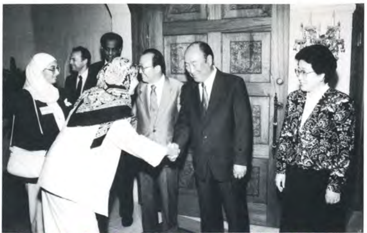
True Parents welcome the Yemeni (left) and Egyptian (right) participants to the forty-day seminars. These were followed by the Jordanian, Turkish and Sudanese seminars with about forty participants each. The Sudanese workshop finished March fourth and its participants are pictured below.