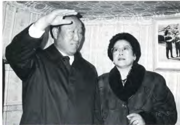
As Father and Mother in stand Father's boyhood home, he describes his early life.

Some days she could tell in advance exactly who would be coming to our house to visit. She could also read a person's character very well. I think she knew what kind of person True Father was to become. She would give pocket money to True Father but never to us. True Father received a lot of love from my mother. My older brother often complained of this unfairness. For sure, my mother loved True Father more than us. I believe there is a special meaning to this. However much she looked at us, she could see nothing, whereas she could see that True Father would become an important man in the future. It is only my thought but I believe she saw that True Father would save her sons.