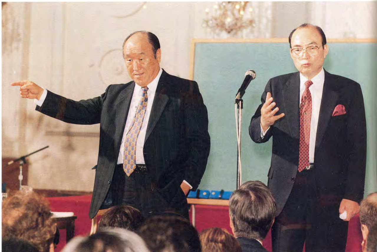
Father says to the national leaders, ministers and missionaries, "Have you really lived risking your life, sticking your neck out?"

You must feel you represent God as well. People do not know that. You know you are a representative; however, you are not just representing the United States of America. You are