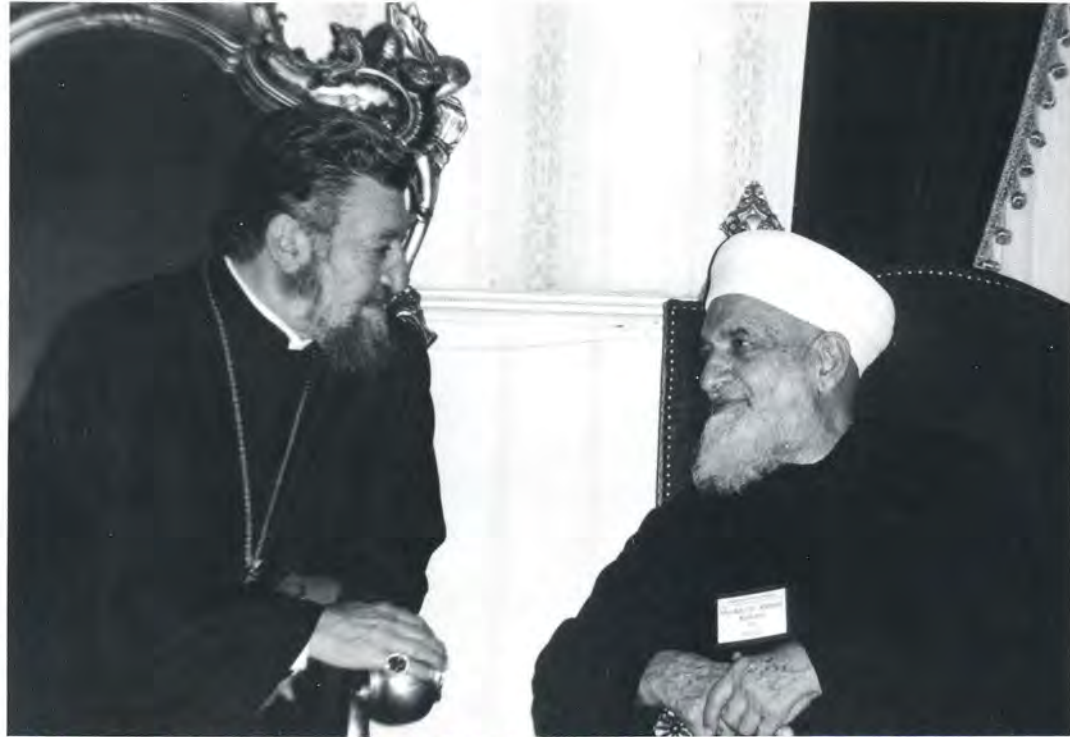
His Beatitude Karekin II converses with His Eminence Sheikh Dr. Ahmad Kuftaro, Grand Mufti of Syria. This was the first time that Muslim leaders had visited the Patriarchate in over seventy years.

The conference was designed to examine the full spectrum of Christian-Muslim relations that exist in the world today. Approximately sixty participants from twenty-three nations responded to the call bringing their unique national circumstances to the international gathering. Together they sought to chart a future path of harmonious relations. The tensions between Christians and