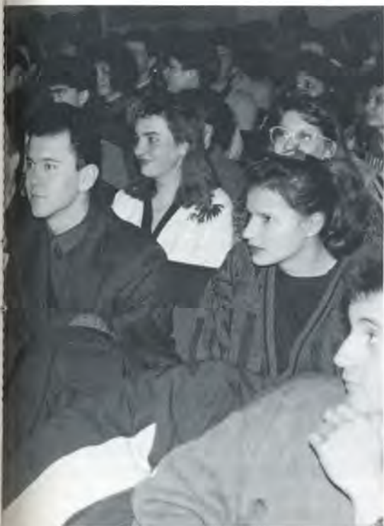
University students and professors attend Divine Principle workshops.

In each of the cities where our missionaries work, students were invited to orientation programs to hear about the