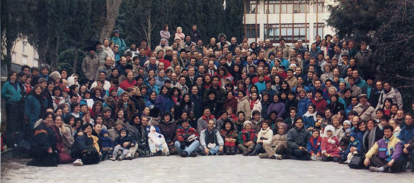
The volunteer staff from America gather at the Gurzuf Central Military Camp for a group photo.

and to the ILS program, I have been participating in their major activities, and advising them about follow-up. Actively involved in my hometown work in Kansas and USA activities throughout the country, my other responsibilities include the development of the education work for our movement. It is America, then, which is contributing to the ILS work. For instance, two hundred and fifty members of our movement here in America went over there this time. All of them volunteered and paid their own way. Some of them even quit their jobs and had to find new jobs when they