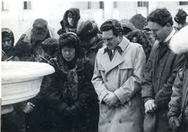
Representatives of the major World War II powers offer prayer at Lavadia Palace.

anymore. Although seminars continue, the idea of creating congregations and main churches, and deepening the roots of these people, is what is being emphasized now. So they are quickly moving into this new stage of growth; if it is successful, the move to the perfection stage ultimately will be the blessing of these new members. They will take over the movement there; that is Father's goal. The activity over there is advancing into