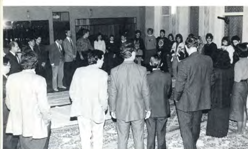
Workshop staff meet for introductions and prayer.

realizing. For instance: the breakdown of the family, immorality, drugs, and the manifestations of those things in terms of crime, AIDS, and so forth. People are beginning to realize we have a problem.