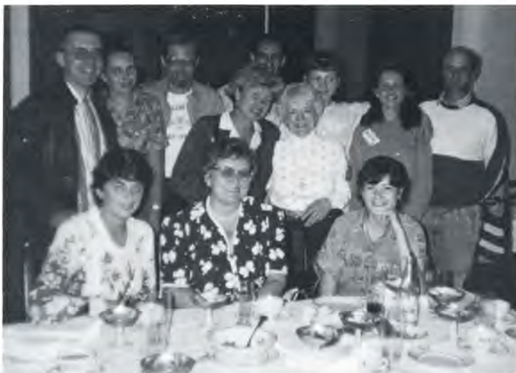
A relaxed moment after lunch at the Riga Hotel, Latvia, with the professors and students. Each group had a day of sightseeing in Riga where a restored portion of old Riga displays historic buildings, including churches one thousand years old.