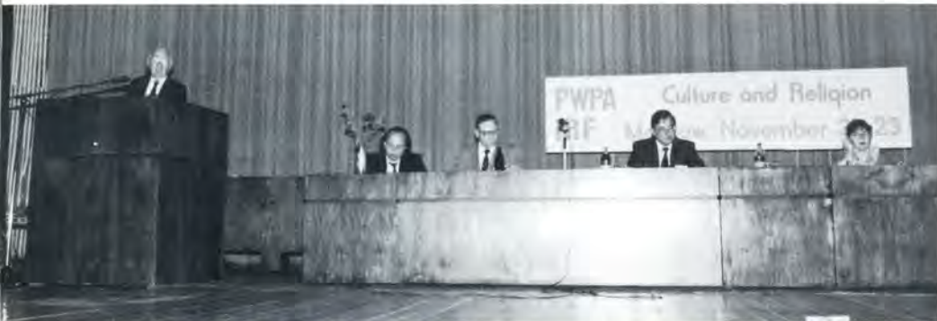
Professor John MacQuarrie of Oxford University addresses the seminar on Culture and Religion in Moscow. High-ranking Russian officials hear prominent religious leaders and dissident gulag veterans making presentations.

Truth cannot simply be relegated to science. It was a mistake for the West to try to jettison its traditional values and replace them with scientific knowledge. The reason why the great cultural traditions have lasted thousands of years is that they nourished human life. The teachings of Confucius, the Ten Commandments, and other great moral