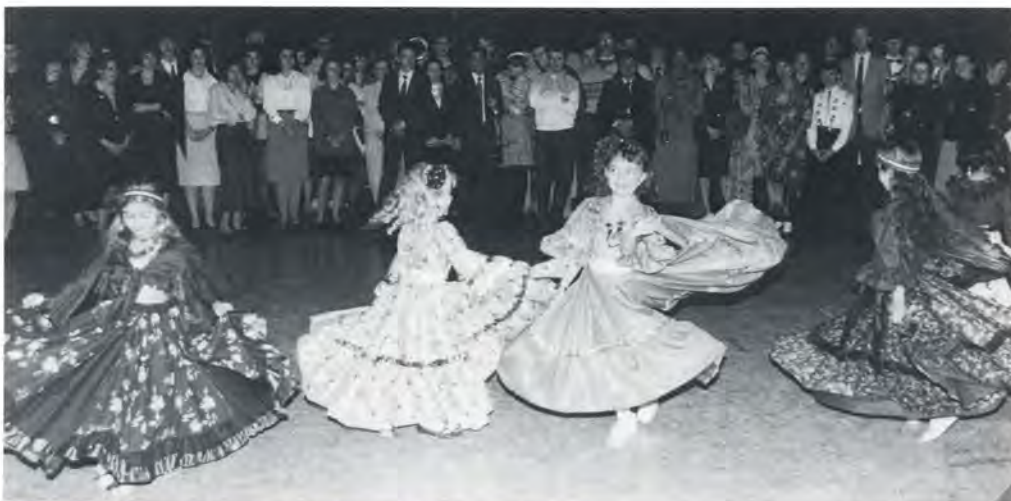
Traditional dancers entertain the workshop participants.

In America, the problem is that people do not know that they need something. Of course, they want to place blame on Reagan or Bush for the economic problems, but those are just external manifestations of a much deeper problem which many people in America are now