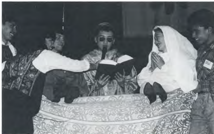
Students offering insights into their traditions and customs through skits on "Day of Heart," a workshop tradition.

Also, not far from the workshop sites was the dacha belonging to Mikhail Gorbachev in which he was imprisoned during the August 1991 coup that precipitated the collapse of the Soviet Union and the end of communism. Here in Yalta, both the expansion and collapse of communism occur-