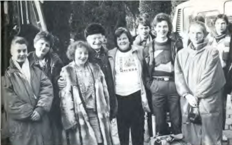
Strong friendships were developed between the staff, and university professors and students that will last well beyond the last day's departures.

selves as being people who were really responding to this. We did it three different days—so we had the top thirty at least having some closer connection.