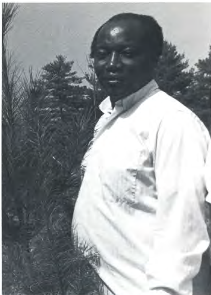
"True love goes where I don't want to go as a fallen person. That is where it wants me to go."

We are offered the opportunity to go beyond our own culture, our own feelings—to learn to really become a new person, to learn to relate to both the top and bottom of the society. If there is something we are going to take with us, brothers and sisters, it is only our experience of love. If it is true love, we can see God and dwell in His presence forever. The farther our experiences stray from God's love, the farther we are going to be from