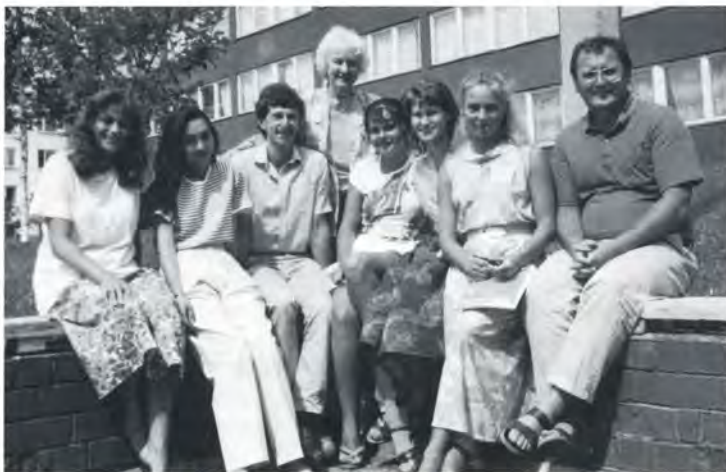
This second workshop group experienced some tension at first between the students from the Baltics and from Russia. The agricultural college where the ten-day workshops were held is in the background.