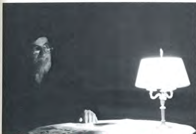
Educating for peace: one of the professors giving a portrayal of Tolstoy at the end of his days.

This was an experiment for the God Conference series, as these conferences have traditionally espoused the cognitive approach among the array of conferences offered under the umbrella of the International Religious Foundation (IRF). Was the experiment successful? On the one hand, yes. A good number of projects, presentations, and papers reflected the alternative emphasis. One paper made use of story-telling as a means to peace making, another reported on a project of Israeli Jews learning about Christianity. Two members of the group shared an unusual perspective on war as viewed from the point of view of public health analysis. Several Unificationists in the group were enthusiastic participants in the Religious Youth Service movement and encouraged the idea of inter-religious dialogue and peace through social service projects.