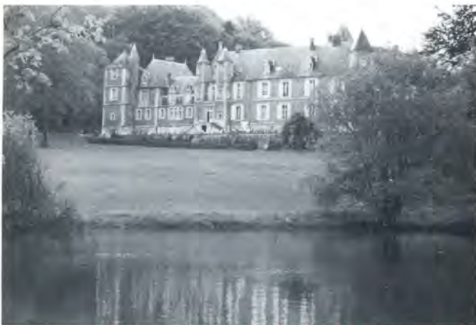
The conference site of the Eighth God Conference: our Chateau de Bellinglise, Elincourt-Saint Marguerite, France.

In the two years of preparation for the conference I gave more time to the third group, as I was particularly inter-