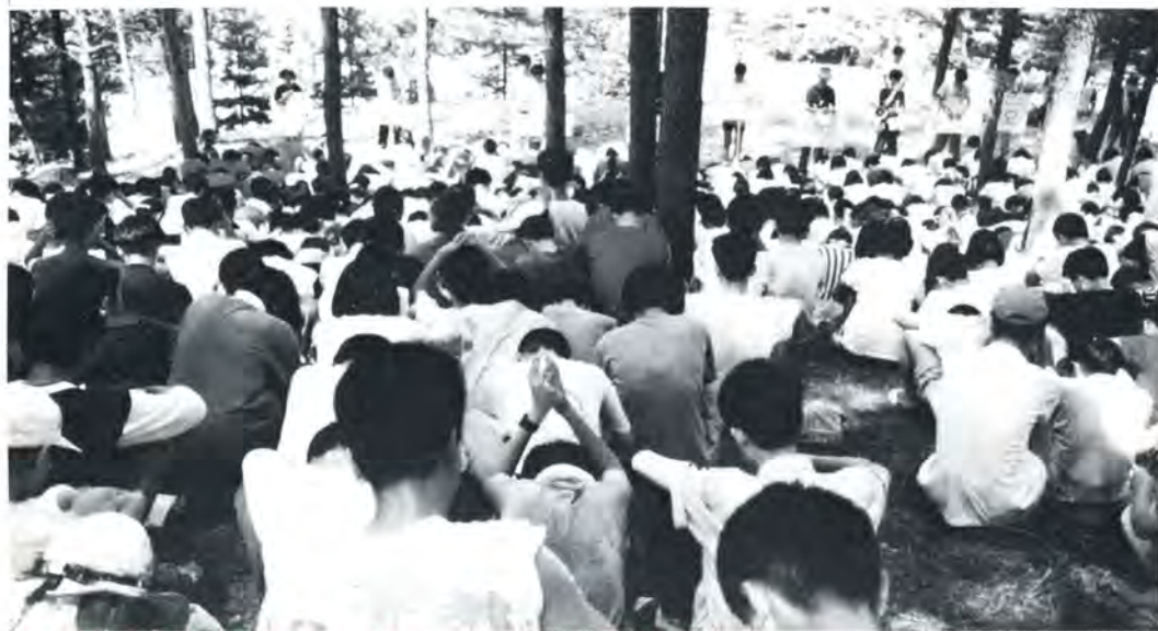
The blessed children pray at their summer workshop in Korea.