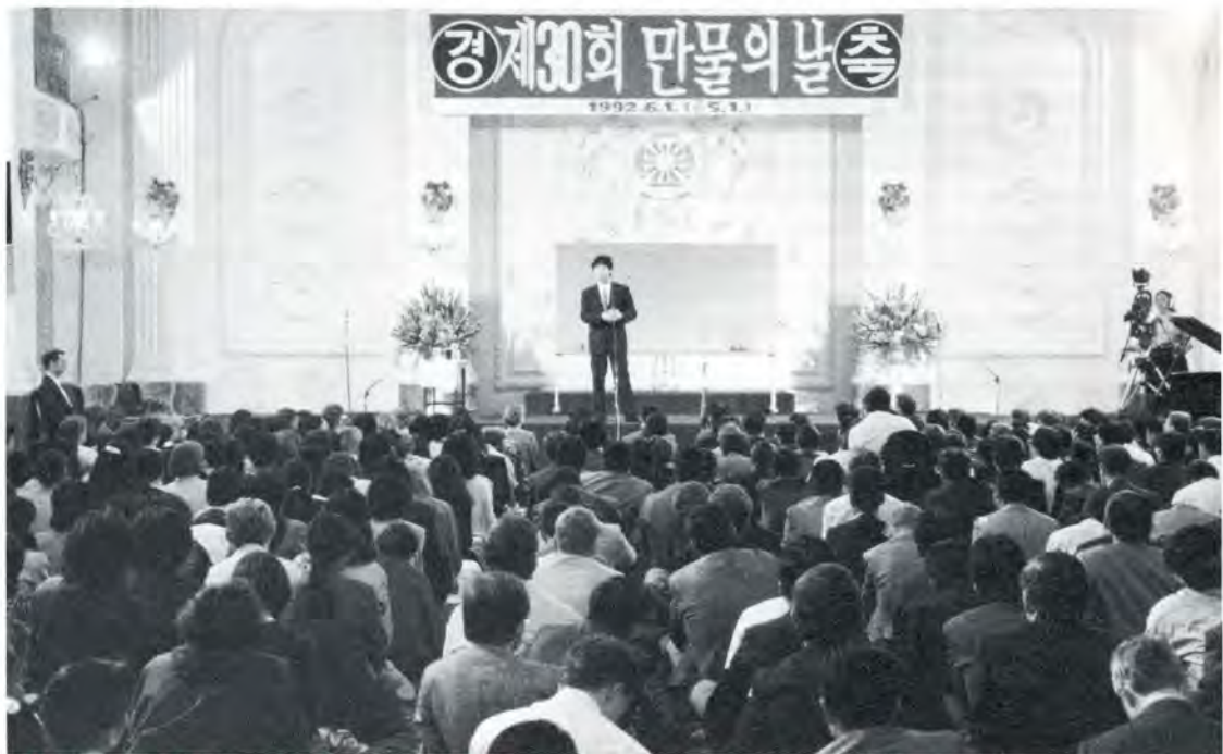
"During the Completed Testament Era you must live and achieve perfection by making the offering as a parent."

Father has to lay conditions to establish these providential positions because Father has to restore the vertical history horizontally, within his lifetime. He can't die and say, "Oh we'll