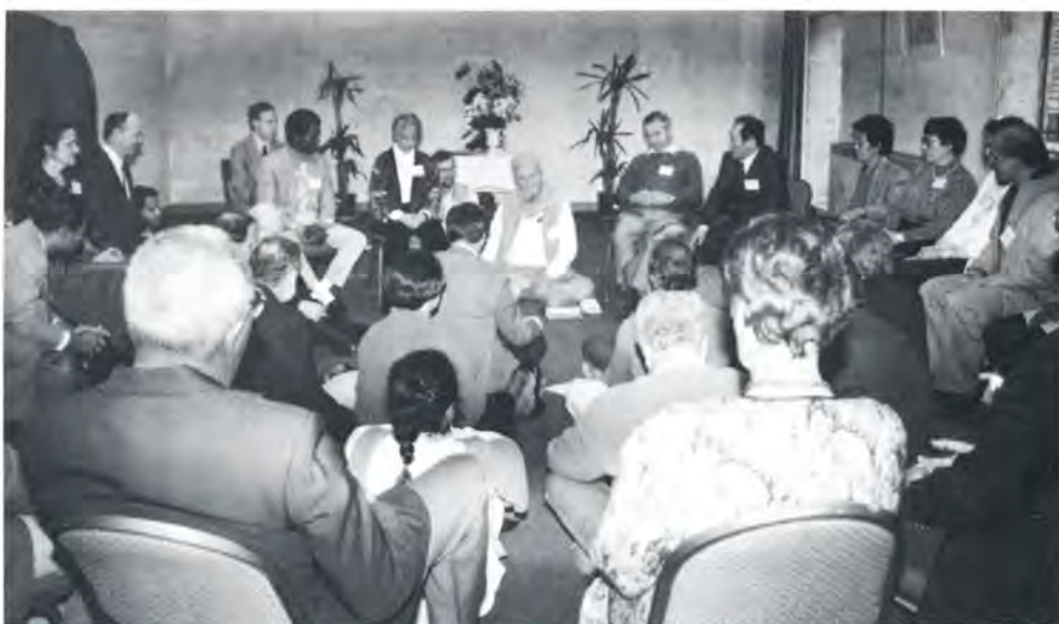
The attendees attuning for the day—a Muslim worship service.

The whole conference was treated also to two performances by members of this section on two different evenings. One, on liturgical dance, was appropriately entitled: "Skipping in Harmony: Let's Put Dance Back in Our Churches, Reunite Bodies and Soul, and Move Towards Peace." We all were encouraged to participate by skipping as a group together. As it turned out, the group dance proved more challenging to some scholars than