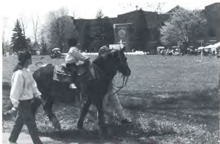
Pony rides for the children were added this year for the over four hundred guests.