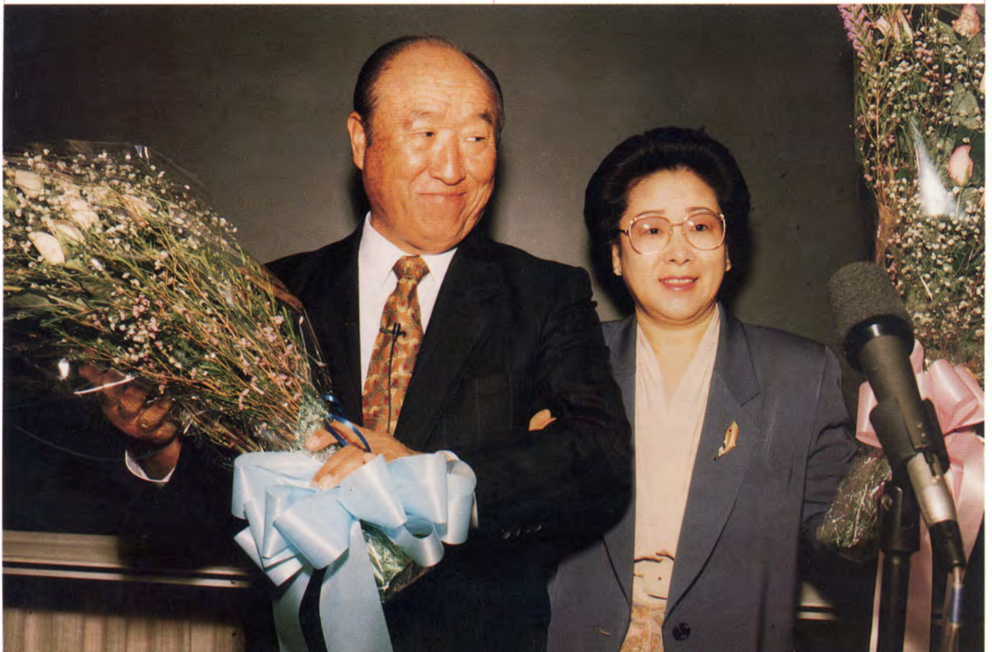
Father and Mother receive the gift of flowers on the thirty-eighth anniversary of the Holy Spirit Association, beginning the thirty-ninth year.

That huge, gigantic tree would have been one nation of God. The flowers and blossoms that bloomed would have been of one root, one tree. The spirit of the root, spirit of the trunk—everything would have been contained within this