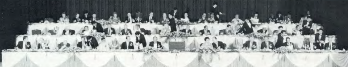
At a star-studded pan-festival banquet, Father announces his Messiahship and the formation of the House of Unification for World Peace.