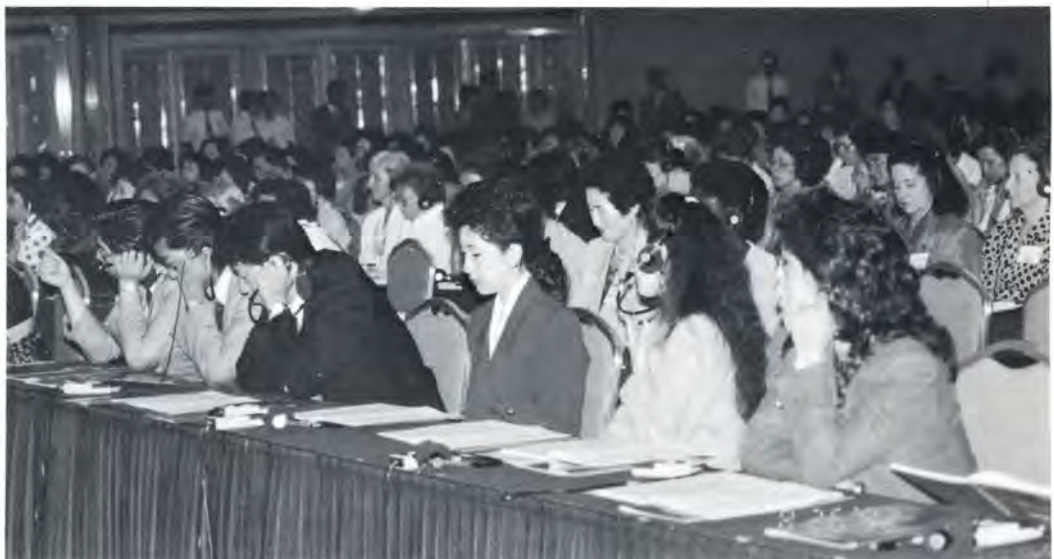
The True Family listens and supports as Mother gives her speech at WFWP World Convention.

Look at the advanced countries of the world today: America, Europe and Japan. Who can stop the tide of sexual immoral-