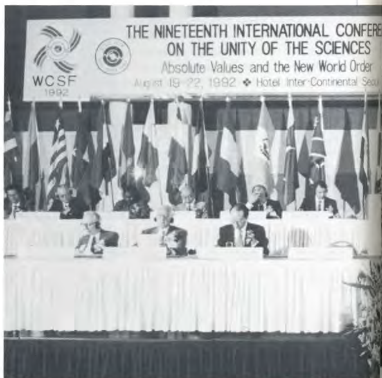
Father addresses the opening plenary of the joint session of ICUS and

The source of this universal principle is God. In creating the universe, God invested Himself totally for the sake of His creation. Throughout history, it is God who has been continually sacrificing Himself in order to save fallen human beings, who have been living just as they desire. The prophets, saints and sages who knew God's will have followed God's principles in their lives. Not content to keep the truth to themselves, they have walked the way of sacrifice in order to teach others.