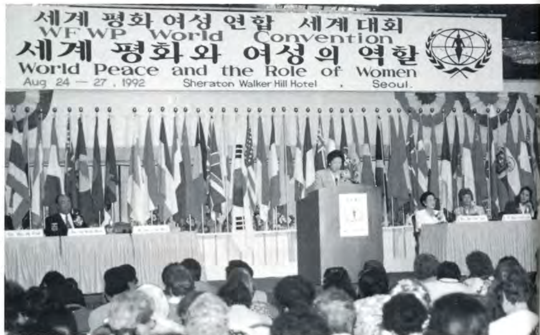
Mother teaches Godism to Women's Federation participants.

Leaders of the Women's Federation who have gathered from around the world: at this historical gathering, I do not wish to offer mere ceremonial greetings. I wish to proclaim before history the meaning of the past, present and the future. In this era of the historical transition heading toward cooperation