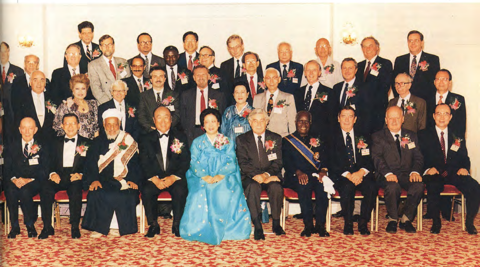
Before the banquet Father and Mother pose for a portrait with the world-level educational, religious, and cultural leaders and heads of state soon to be seated at the head table.