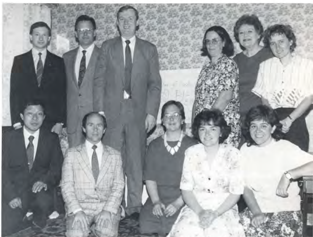
Workshop and organizational staff for C.I.S. and Baltic states pause for a moment to feel the joy of this enormous response to the Principle.

No matter what kind of impossible problem or challenge occurred, Heavenly Father always came up with a unique solution. For example, in the main coordinating camp, there was only one telephone line through which to coordinate twenty-six workshop sites with thousands of people arriving and departing. The earliest that the telephone company could install another line was in two months. By that time, the program would have been over. Out of desperation, the staff went fund raising for telephone lines door-to-door outside of the camp. Within only a few hours, local people offered the use of their private lines. Cables were then run out of their bedroom windows, through a forest, and into the camp. Without this kind of novel solution, it would have been impossible to