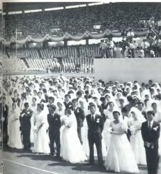
The front section (from the photographer, front l., to the platform with photographers) is where the second generation stands, directly in front of True Parents. After the ceremony forty thousand balloons and four hundred pigeons were released and the couples and guests were treated to entertainment by some of Korea's top stars. The second generation, having no indemnity conditions after the blessing, attended a workshop just for them. Today's World offers sincere congratulations to our elder Korean and Japanese families

thousand couples, and he has asked each of us to prepare one hundred twenty couples for the Blessing. More than just being excited, let us be aware of our responsibilities and become more serious and more faithful. ■■