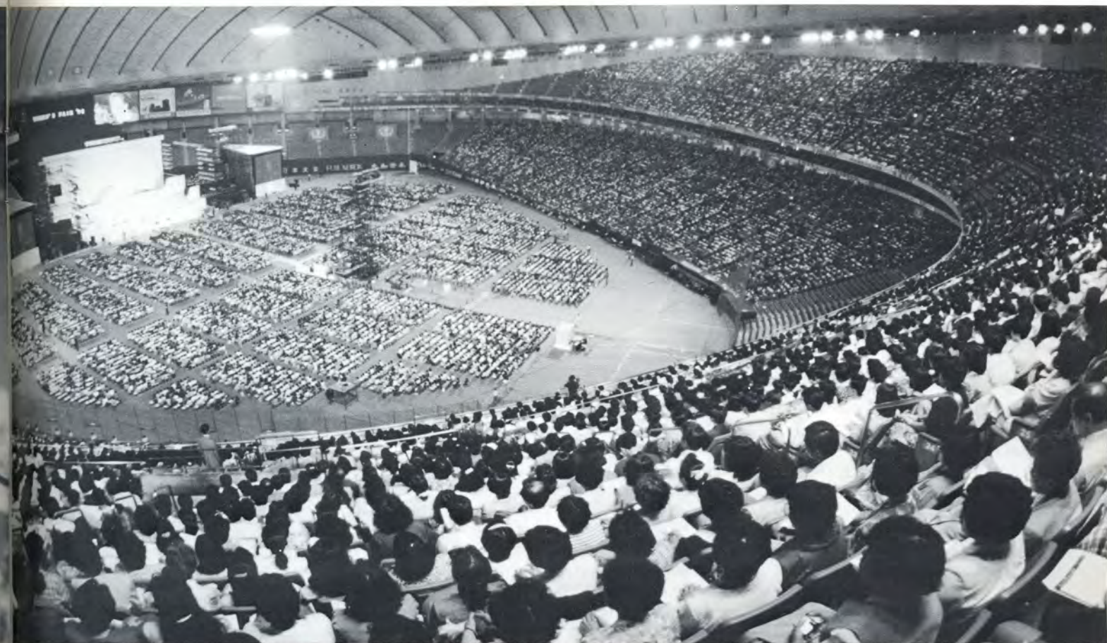
Mother gives her message to a capacity crowd of fifty thousand at Tokyo Dome.

Today, however, there are innumerable fundamental problems which threaten to undermine our families and which cannot be resolved by developing military might or economic power.