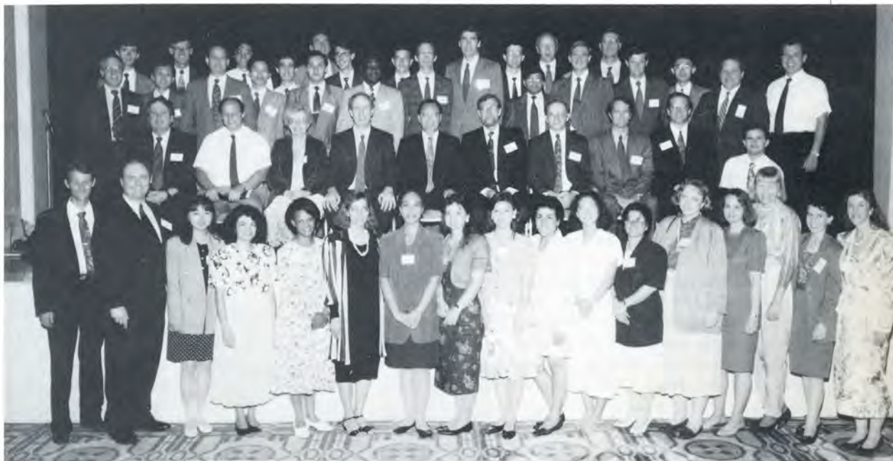
The assembly staff gathers for a closing photo.