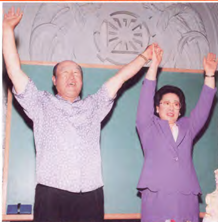
Father and Mother give a victorious monsei at a celebration at the World Mission Center immediately following the UN speech.

That this event was so successful is itself a testimony to the exceptional worldwide foundation of the Unification Church. Numerous ambassadors and even heads of state helped provide for this engagement to take place. A most