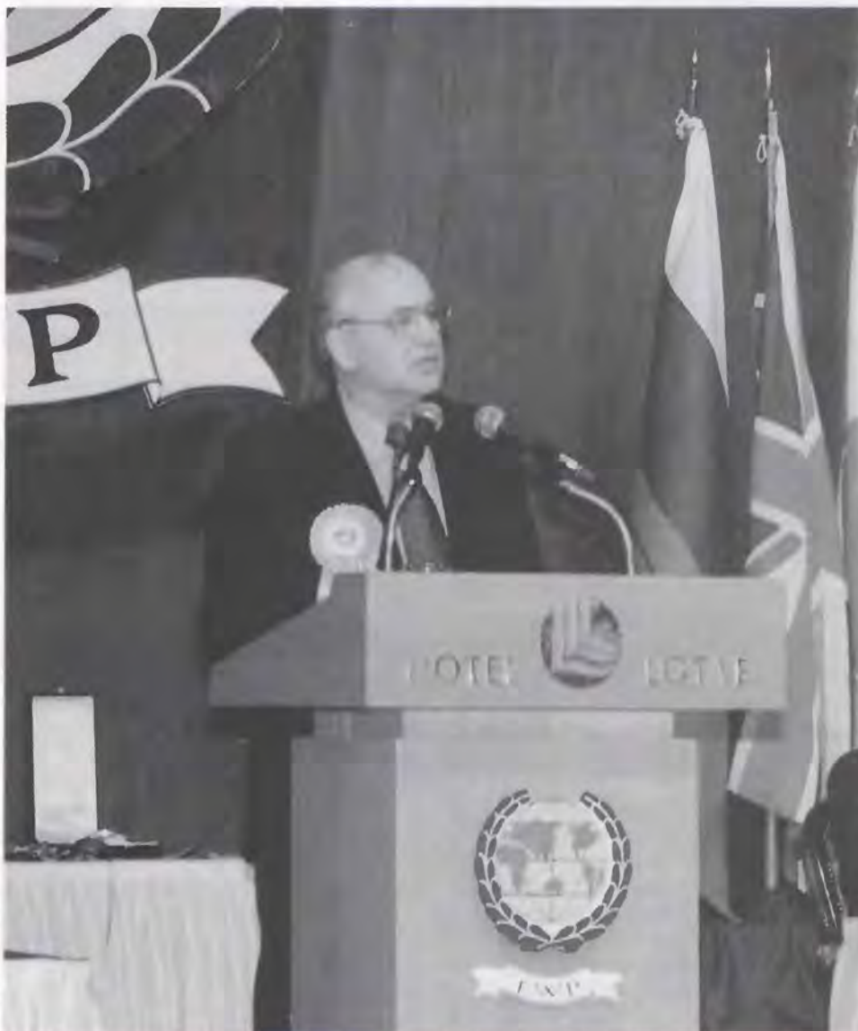
H.E. Mikail Gorbachev, former president of the USSR, delivers the keynote address to the Second World Peace Conference in Seoul, Korea.