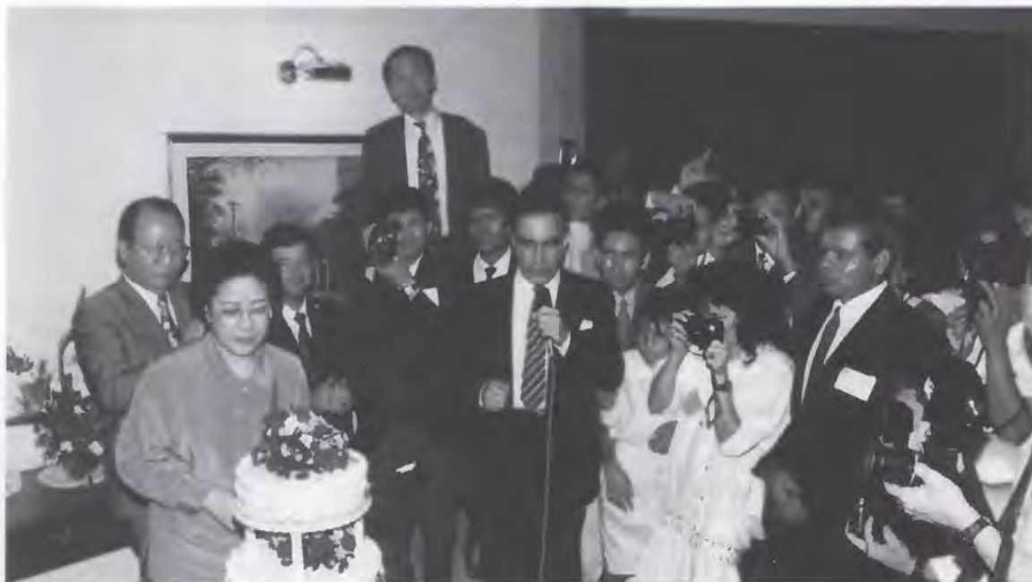
Mother cuts the cake at the victory celebration in Asuncion, Paraguay, December 7, 1993.

Bogota is on a plateau 2,800 meters above sea level, so the air is thin. Mother leaned on the podium for support as she gave her speech, but even in that situation she persevered.