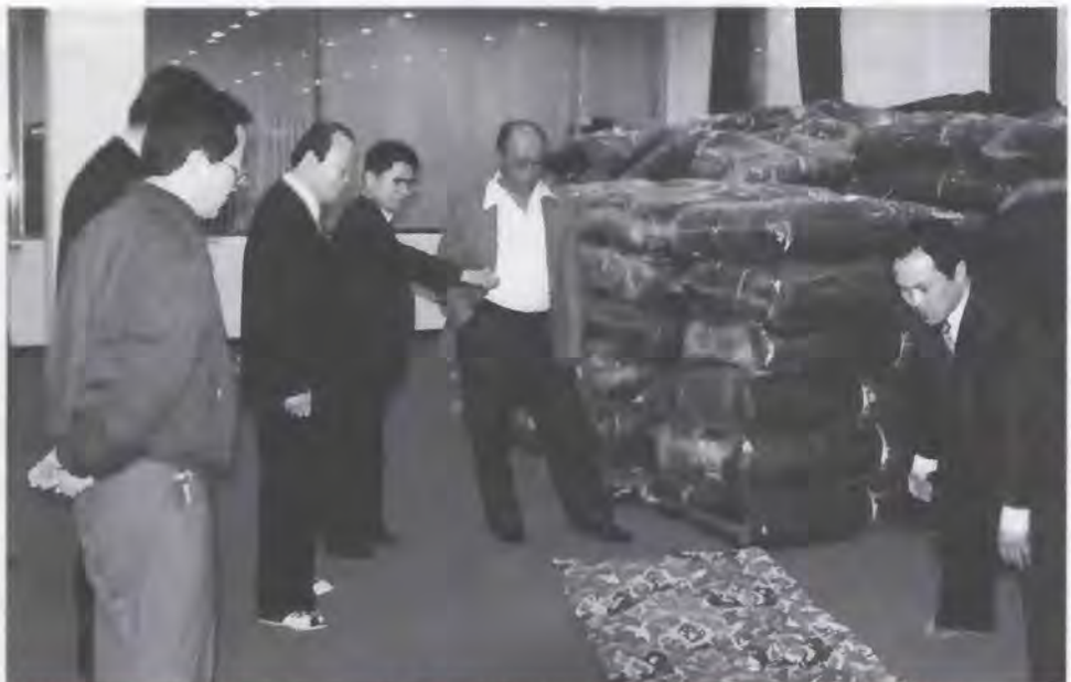
Father and other leaders examine the sleeping bags provided for the workshop participants.

(5) True Parents and rebirth. The first and second Adams failed. Even the third Adam failed, because of the disobedience of Christianity and the democratic world. Heavenly Father and True Father lost all of the Christian and democratic world