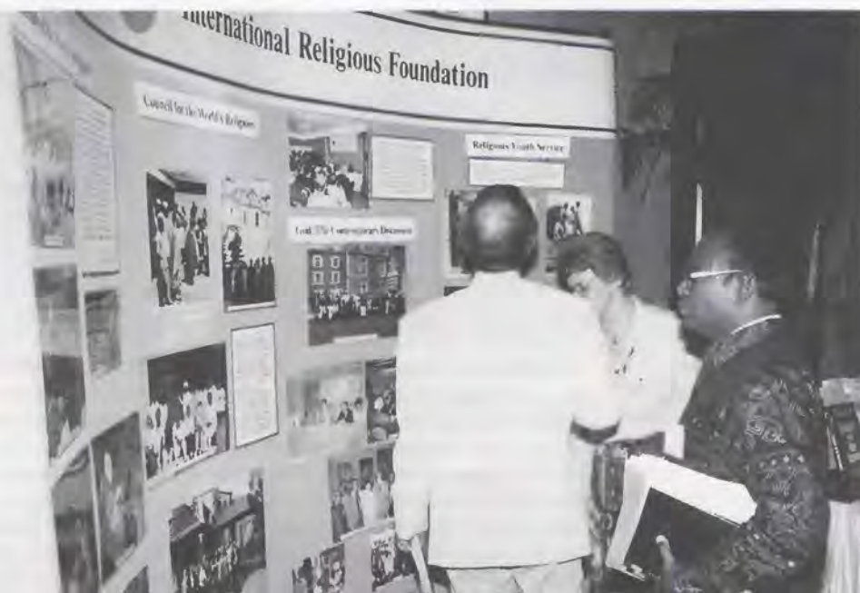
People viewing the International Religious Foundation display area.

These occasions for scholarly, responsible exchange on matters of undisputed relevance would certainly be sufficient to deserve the investment of preparation, travel and participation by the guests, and self-sacrifice and long hours of investment and service by the True Family and the hosting organizations; but this pure di-