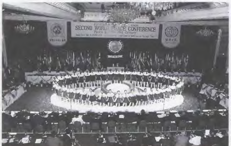
The Little Angels of Korea perform at the inaugural plenary session of the Second World Peace Conference at the Hotel Lotte.

In this way, the members of Adam and Eve's family were to form a royalty centering on God and were to live peacefully on earth until they moved into the heavenly, eternal world. Only in that heavenly world can human desire, freedom, aspiration,