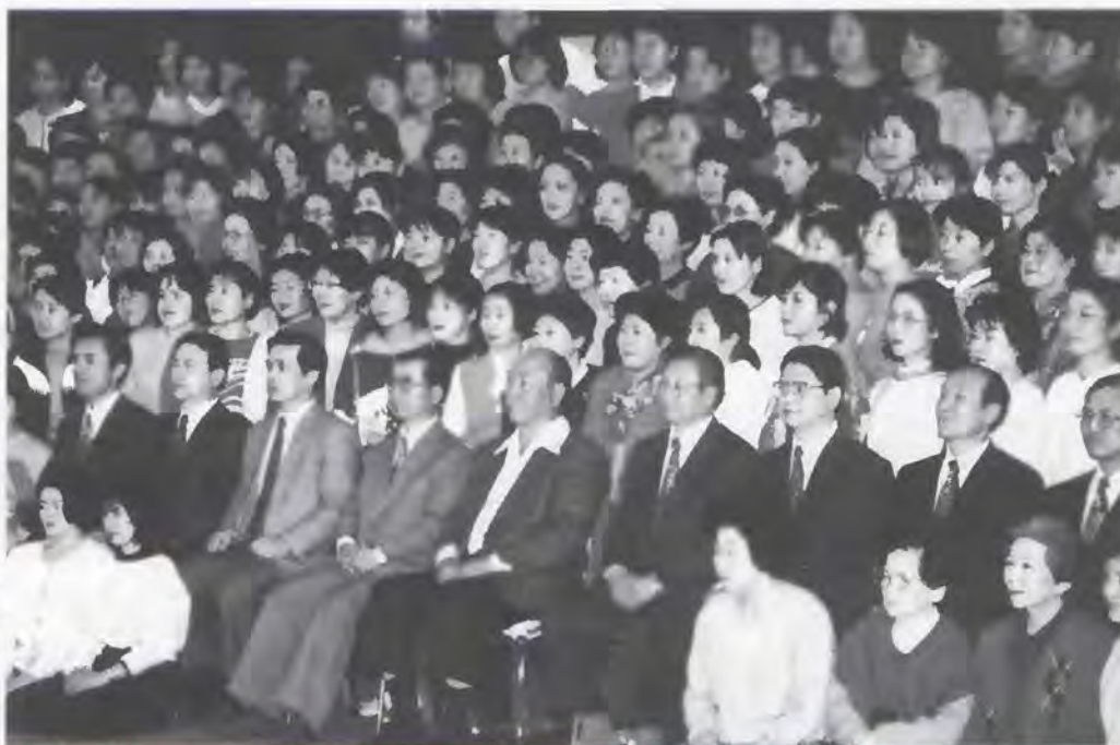
Father takes a moment out of his schedule to have a picture taken with the workshop staff and participants.