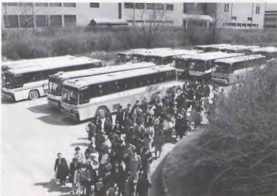
The buses arrive in Sutaek-ri carrying workshop participants.