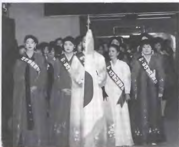
The Korean sisters (left photo) and Japanese sisters (right photo) waiting to process into the room for the ceremony creating sister relationships between them.