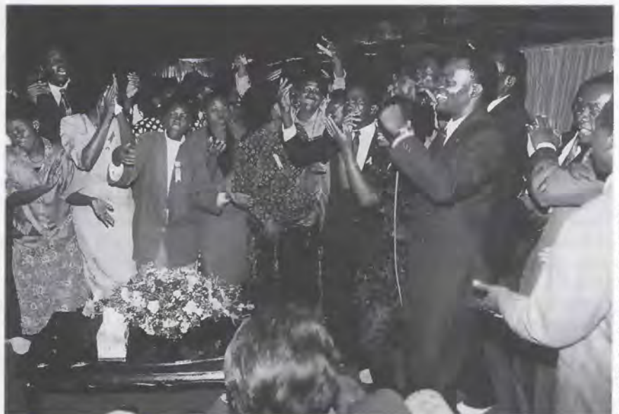
Members dance and sing for True Parents in Kenya on December 3, 1993.

Since we are talking about the blessing, I want to add one thing. I could keenly feel that now is the Completed Testament era. The results are coming