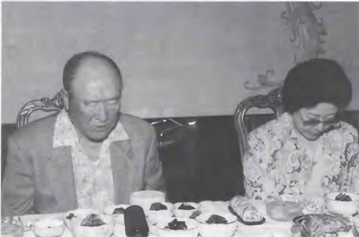
Father and Mother offer grace prior to the gathering at East Garden upon their return to New York, July 22, 1994.

Because of True Parents' victory, the family era could come, and with the arrival of the family era everything is centered on the family. By speaking of tribal messiahship and home church, Father has been preparing us for the arrival of the family era. Recently he has been speaking about the four great realms of heart and the three great kingships. All these things are connected to the perfection of the family. Father has enabled us to have truly clear