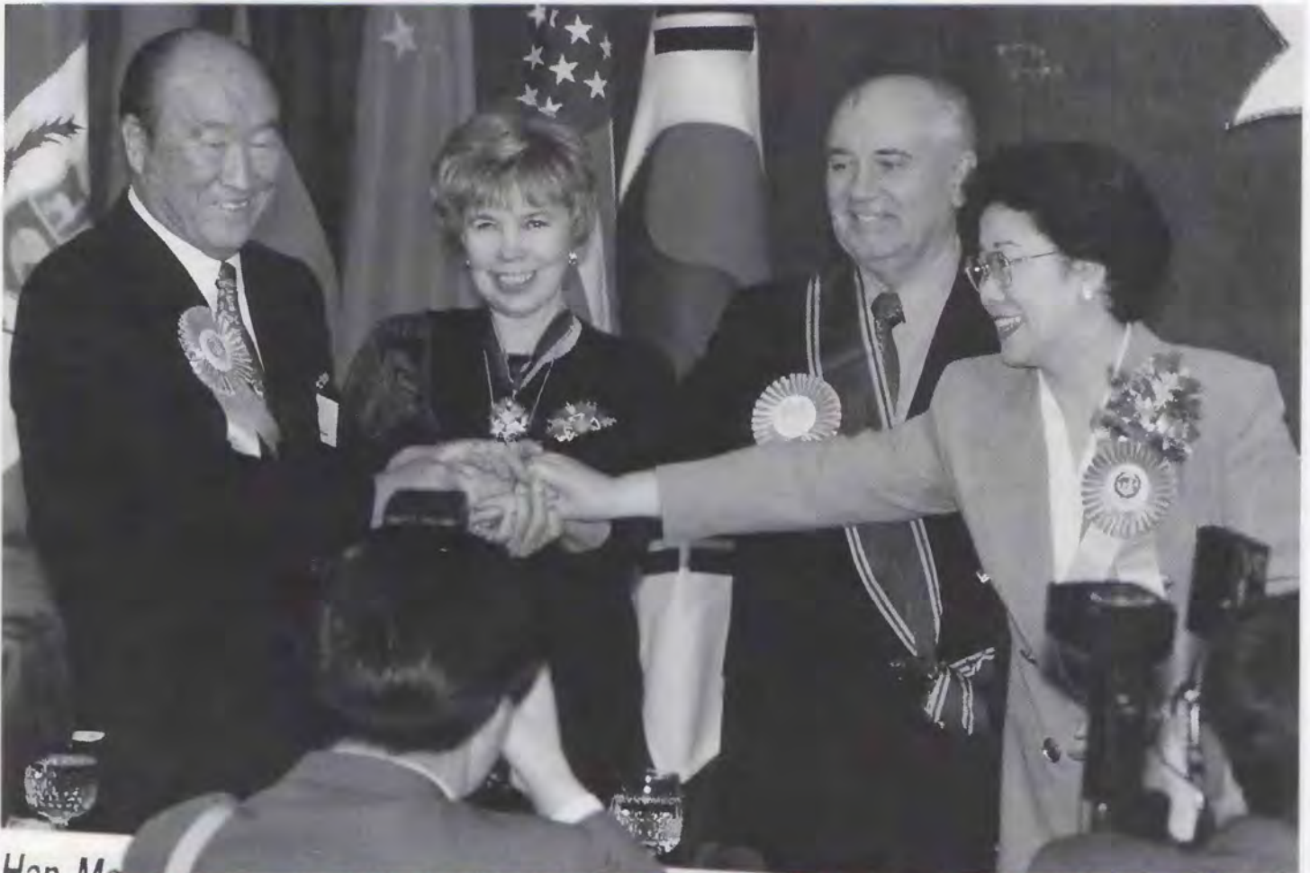
Father and Mother join hands with H.E. Mikhail Gorbachev and his wife, Raisa, at the Second World Peace Conference in Seoul, Korea, after Mr. Gorbachev received the Latin American Order of Liberty and Unity from AULA.

Our world today has become evil, filled with conflict, confusion, and hatred. This is true of individuals, families, societies and countries. The root cause of so much wickedness is a conflict between the mind and body of individual human beings, a