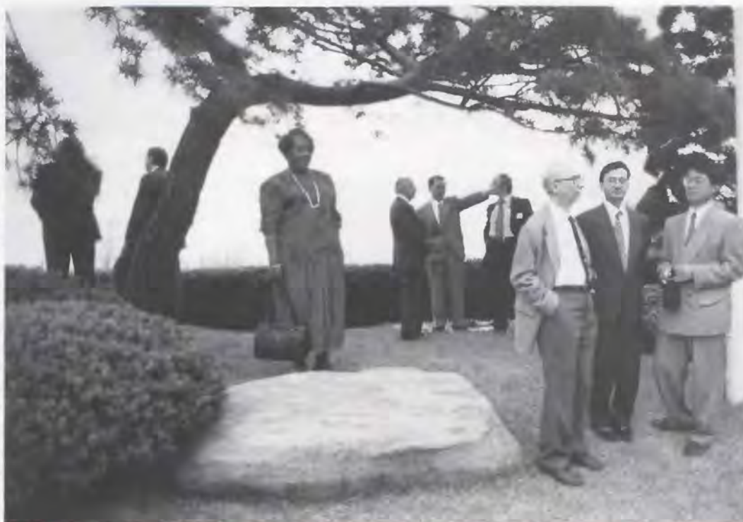
ICUS and PWPA participants enjoy a few moments in the garden at Hannam-dong.