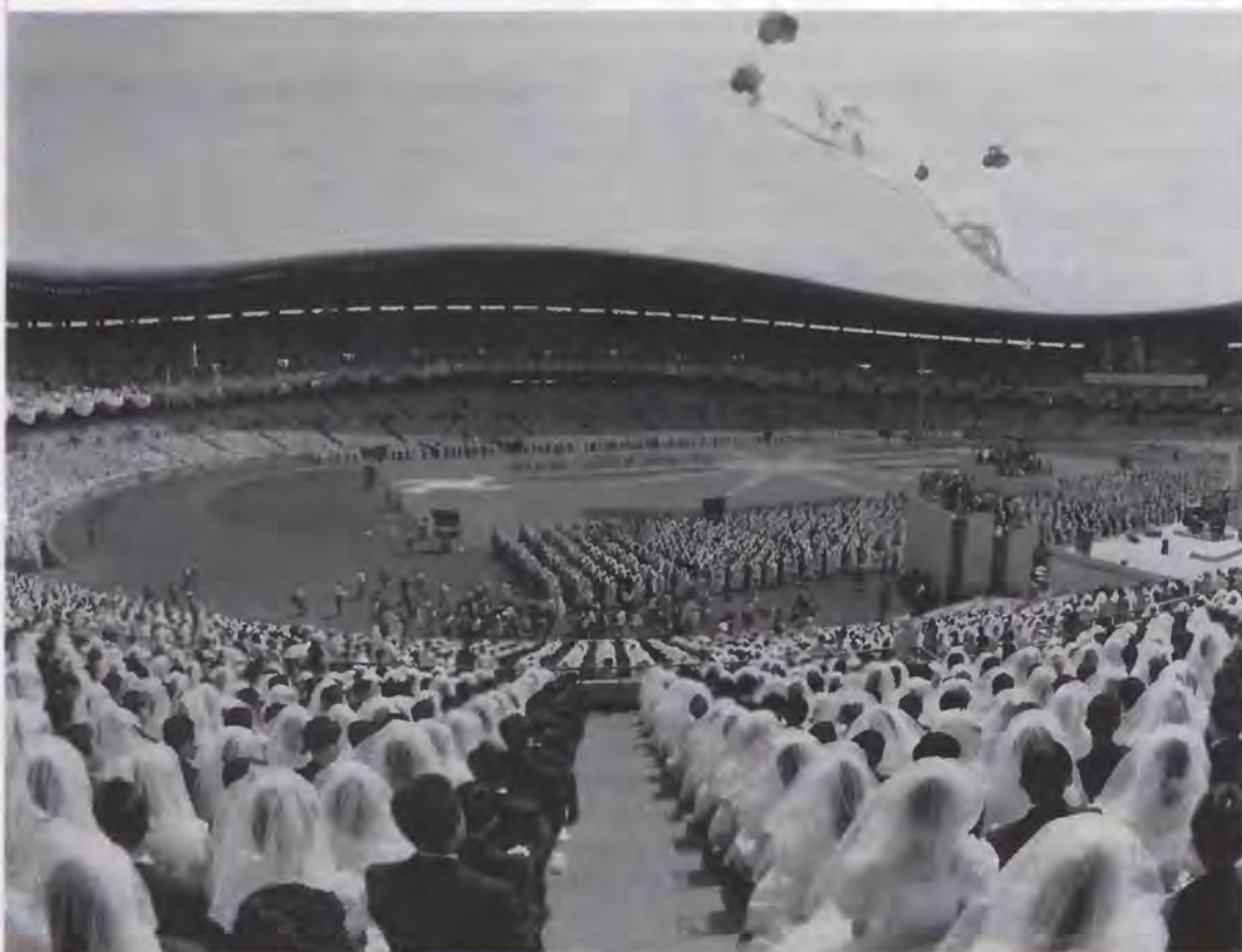
Blessing of 30,000 Couples in Seoul, Korea, August 25, 1992.

It is also true for me in front of such a principle.