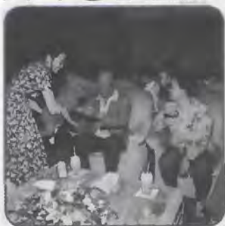
40TH ANNIVERSARY OF THE ESTABLISHMENT OF HSA-UWC