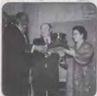
FATHER—CHILDREN'S DAY 1993 MOTHER'S TOUR—EGYPT, KENYA & AUSTRALIA