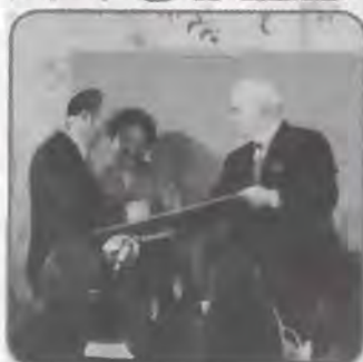
TRUE PARENTS' BIRTHDAY MOTHER'S TOUR—NETHERLANDS & INDIA