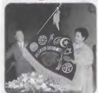
FATHER—LEADERS' CONFERENCE & PARENTS' DAY MOTHER'S TOUR—MALAYSIA & TAIWAN