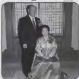
GOD'S DAY 1984 MOTHER'S TOUR—AFRICA AND SOUTH AMERICA