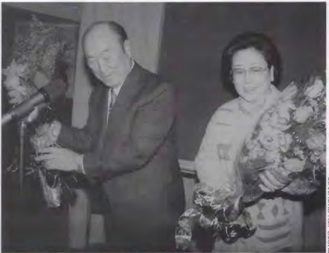
Father and Mother received flowers at Belvedere on November 27, 1994.

Man and woman should not become one with each other before marriage but should maintain a proper distance. As they maintain this distance, they are preparing to become one. Who then, are the pure men and women? Those who maintain the