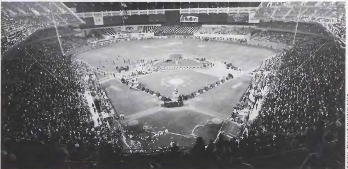
Yankee Stadium Rally, June 1, 1976

However, I should follow the principle of restoration. Be-