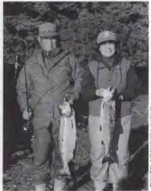
Father and Mother pose with their silver salmon catch after fishing in Marka Bay. August 16, 1994.