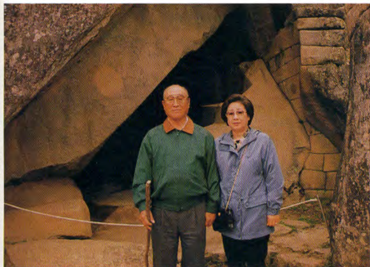
Father and Mother pause for a moment in front of the ruins of Machu Picchu, capital of the Incan civilization.