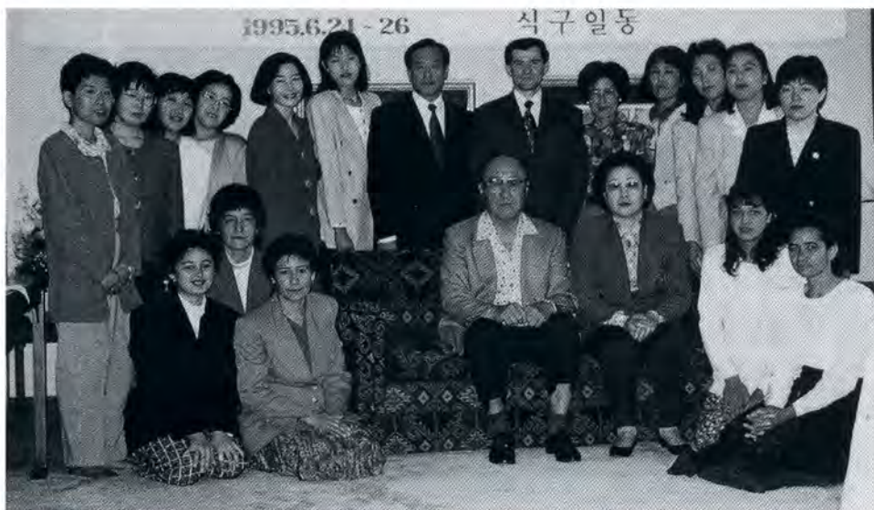
Father and Mother pause for a moment to take pictures with the members in Colombia.

We could see the Indian children and adults living a very poor, primitive life in the mud. According to the local guide, if Indian children survive until the age of four, they have built up their immune system against all kinds of diseases, parasites and water contamination. They can then survive up to thirty, forty, fifty or whatever age they live. So age four is the cutoff line as to whether that child can make it or not. [The report on the rest of Father's tour is in the October issue of Today's World.] ■■