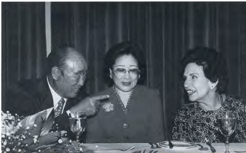
Father and Mother chat with Mrs. Josefina Villalobos de Duran Ballen, Ecuador's first lady, at the banquet on the evening of Father's meeting with President Duran. Father had spent ten minutes explaining true love to Mrs. Duran and the first daughter, prior to the banquet.

refuel in a small Peruvian town. The pilot figured we would have clearance from Lima before we were scheduled to leave that town. So we took off with that understanding. When we arrived in the small city to refuel, permission had not been granted.