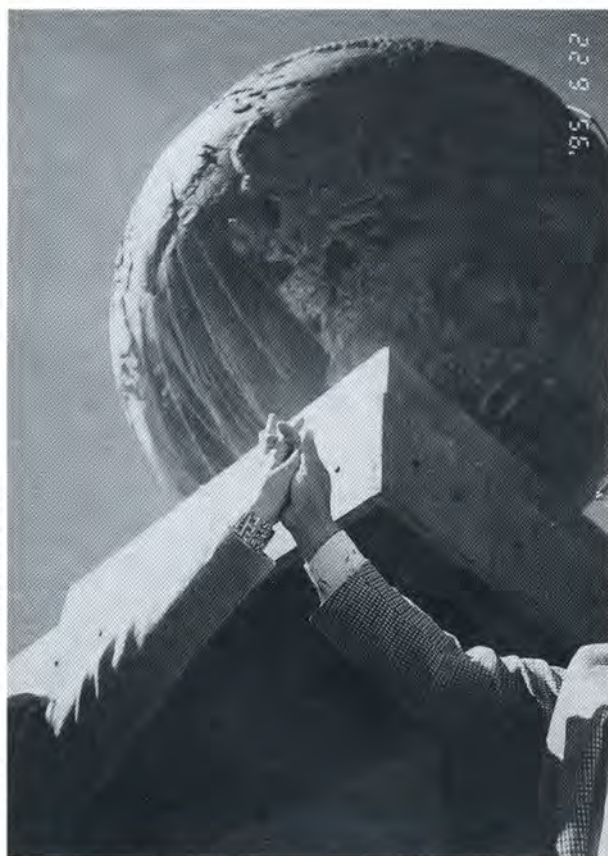
Father and Mother join hands under the globe, while visiting the starting point of north, south, east and west in Ecuador.