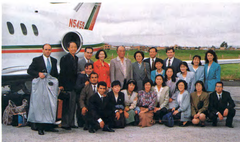
True Parents, and the members traveling with them, pause for a moment at the airport to take a picture with the Colombian church leaders and some of the members in Colombia.

The day we went to the equator, we took off for Chile, traveling all day long. We arrived in Santiago, the capital city. Here I realized that Father must have—I did not count and was not with Father 24 hours a day, so I do not know exactly—read his speech in Korean more than 100 times. Each time he goes to another