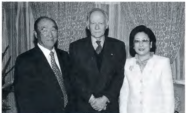
True Parents pause for a moment to take photos, during their meeting with Ecuadorian President Sixto Duran.

That is the purpose of the providence of salvation. Due to the fall, God lost the True Mother, as well as the children of