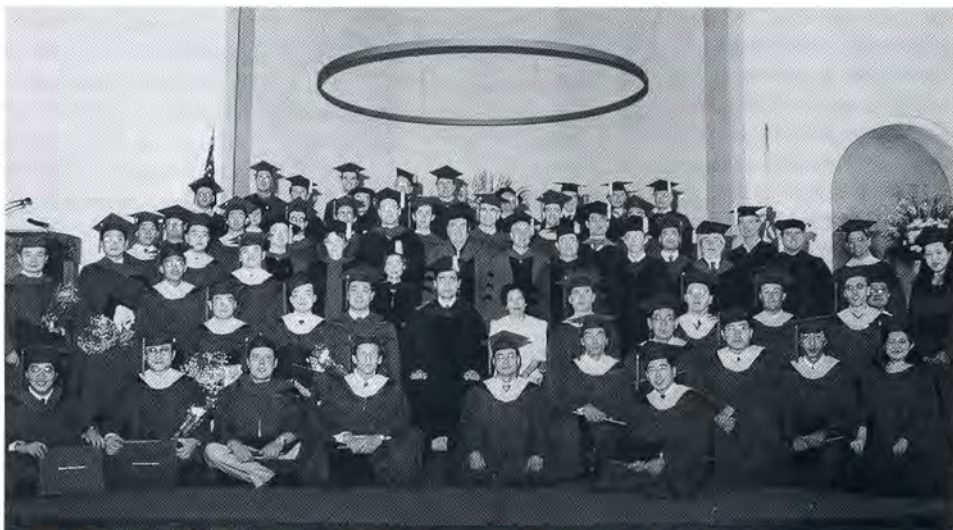
The 1995 Graduating Class of the Unification Theological Seminary

"Who will stop evil fully? I believe UTS graduates should boldly go out there to serve and bear the cross in order to testify to the power of God to over-