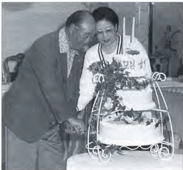
Front Cover: True Parents cut the welcome cake upon their return from Kodiak, Alaska to East Garden. September 5th, 1996.

The Speaking Tour in Surinam Tirso Ramirez 27