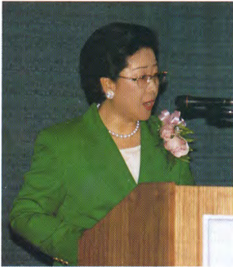
Left: Mother delivers the speech, "True Parents and True Family" to a Korean audience in Denver, July 21, 1996.