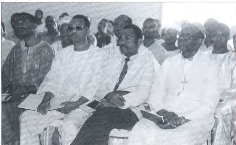
Blessing seminar participants.

We continued the blessing ceremonies. Right now there are over 2,000 Christian pastors who are blessed. More, probably. We don't even have time to do our statistics, because every available member we have is either witnessing to new pastors or officiating at a blessing in a church. Literally people have no time to stop and type at a typewriter. We cannot take