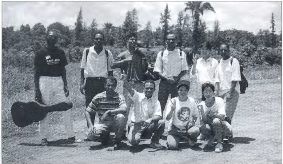
Members and guests who attended the "True Family and I" speech in Brokopondo.

We sent two members in advance to invite people for the speech, and they met a church leader who wanted to know