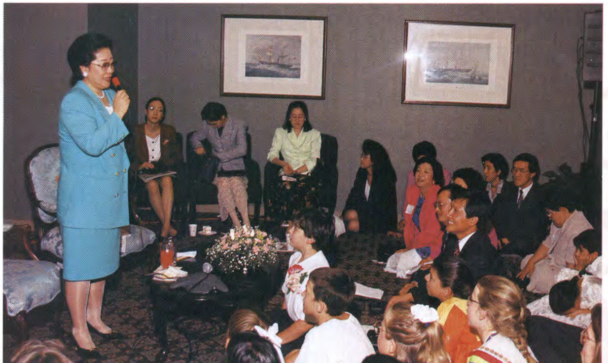
Bottom: Mother gives a victory speech to members of the Philadelphia area.