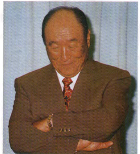
On this page: A sequence during Father's speech to members at Belvedere. Father explains how to achieve absolute conjugal love. Sunday, September 8, 1996.