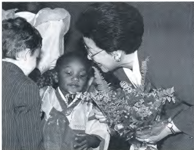
True Mother receives flowers after her speech. Nigeria, 1993.

Right before the blessings ended, we started organizing blessings on a new level. This was a community blessing. We would contact the traditional ruler of a village and witness to him and ask him to join the Family Federation for