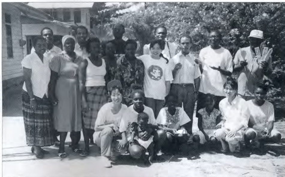
Brokopondo, Surinam. March 17, 1996.