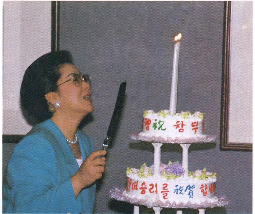
Right: Mother prepares to cut the victory cake, Philadelphia, August 2, 1996.