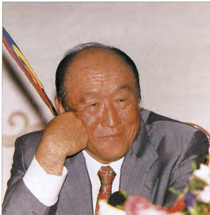
Father enjoys a moment during the celebration of True Parents 36th wedding anniversary.

Within America alone there are scores of different problems surrounding us. Therefore, you cannot demand the right to focus on your own single mission and ignore everything else. This huge country of America is not totally united with the