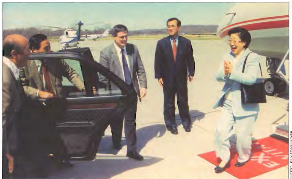
Father and Mother finally meet after a period of dedicating themselves separately

[Father speaks about the bloodshed in the history of the Americas, and the responsibility of the white race.] If God knows what happened in North and South America, then how could He