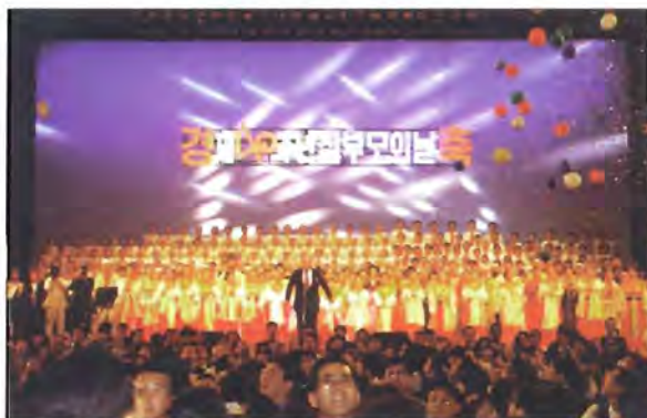
Above: Singers and audience alike join in greeting True Parents at the cultural evening Right: Members listen to the commemorative sermon at Sutaek-ri main auditorium