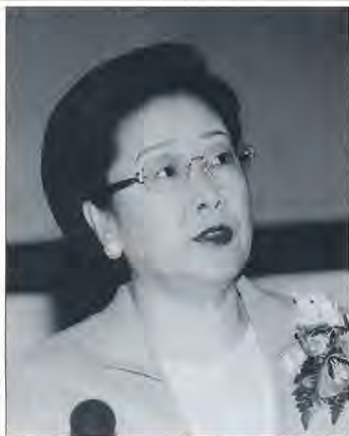
Toronto, Canada: the first of Mother's 32 international engagements

True Mother's Itinerary in the United States