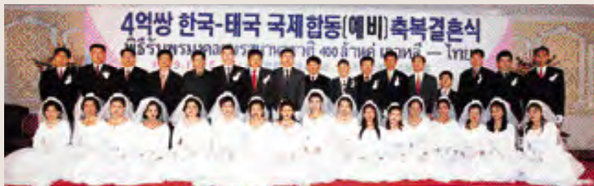
Photo: Korean- Thai couples take a group photo after a preliminary ceremony in Seoul, Dec. 5

Many Koreans are preparing for international blessing with spouses from other Asian countries