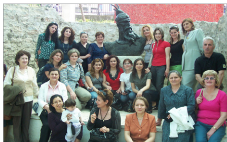
Relaxing on a trip to the memorial of Skanderbeg, Albanian national hero