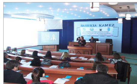
Conference on the Day for the Elimination of Violence Against Women in the City Hall of Kamza