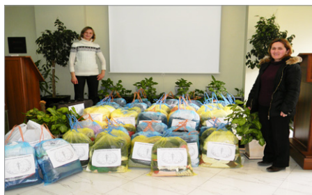
Clothes collected from local community for families in need