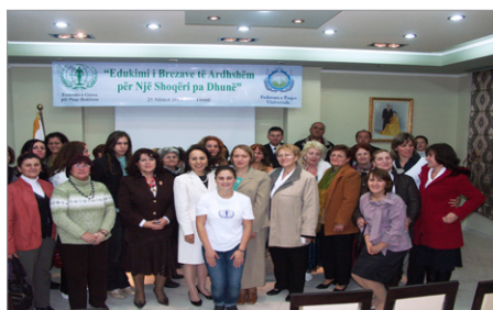
"Educating Future Generations for a Society without Violence" Conference