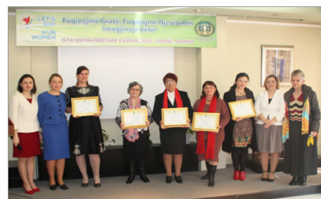
Promoting Achievements of Women on International Women's Day