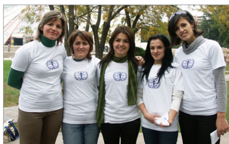
Volunteers during an awareness campaign against domestic violence