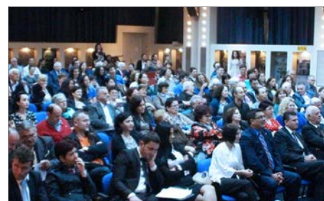
Gathering on the International Day of Families in Tirana in Cooperation with the Universal Peace Federation