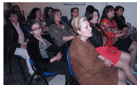
Meeting on the topic of women's health in the city of Korca