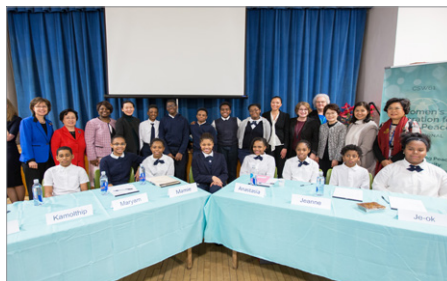
Students of Macademy School of Science and Technology