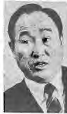
Sun Myung Moon founded Unification Church.

In the United States, for example, where the Unification Church has attracted about 4,000 followers according to church figures, about 90 per cent of the members are college graduates. Most