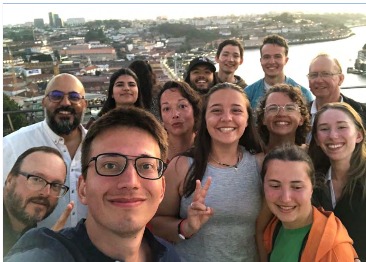
Photo from last summer's Fishing Workshop in Porto. Read more about it here.