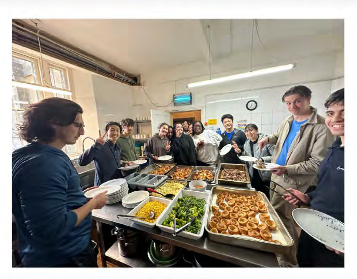
COMMS TEAM UK

May 8, 2024 | Activities, Articles | Cleeve House, Young Adults, Youth