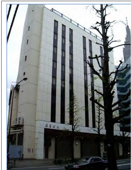
AS building where the Akahata Shimibun's editorial department is located in Tokyo

"In relation to the issue of illegal solicitation of organizational newspapers, including the Japanese Communist Party's newspaper Shimbun Akahata, within government offices on a nationwide scale, our paper has obtained the results of a survey conducted by Samukawa (寒川) town in Kanagawa (神奈川県) prefecture targeting all management staff. According to the survey, 70% of management staff had been solicited to subscribe to party newspapers, and of those, more than half felt pressured to subscribe.