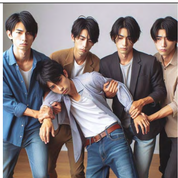
Young Japanese person being abducted