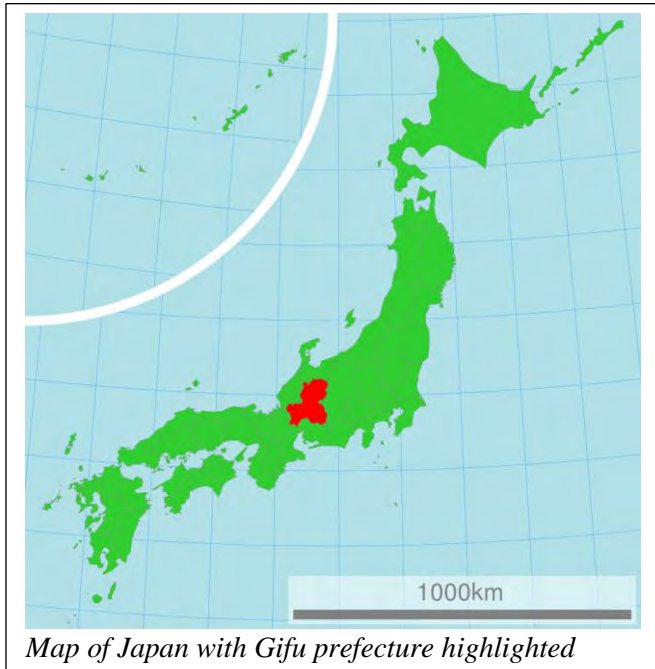
Map of Japan with Gifu prefecture highlighted

There are two main reasons for this. The families of the victims are cooperating with deprogramming experts. It would have meant for the victims to sue their own parents in court, which ultimately push them to keep silent. Second, the media are intentionally not reporting about these crimes.